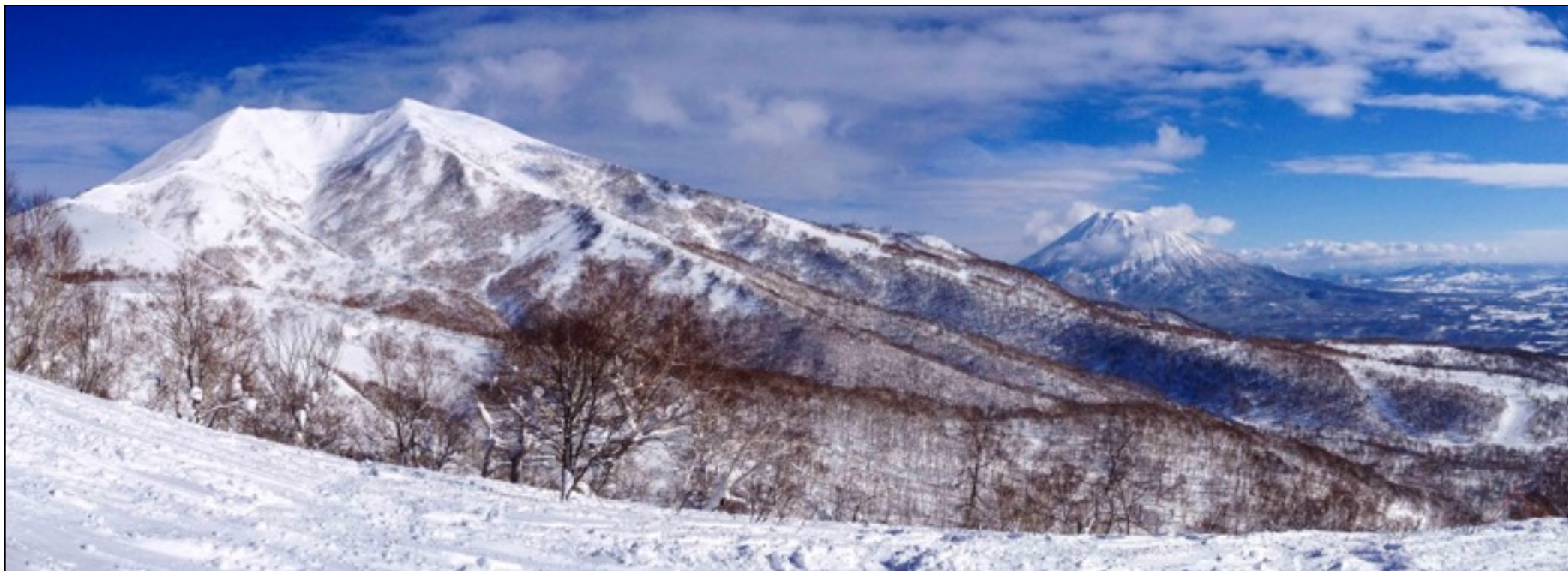
Mt Yotie from near the top of the Grand Hirafu