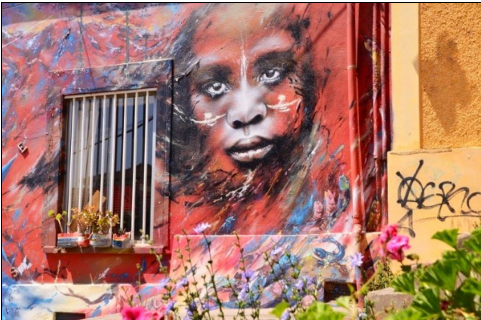
Art: not graffiti - Denis Walsh