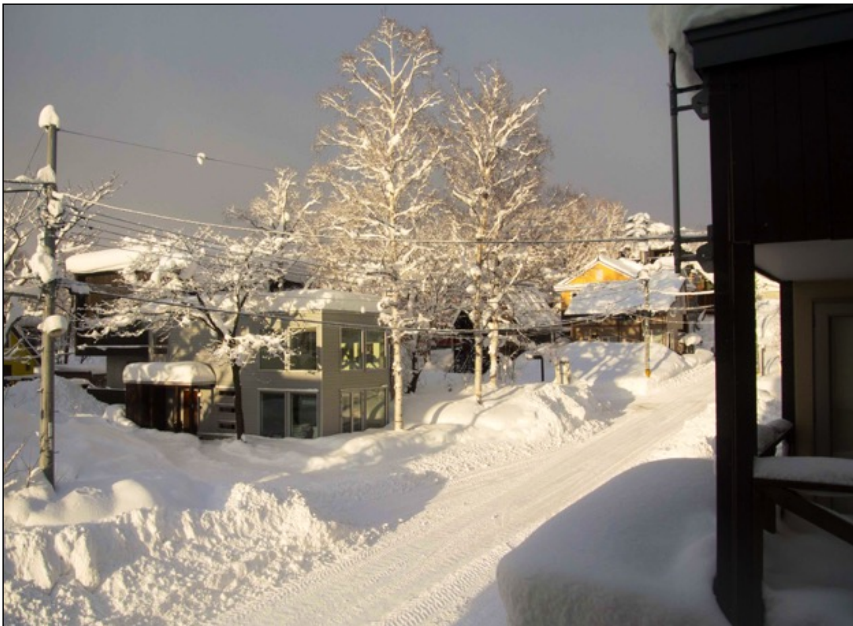
Birch tree with weak sun trying to break through a cloudy sky