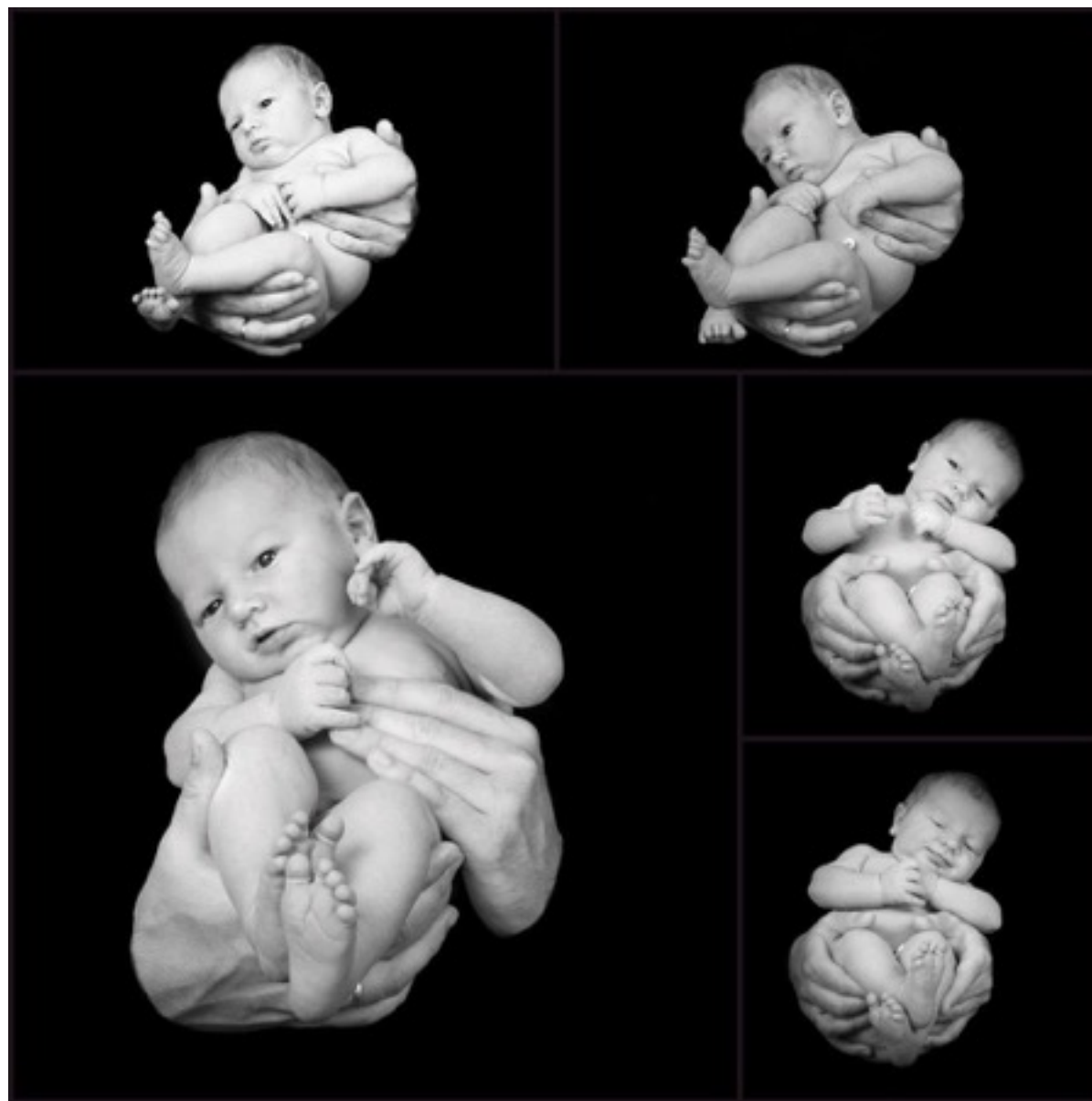
Montage - Malcolm Watson