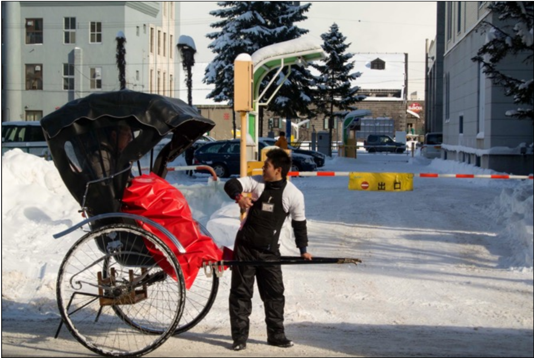
A person drawn taxi in Otaru