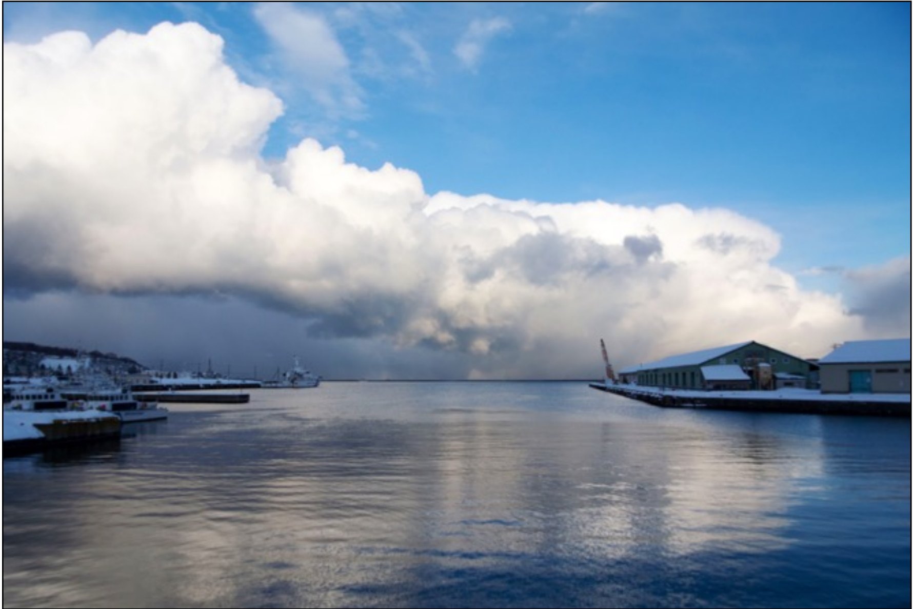
Otaru harbour with a huge storm out to sea