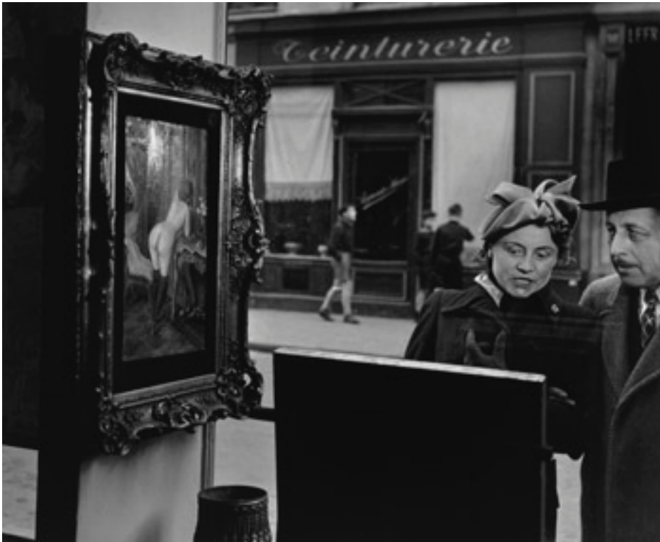
Robert Doisneau Un regard oblique [A sidelong glance] 1948, gelatin silver photograph, printed 1990