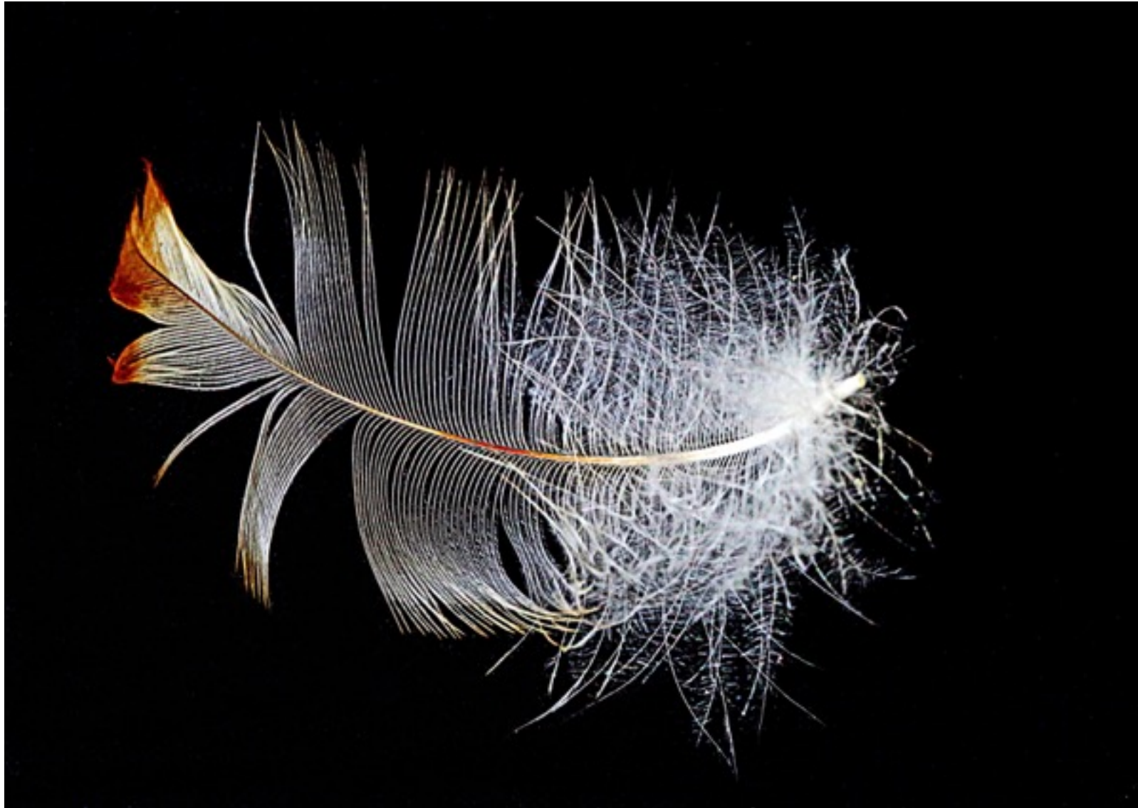
Feather - Diane Cutting