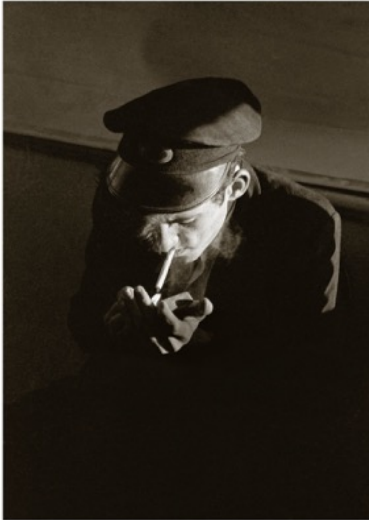
Porter at afternoon smoke, Merrylands signalbox