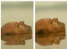
Image: Submerged (Again) 2006 by Atul Bhalla, diptych, digital print