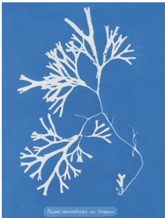
Anna Atkins - cyanotype of algae circa 1843