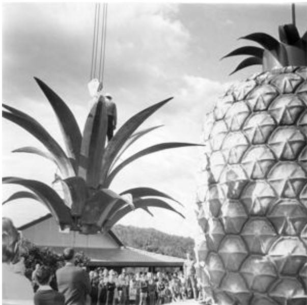
Hoisting the top onto the Big Pineapple at the official opening of the Sunshine Plantation by the Hon. John Herbert, Minister for Labour and Tourism, August, 1971.

In conjunction with the National Library of Australia, CCAS is planning an online exhibition of selected works from the Re-Picture Australia Flickr group in 2009. If you want to be involved in the exhibition, keep submitting work to the Re-Picture Australia group. Selected works will be announced later in 2009. Other cultural agencies across the country will also be invited to collaborate by screening works from Re-Picture Australia in their venues. NLA will be loading more public domain images from our contributors, to the Re-Picture Australia project, in the New Year. Sample below... www.pictureaustralia.org/contest/index.html