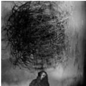
Roger Ballen (b.1950), Twirling Wires, 2001.

BRUTAL, TENDER, HUMAN, ANIMAL: ROGER BALLEEN PHOTOGRAPHY