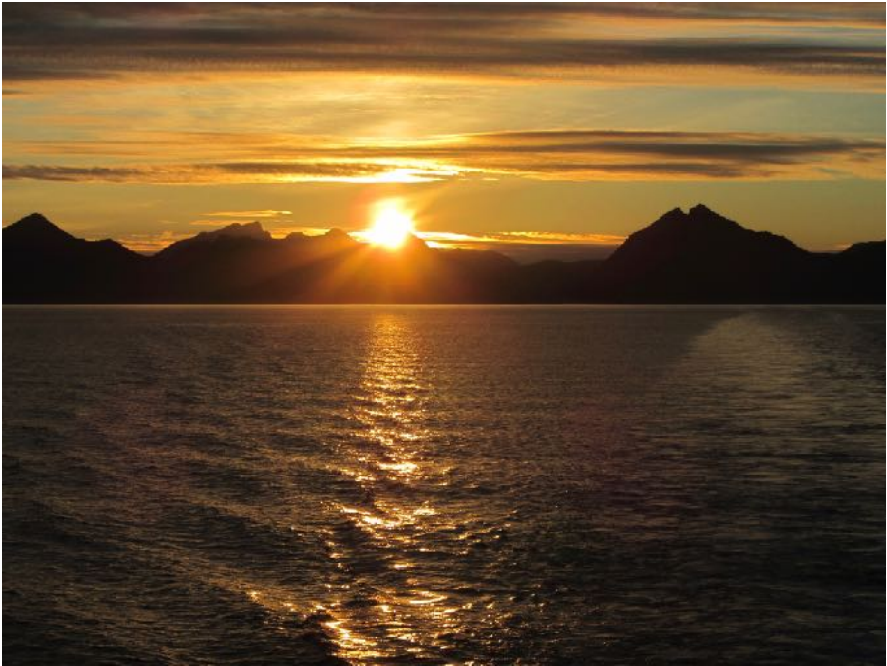
Midnight Sun - Norway August 2016 - Helen Hall