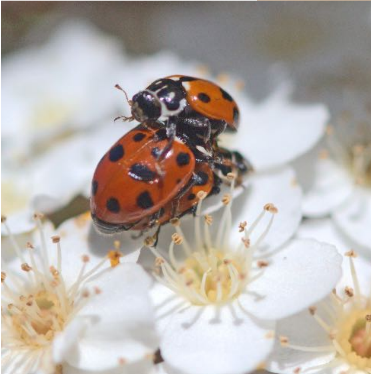
Lady Beetle Threesome & Hoverfly in flight - Dianne Cutting