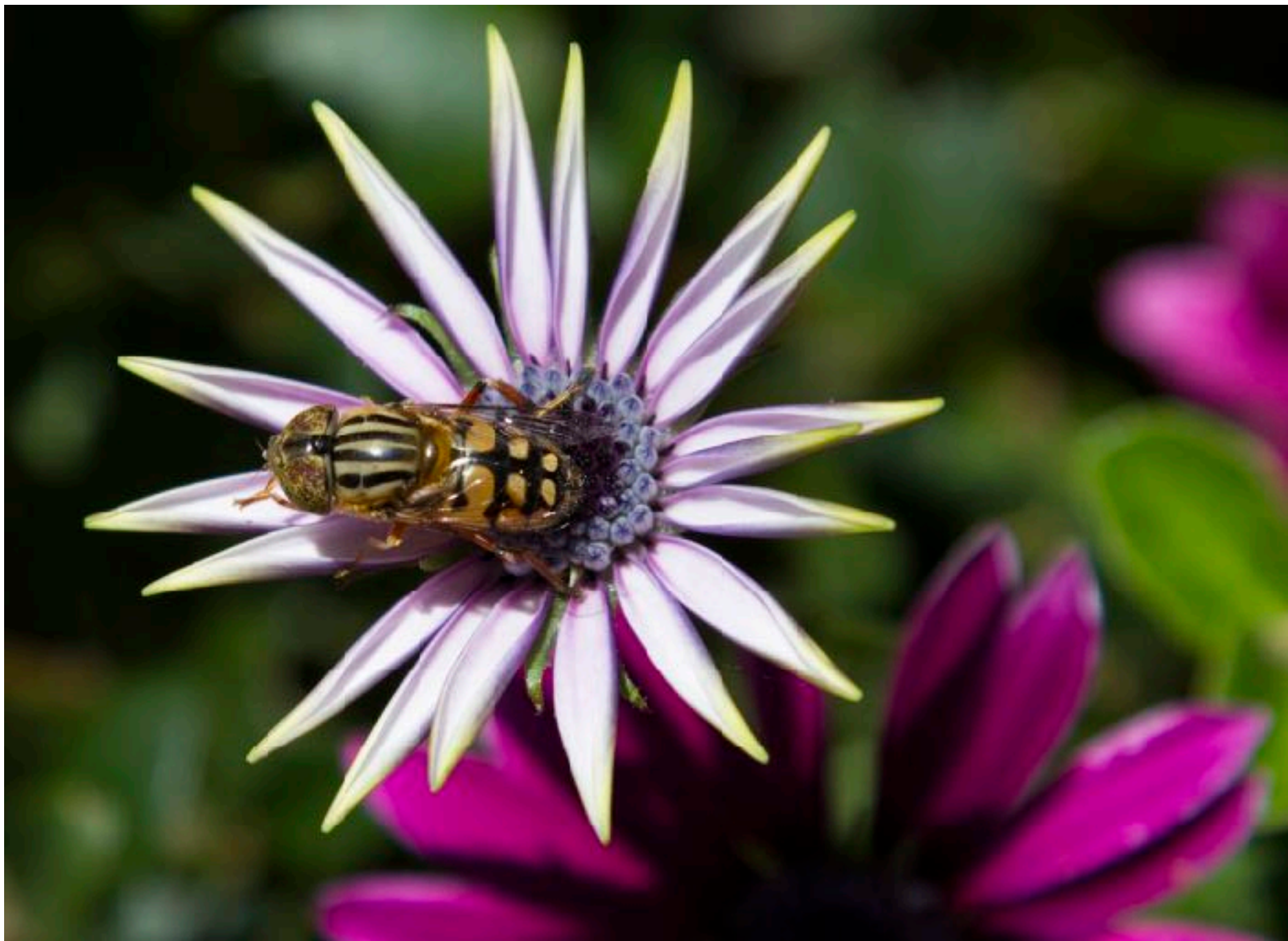
While photographing hover flies in my front garden, I spotted an insect I didn't recognise. This was later identified as a native drone fly. - Alison Milton