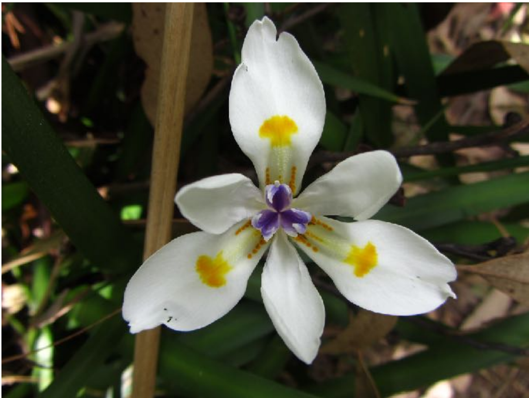
Orchid - South Coast 2016 - Helen Hall