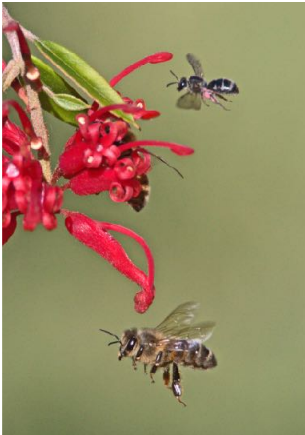
Two for the price of one - bee and hoverfly - Dianne Cutting