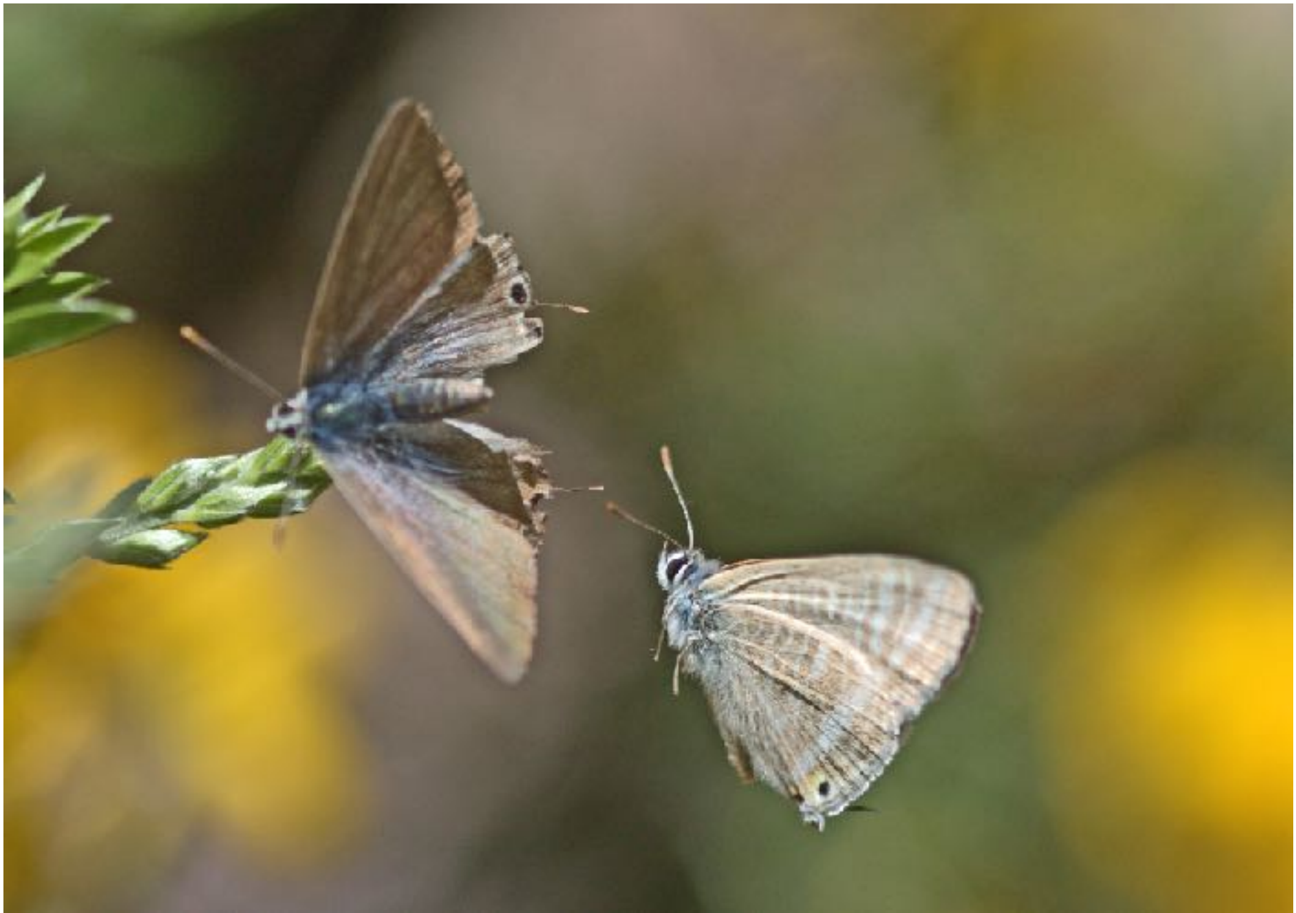
Pair of tiny butterflies - Dianne Cutting