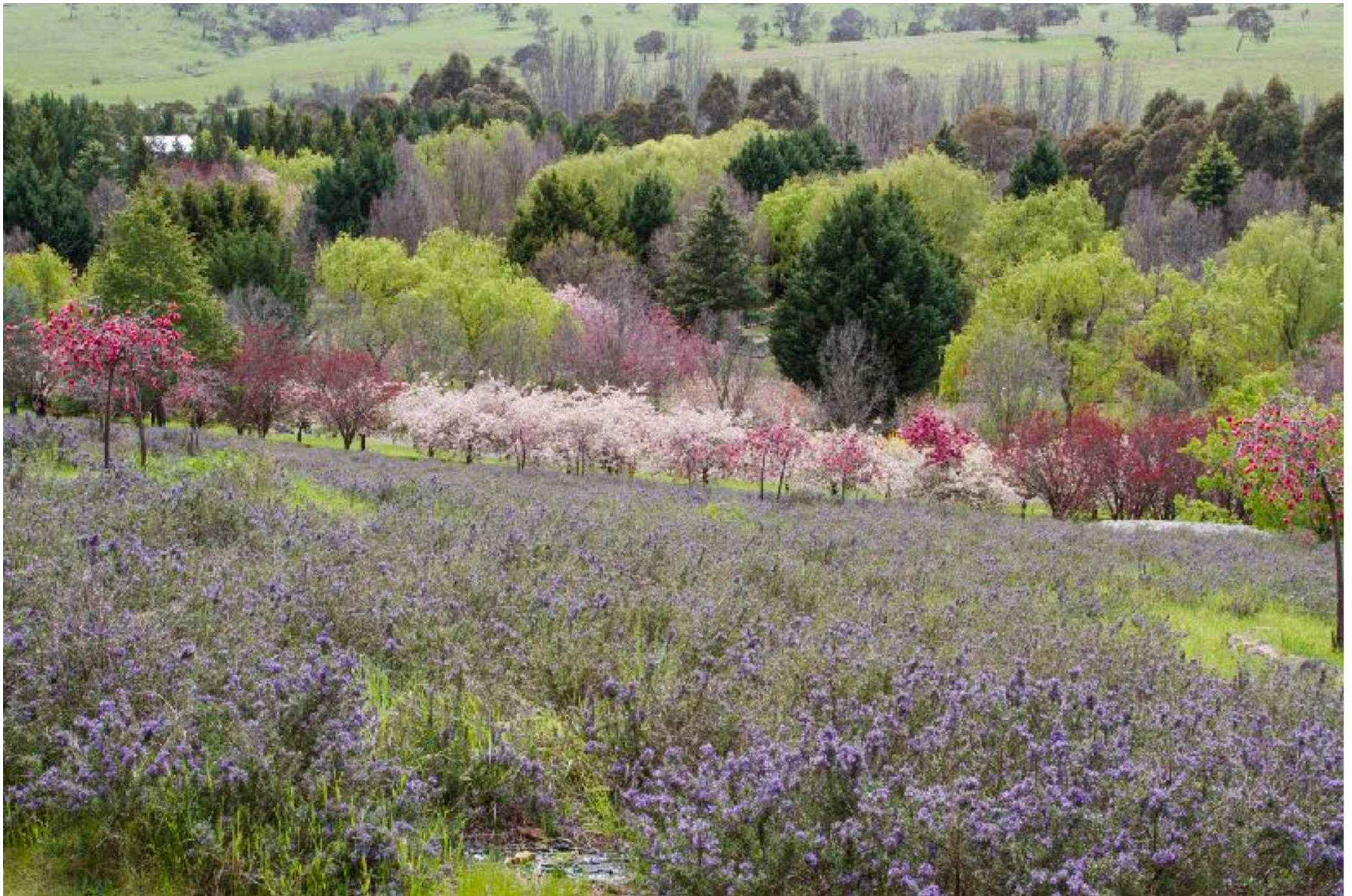
View from the Lookout at Tulip Tops - Alison Milton