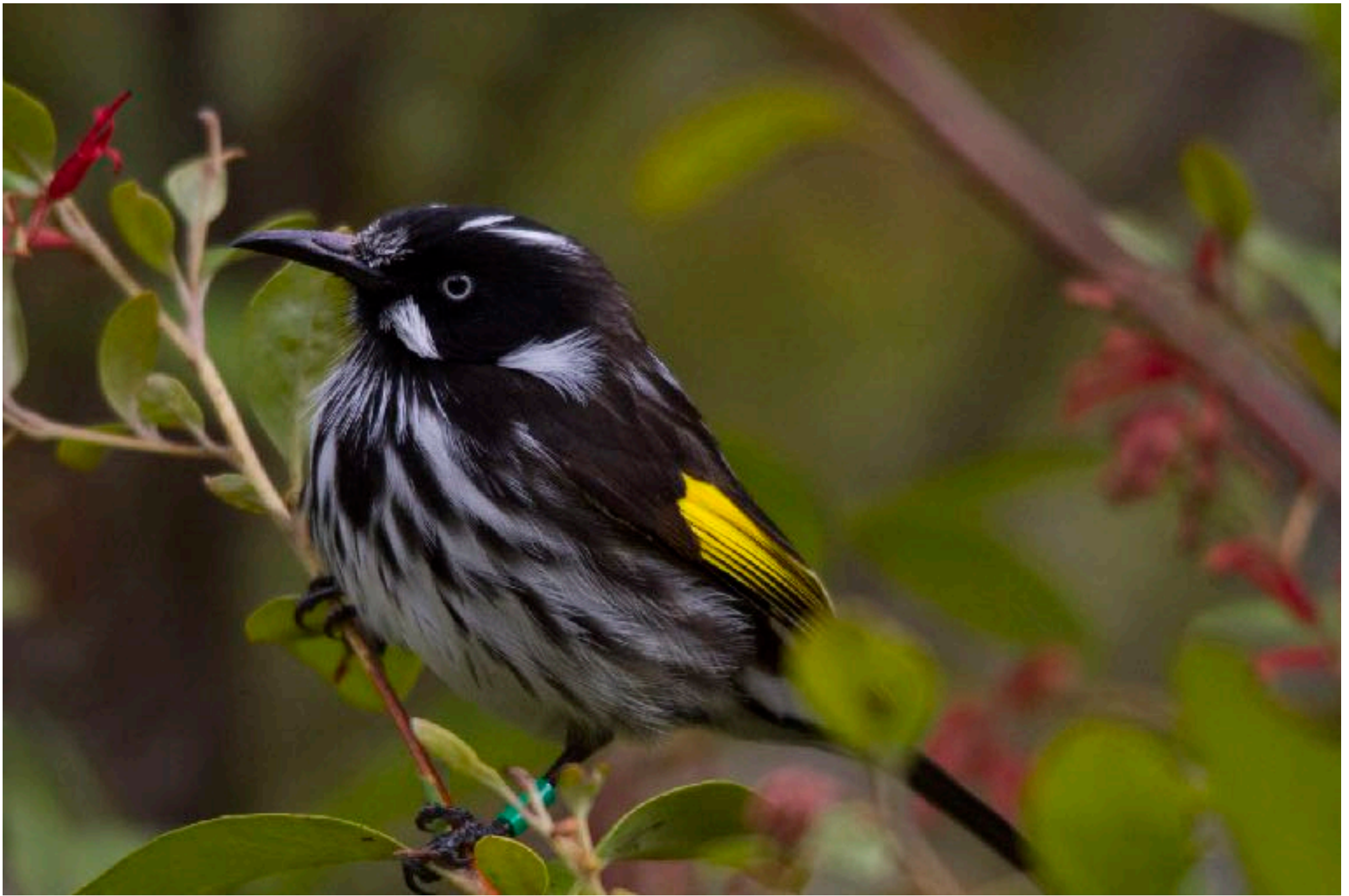
New Holland Honey Eater - Australian National Botanic Gardens