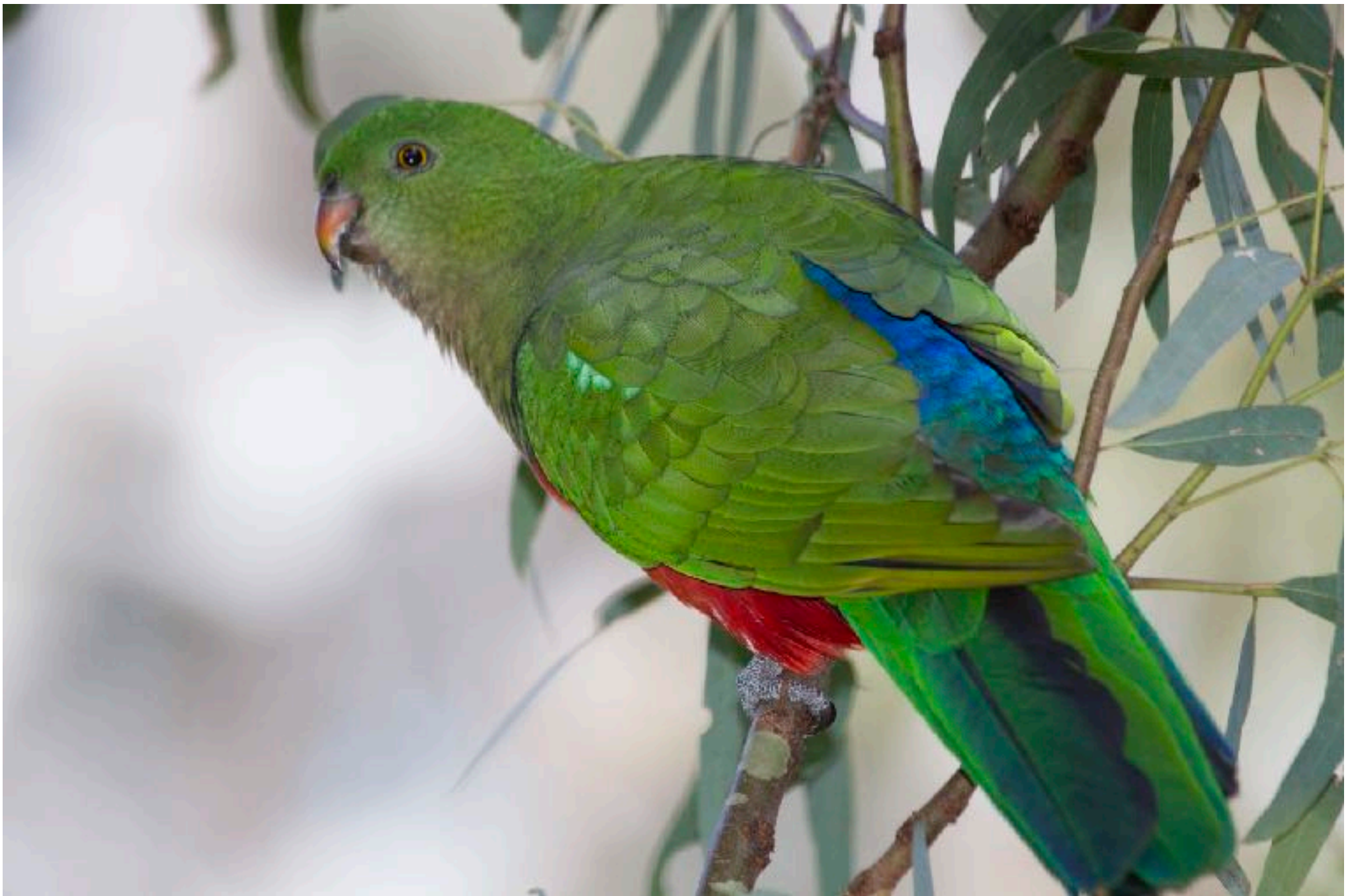
Female King Parrot - Australian National Botanic Gardens - Alison Milton