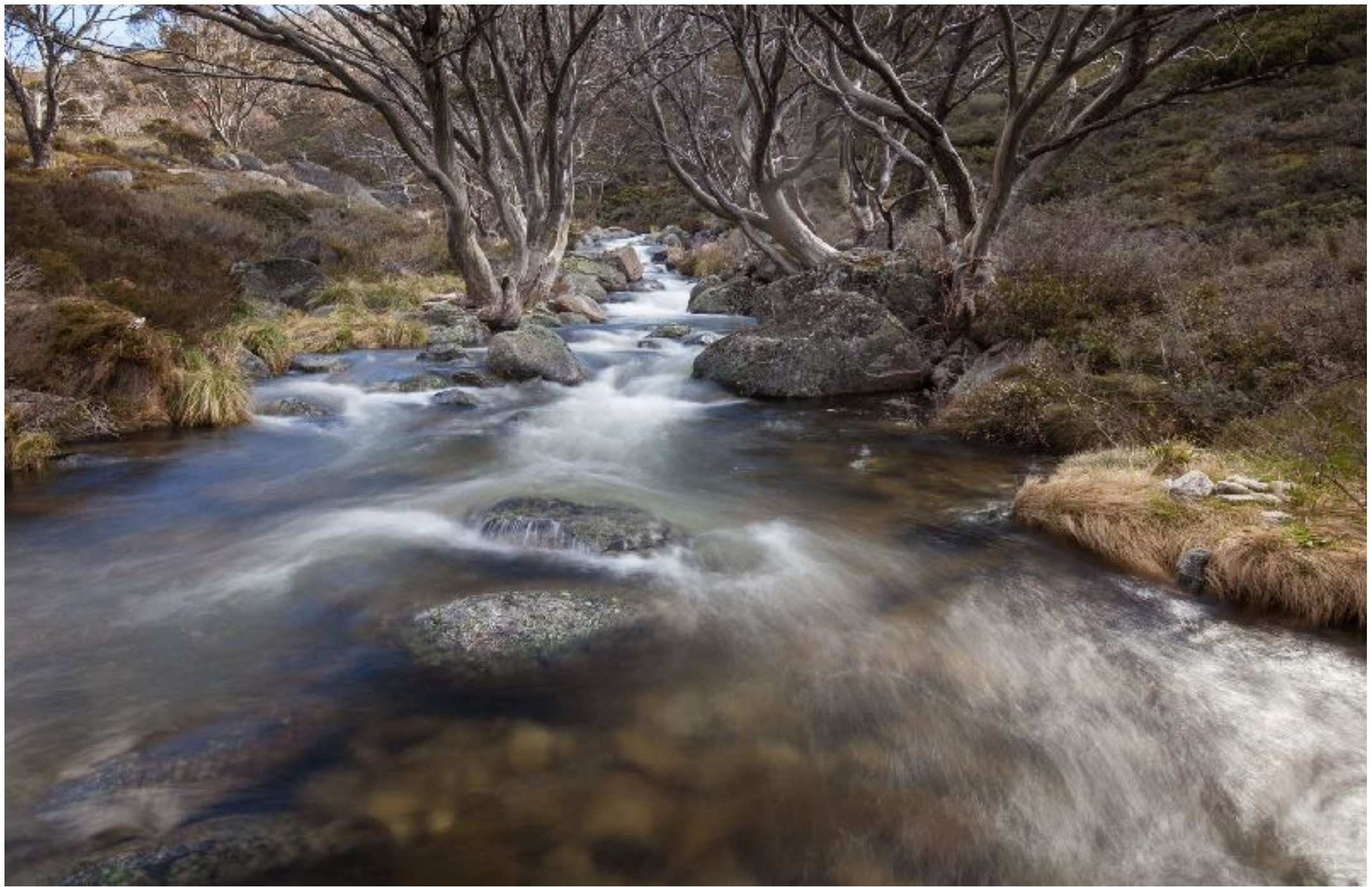
Guthega Weekend - Rod Burgess