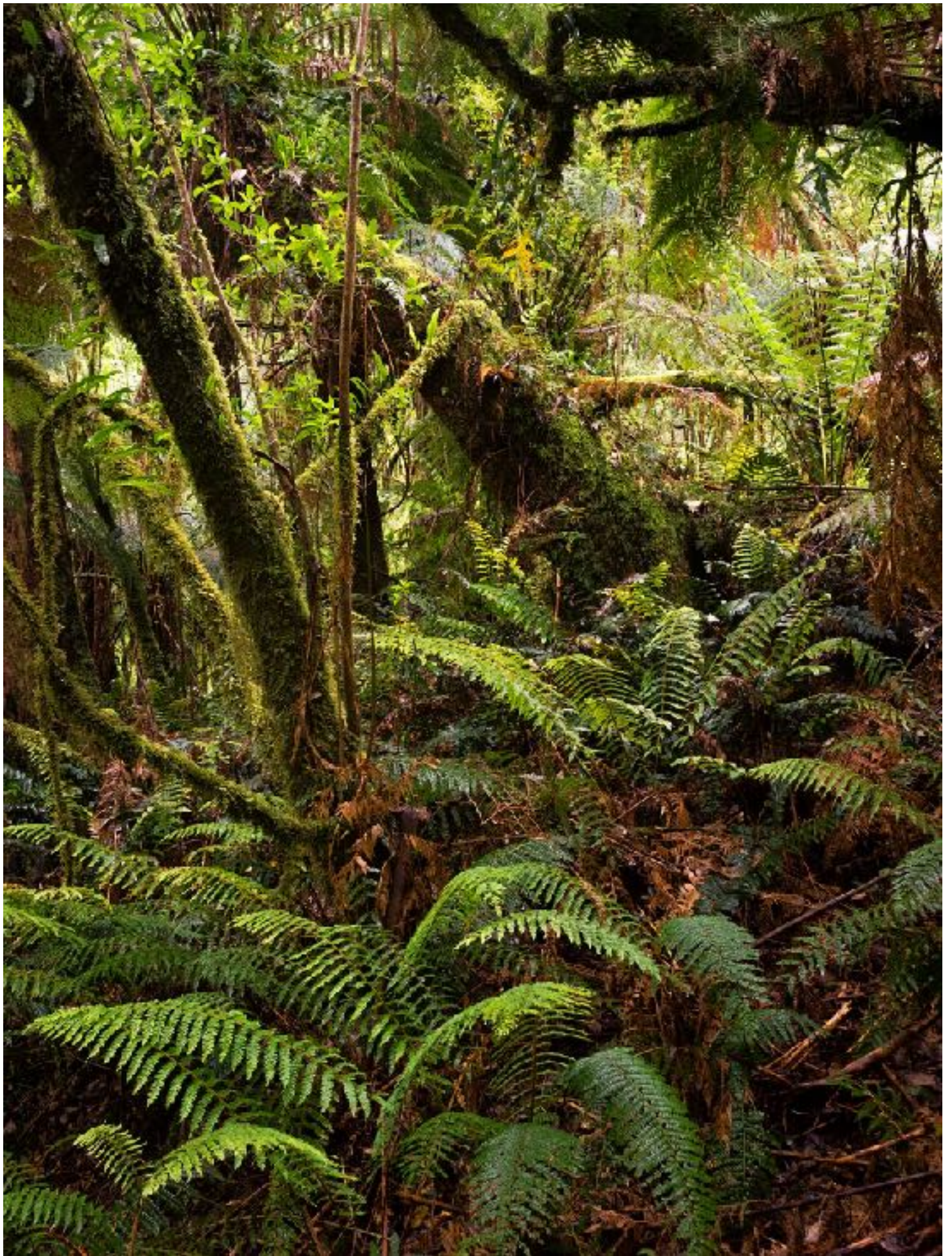
The fern forest is on Turttons Track in the Otway Ranges - Rod Burgess