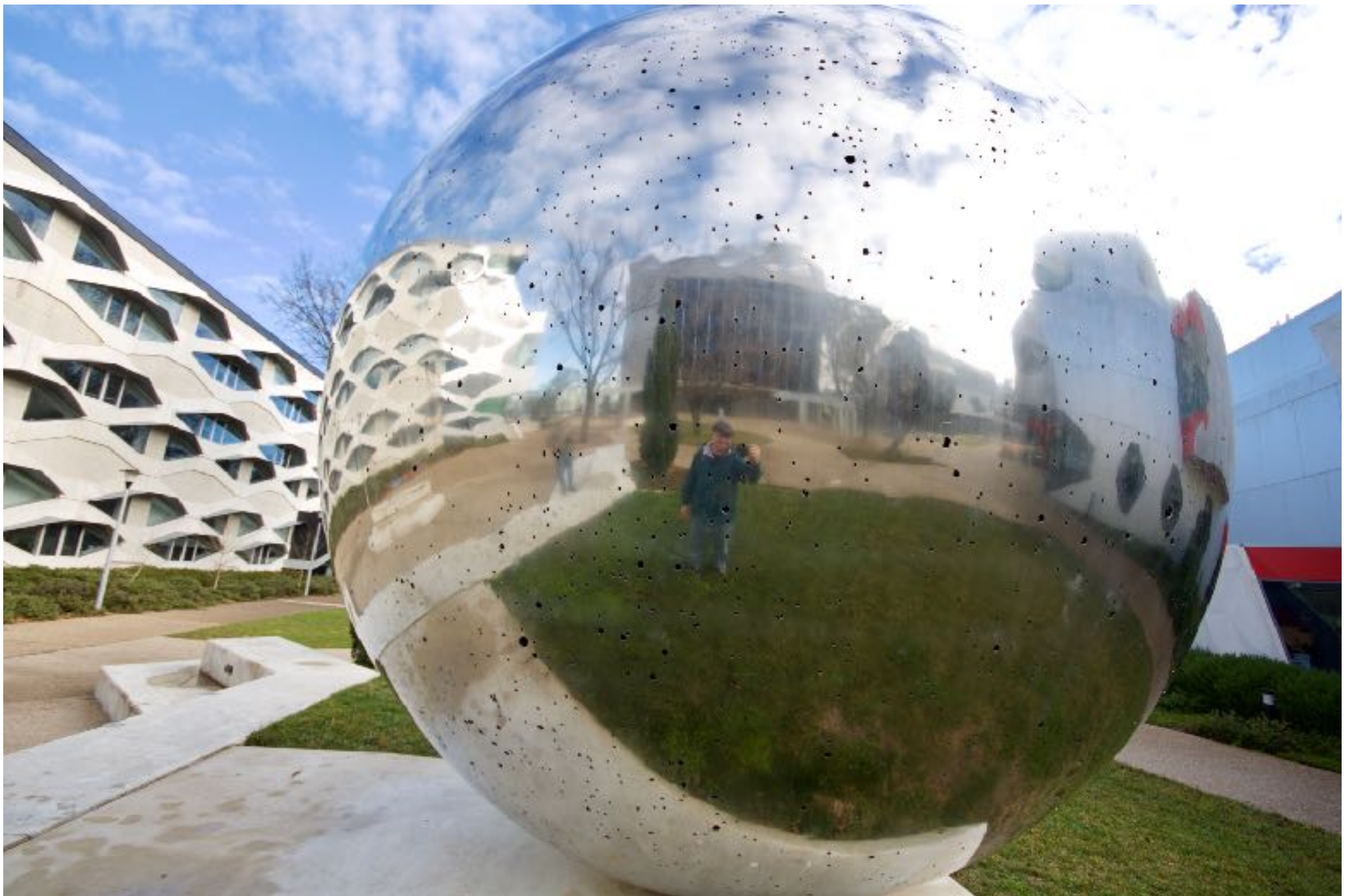
A punctured globe adjacent to the Linnaeus Building at ANU - Peter Keogh