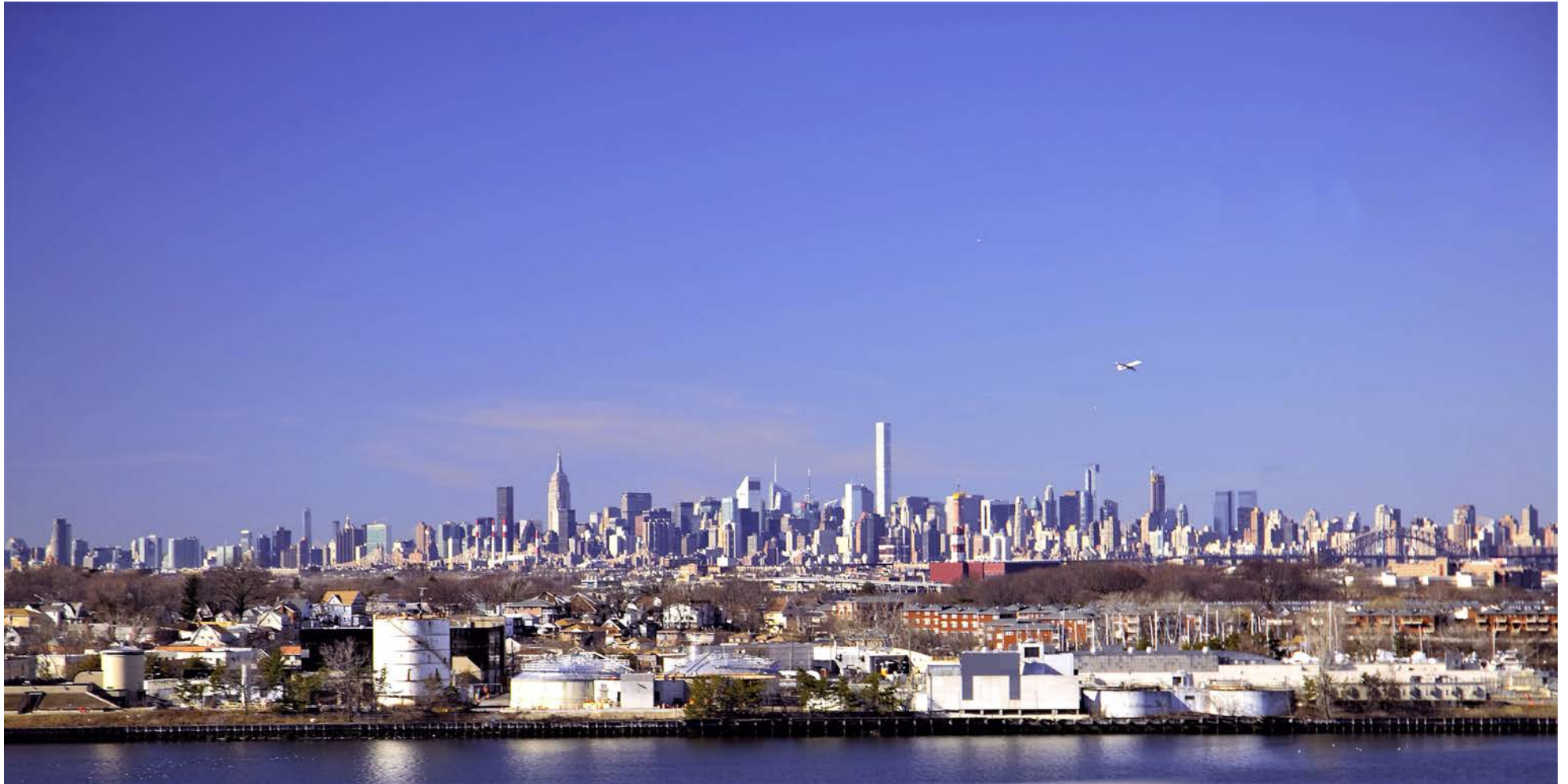
New York skyline from the Whitestone Bridge over the Hudson River