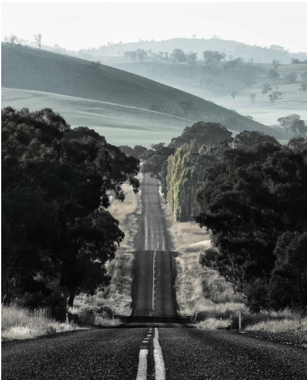
Little Smoky Mountains, RoseHill Road - Bob McHugh