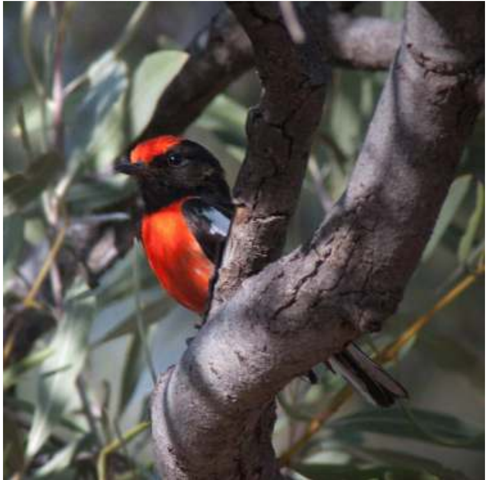
Red-capped robin, Gammon Ranges (SA) Pentax K7D 300 mm (Tamron SP 70-300 mm) 1/320s, f/4, ISO 800

Like many of us I'm searching for the great Australian landscape photo, the search continues, however I'm pleased with the water colour like qualities of this image from the Flinders Ranges. Equally I've been interested in wildlife photography ever since living in Kakadu National Park thirty years ago. Unfortunately my gear is often pushed past its limits, in this case the robin was a particularly cooperative subject and I was able to capture an image that I was happy with.