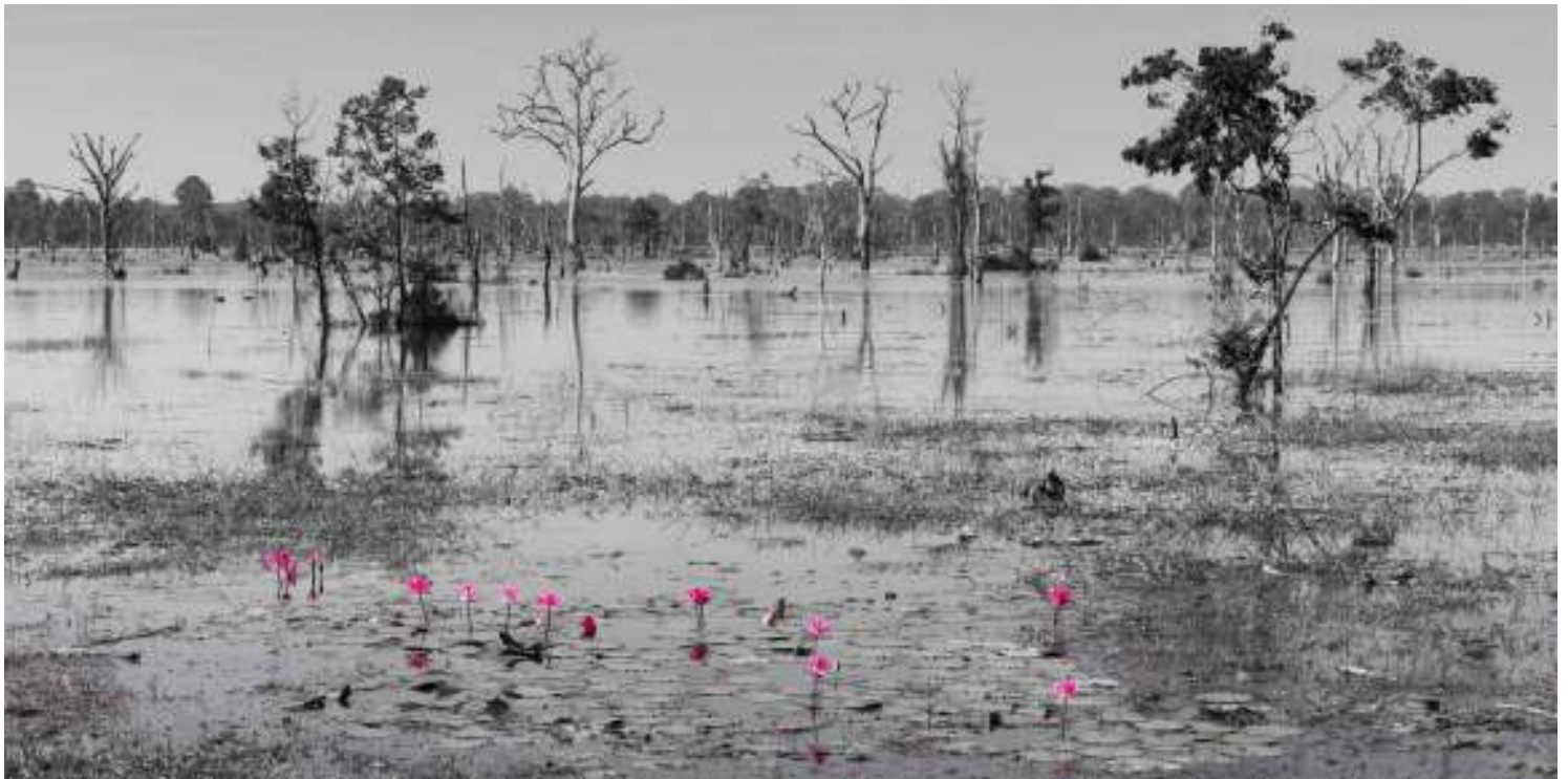
Lake north of Siem Reap, Cambodia.

Canon G7X, 37 mm focal length, f/2.8, 1/250 sec, ISO 250