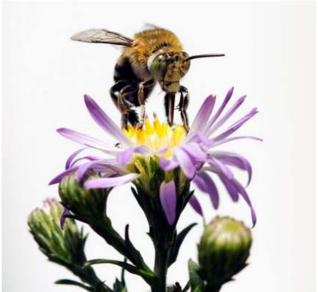
A native blue banded bee on a Margarite daisy in my back yard.

I have been a keen photographer for many years but I am still learning. This year in particular regarding using manual focus for macros and photographing in low low at night.