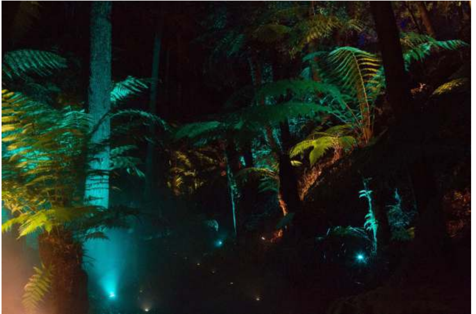
The rainforest in the Botanic Gardens during Luminous Botanicus