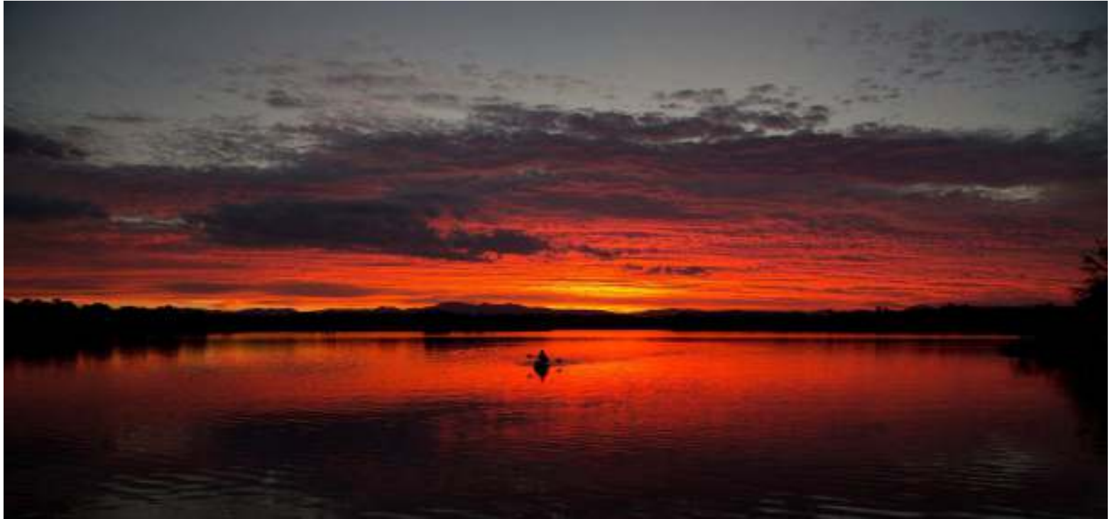
Lonely on the water