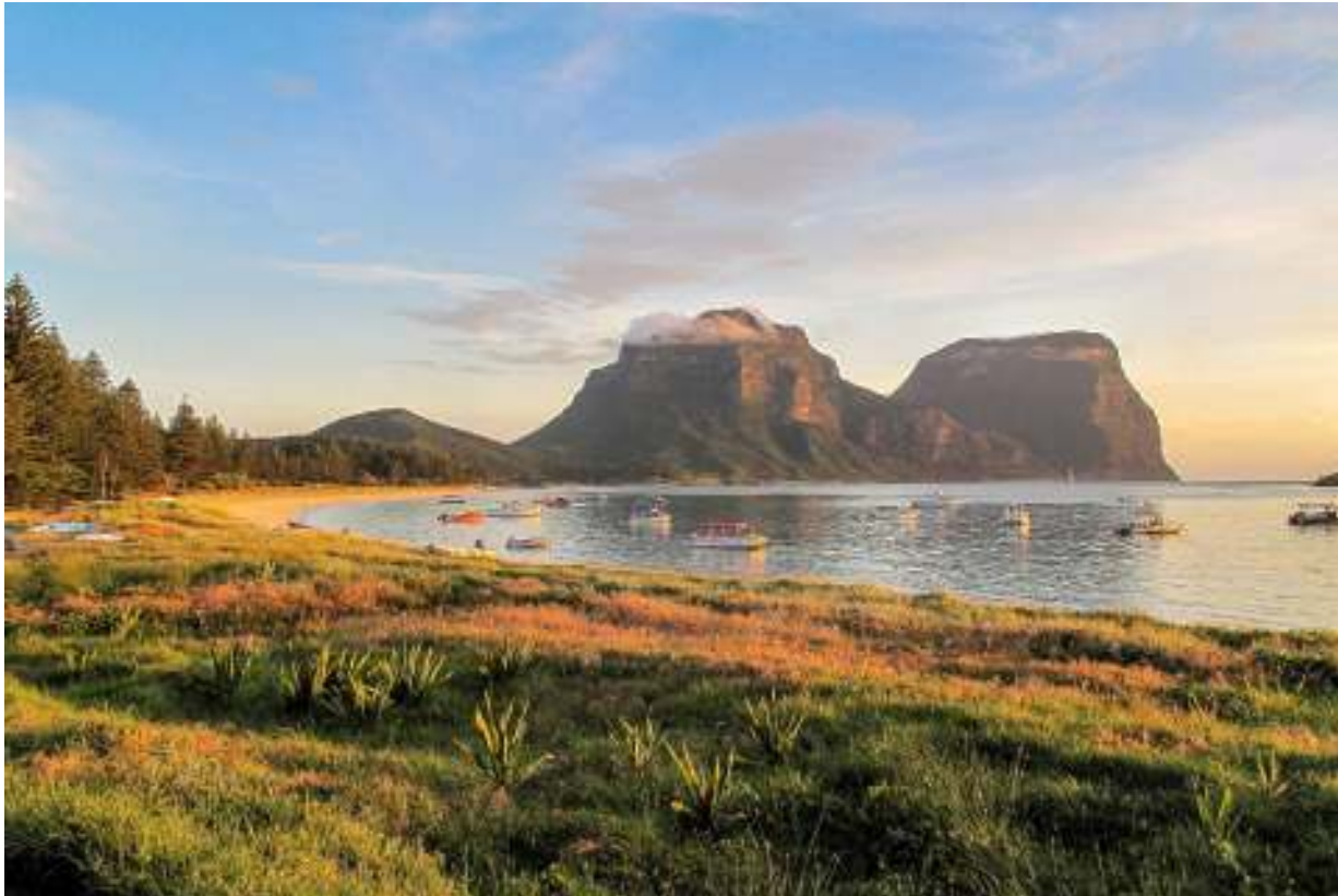
Lord Howe Island

My challenge now is to try and recognise what would make a good photo and to improve my technique and to get out and take more photos.