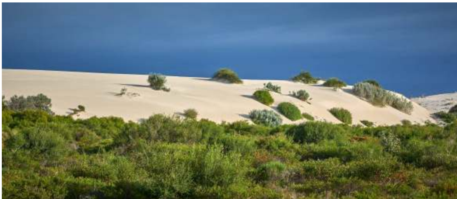
Sand dunes in Nambung National Park, north of Perth Nikon D800 ISO 200 1/200 f/13 Nikon 70-200mm at 102mm