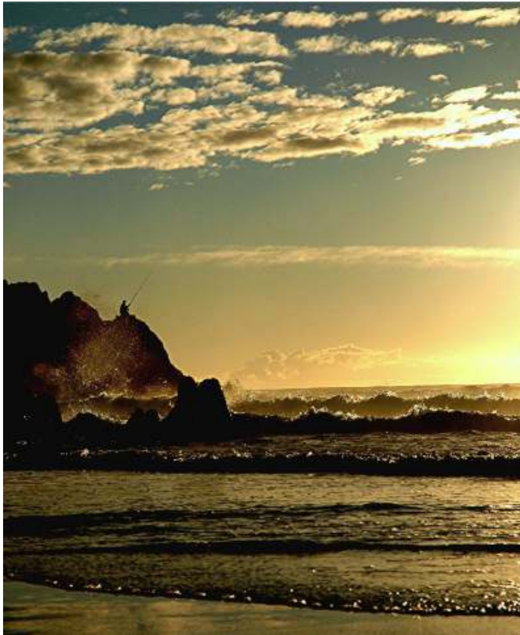
Moruya Heads Dolphin Beach Nikon 1/800 sec f 5.6 70mm sunrise June