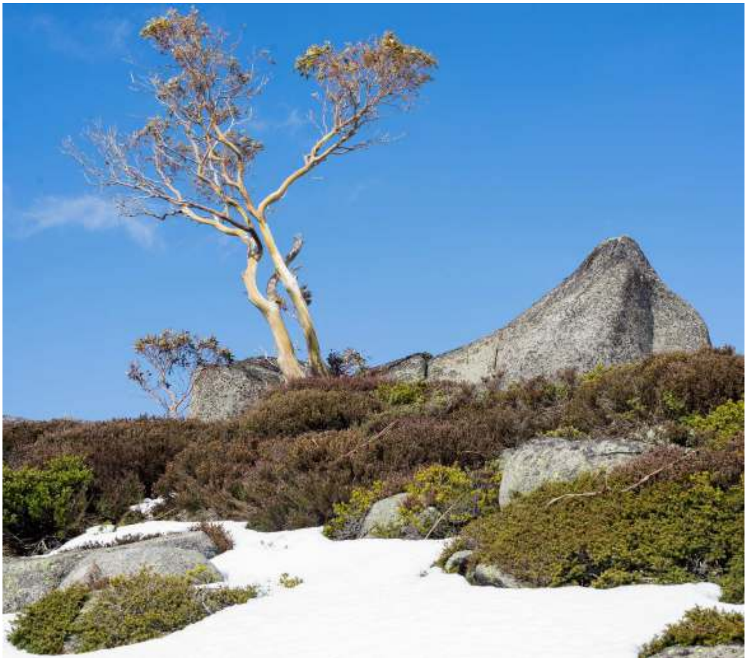
ISO 100, f/11 @ 1/100 sec. Nikon D610 and Nikon 50mm f/1.8 D lens. Processed in Lightroom. Taken on a spring skiing trip in September 2016 near Guthega.