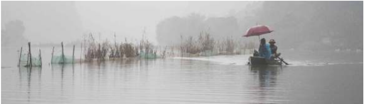
Ninh Binh, northern Vietnam.

Canon G7X, 37 mm focal length, f/2.8, 1/250 sec, ISO 250