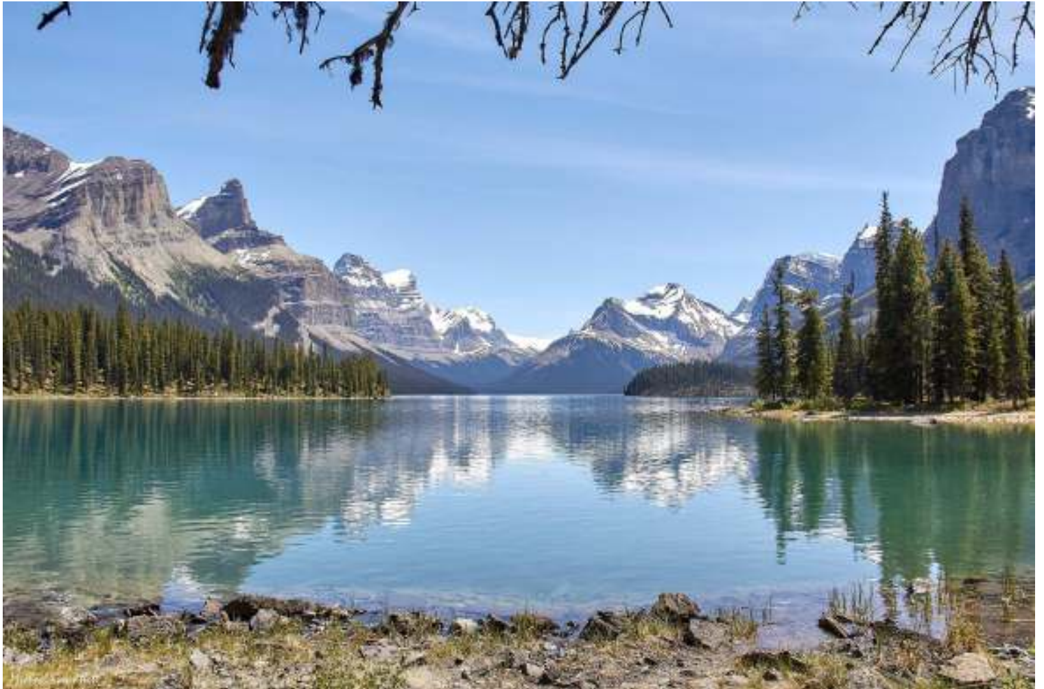
Maligne Lake, Jasper National Park, Alberta, Canada

Canon 60D with Canon EF-S 18-200mm at 18mm 1/125 sec at f11 and ISO100