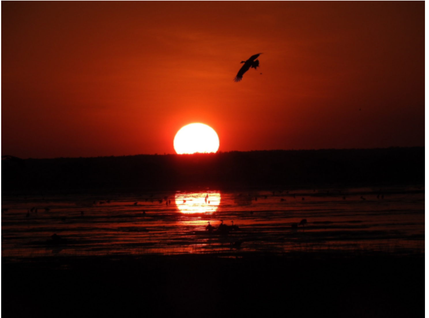
Kakadu sunset, taken last October