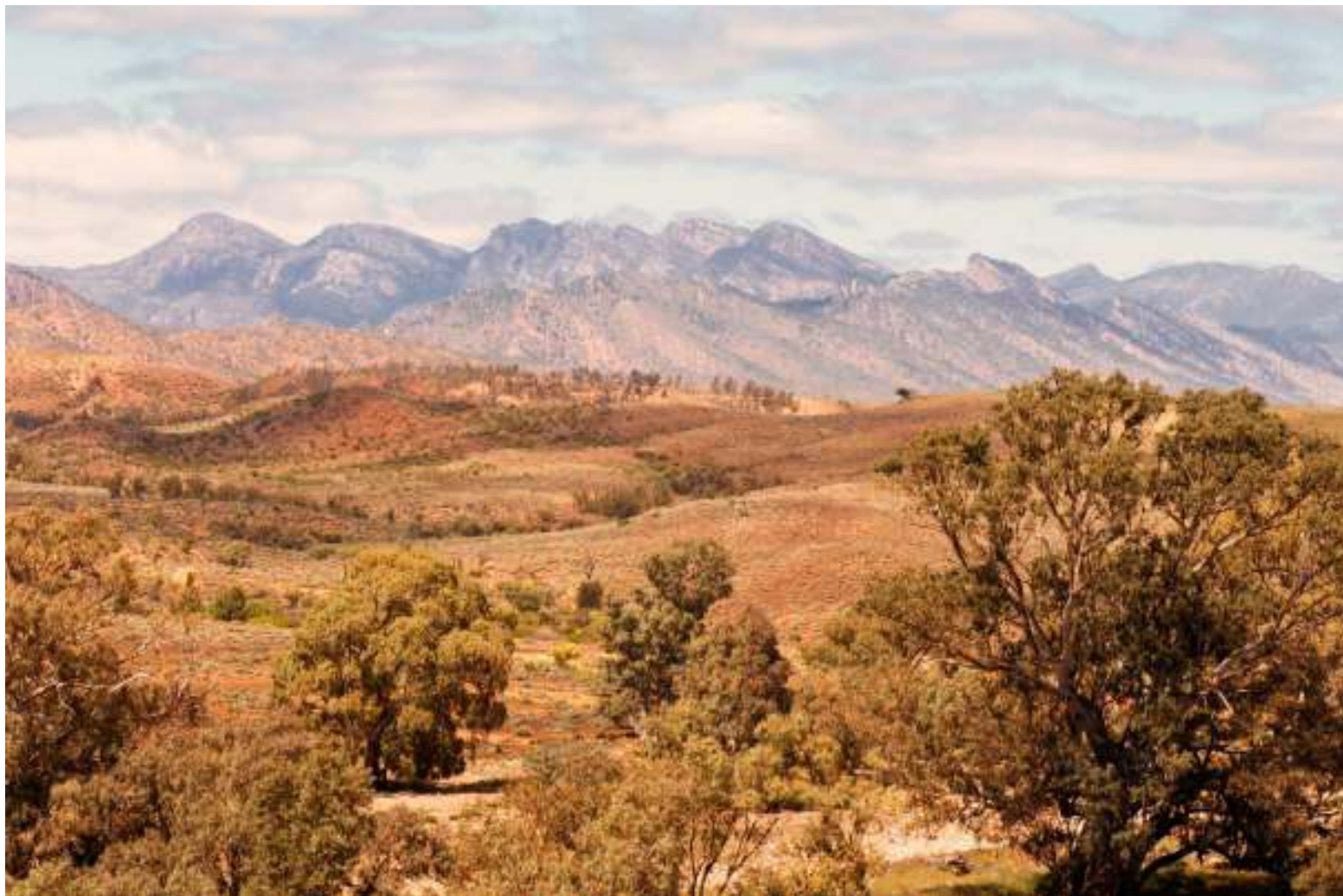
Flinders Ranges (SA) from Brachina Lookout

Pentax K7D 90 mm (Tamron SP AF 90mm F2.8) 1/125s, f/7.1, ISO 100