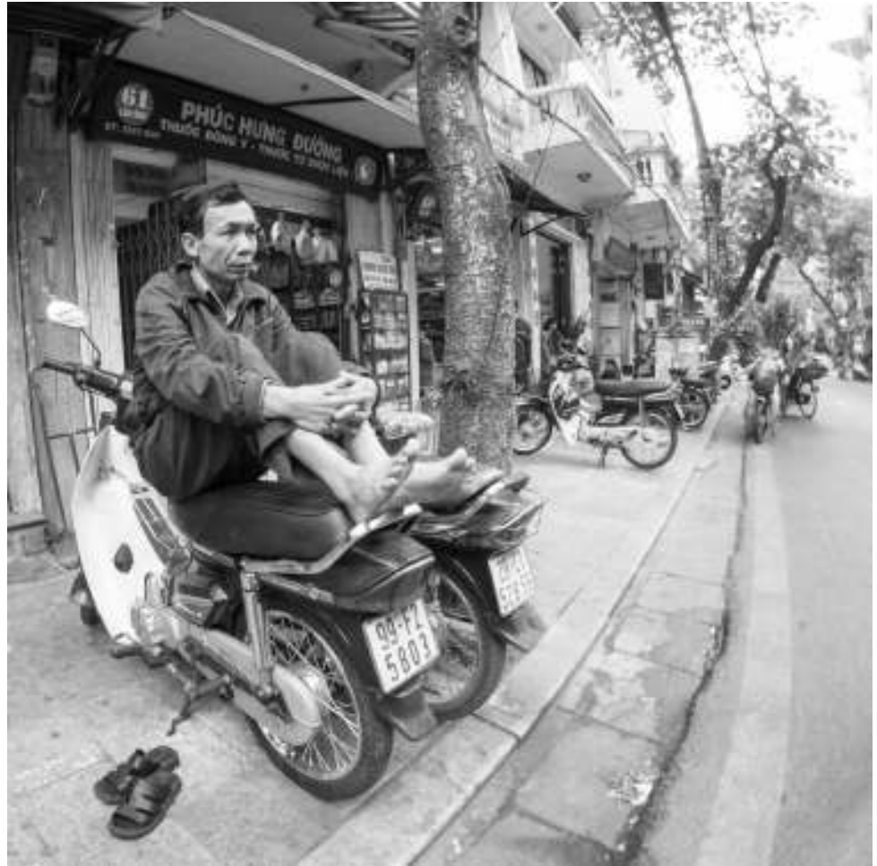
Streets of Hanoi.

A recent trip to Cambodia and northern Vietnam brought some good opportunities for this, as can be seen in the accompanying images.