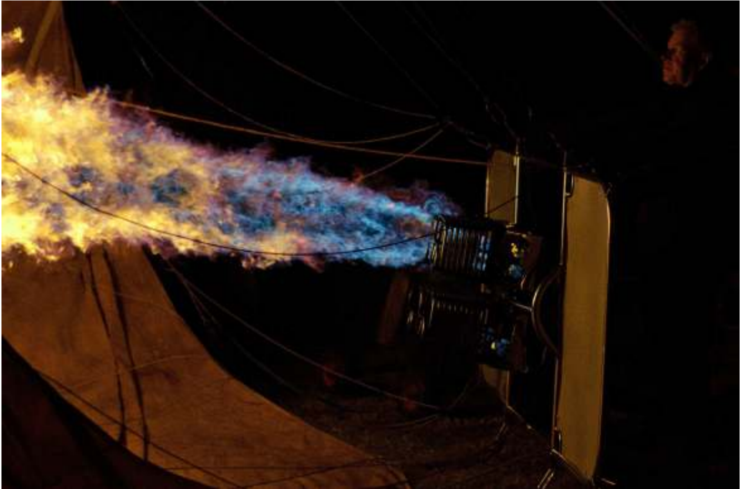
Balloon Pilot, Canberra Balloon Spectacular Nikon D7000, Nikkor 50mm lens, 1/2000sec, f2.2, ISO: 3200.