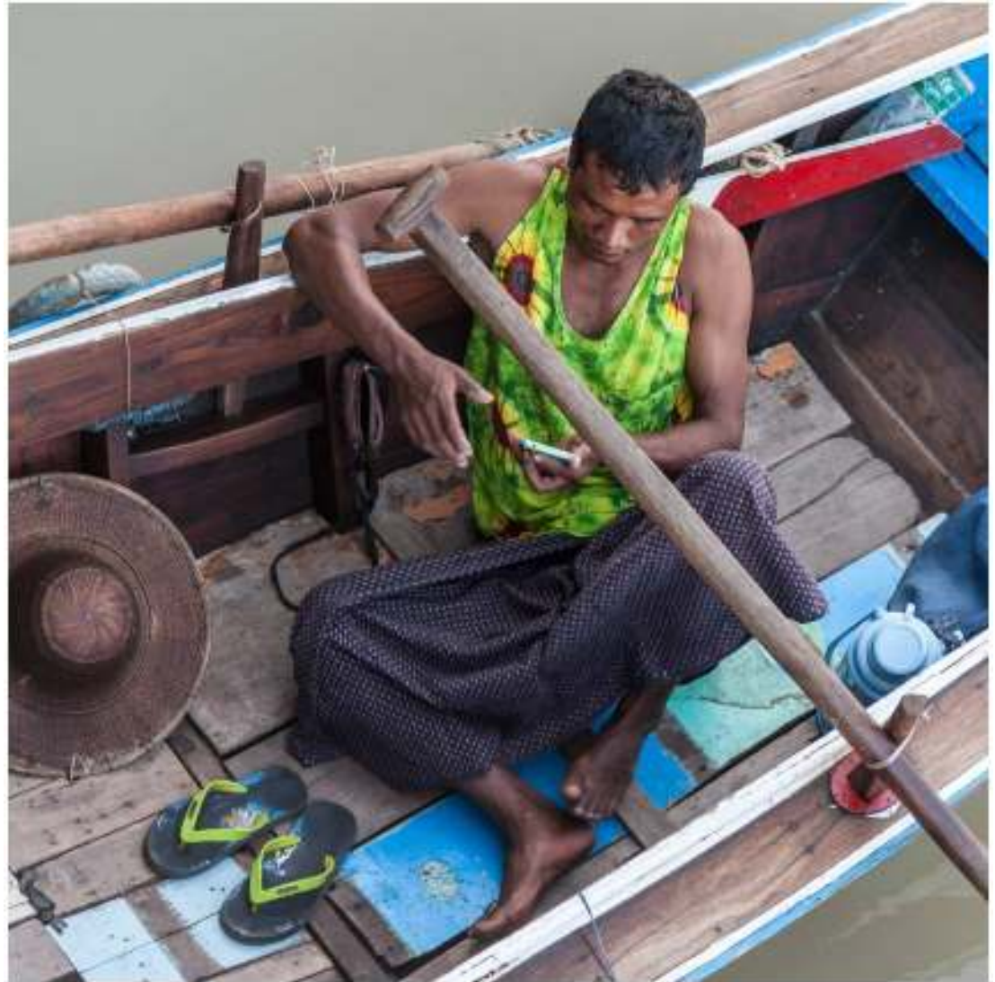
Fisherman with phone

In the last few months I've spent several weeks on business in Yangon, Myanmar. I have been struck by a number of things - the busy streets and rivers, the colourful but faded beauty of the buildings and the constant contrasts between 'progress' and tradition. In both these photos I was drawn by the colours and contrasts of the subjects.