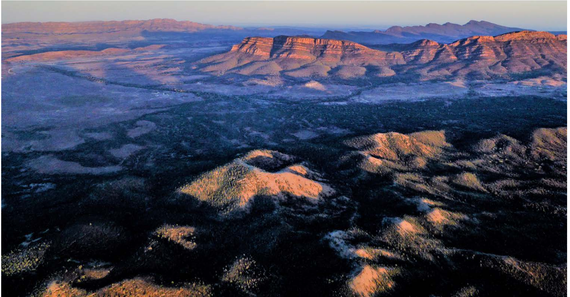
Sunrise at Wilpena Pound - Flinders Ranges, Sth Australia - Helen Dawes