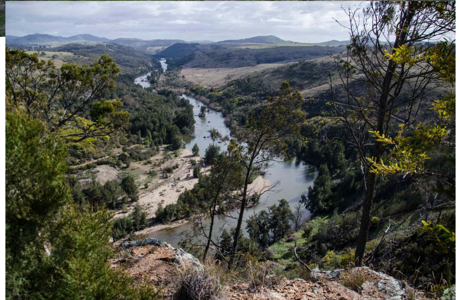
Strathnairn & Shepherds Lookout Excursion - Bev Bayley