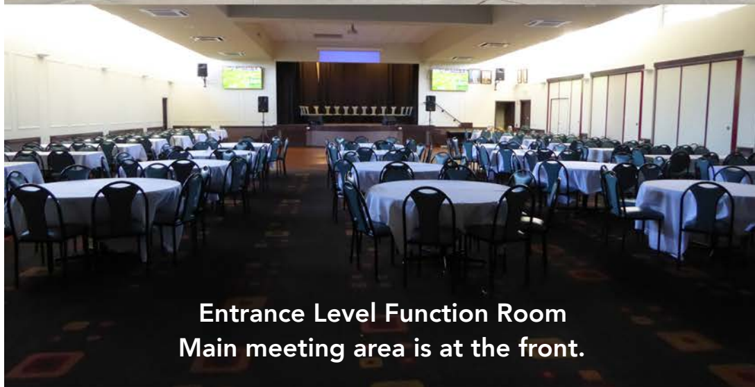
Entrance Level Function Room Main meeting area is at the front.