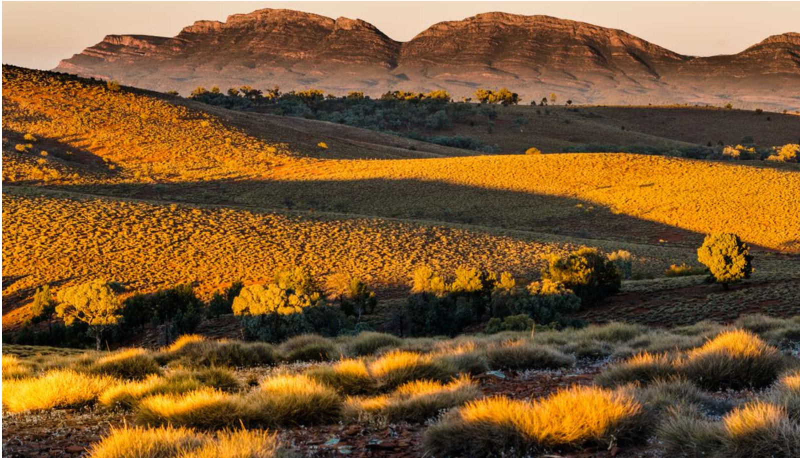
Sunrise - Hucks Lookout Flinders Ranges - Helen Dawes