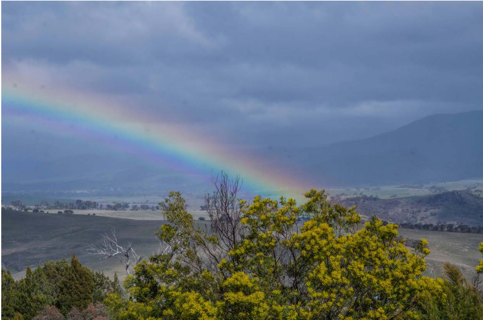
Strathnairn & Shepherds Lookout Excursion - Bev Bayley