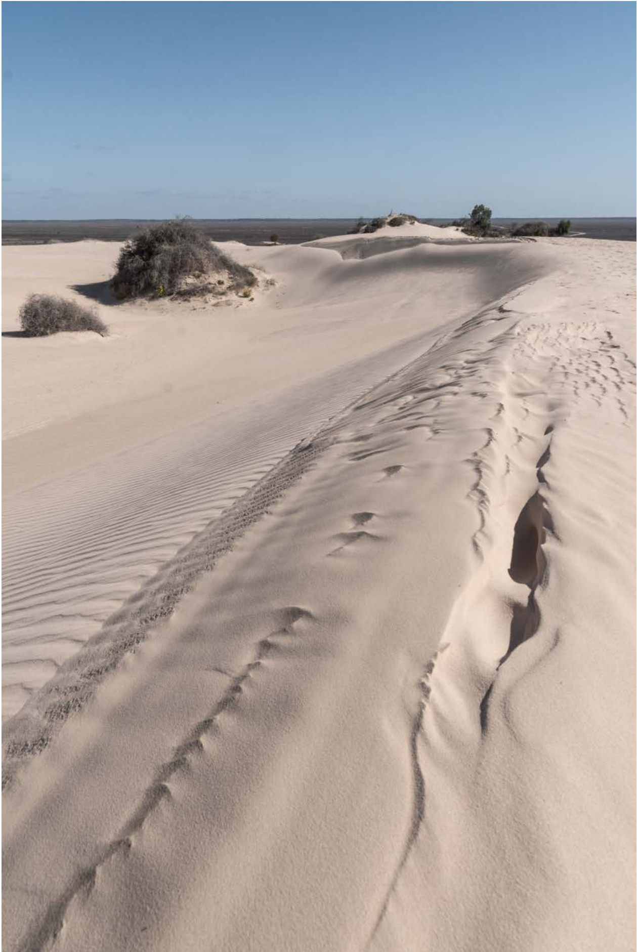
The beauty of sand and wind - Mungo National Park - Helen Dawes