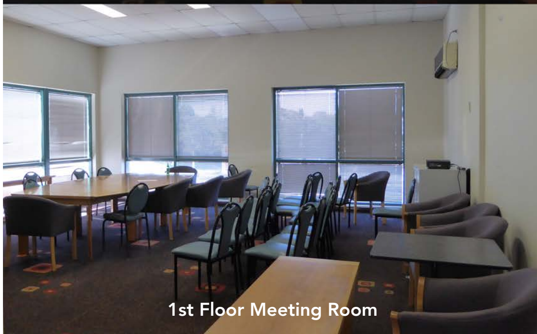
1st Floor Meeting Room