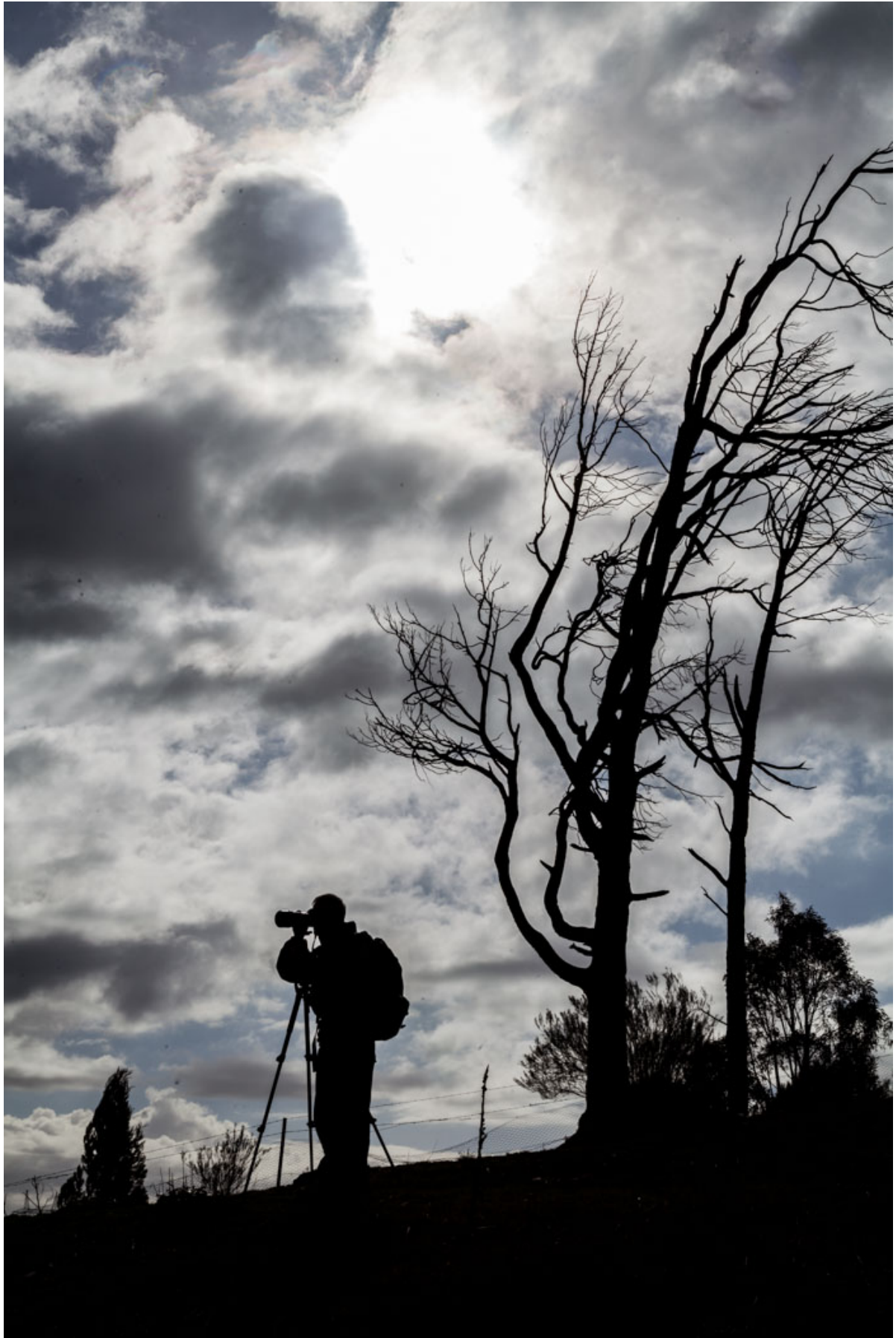
Shepherd's Lookout . - Iain Cole