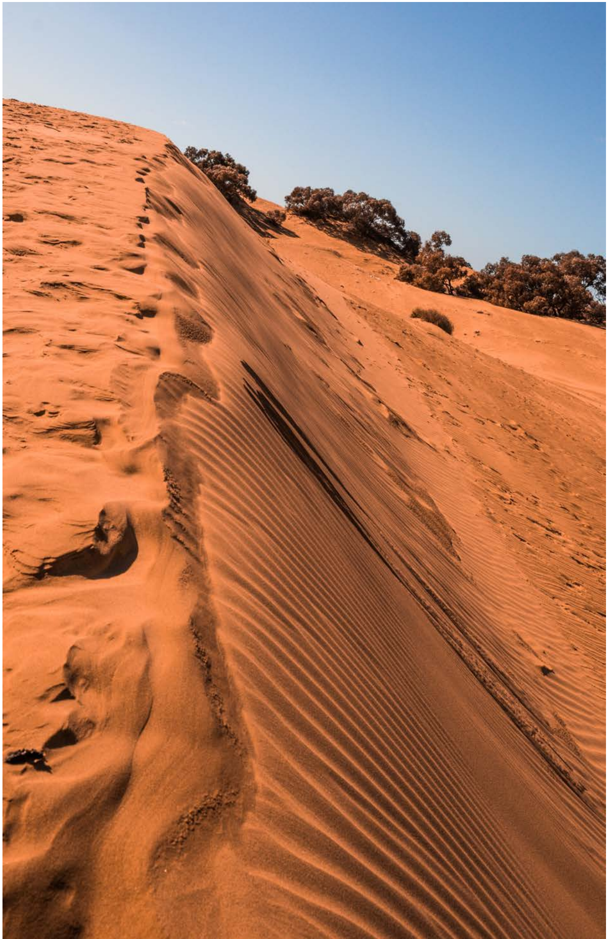
The beauty of sand and wind - Perry Hills Wentworth. NSW.