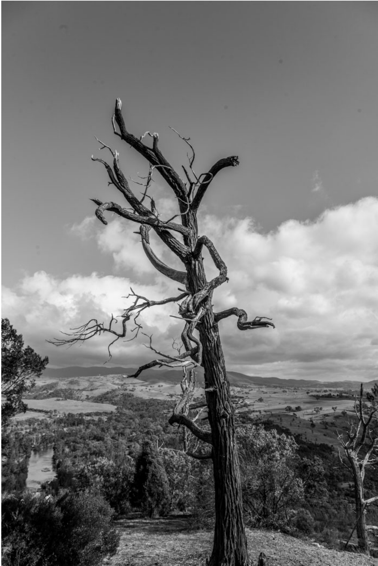
Shepherd's Lookout . - Iain Cole