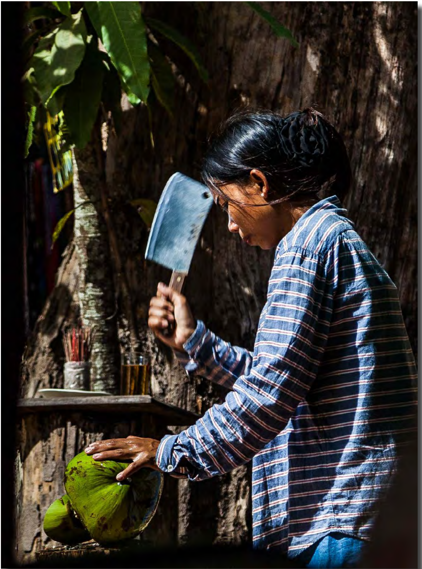
Street life in Cambodia Iain Cole