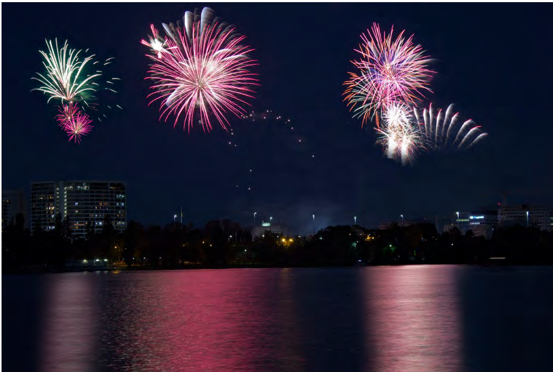
New Year's eve fireworks composite