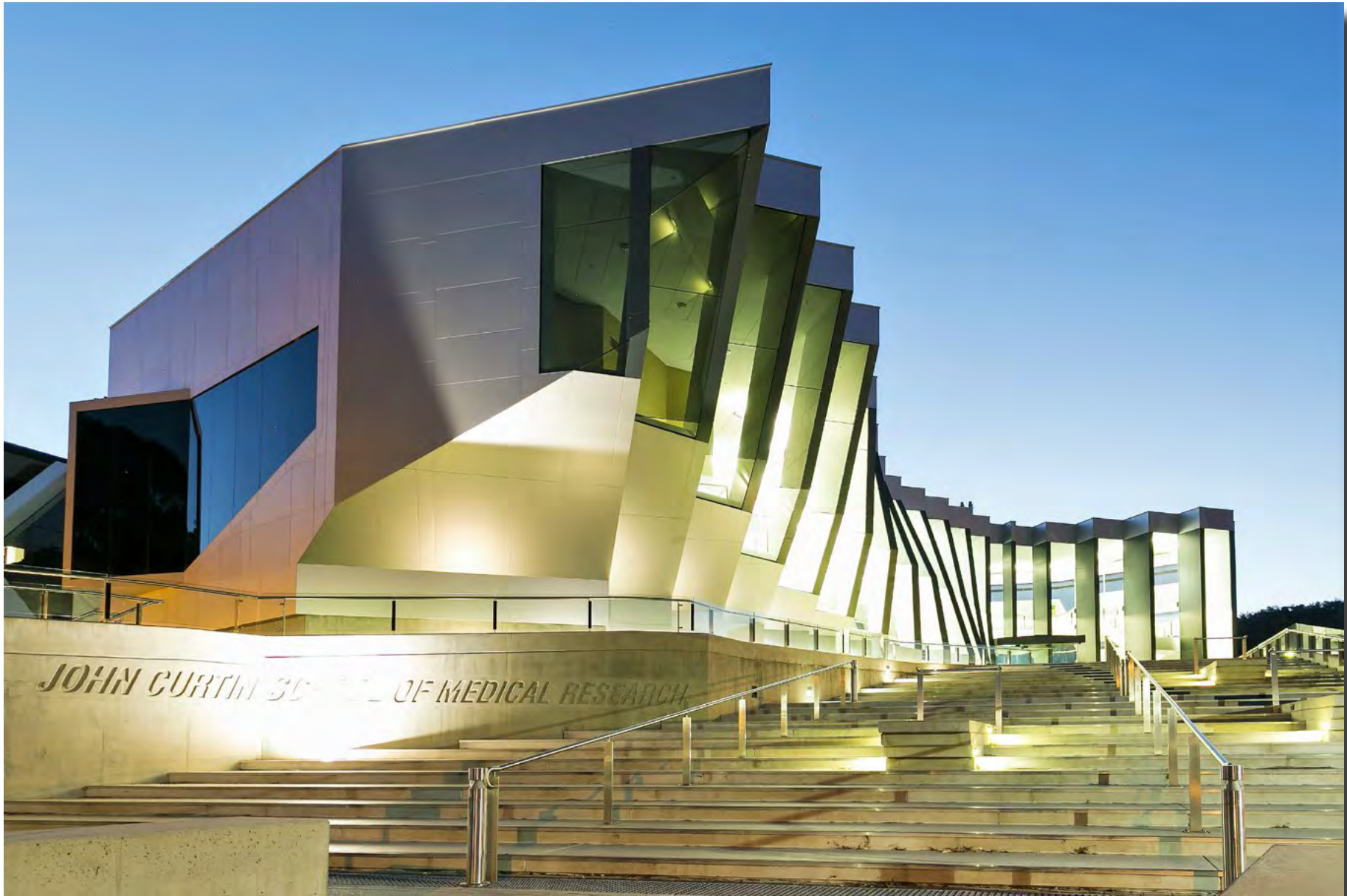
Night time at the John Curtin School of Medical Research