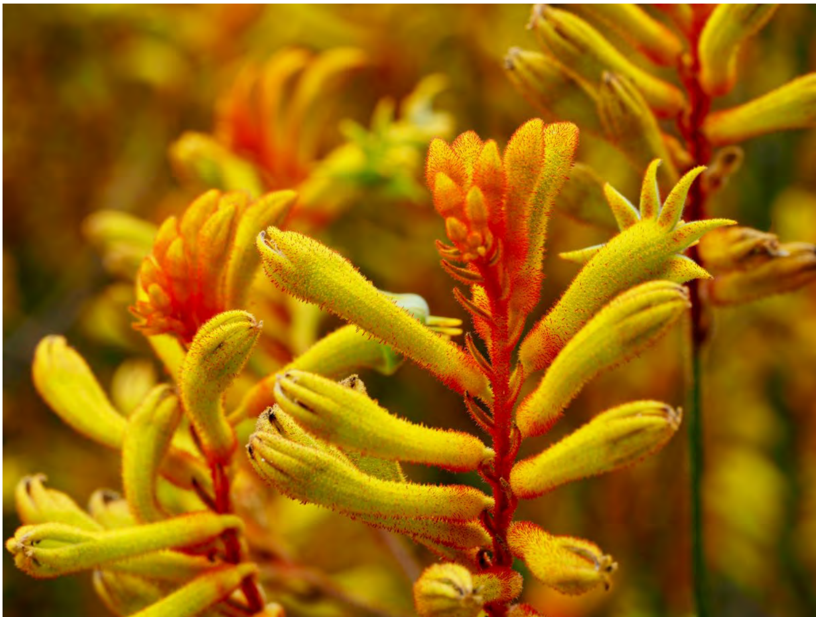
Australian National Botanic Gardens: Peter Keogh Olympus E-M1 with 60 mm macro lens