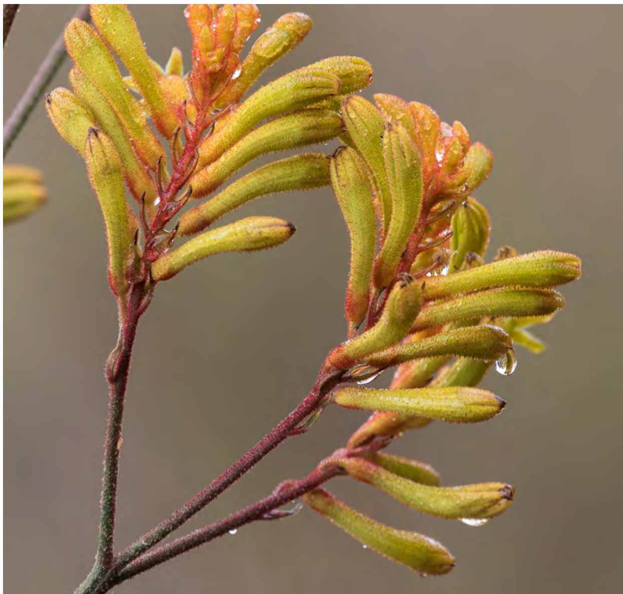
Kangaroo paw, Australian National Botanic Gardens