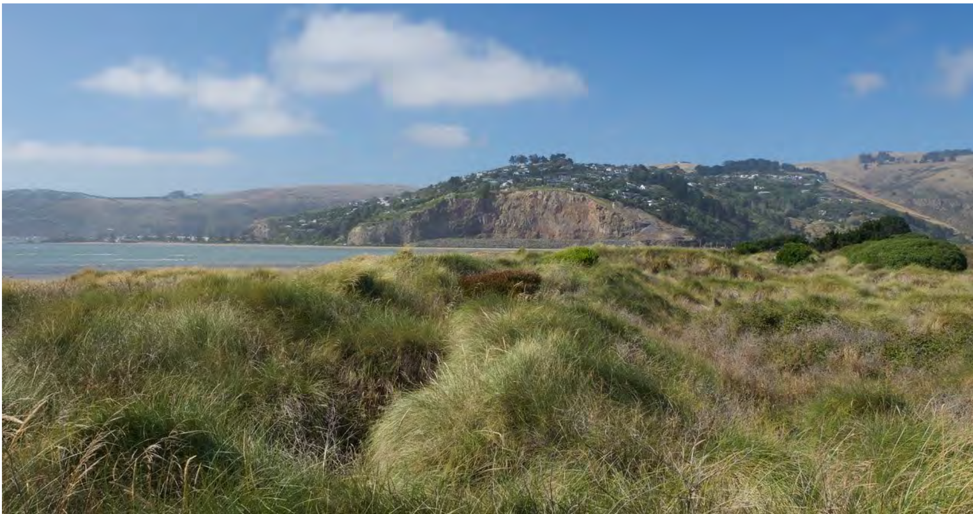
The quarry cliff face depicted in the background partially collapsed during the earthquake. Laurie Westcott