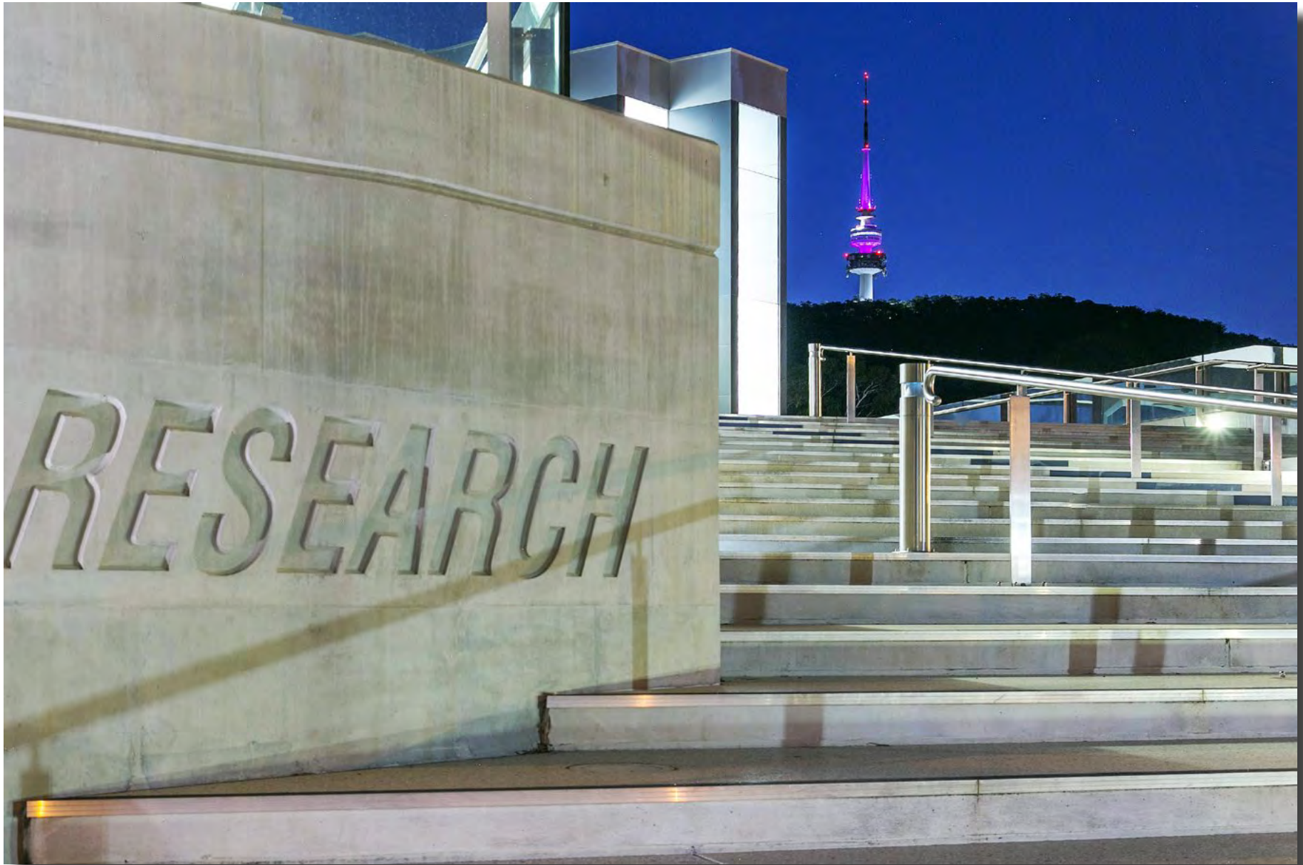
Night time at the John Curtin School of Medical Research