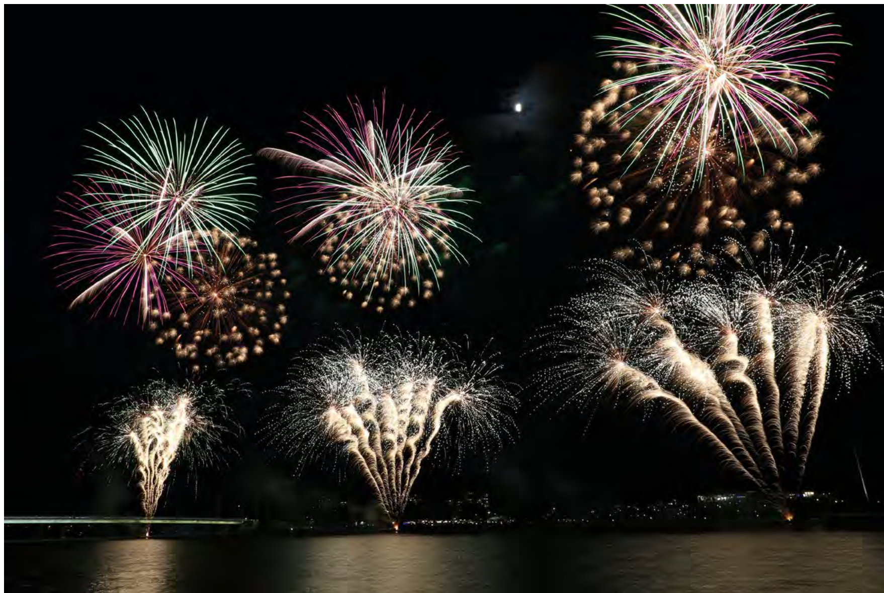
Australia Day fireworks, 2018 Alison Milton