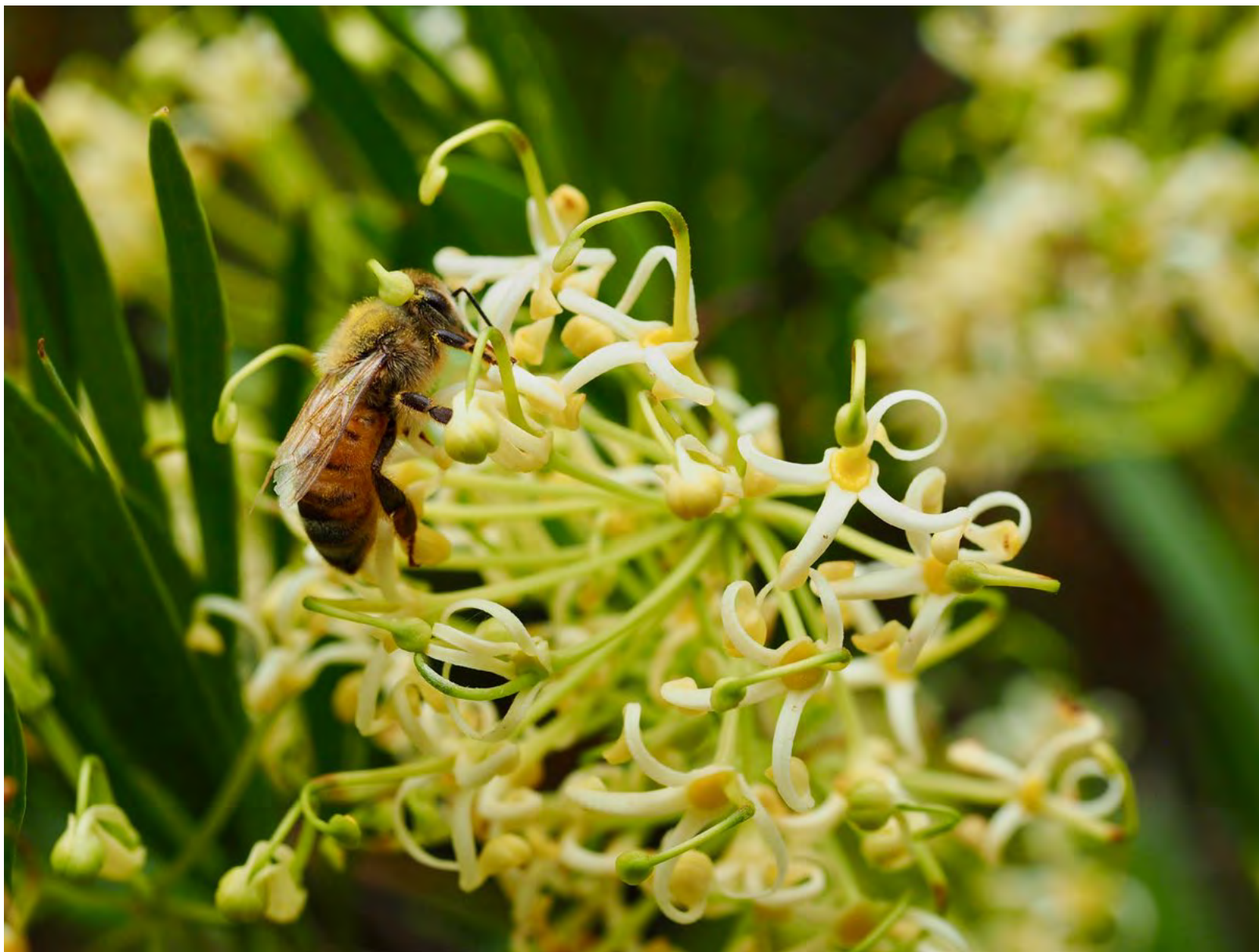
Australian National Botanic Gardens: Peter Keogh Olympus E-M1 with 60 mm macro lens