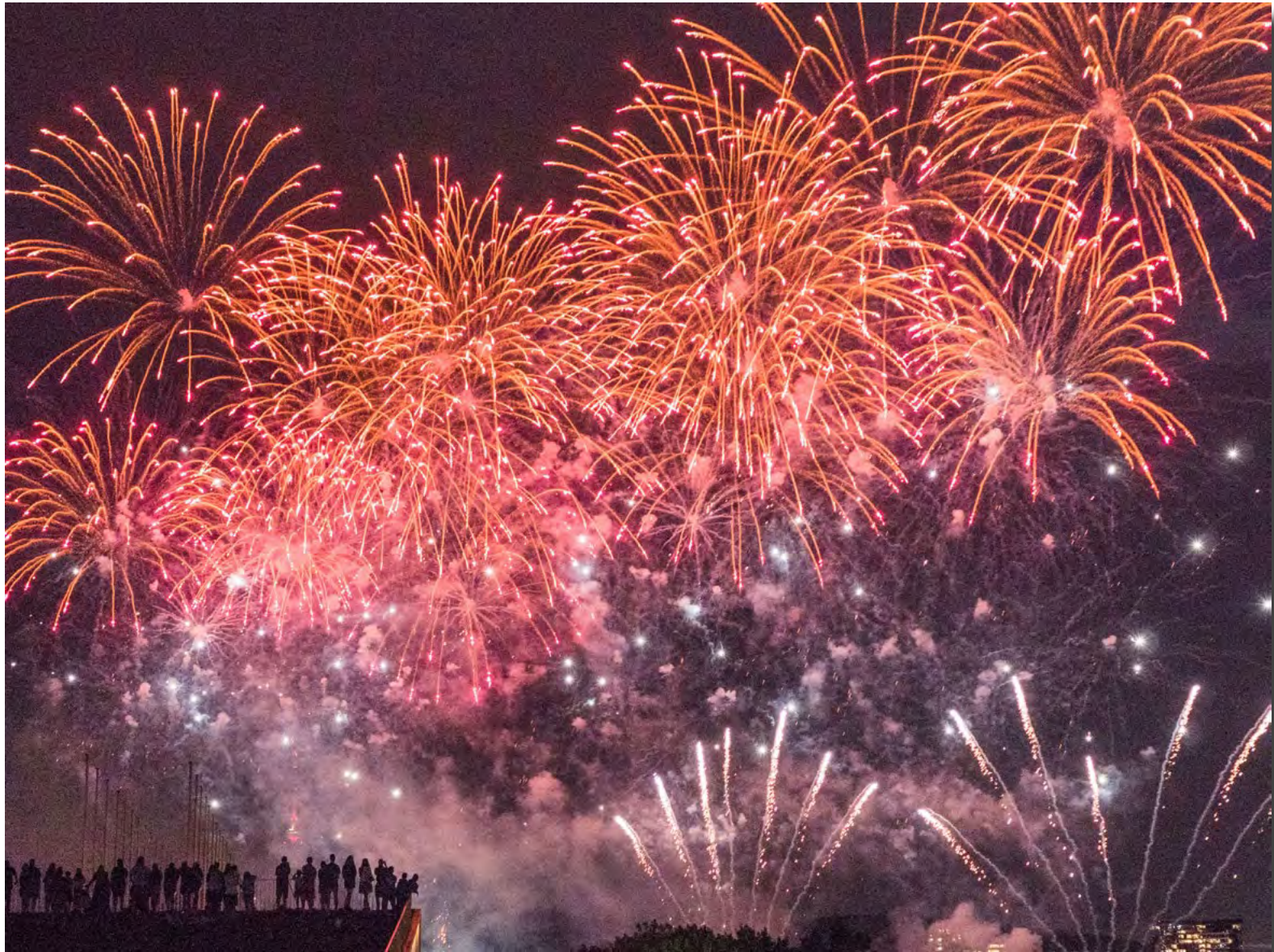
Australia Day fireworks 2018 Brian Moir