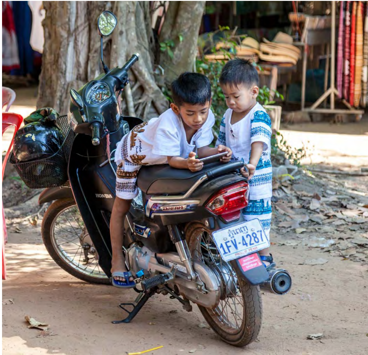
Street life in Cambodia Iain Cole