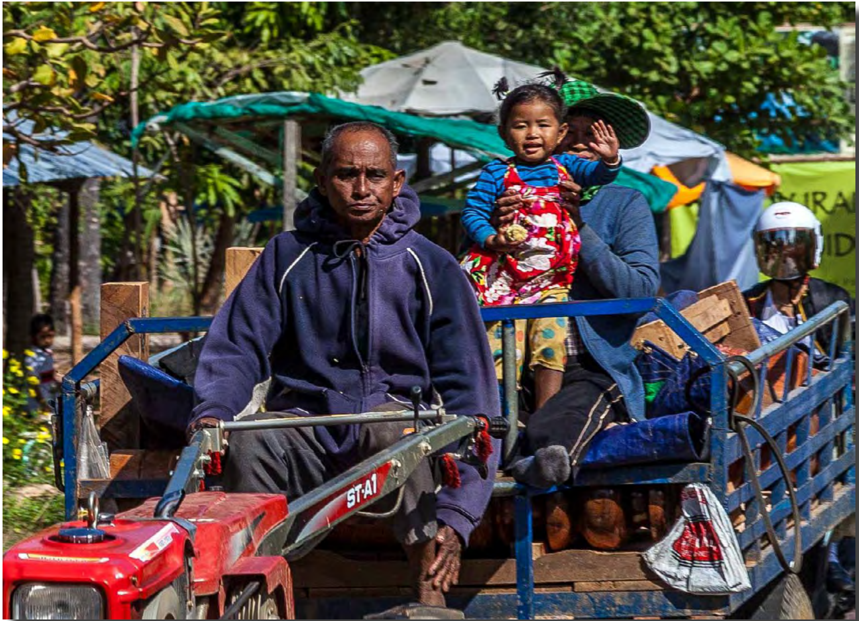
Street life in Cambodia Iain Cole