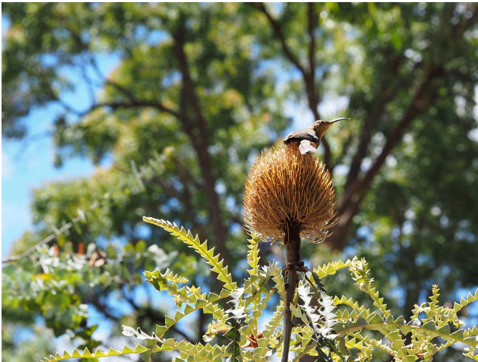
Australian National Botanic Gardens: Peter Keogh Olympus E-M1 with 60 mm macro lens