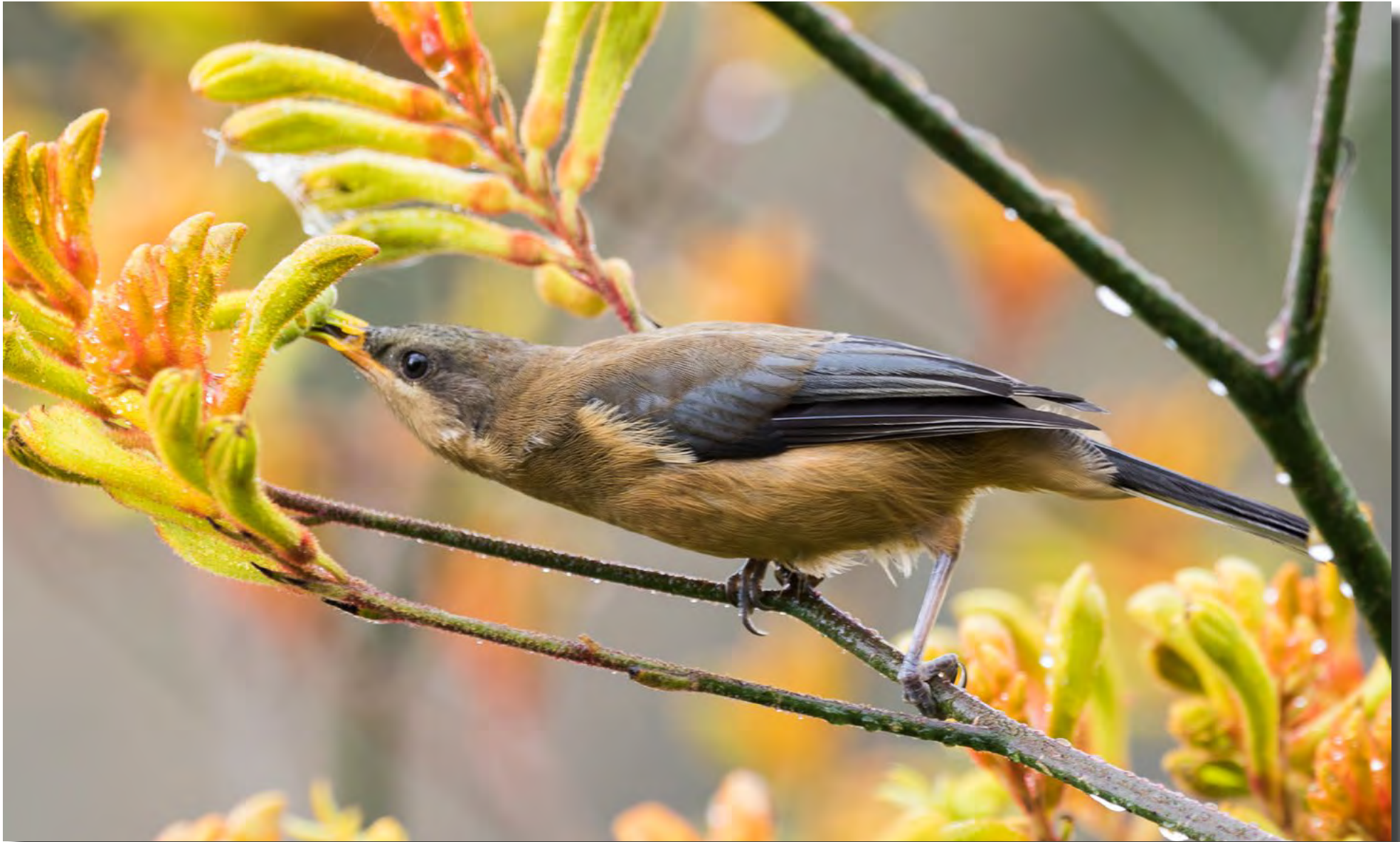
Eastern Spinebill, Australian National Botanic Gardens