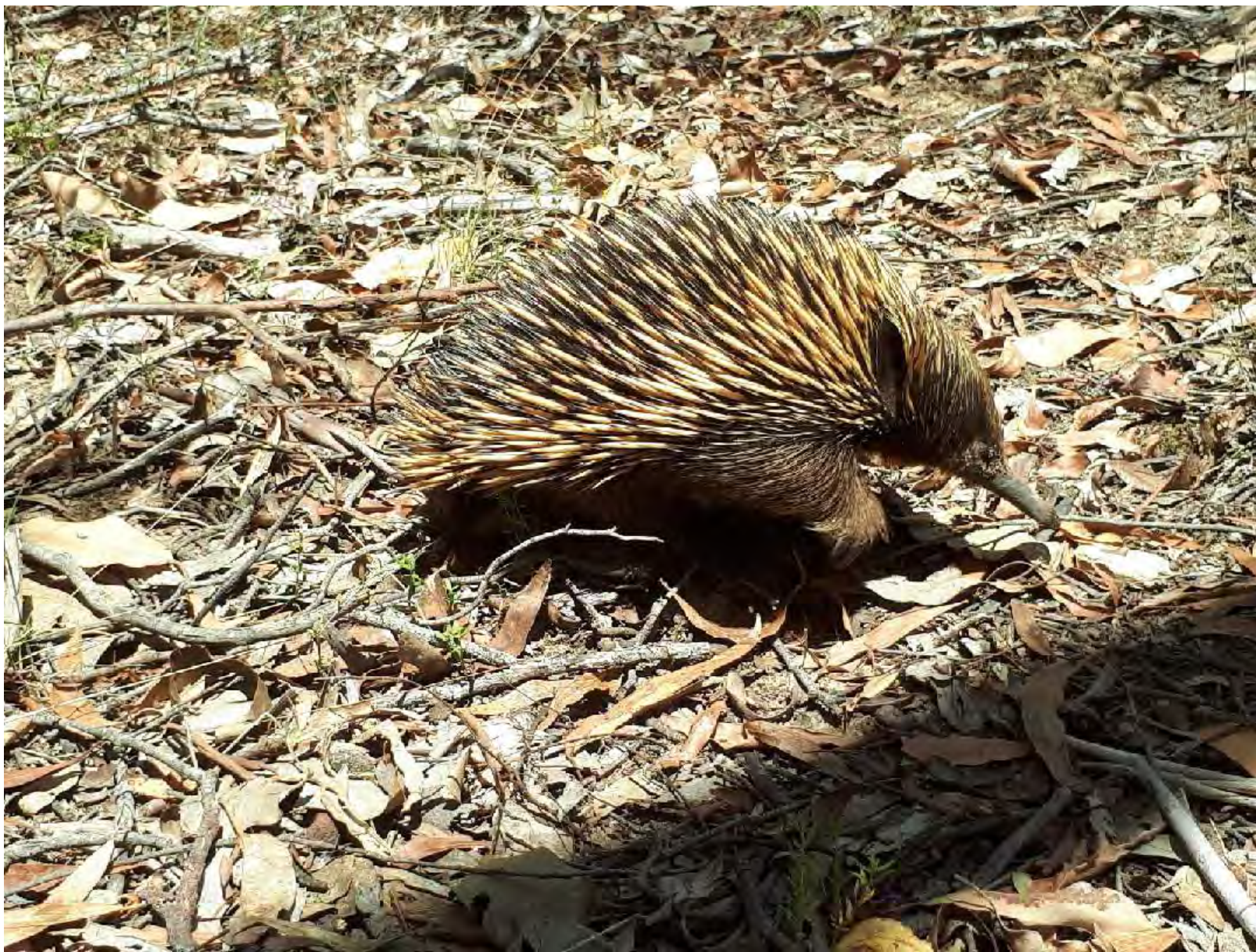
Australian National Botanic Gardens Anonymous