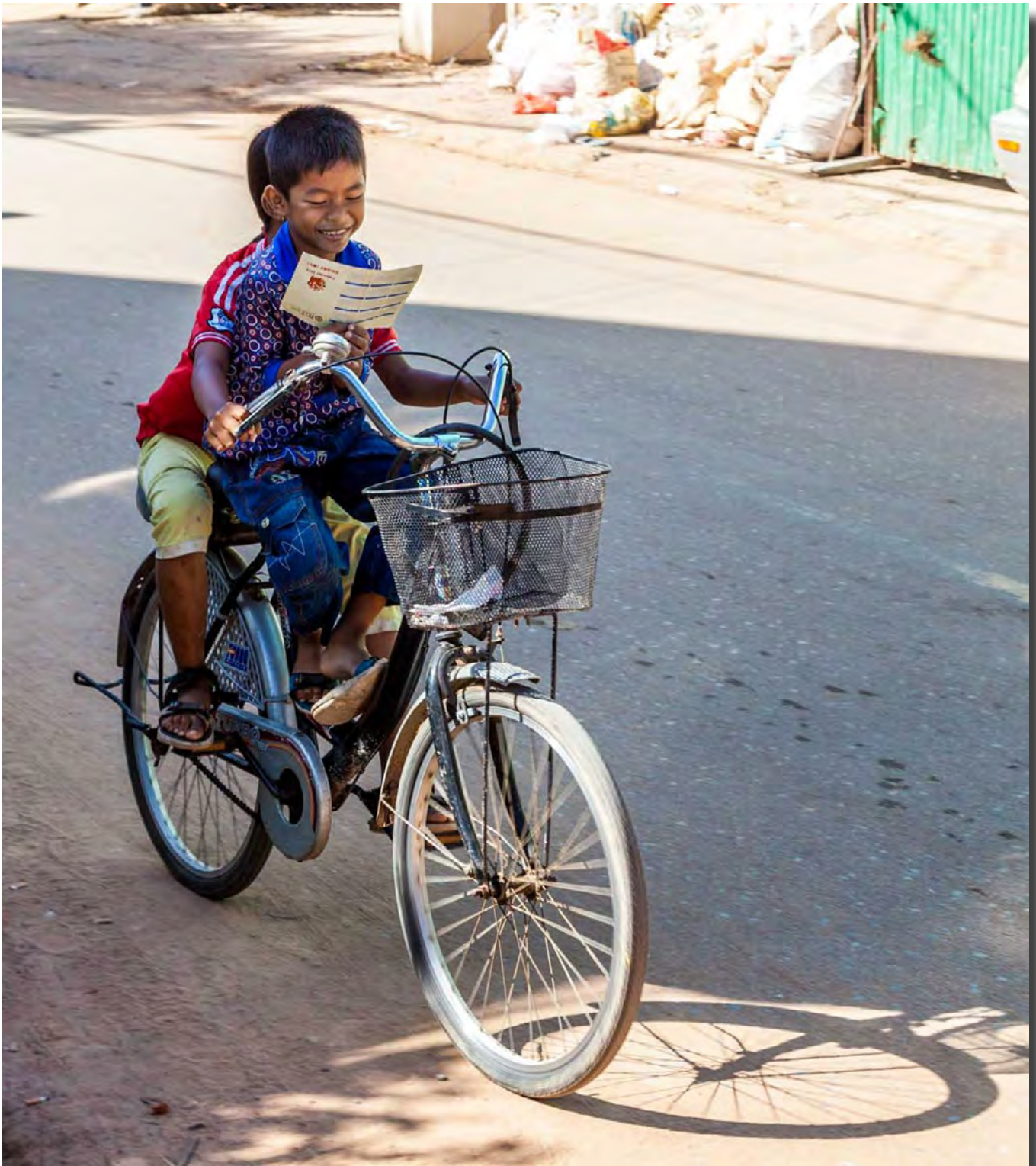
Street life in Cambodia Iain Cole