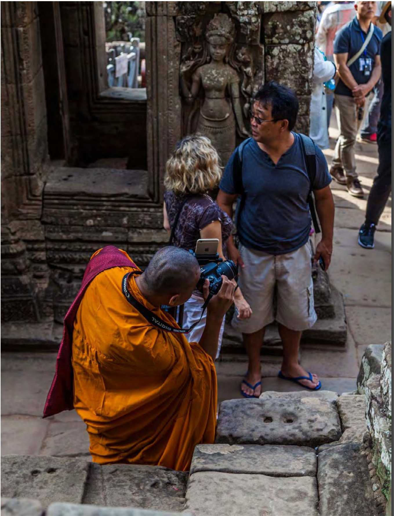
Street life in Cambodia Iain Cole