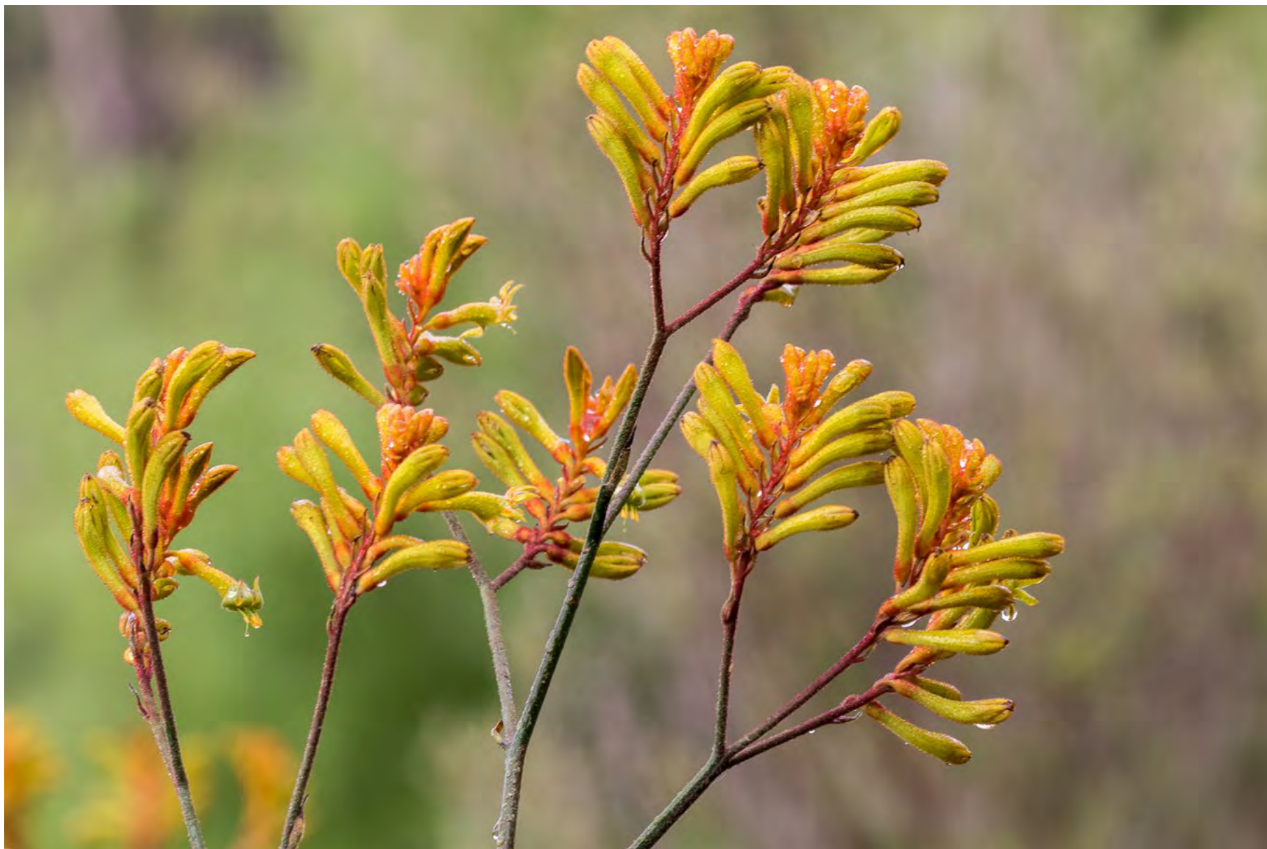
Kangaroo paw, Australian National Botanic Gardens