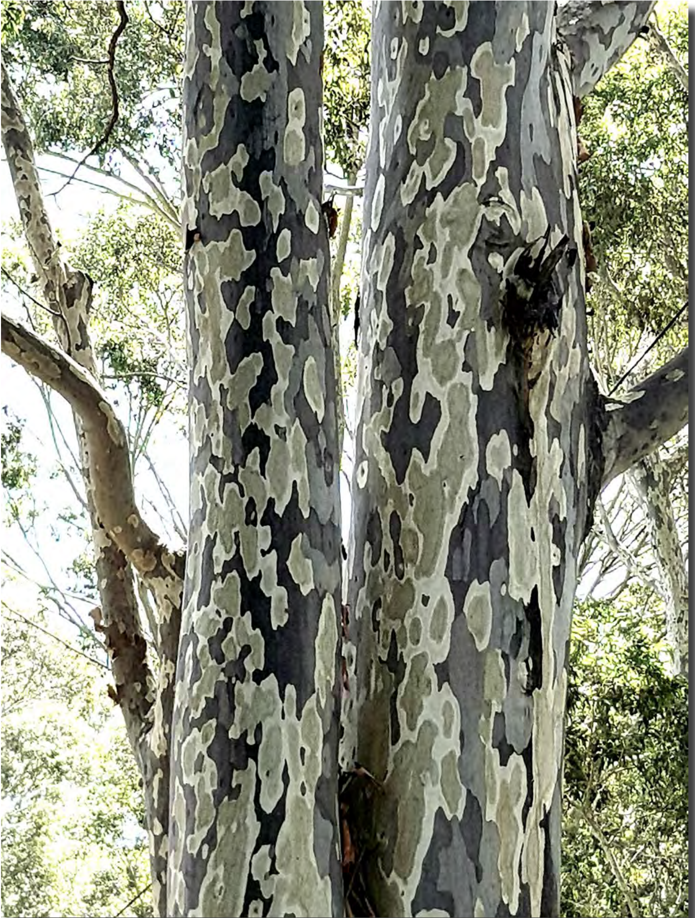
The beauty of the Spotted gum Helen Dawes