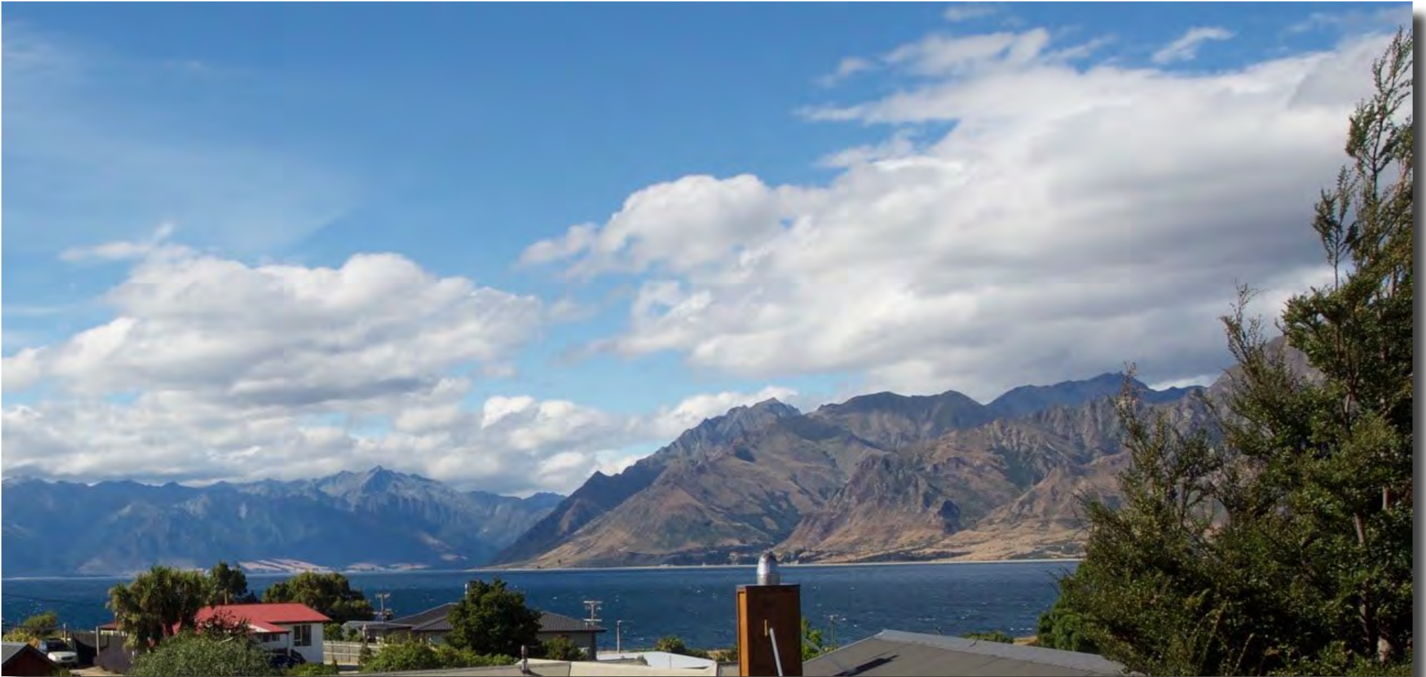
A view of Lake Hawea and its stand out backdrop Laurie Westcott