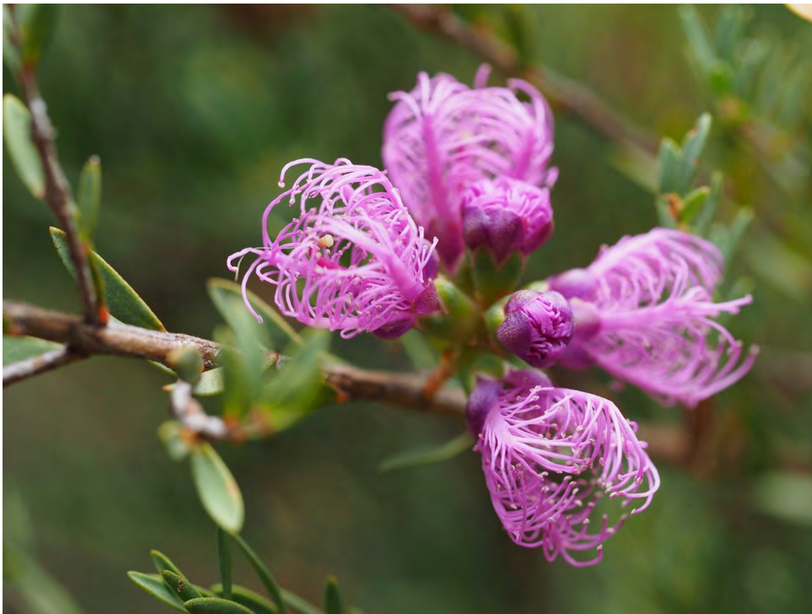
Australian National Botanic Gardens: Peter Keogh Olympus E-M1 with 60 mm macro lens