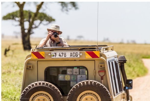
Photo tours, safaris, workshops are a booming industry and for many of us, a great way to get not only exciting photos but also to improve our knowledge and skill. However, they all come at a cost and often that means lots of hard-earned cash. Peter West Carey writing for Digital Photography

School suggests 10 questions to ask the tour operator before you sign up and pay. These questions include whether or not there is insurance cover, what is the guest-to-instructor ratio, will there be daily opportunities to review the day's shoot, what is the cancellation and refund policy and more... All very sensible questions