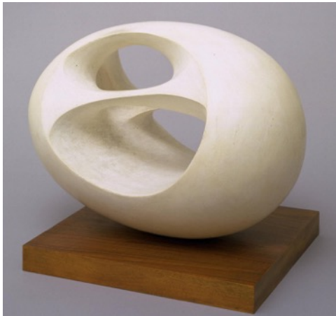
Dame Barbara Hepworth: 'Oval Sculpture (No. 2)', 1943, cast 1958

Less obvious, however, is the role that negative space can play in creating the composition. No artist knows this better than sculptors for whom negative space is often a prominent part of their work.