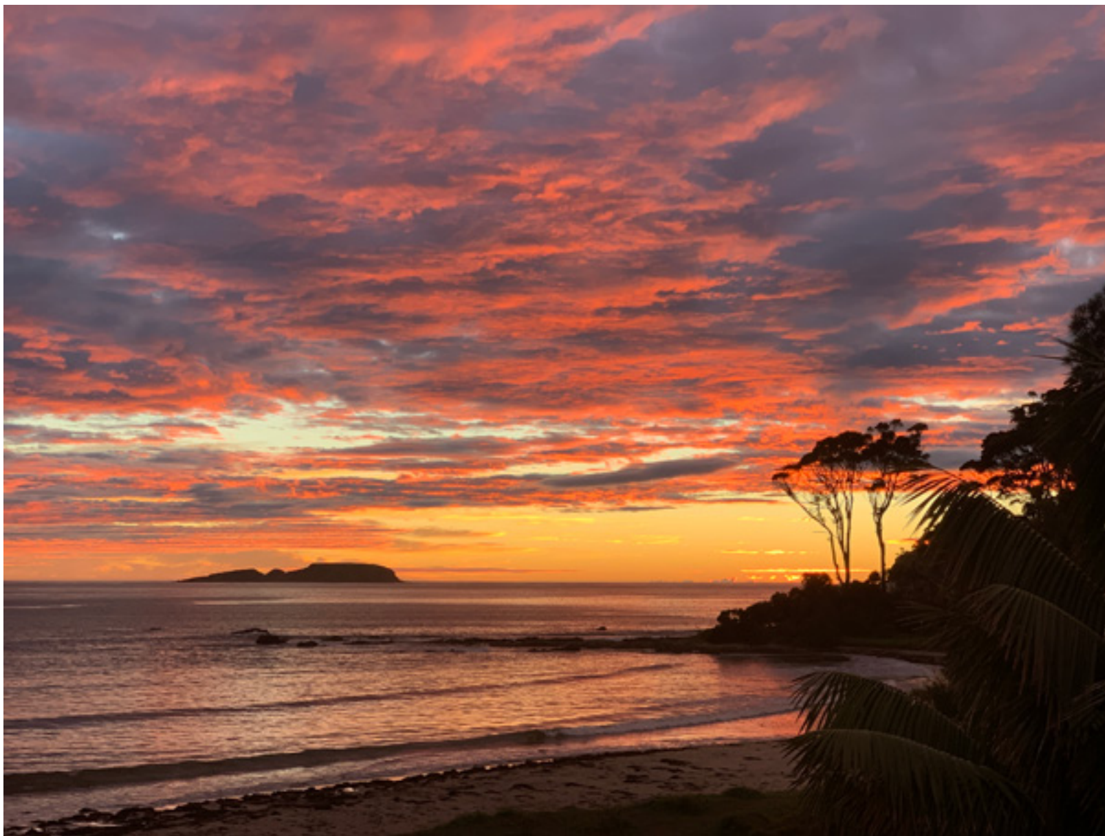
Sunrise over the Tollgates