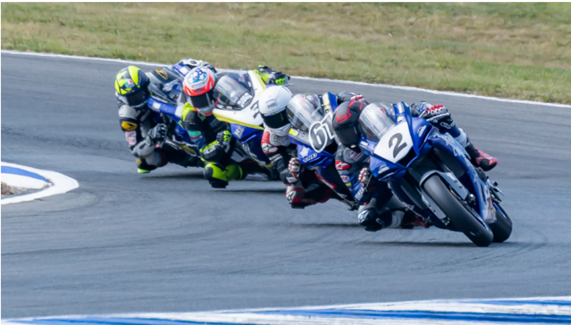
80-400mm @ 400mm; f/5.6; 1/1000 sec; ISO 400 Mark Stevenson