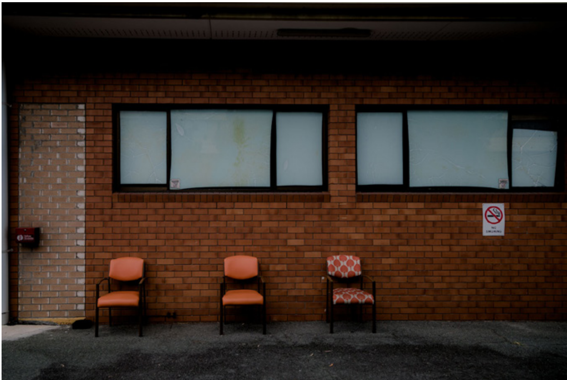
The Smoker' lounge, back alley, Strathpine Iain Cole