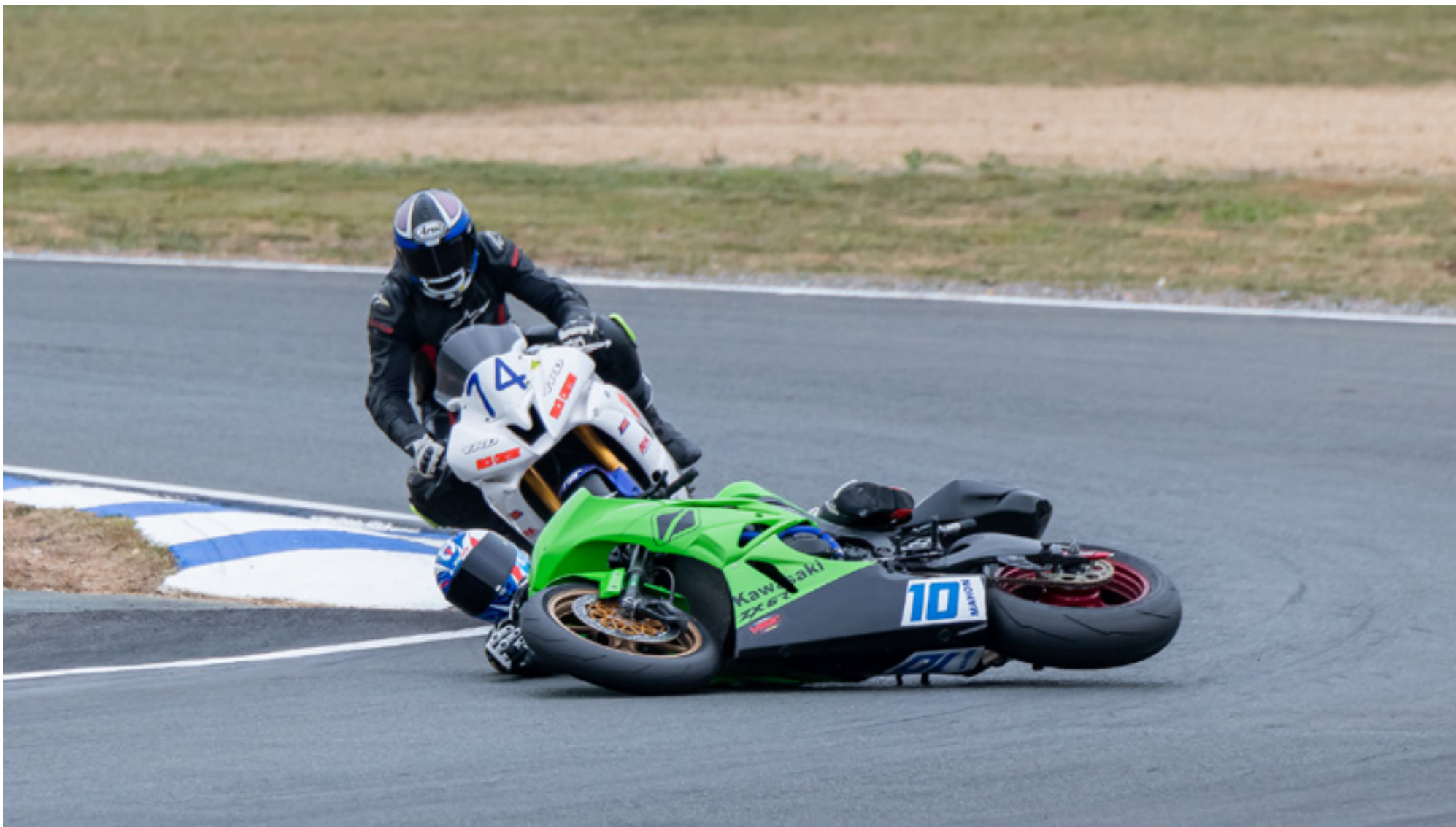
80-400mm @ 400mm; f/5.6; 1/1250 sec; ISO 640 Mark Stevenson