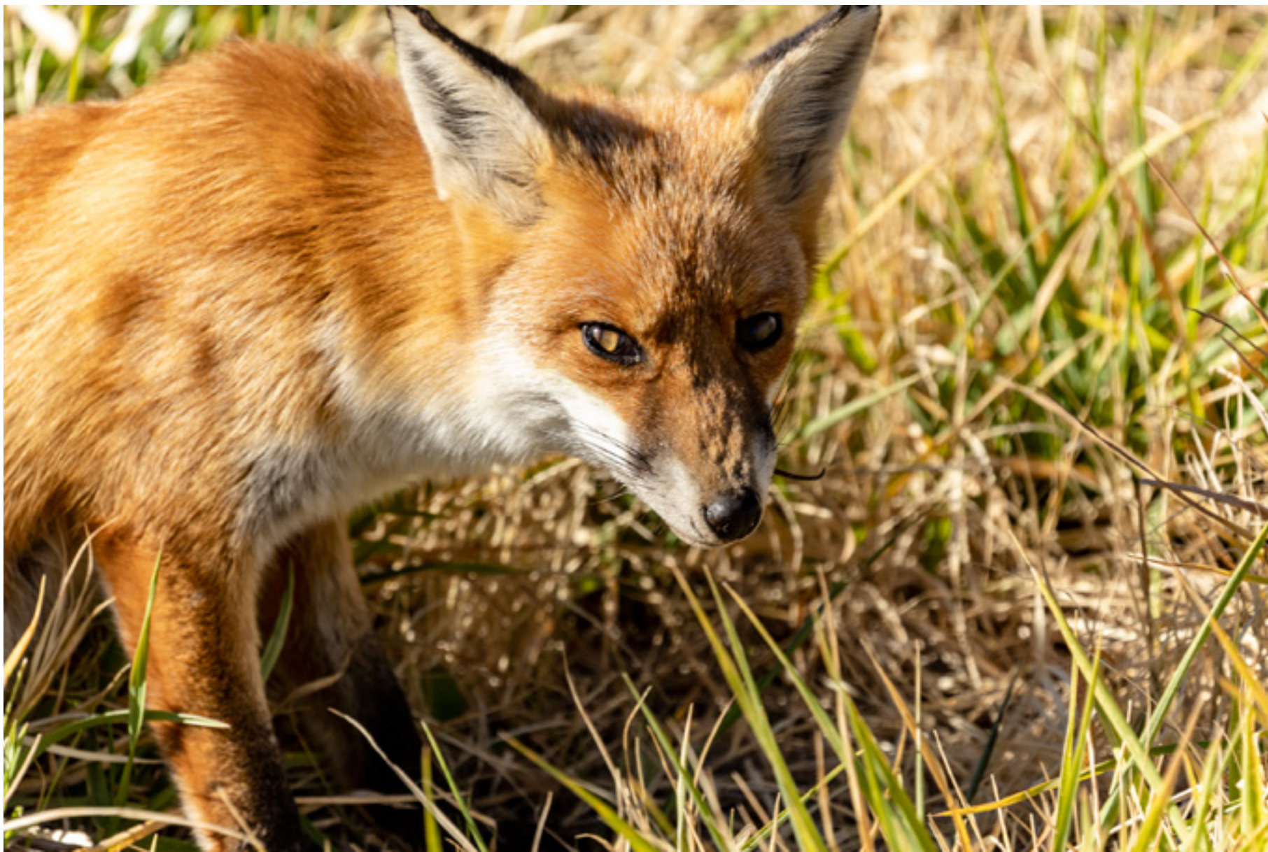
Fox, Jerrabomberra Wetlands