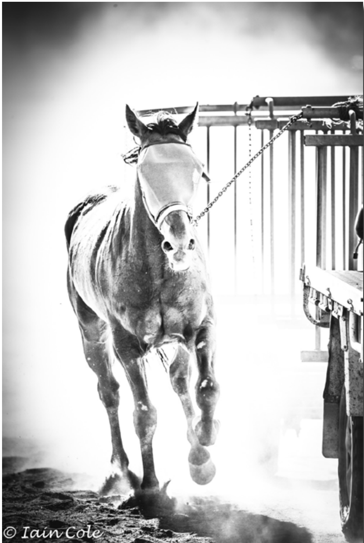
Early morning training, Goondiwindi showground Iain Cole