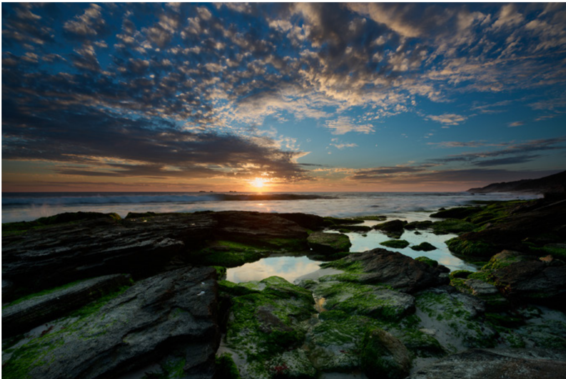
Sunset, Burns Beach Shane Baker