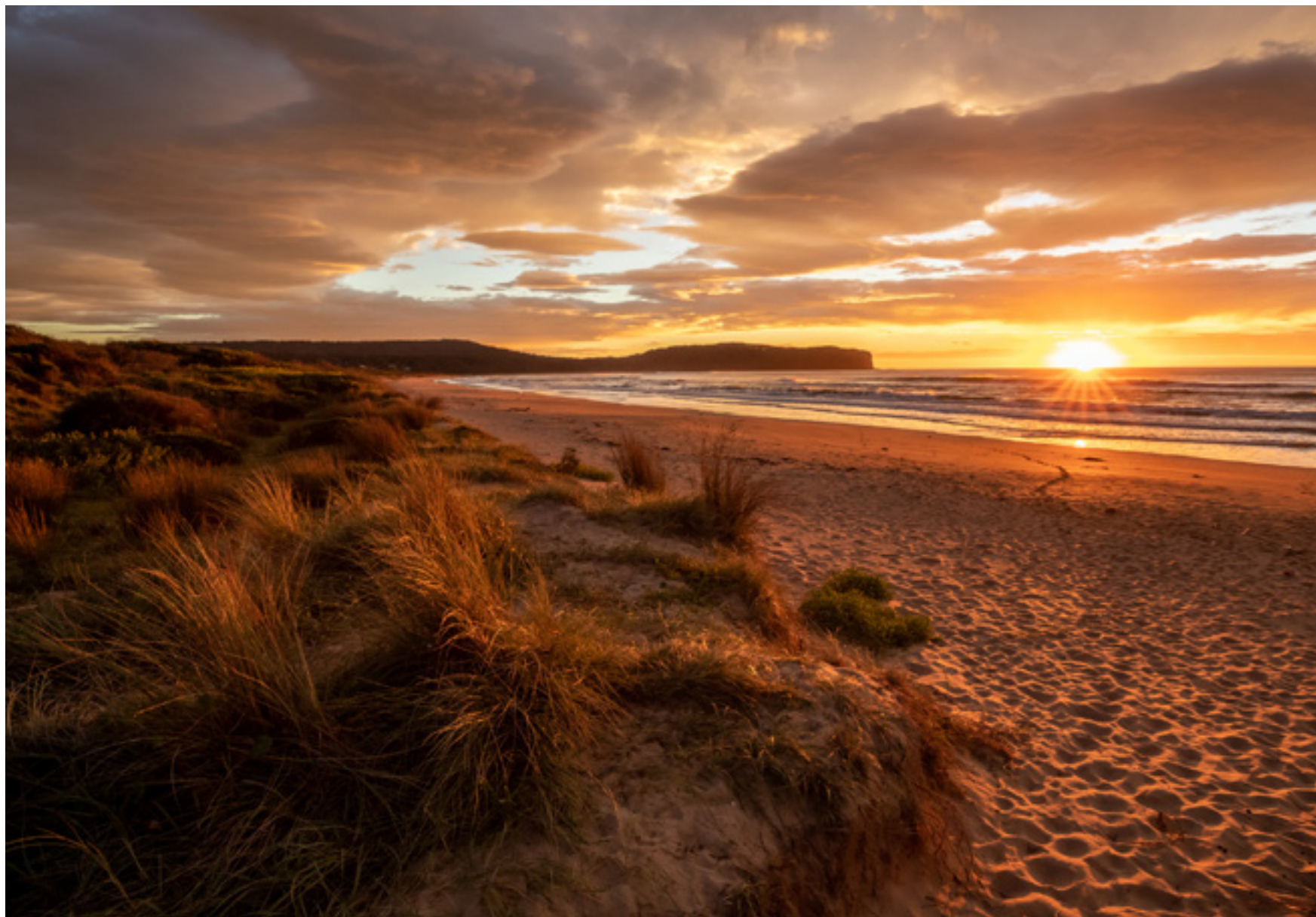
First light, Durras Rod Burgess