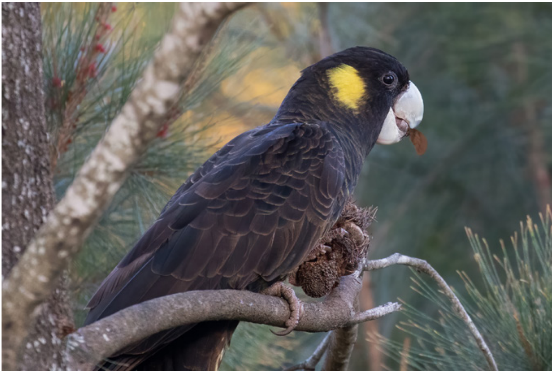
Yellow-tailed black Cockatoo eating Banksia seeds Rod Burgess