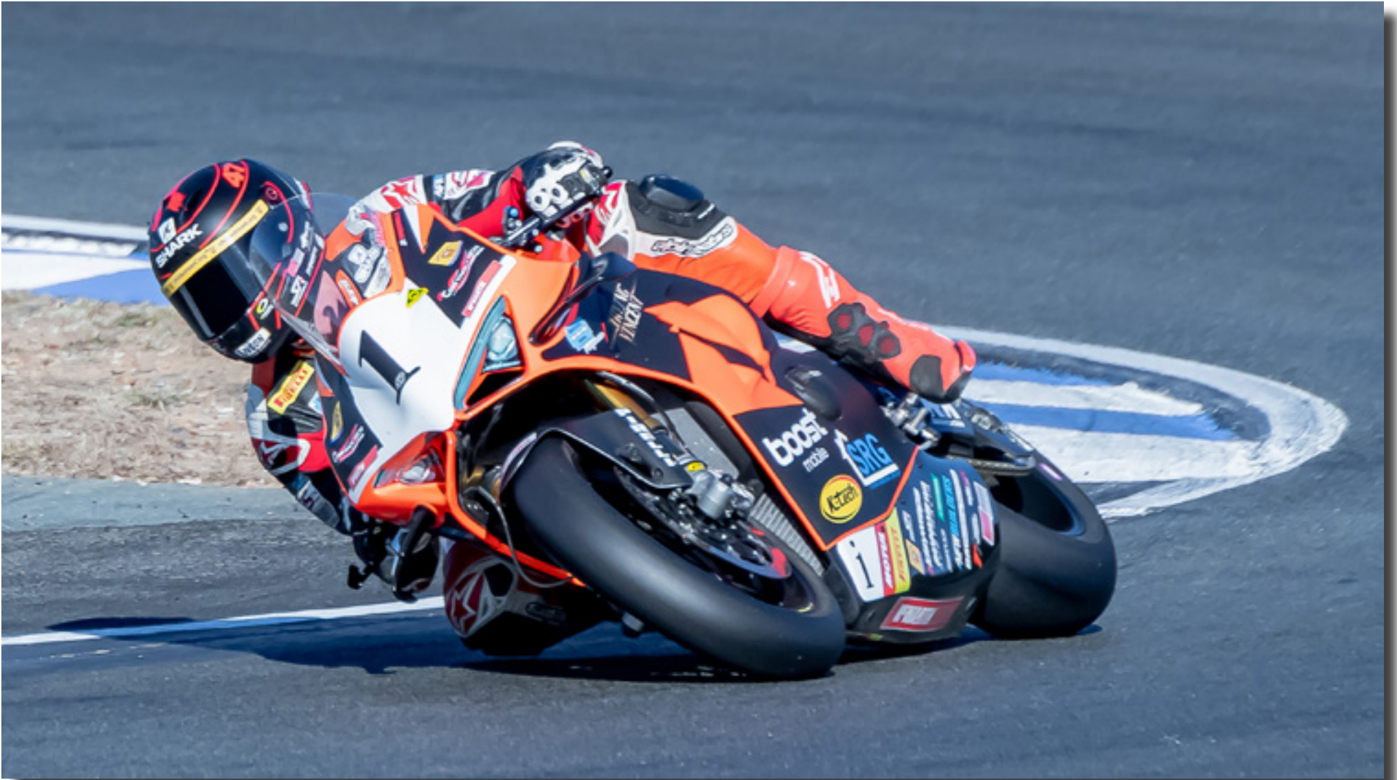
80-400mm @ 400mm; f/5.6; 1/2500 sec; ISO 640 Mark Stevenson