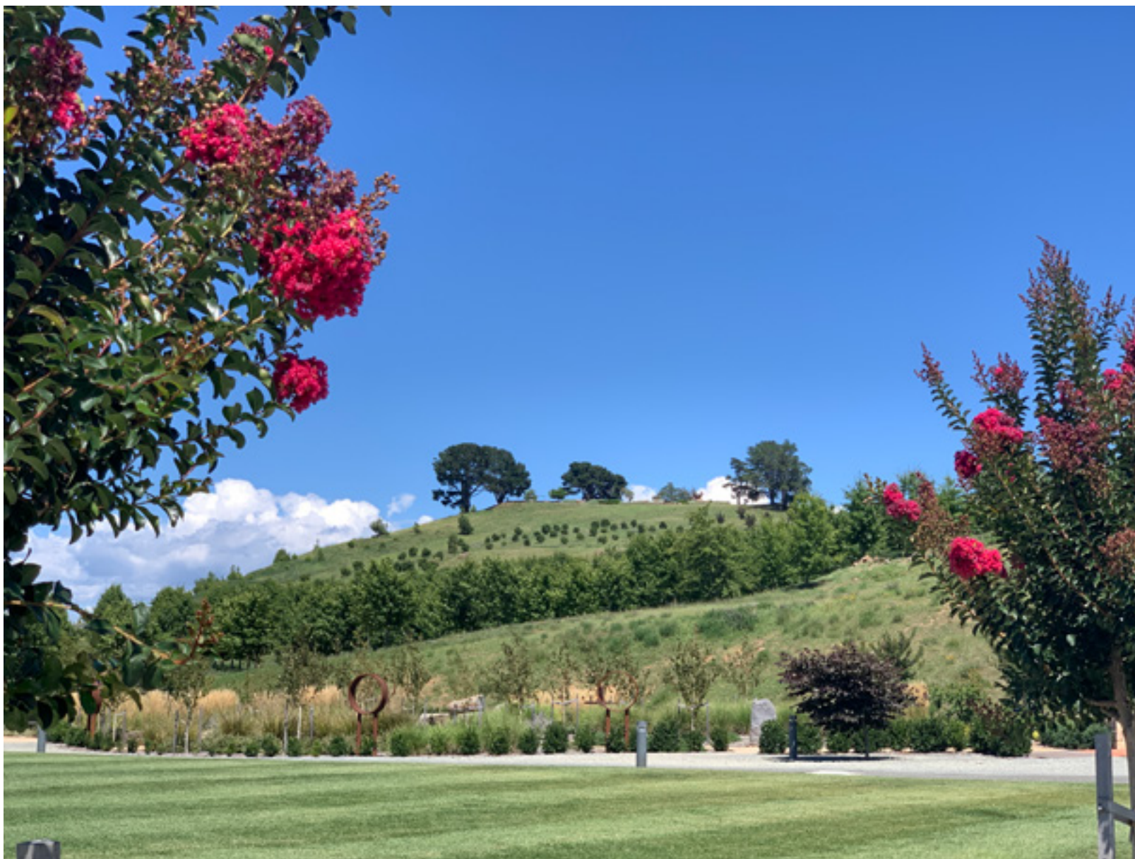
Towards Dairy Farmers Hill, National Arboretum