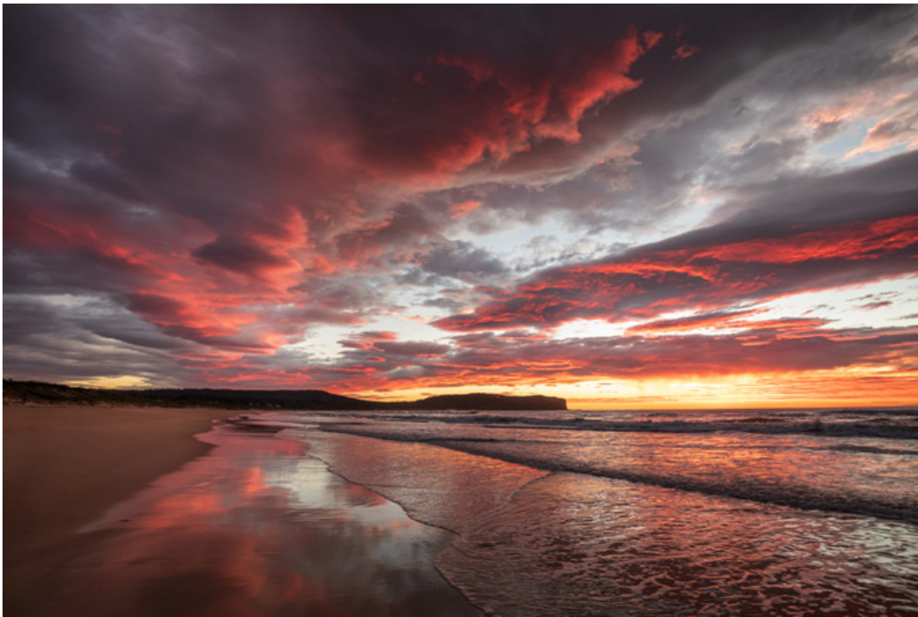
Streaming clouds, South Durras Rod Burgess