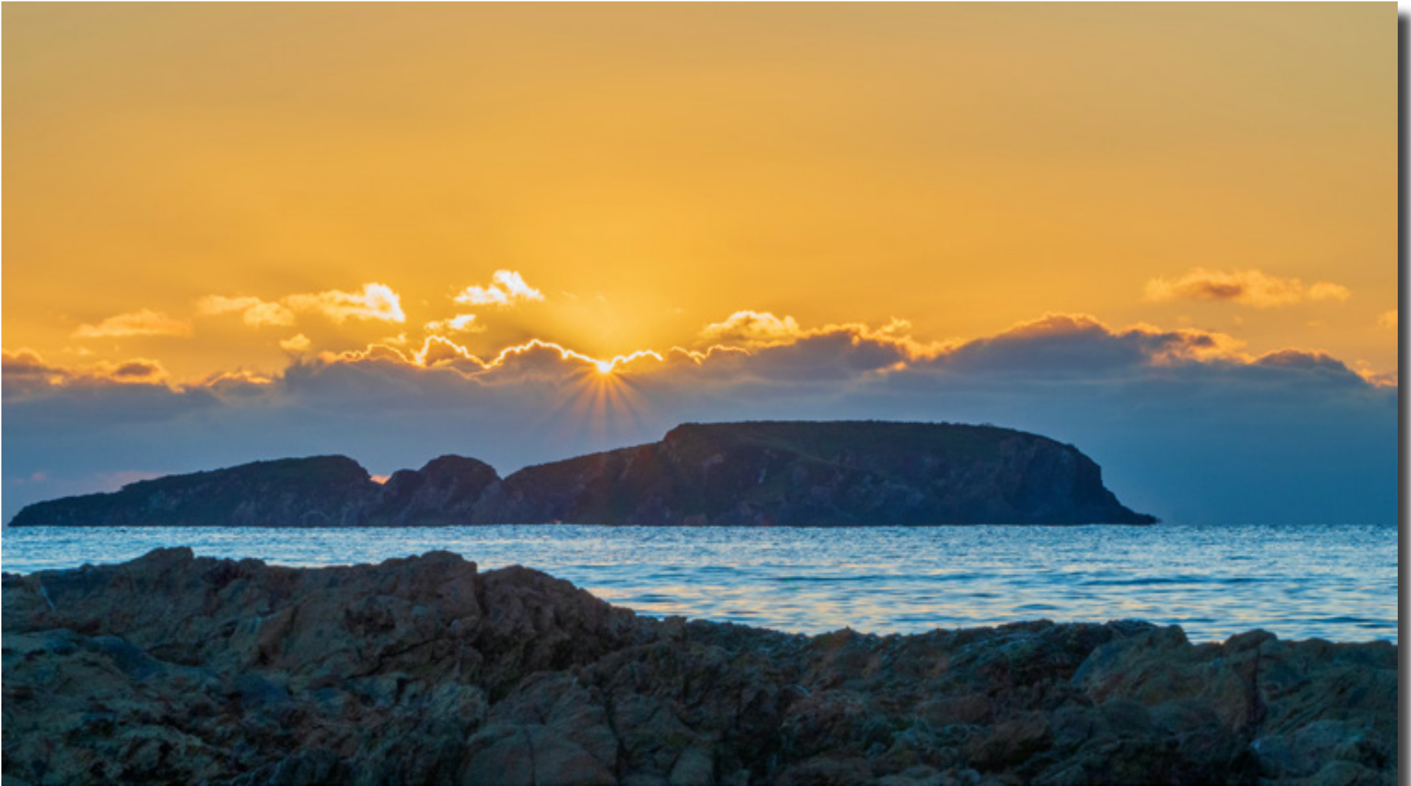
Sunrise over the Tollgates