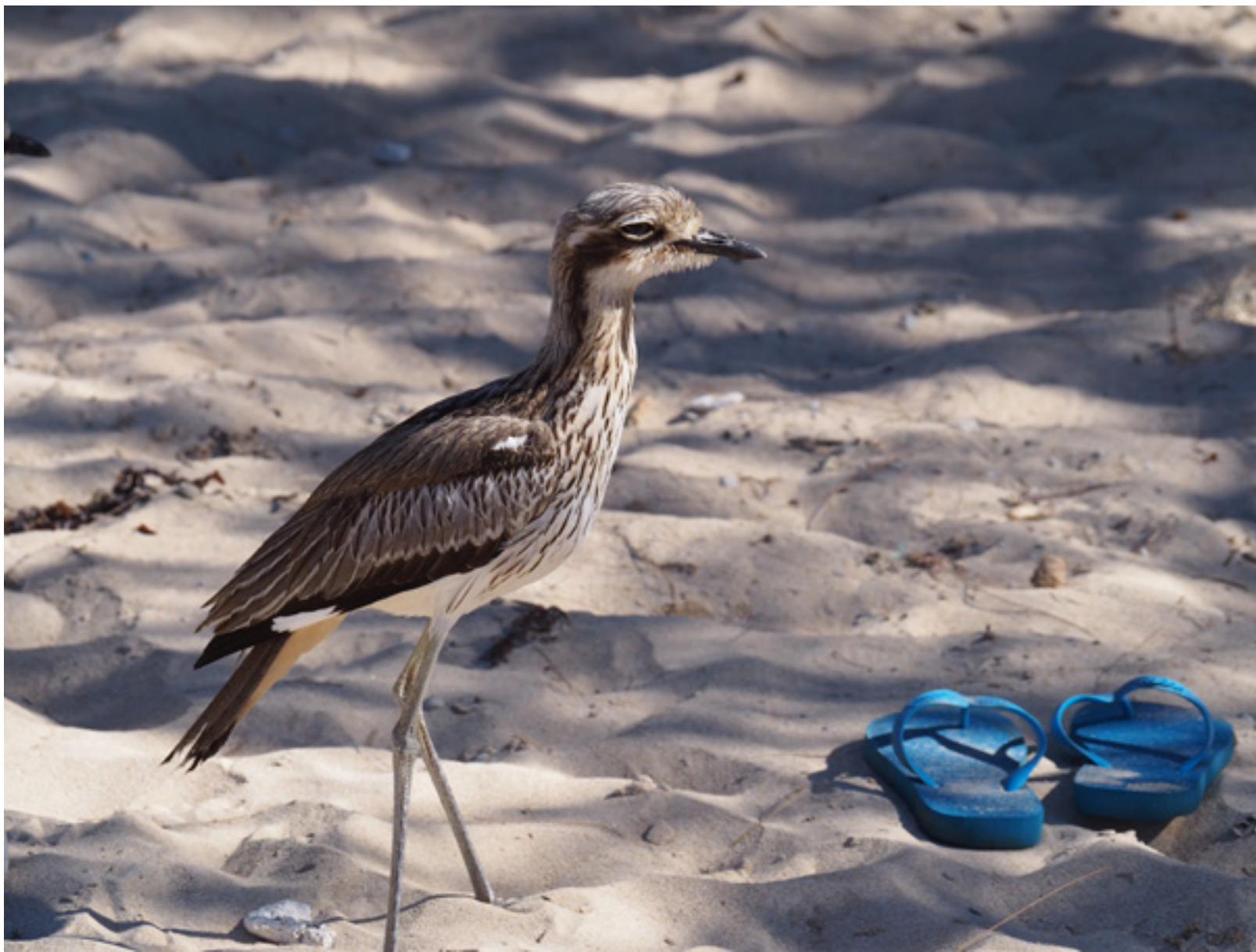
Curlew with thongs Derek Trow