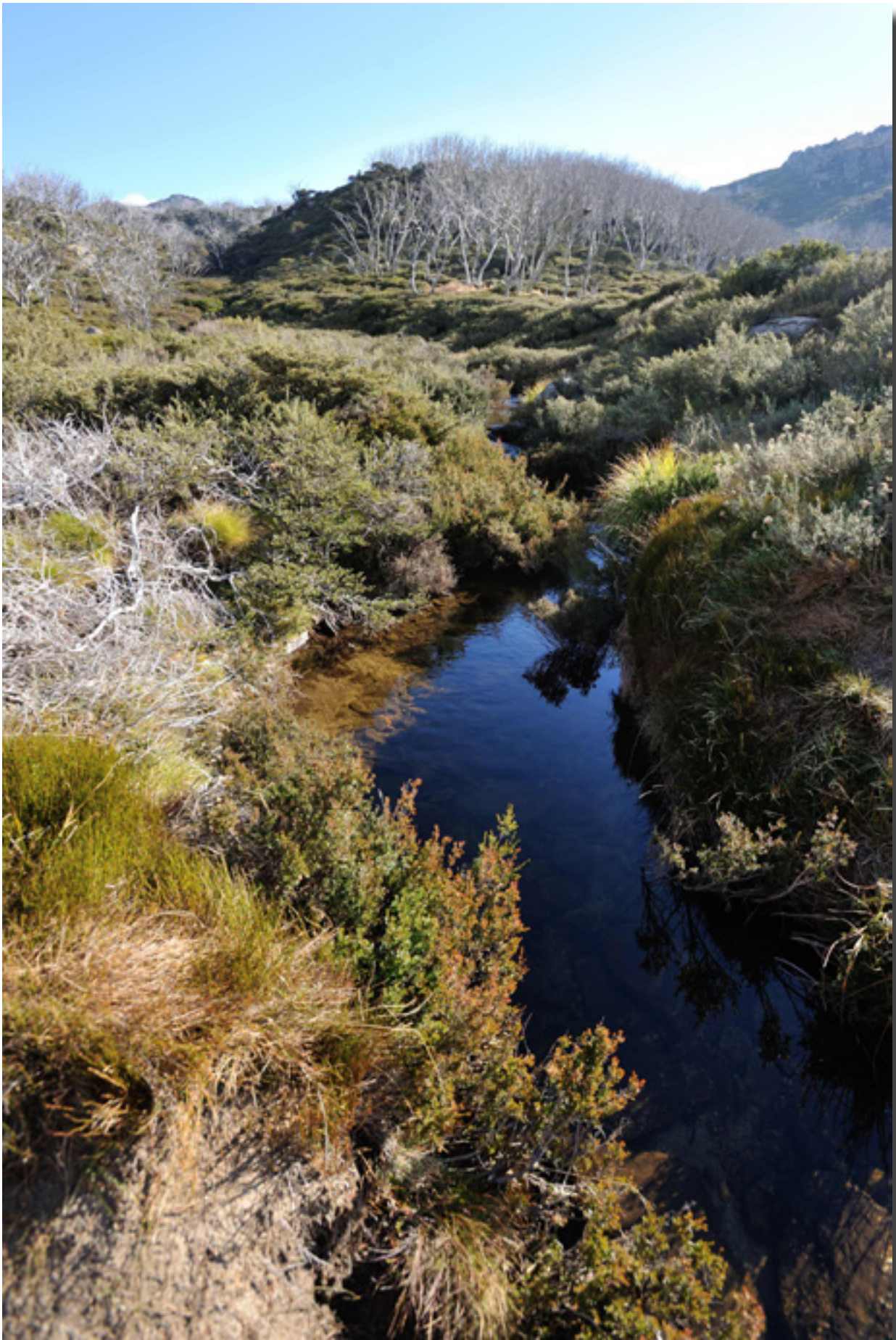
Whites River Giles West