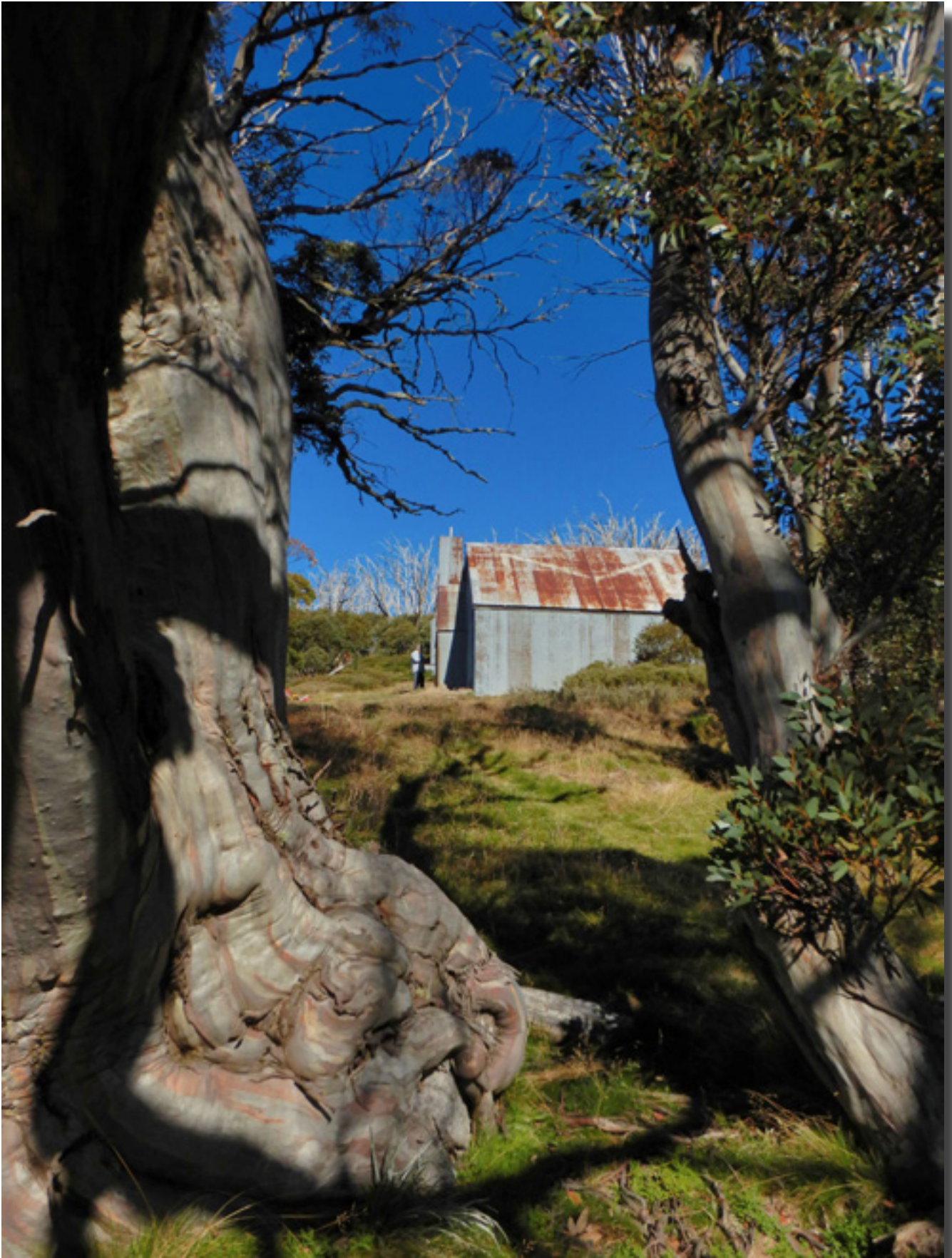
Mawson Hut and snow gums