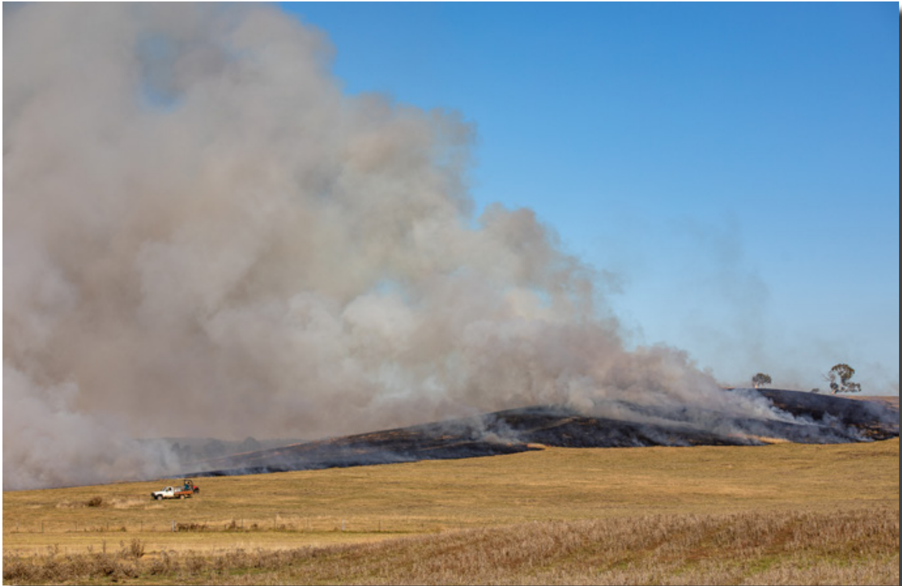
Hazard burn Luminita Lenuta