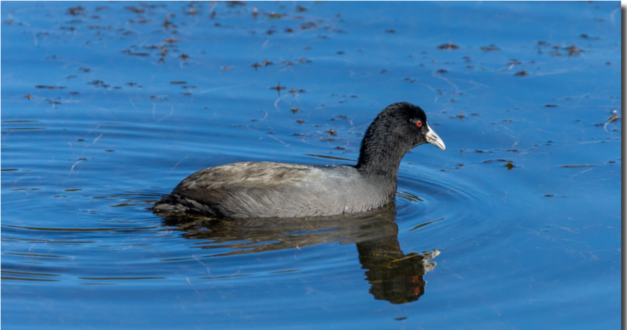
Eurasian Coot, Isabella Ponds