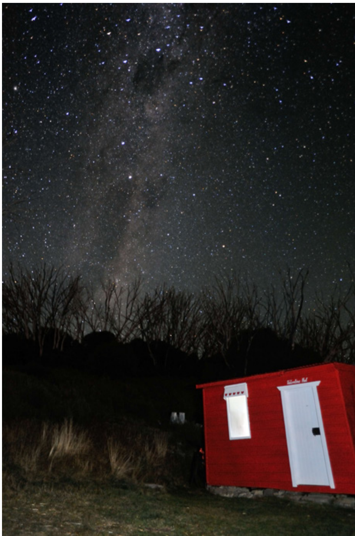
Valentine Hut Giles West