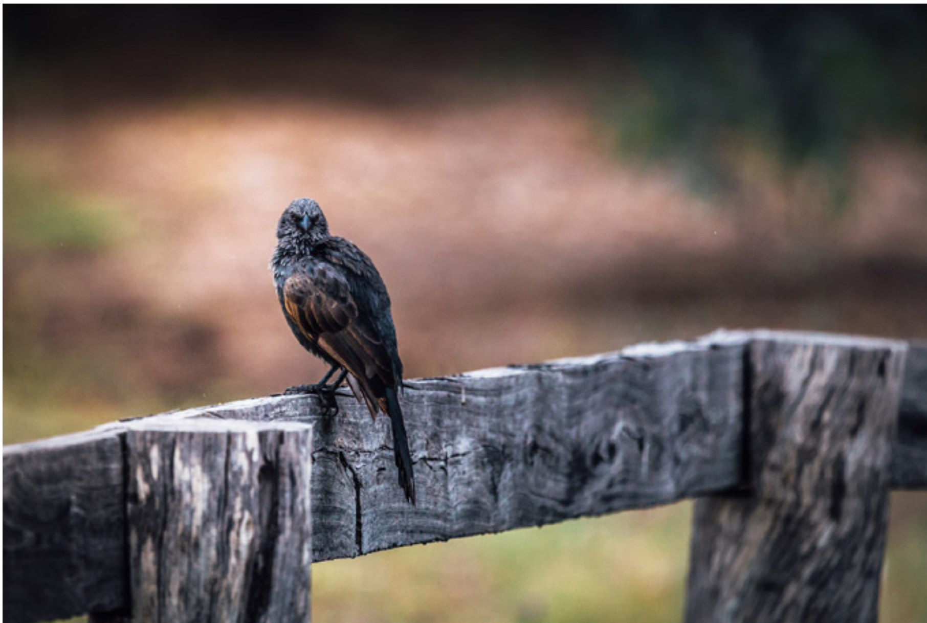
I'm watching you, Apostle bird Iain Cole