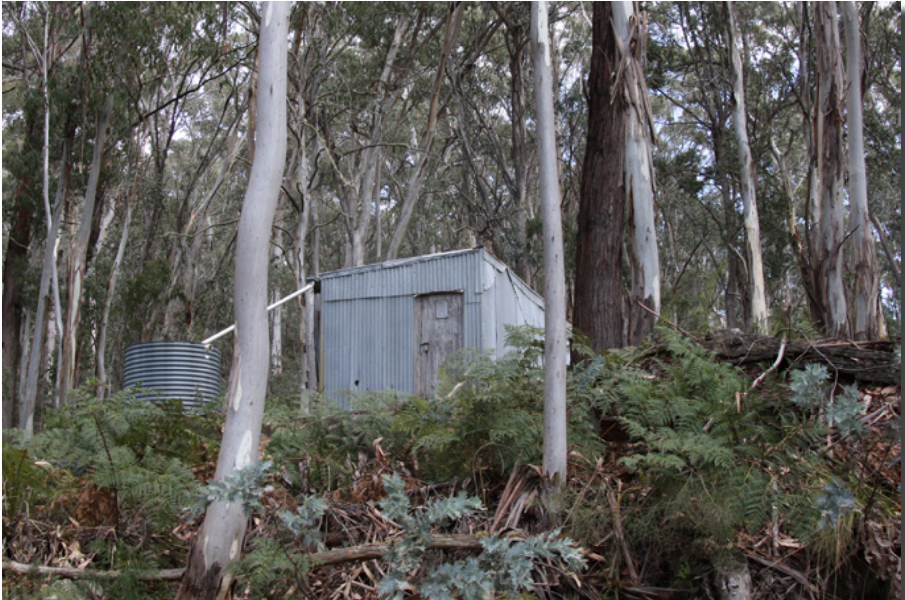
Bendora Hut, Bendora Arboretum