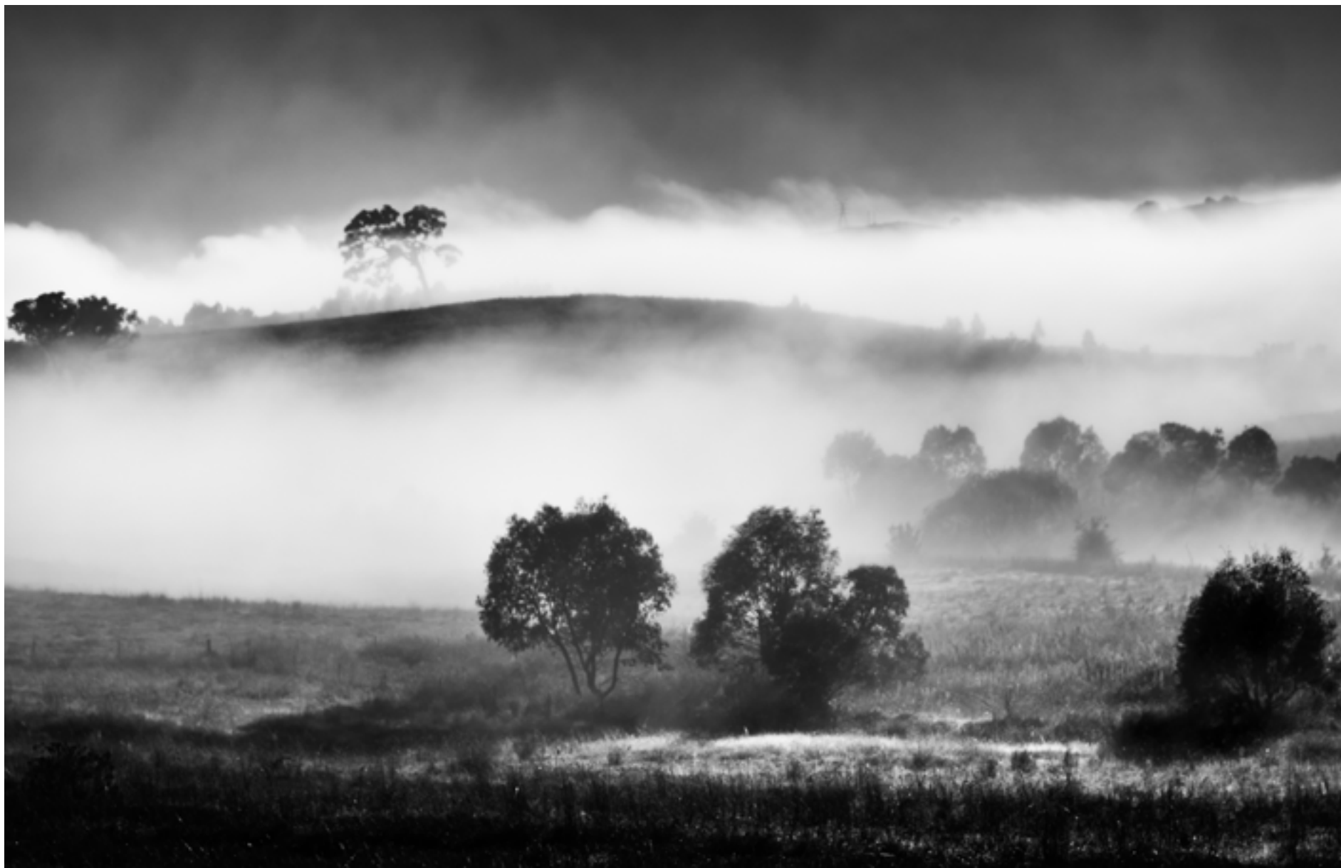
Autumn fog at Uriarra