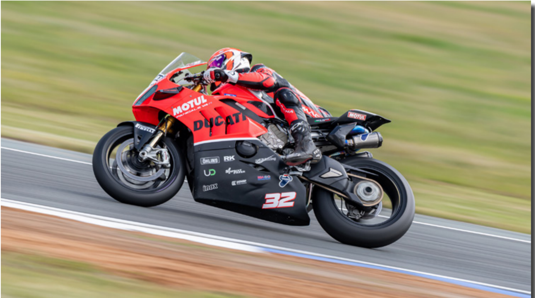
80-400mm @ 350mm; f/7.1; 1/200 sec; ISO 125 Mark Stevenson