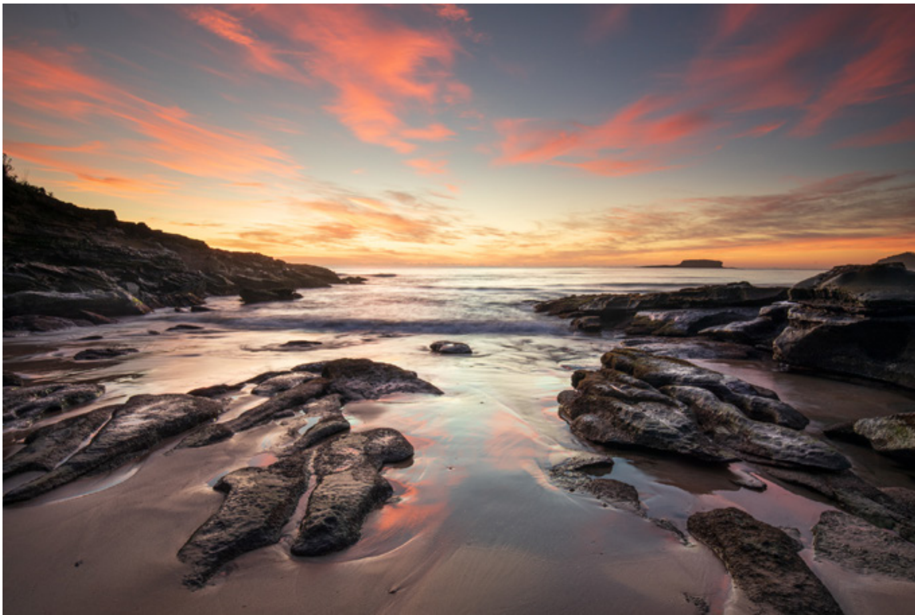
Low ride sunrise on Cookies Beach Rod Burgess