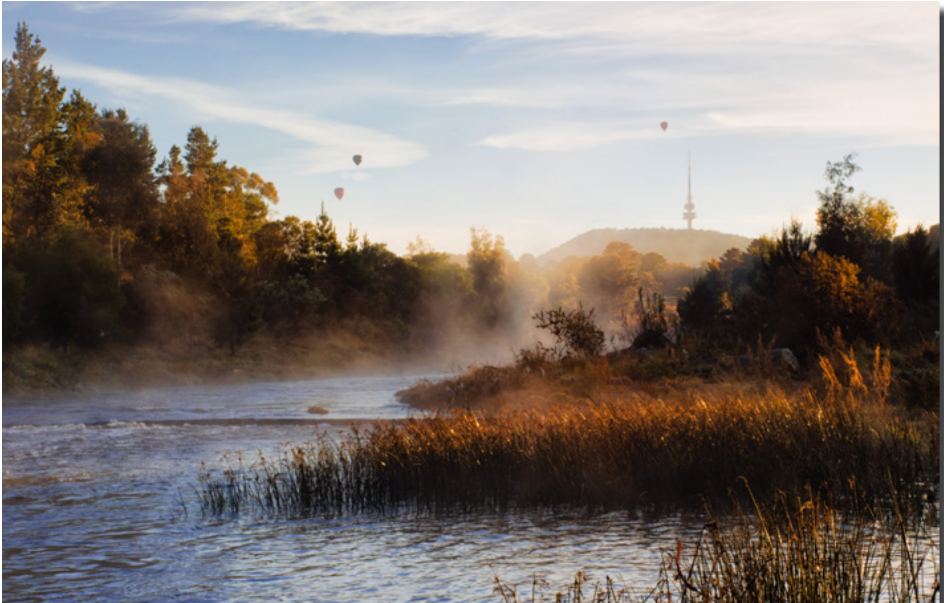
Misty Molonglo