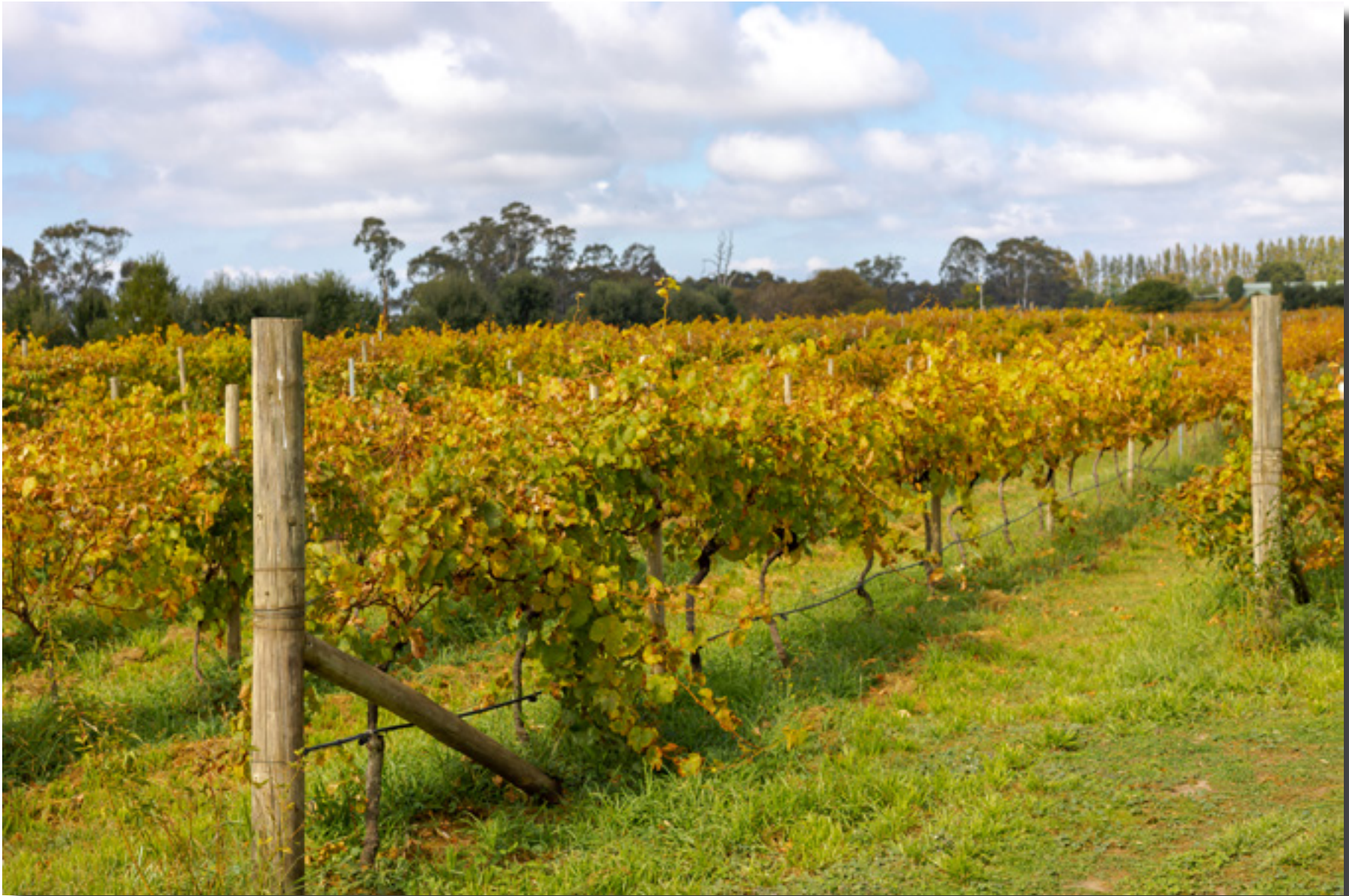
Lake George winery Luminita Lenuta