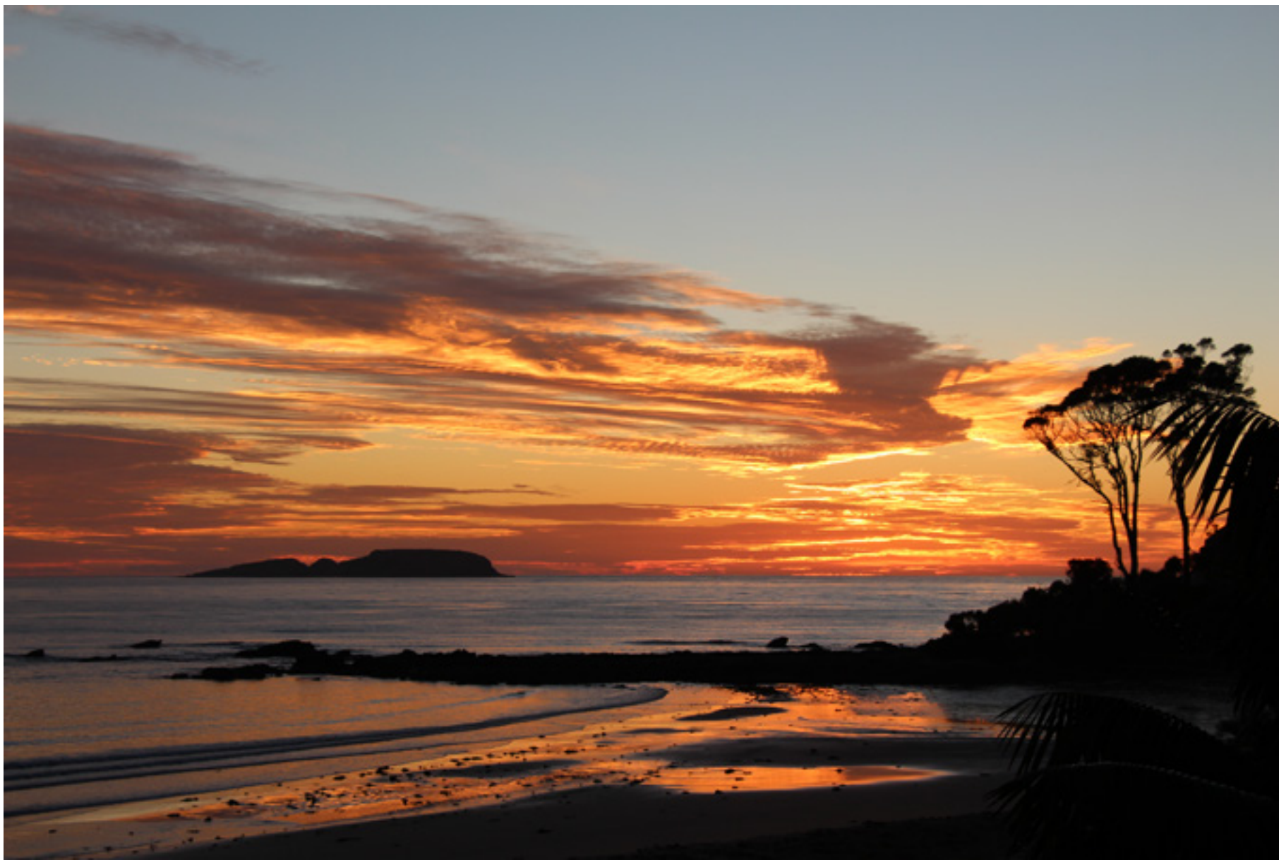
Sunrise over the Tollgates