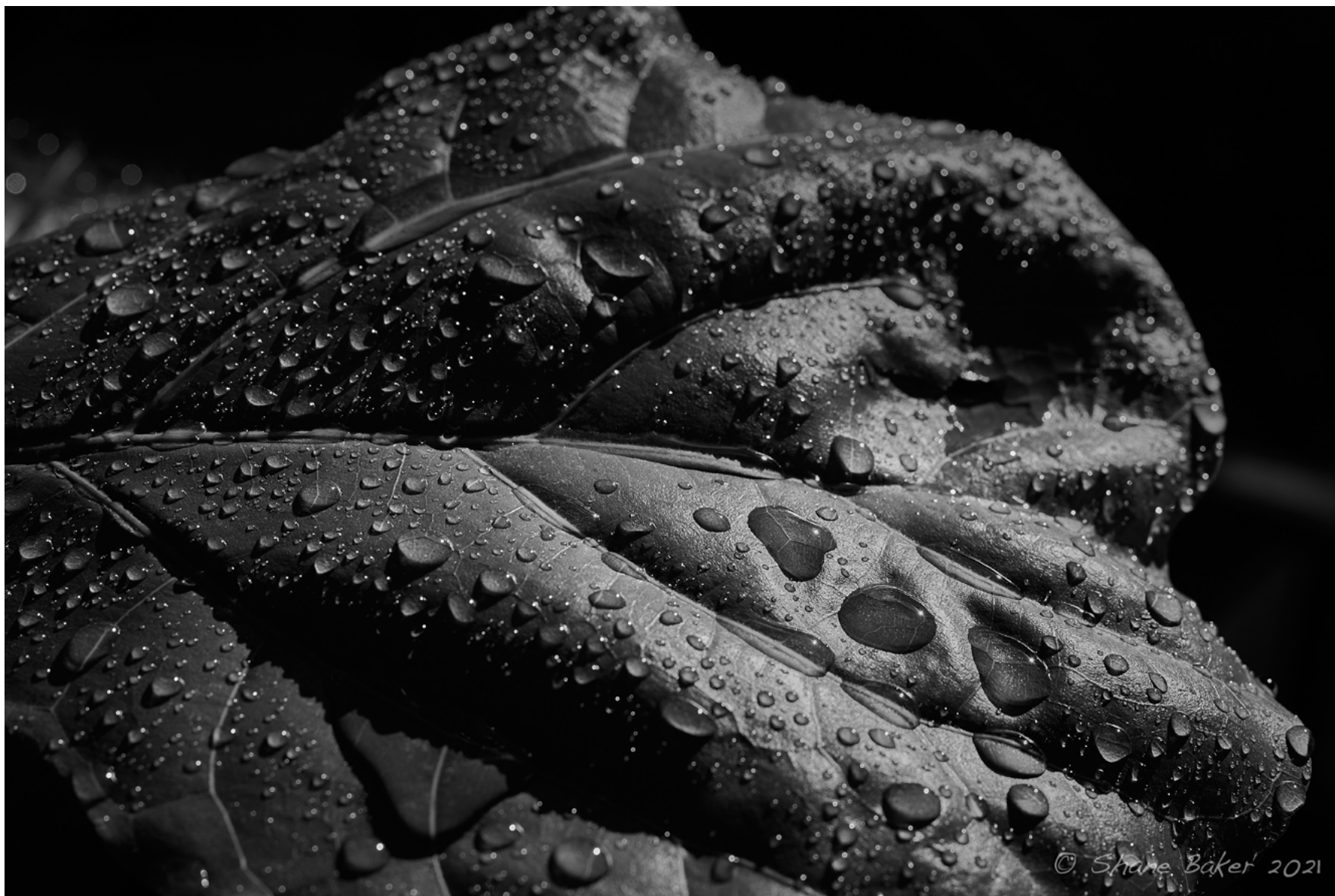
Rain drops and leaf Nikon Z6 II with Nikkor Z 50mm f/1.8 S at 1/400sec, f/5.6 and ISO 100