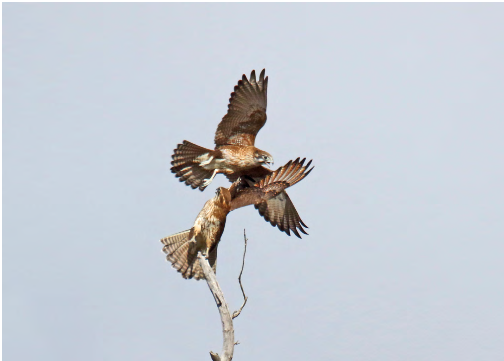
Dispute between Brown Falcons Diane Cutting