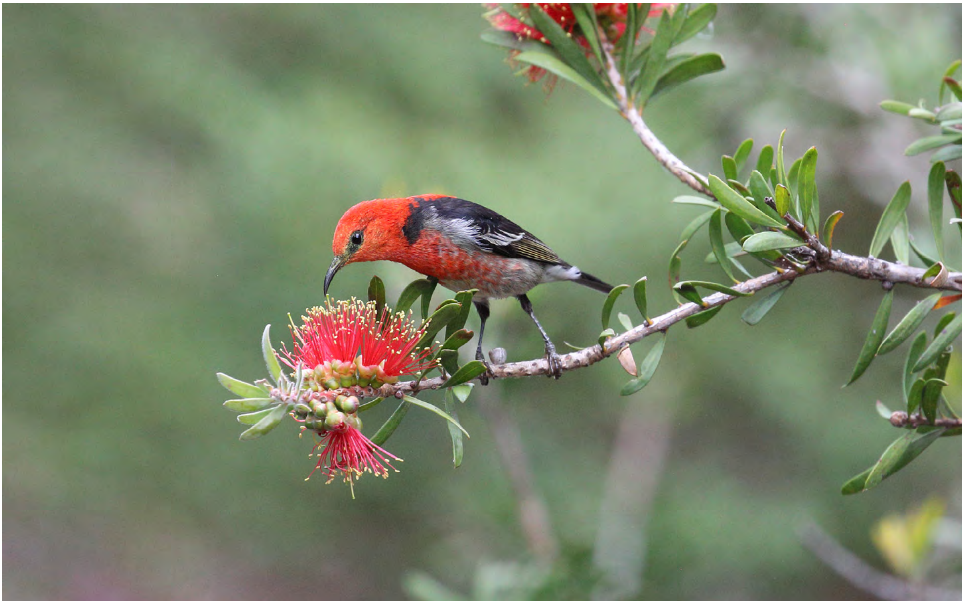
Scarlet Honeyeater, Australian National Botanic Gardens