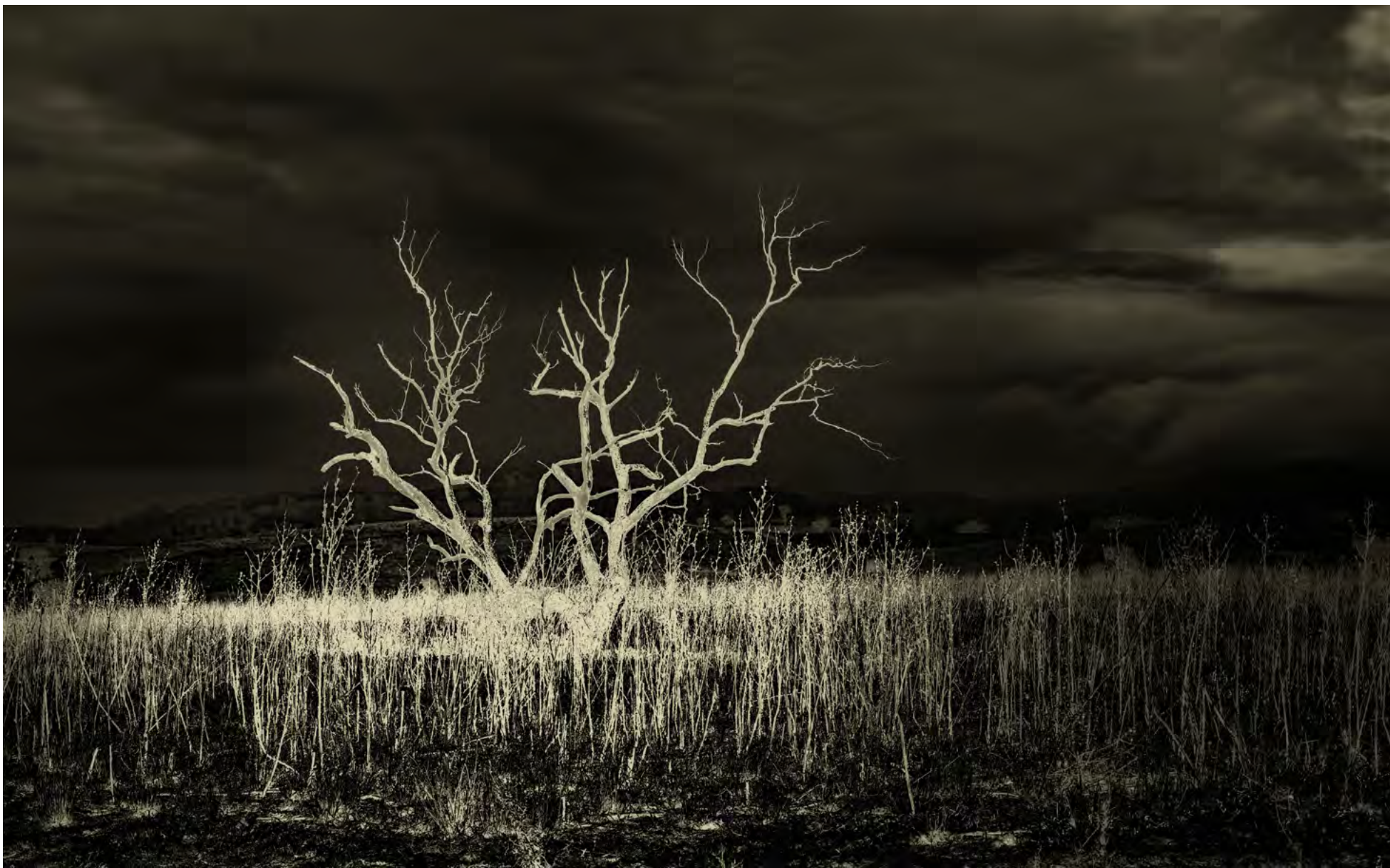
About the time of Samhain, not far from Boorowa