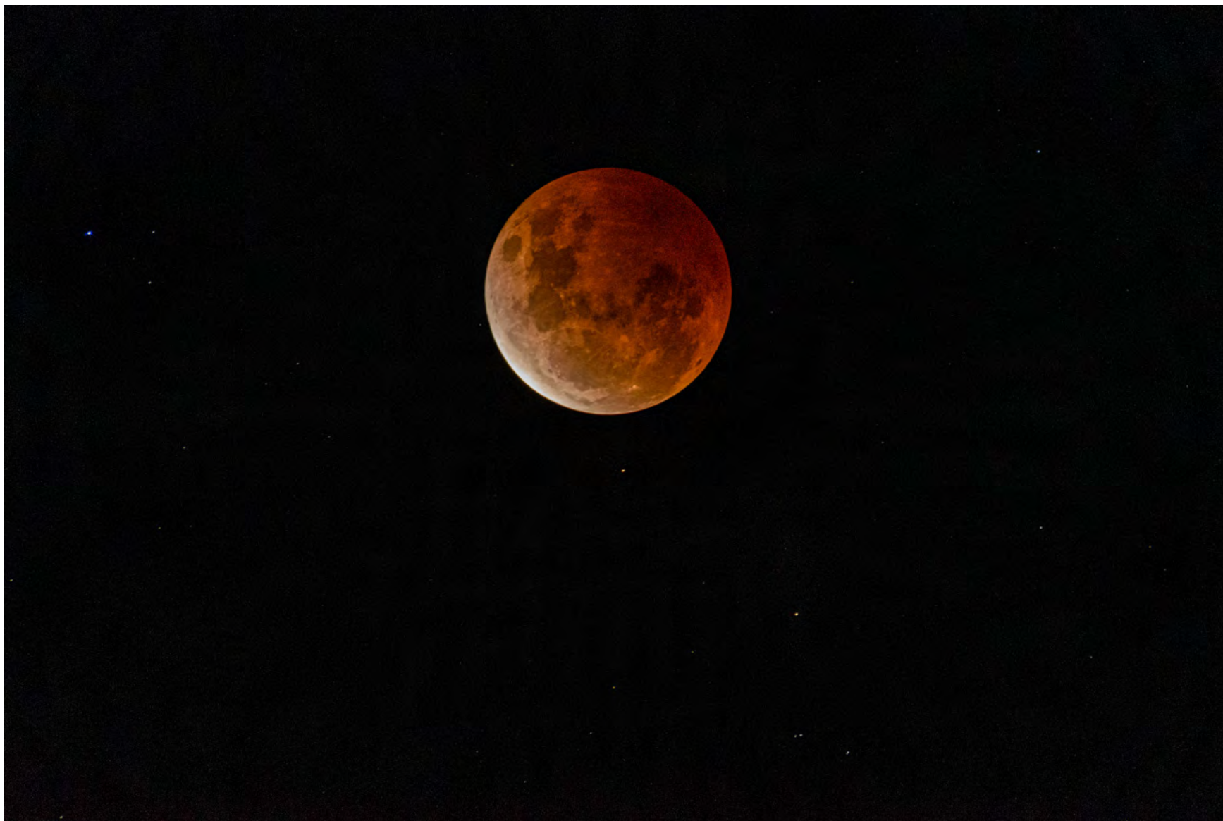
Blood moon Nikon D500, Nikon 200-500 mm, ISO: 2500, f5.6, 1/3 sec Processed in Adobe Lightroom Classic Rob Wignell