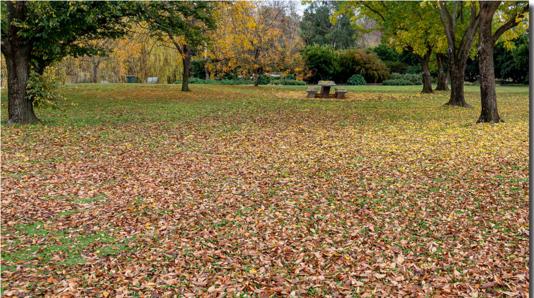
Nikon D850, 15-30mm @ 30mm, f10, ISO 400, 1-125th.