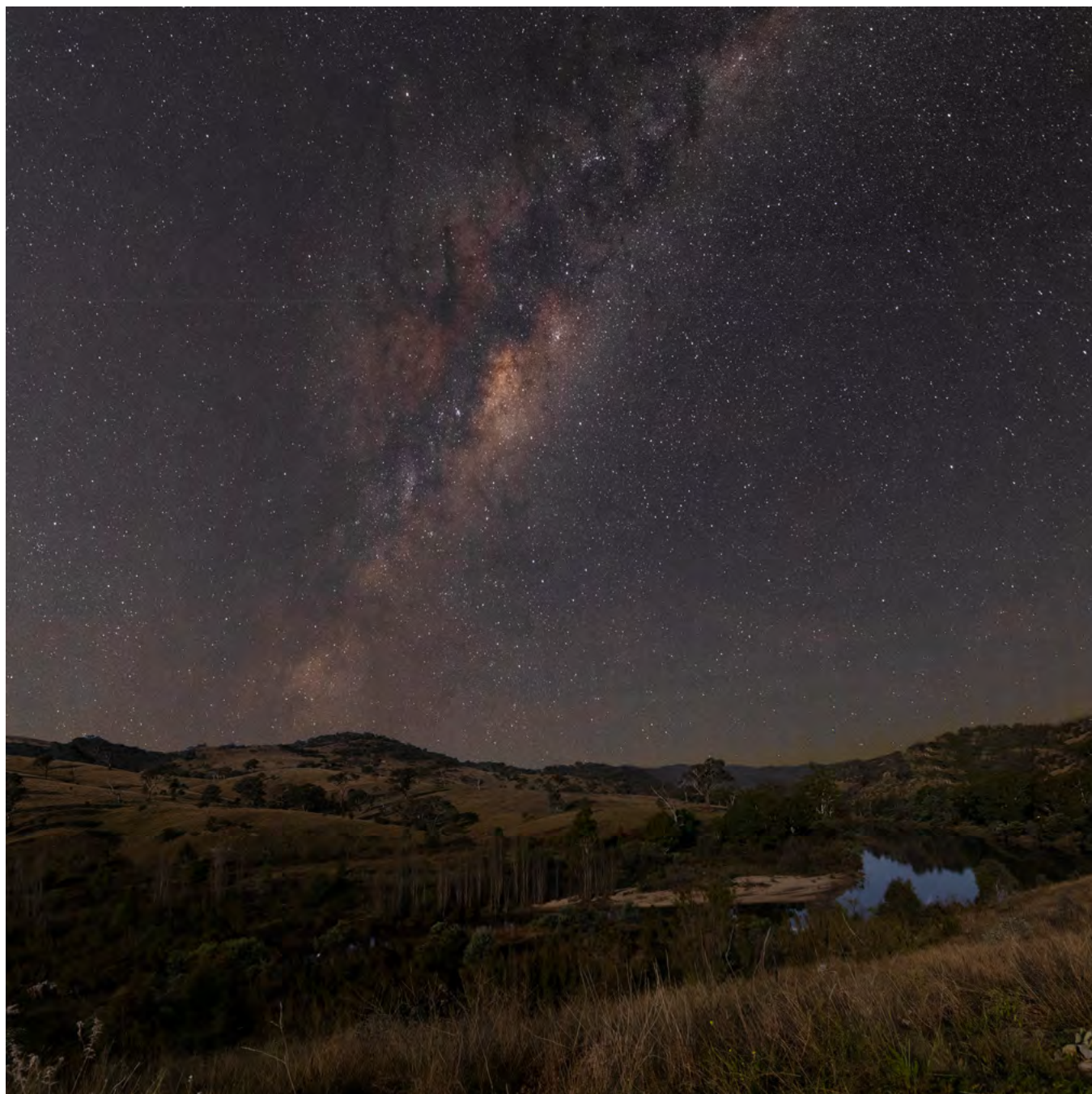
Ambience of the Tharwa Sandwash John Mitchell

A 2 stage shoot, 5 foreground images exposed for 3 to 4 minutes just prior to the moon setting. ISO about 800 & f2.8. The sky was then exposed for 10 seconds, f2.8, ISO 3200