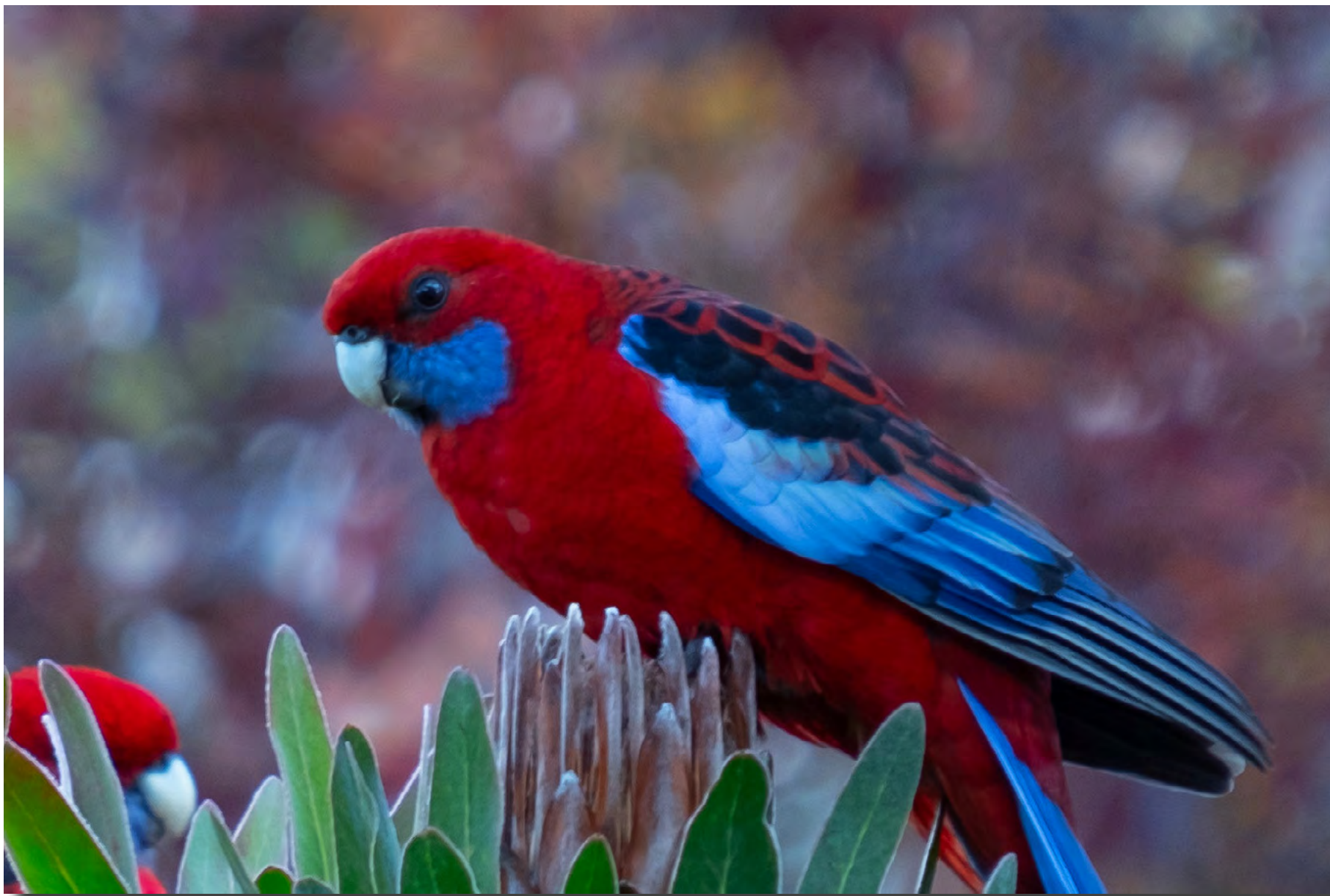
Crimson Rosella: Fujifilm XT2 and 55-200 mm lens Subramaniam Sukumar