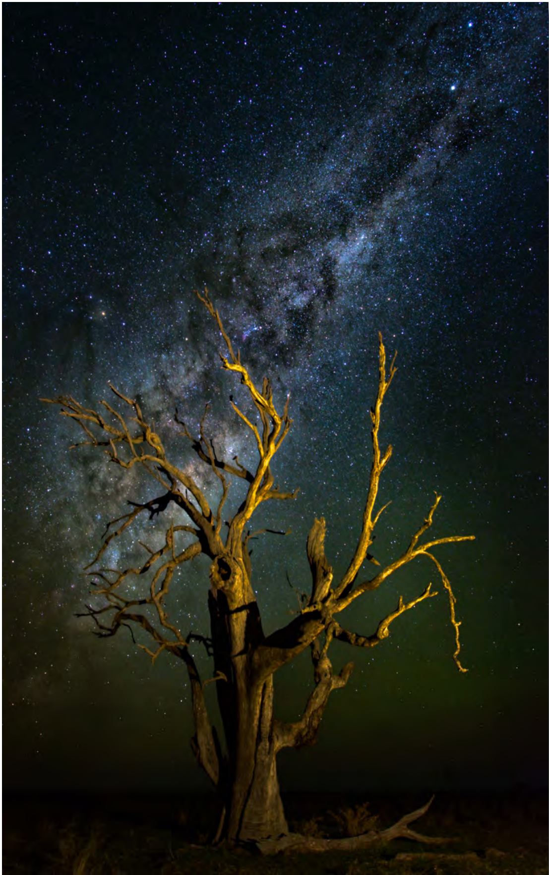
Dead Tree under the Milky Way, Cookardinia