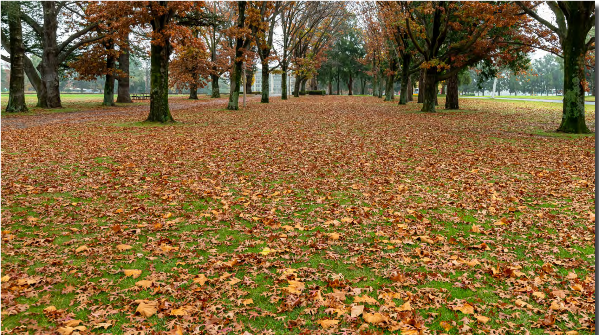
Nikon D850, 15-30mm @ 30mm, f10, ISO 800, 1-100th.