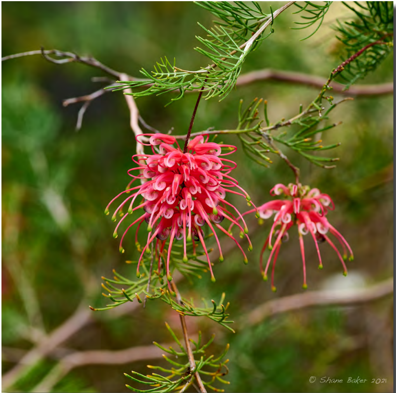
Grevillea flower Nikon Z6 II with Tamron SP 90mm f/2.8 via FTZ adaptor at 1/100sec, f/7.1 and ISO 220