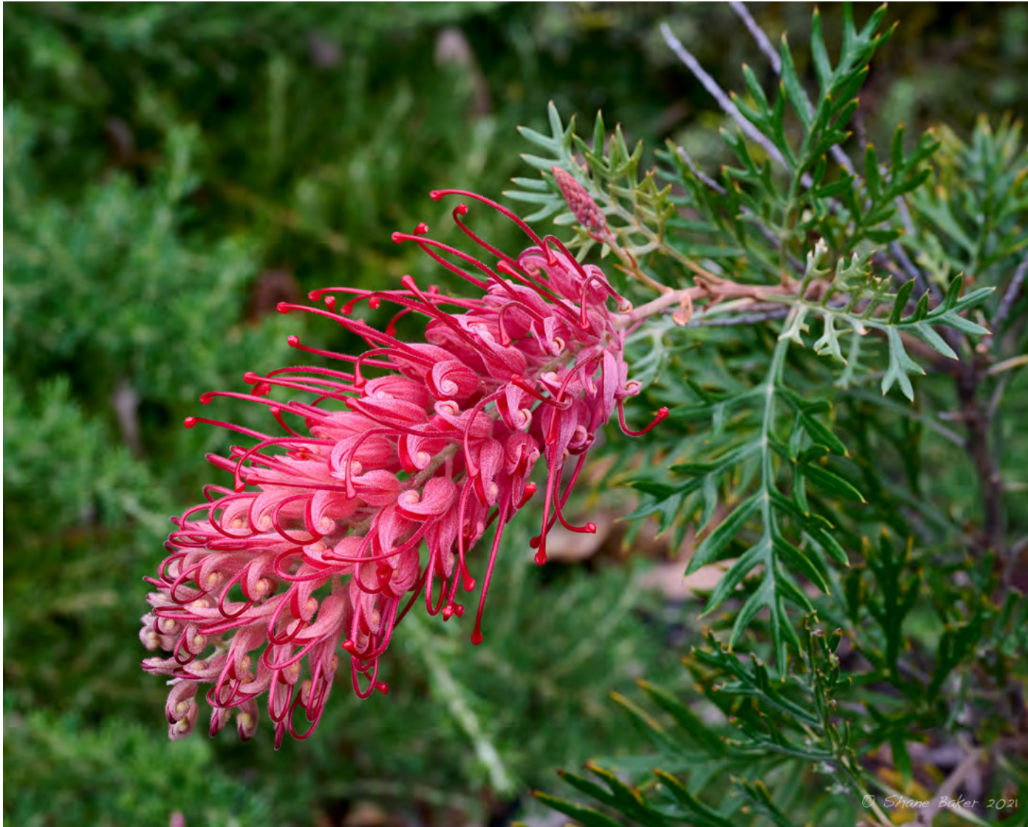
Grevillea Robin Gordon Nikon Z6 II with Nikkor Z 50mm f/1.8 S at 1/60sec, f/8 and ISO 220