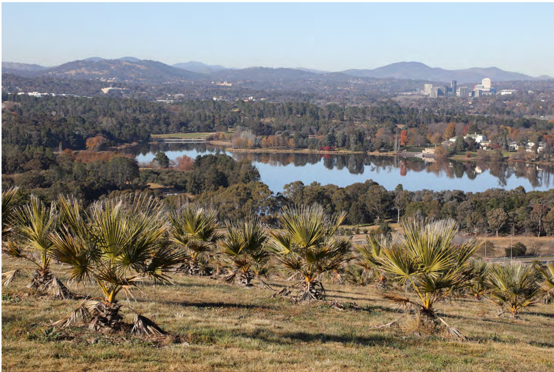
National Arboretum looking out over the Governor-General's House