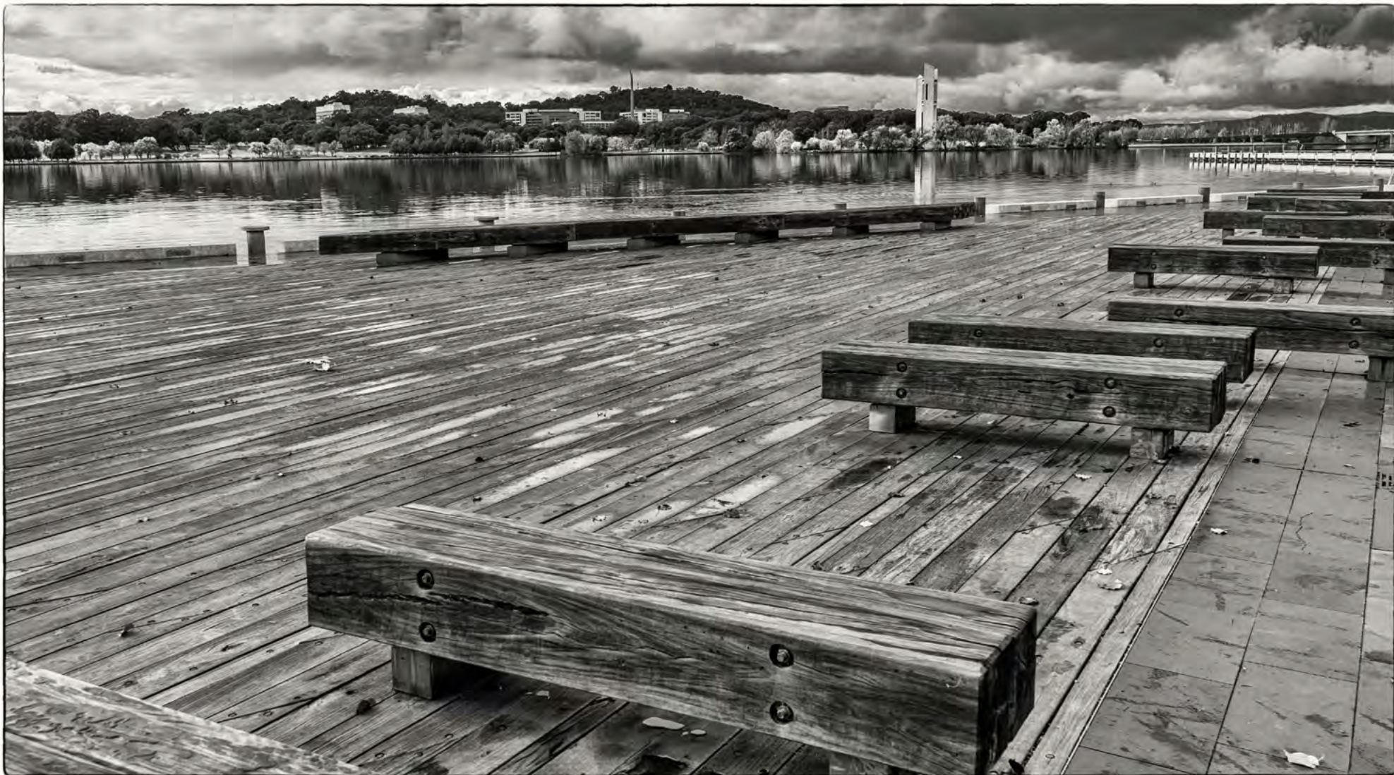
Nikon D850, 15-30mm @ 30mm, f11, ISO 64, 1-50th.