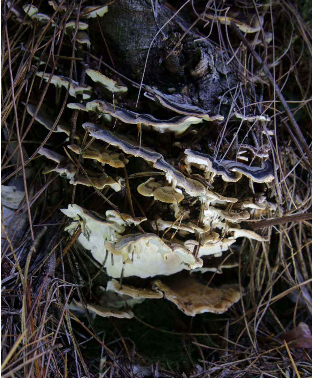
Barcken fungi, Bendora Arboretum