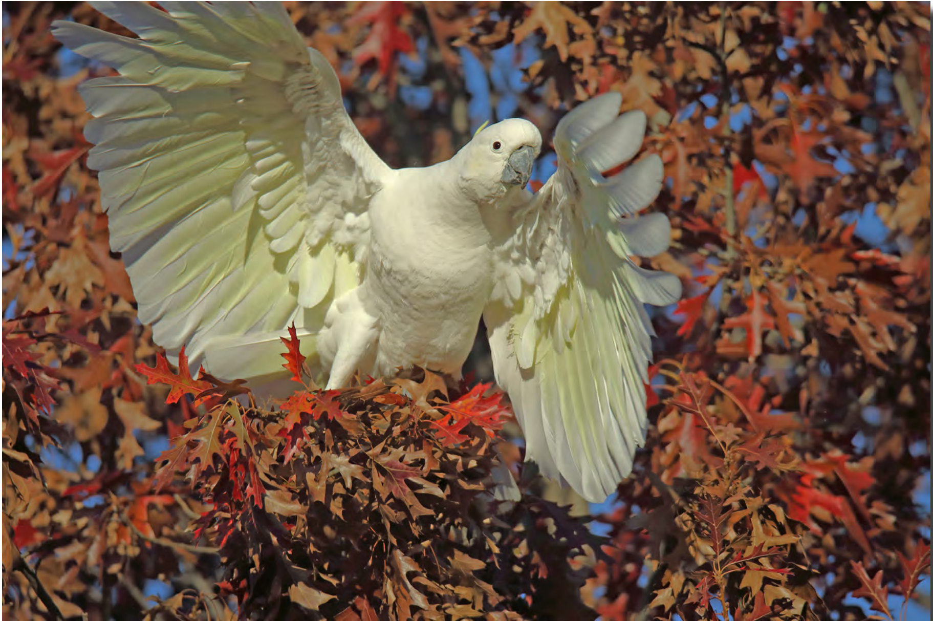
Sulphur-crested Cockatoo in autumn leaves Diane Cutting