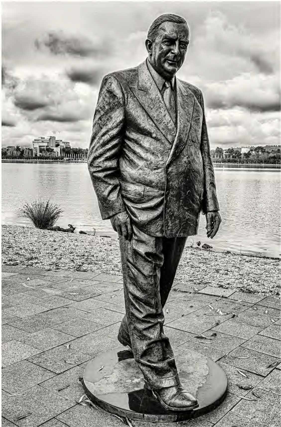
Nikon D850, 15-30mm @ 30mm, f11, ISO 64, 1-50th.