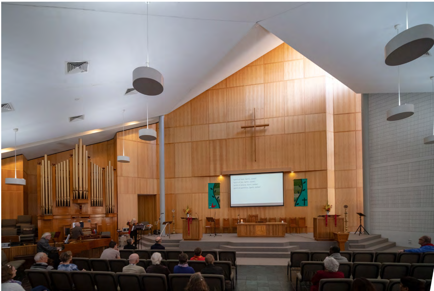
Canberra City Uniting Church with Fujifilm XT2 and Laowa 9 mm lens Subramaniam Sukumar