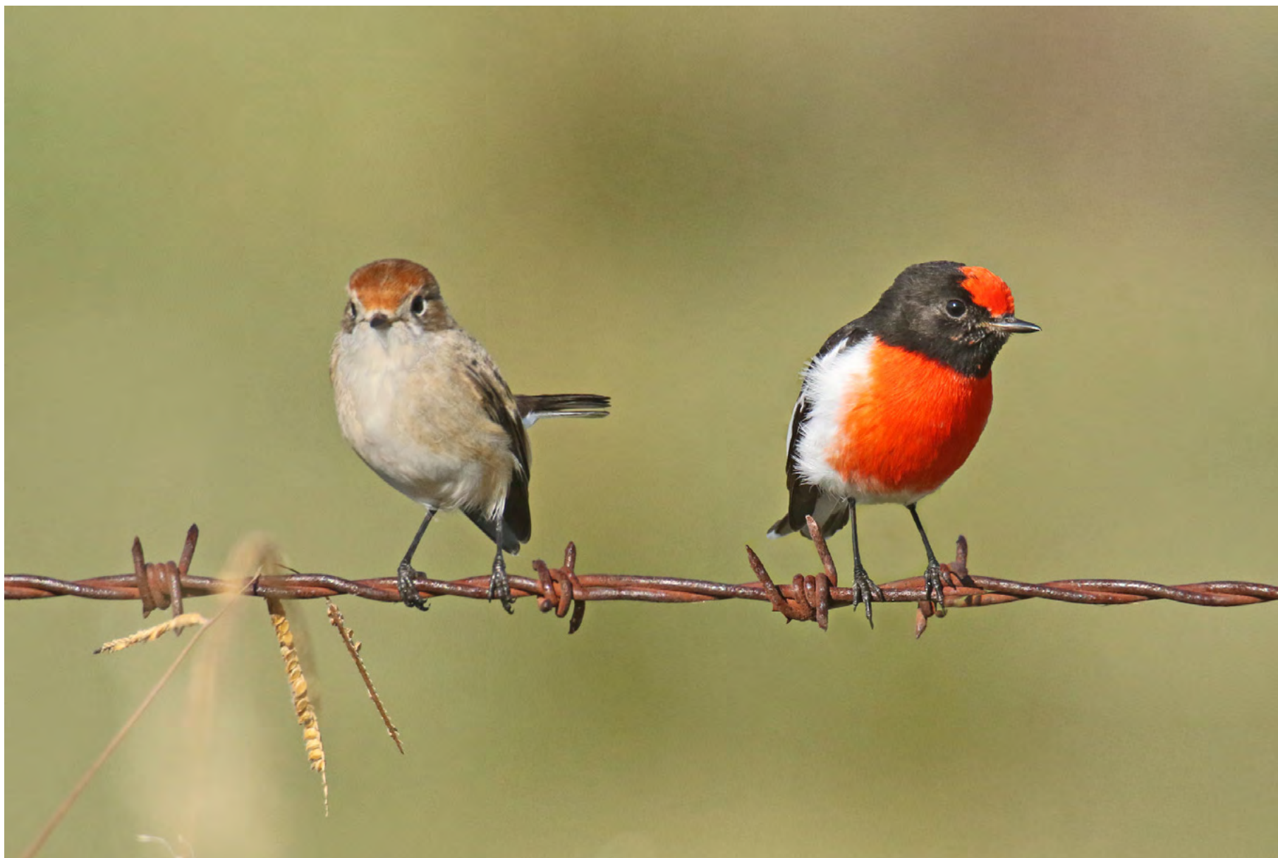
Male and Female Red Capped Robins - rare visitors to the ACT Diane Cutting