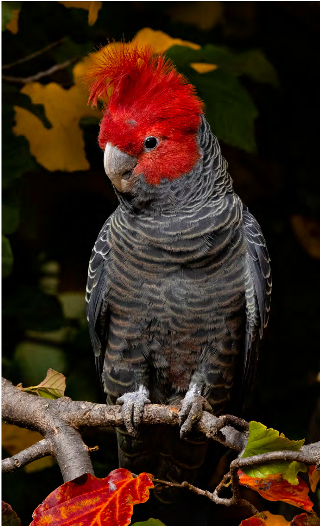
Male Gang-gang Cockatoo, Yarralumla