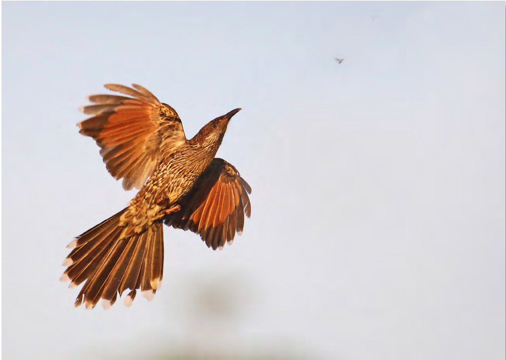
Little Wattle bird hawking insects at sunset Diane Cutting