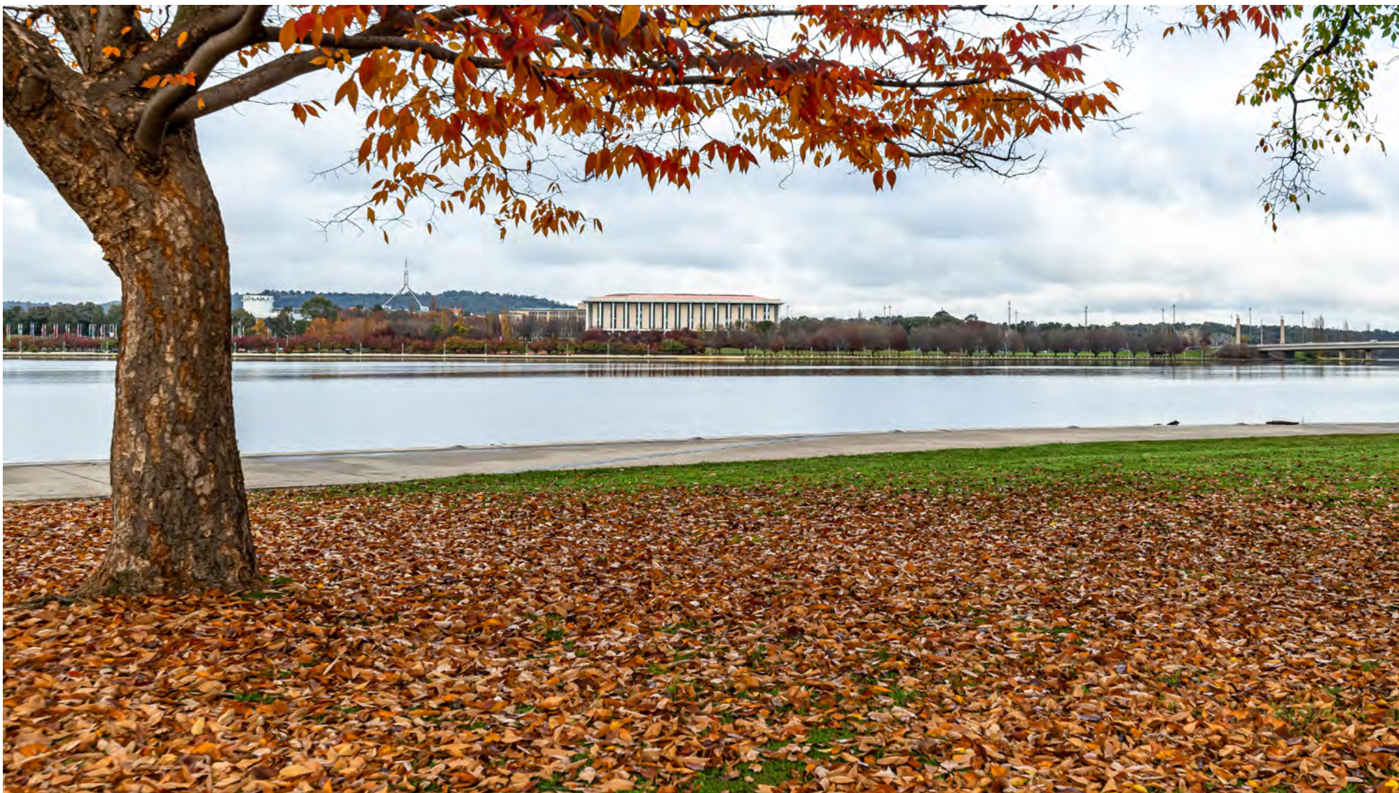
Nikon D850, 15-30mm @ 30mm, f10, ISO 400, 1-500th.