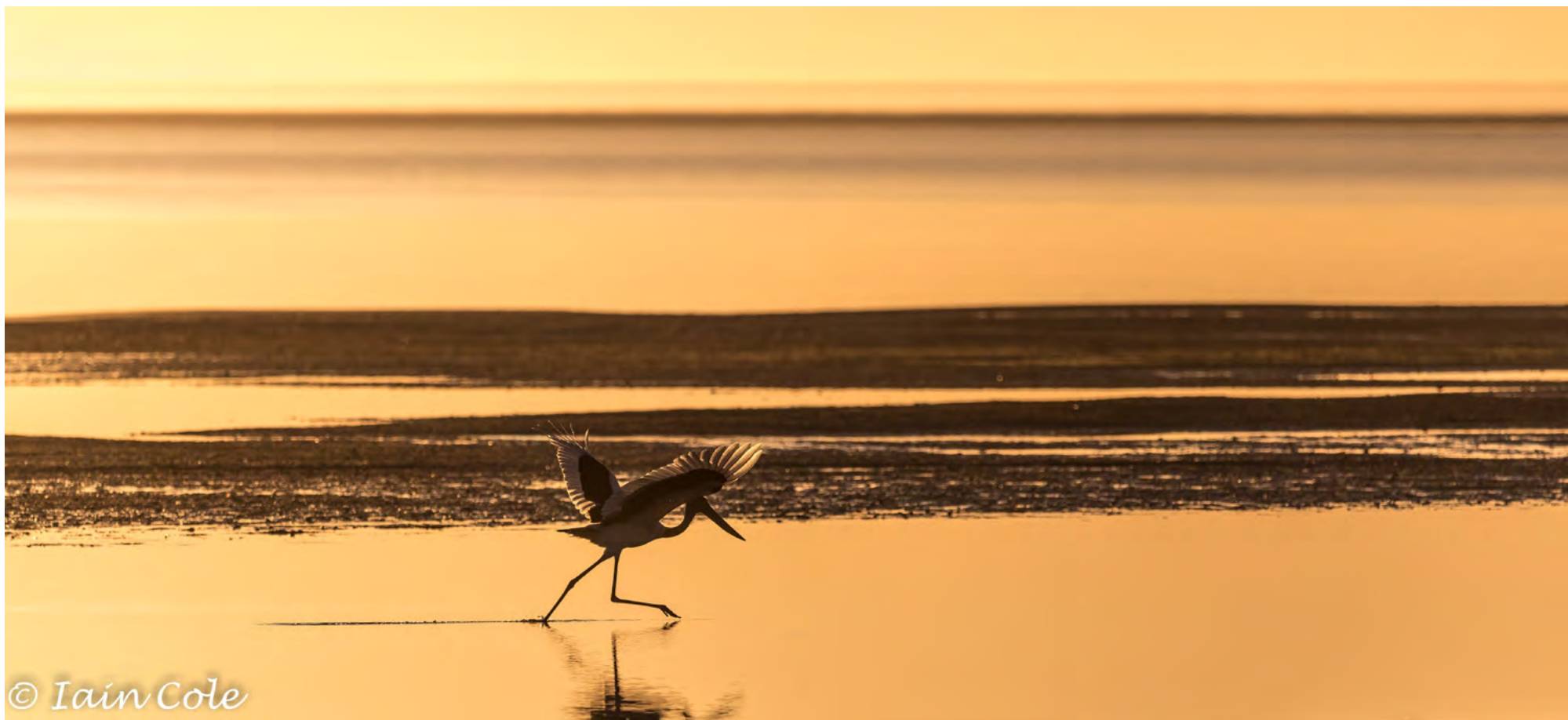
Jabiru at Sunset Point, Karumba Iain Cole