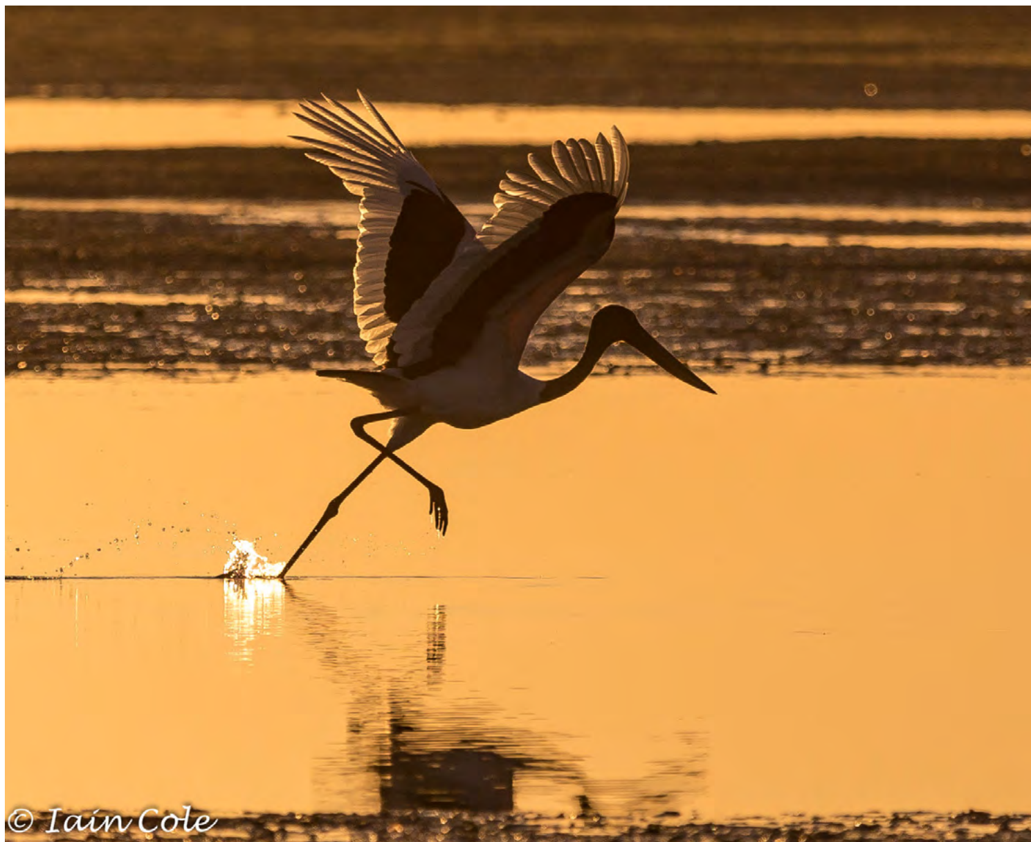
Jabiru at Sunset Point, Karumba Iain Cole