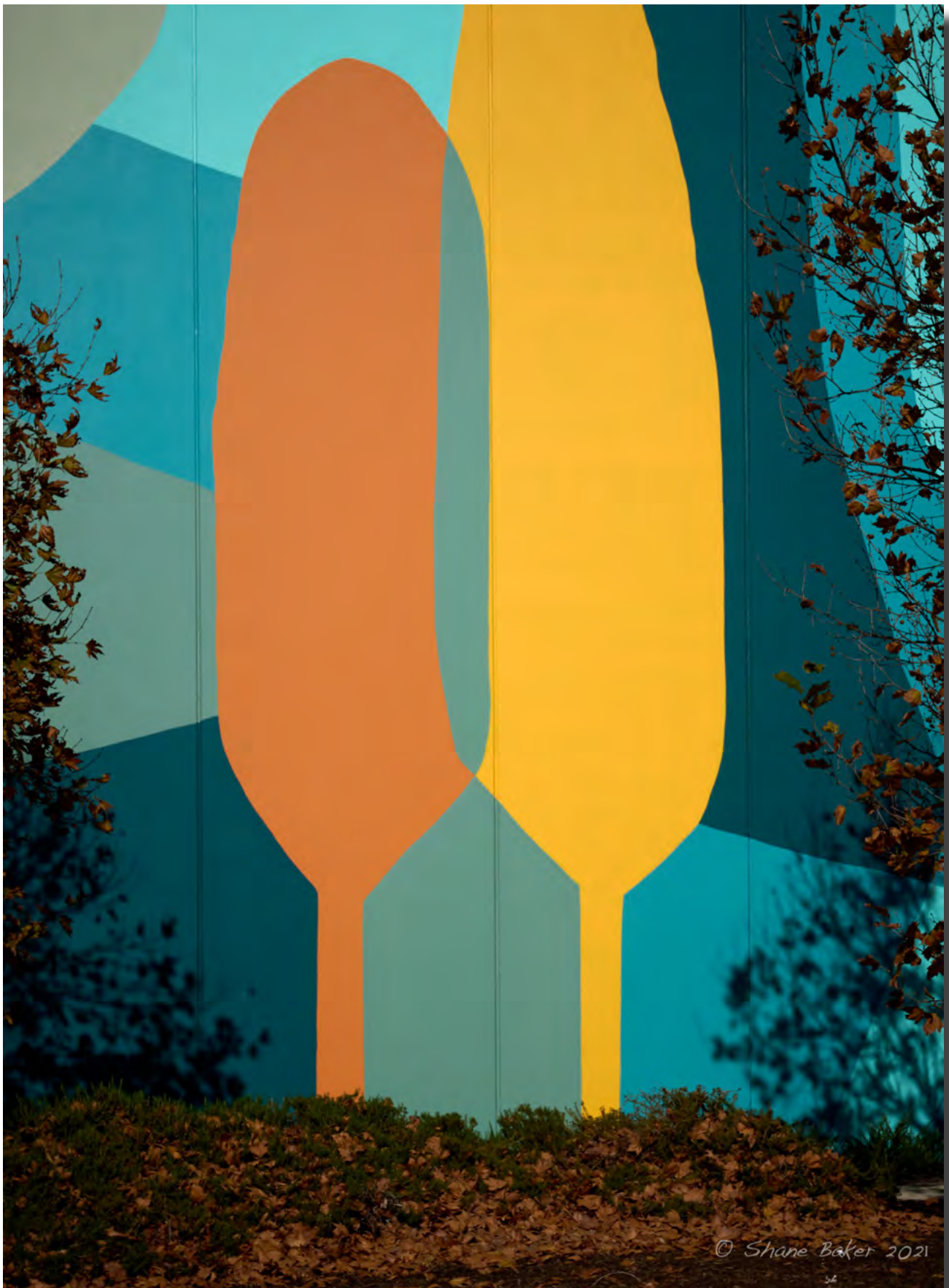
Shopping Centre Wall II Nikon Z6 II with Nikkor Z 24 - 70 at 49mm, f/11, 1/640 sec and ISO 100. Processed in Capture One 21.2