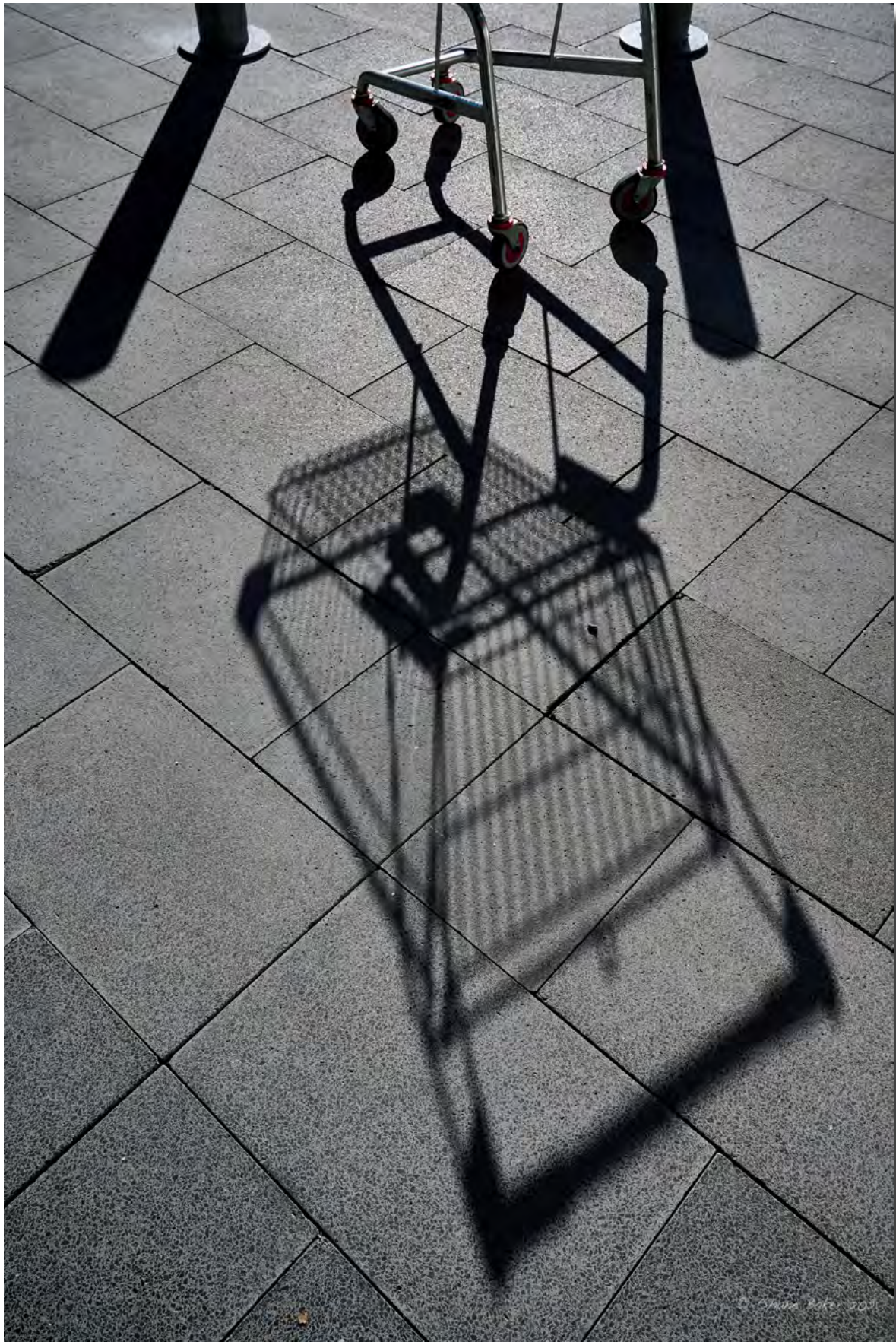
Shades of a shopping trolley Nikon Z6 II with Nikkor Z 24 - 70 at 29mm, f/8, 1/200sec and ISO 100. Processed in Capture One 21.2 Shane Baker