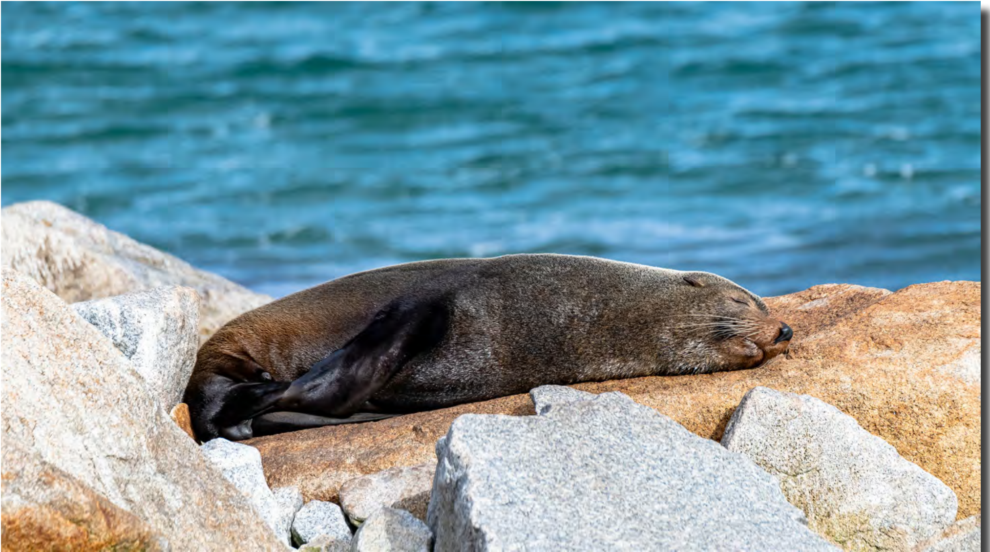
Nikon D 850, 80-400mm @ 400mm, ISO-800, 2000Sec, f6.3