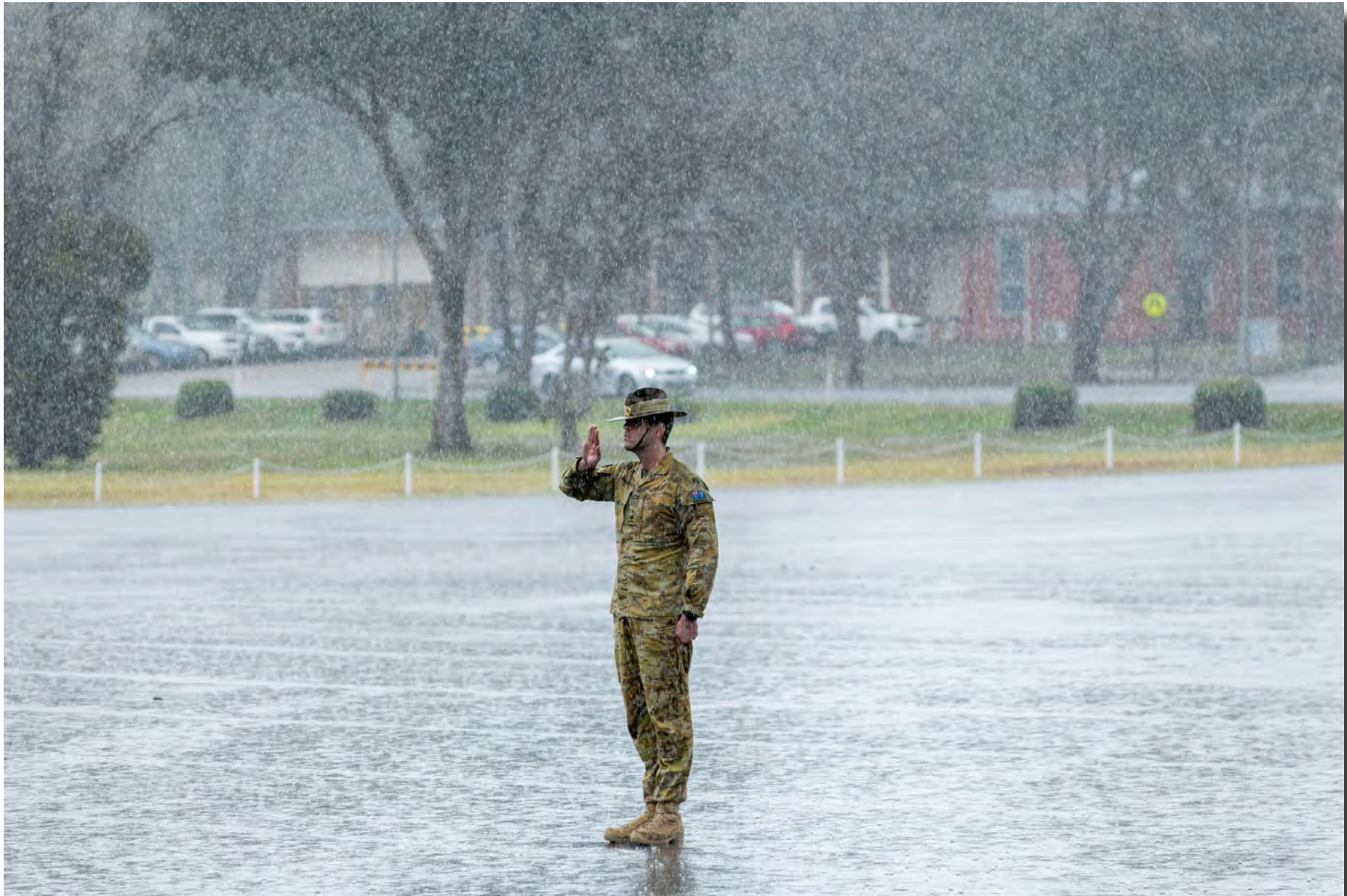
On duty, Nikon D 850, 80-200mm @ 200mm, ISO-800, 1500Sec, f5.6