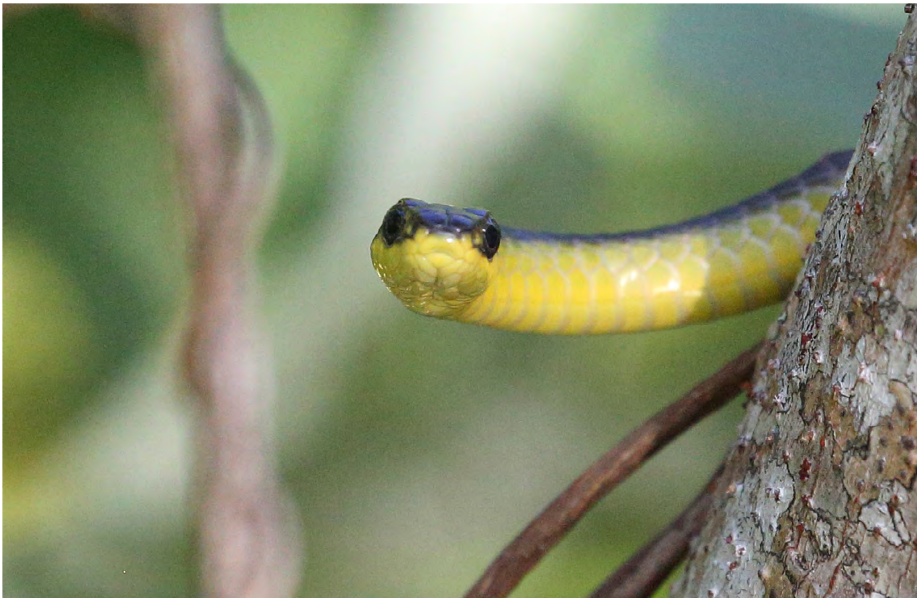
Green Tree Snake, Daintree River Derek Trow