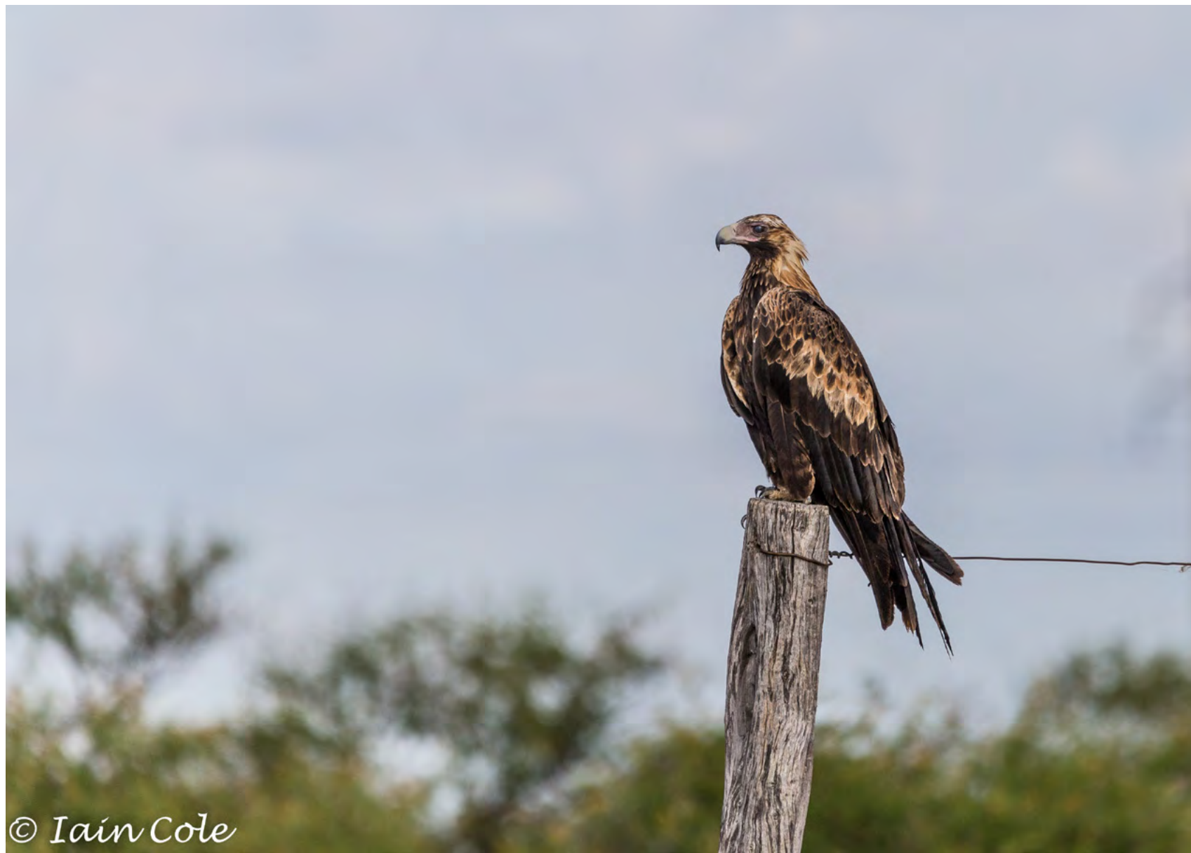
Juvenile Wedgetail eagle on the road to Richmond Iain Cole