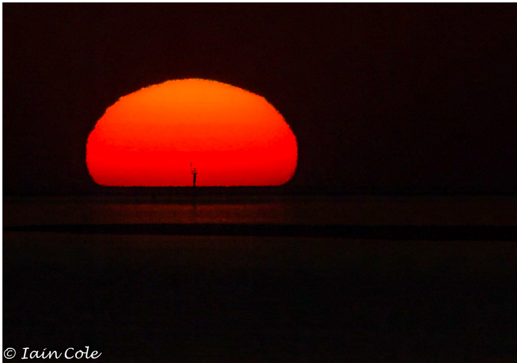
At the going down of the sun. Sunset Point, Karumba Iain Cole