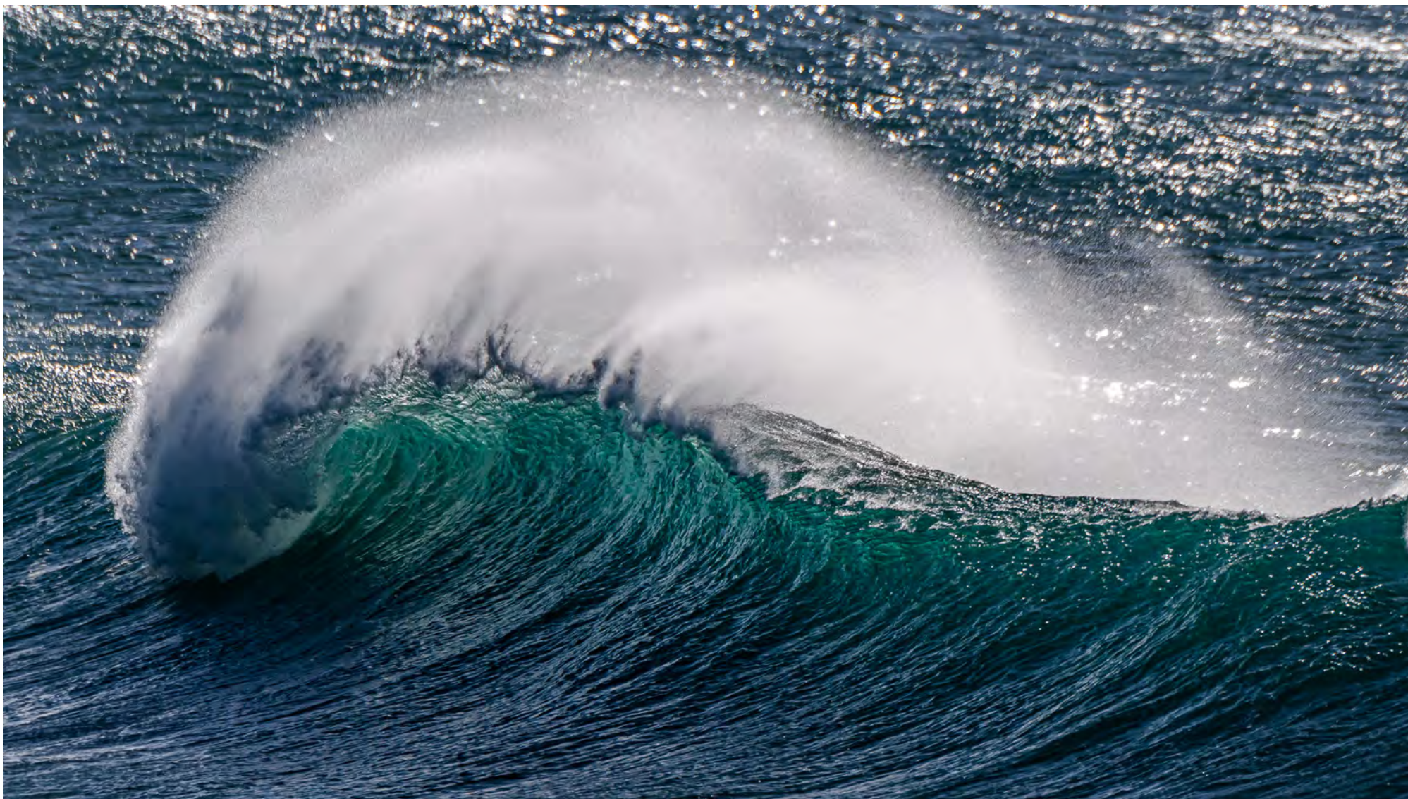
Nikon D 850, 80-400mm @ 400mm, ISO-64, 1600Sec, f8