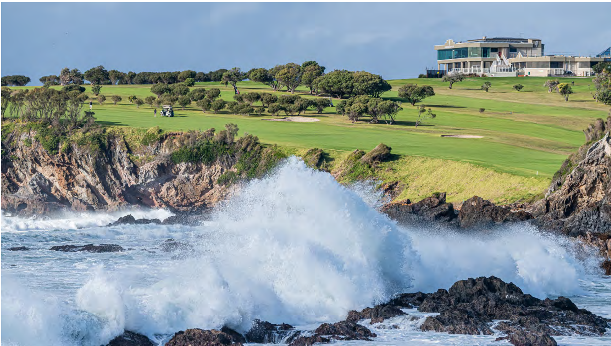
Nikon D 850, 80-400mm @ 240mm, ISO-400, 1000Sec, f8