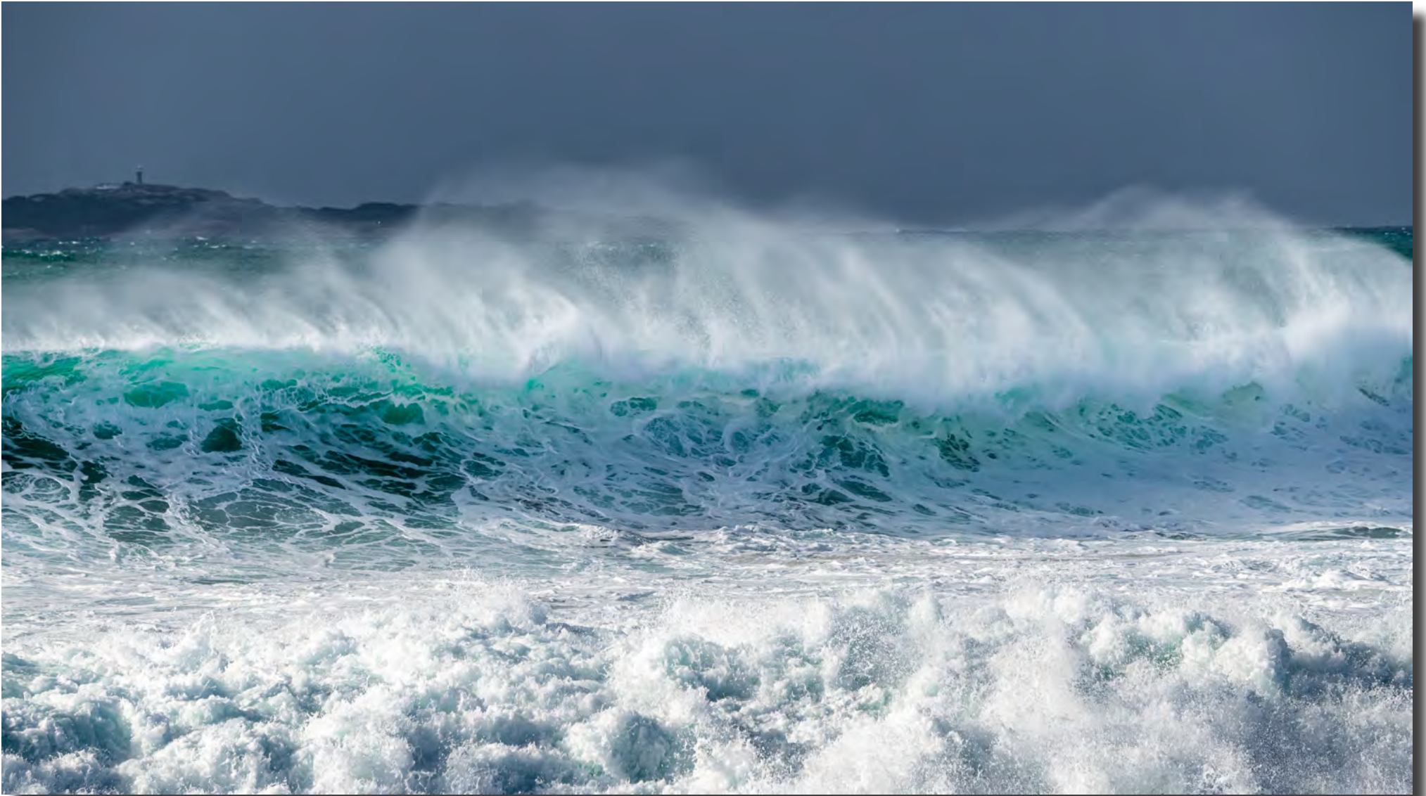
Nikon D 850, 80-400mm @ 230mm, ISO-400, 1000Sec, f8