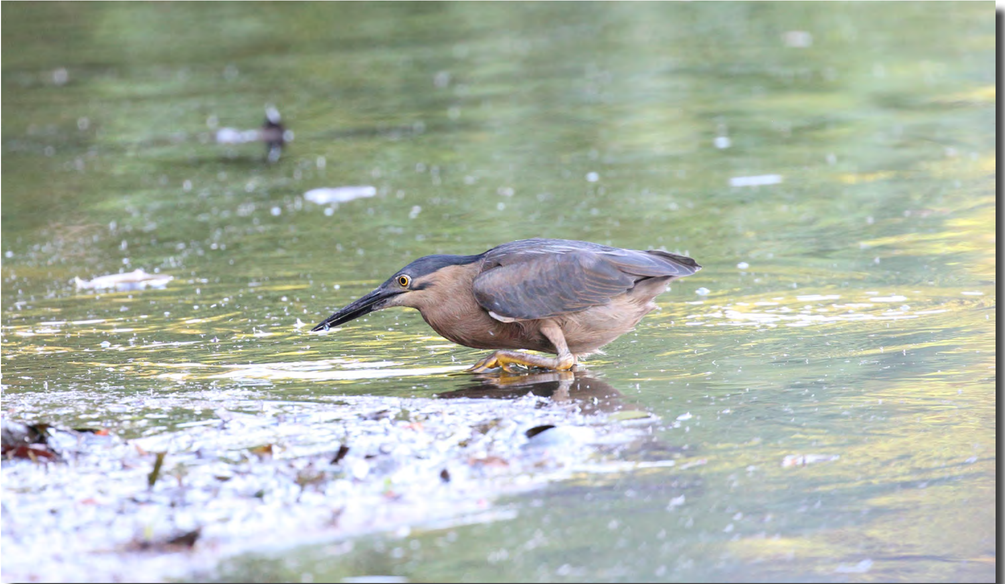
Striated Heron, Daintree River