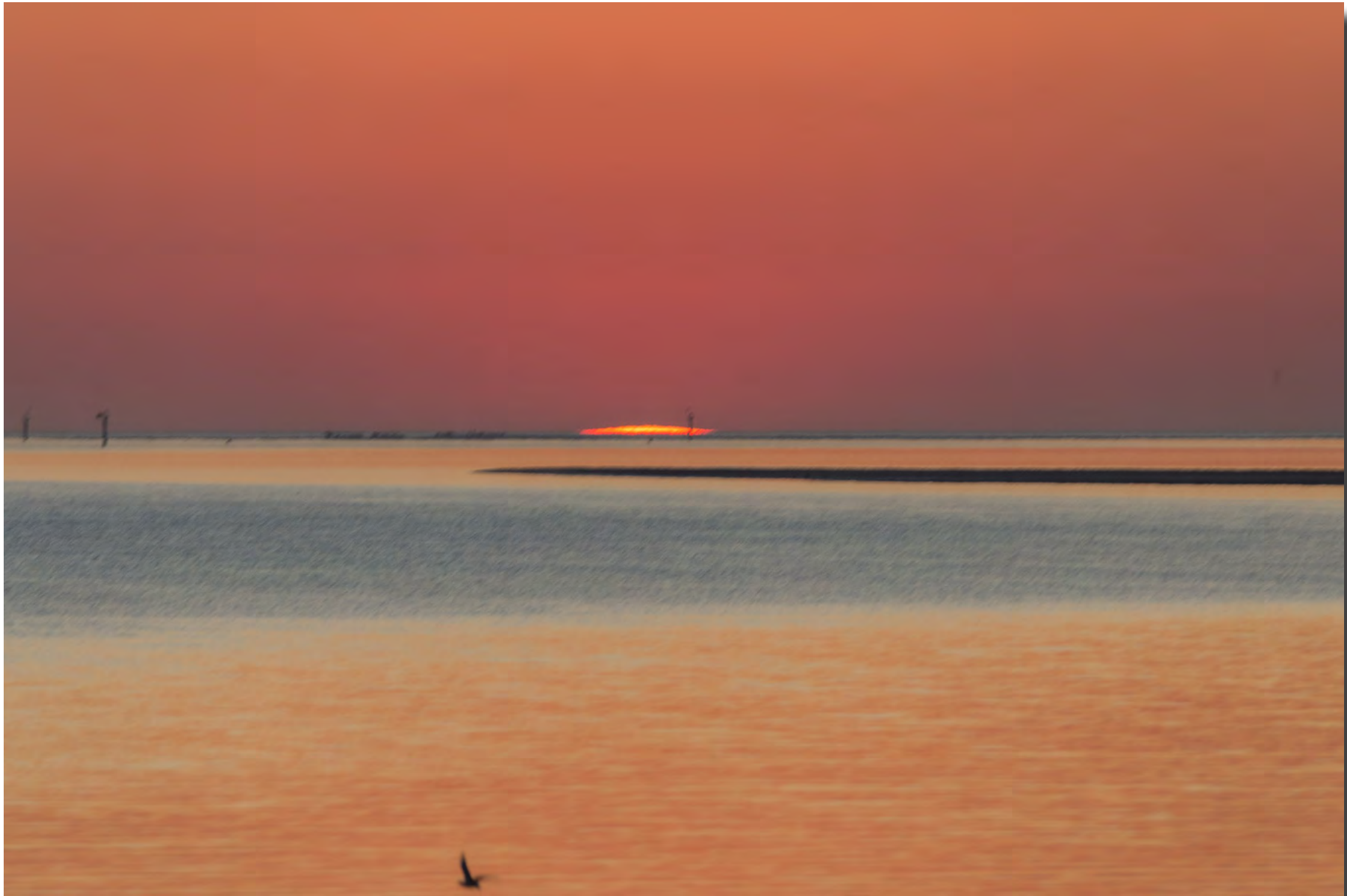
Karumba Iain Cole