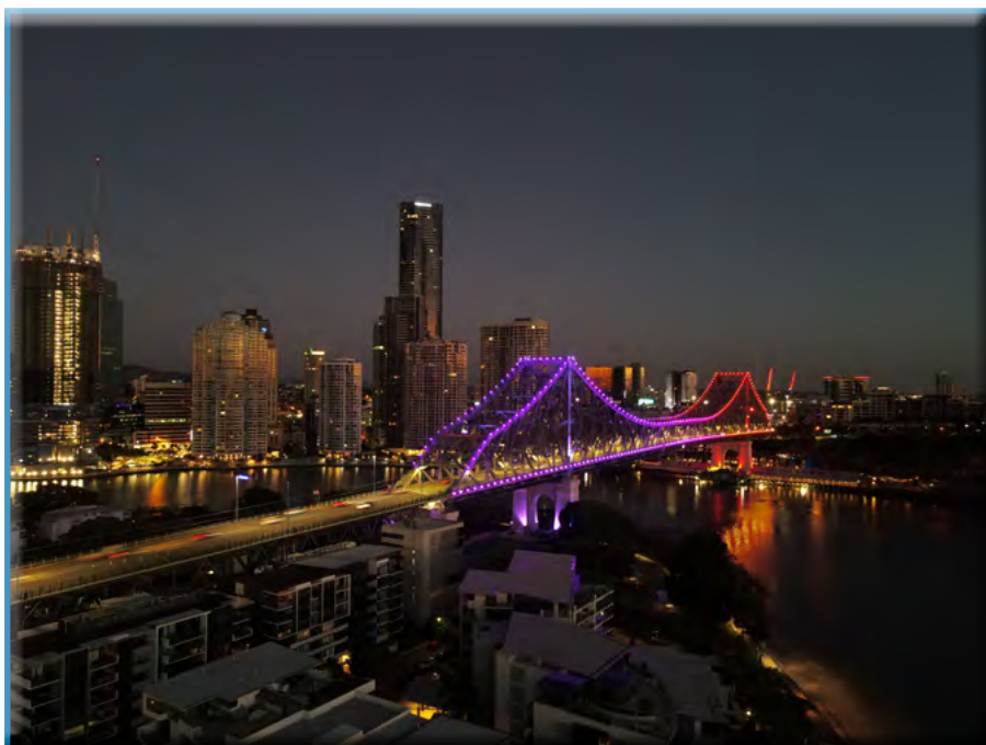
Brisbane's Story Bridge