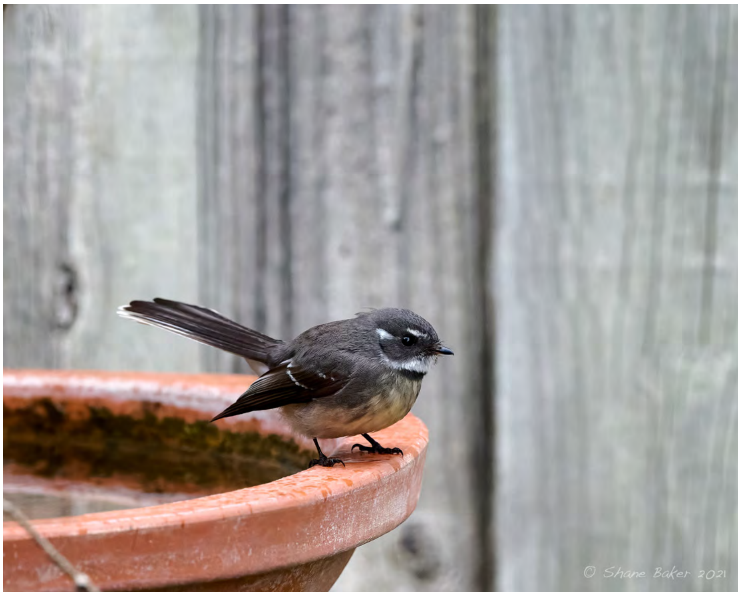
Grey fantail in my yard in Ellenbrook, WA Nikon D850 with Nikkor 500mm pf at f/5.6, 1/1250 sec and ISO5600. Noise reduction in DxO PhotoLab 4.3 and cropping, levels etc in Capture One 21.2 Shane Baker