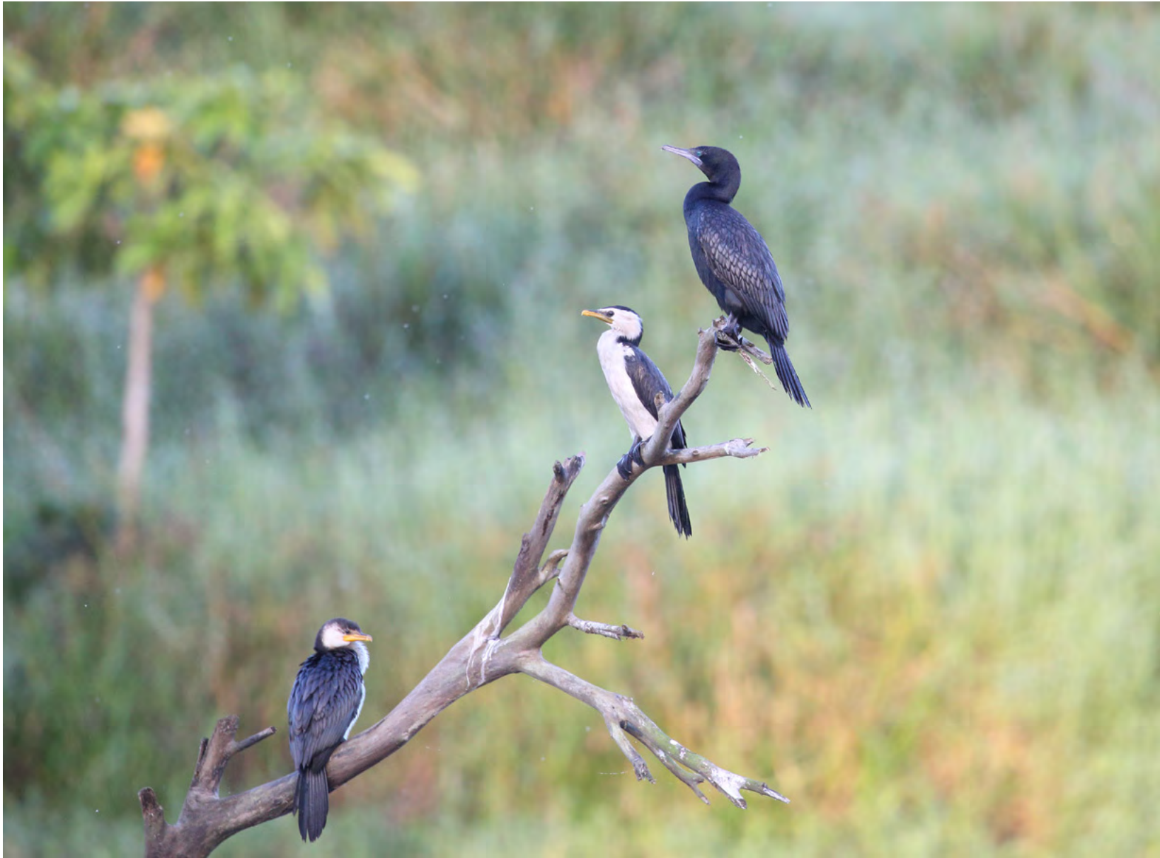
Little Pied Cormorants, Daintree River Derek Trow