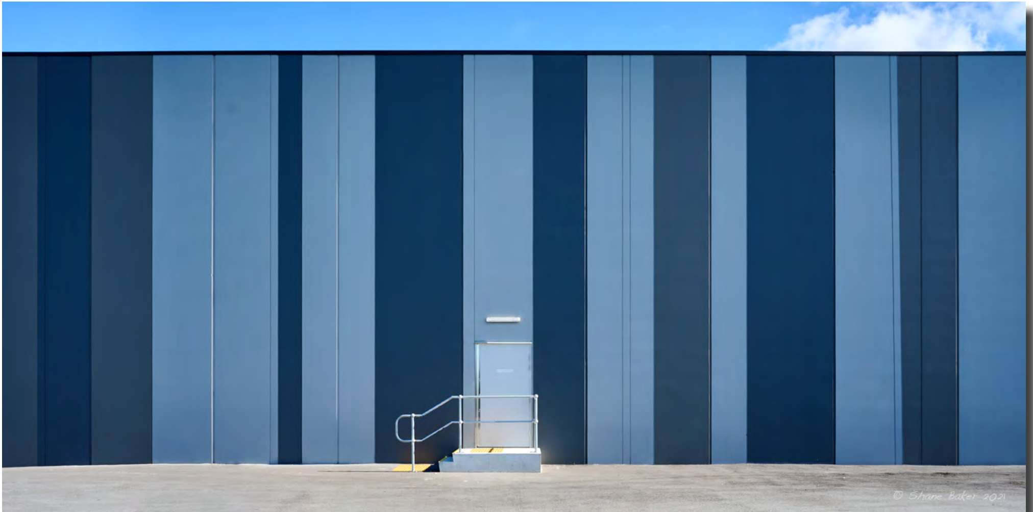
Shopping Centre Wall I Nikon Z6 II with Nikkor Z 24 - 70 at 24mm, f/8, 1/125sec and ISO 100. Processed in Capture One 21.2 Shane Baker