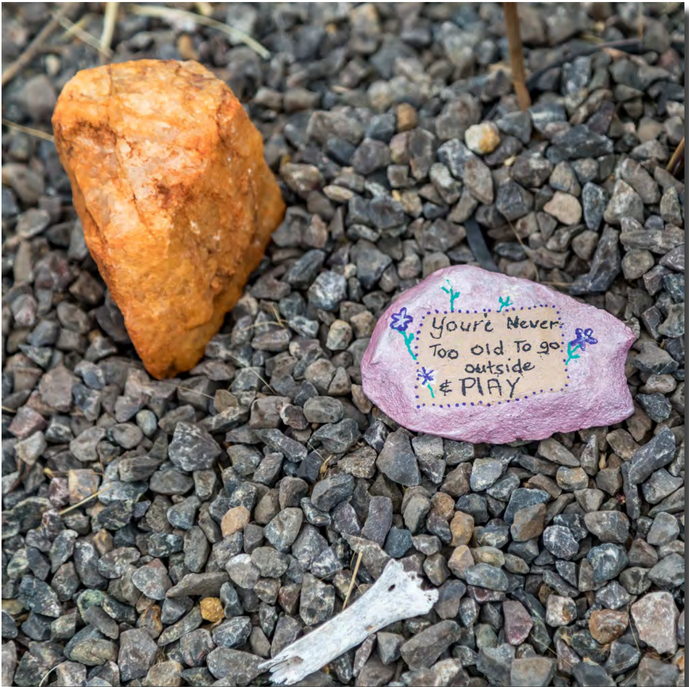
You're never too old to go outside and play. Simba's grave, roadside stop near Cloncurry Iain Cole