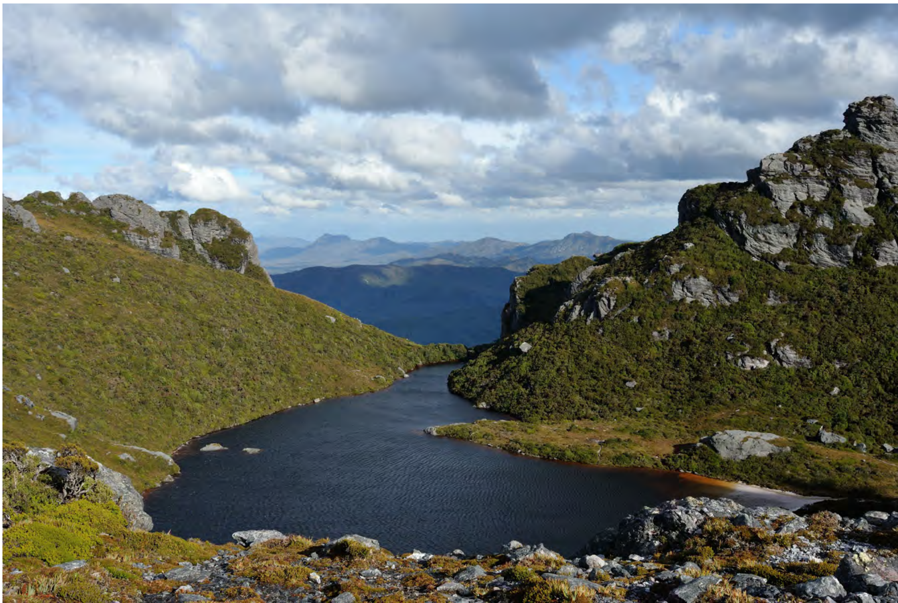
Tasmania Giles West