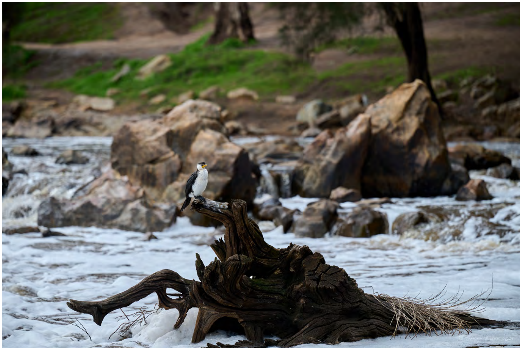
Little Pied Cormorant at Bells Rapids, WA Nikon Z6 II with Nikkor Z 70 - 200 at 200mm, f/4, 1/320 sec and ISO 100