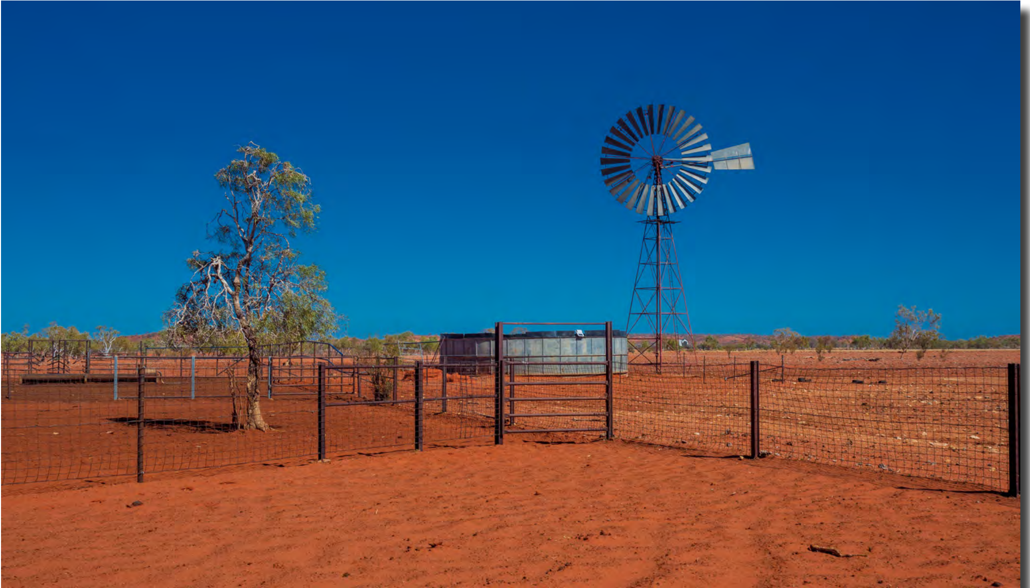
Centenary bore, Plenty Highway ISO 100, f11, 1-160s, 35mm Warren Hicks