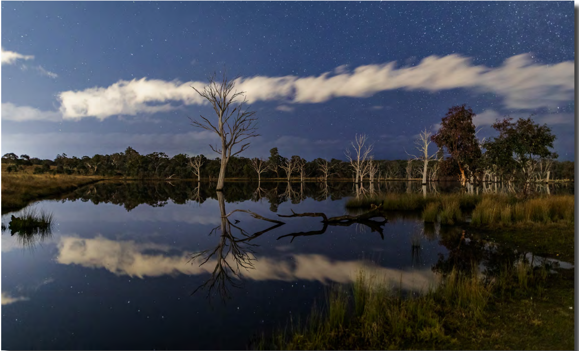
Dam at Mulligan's Flat Luminita Lenuta