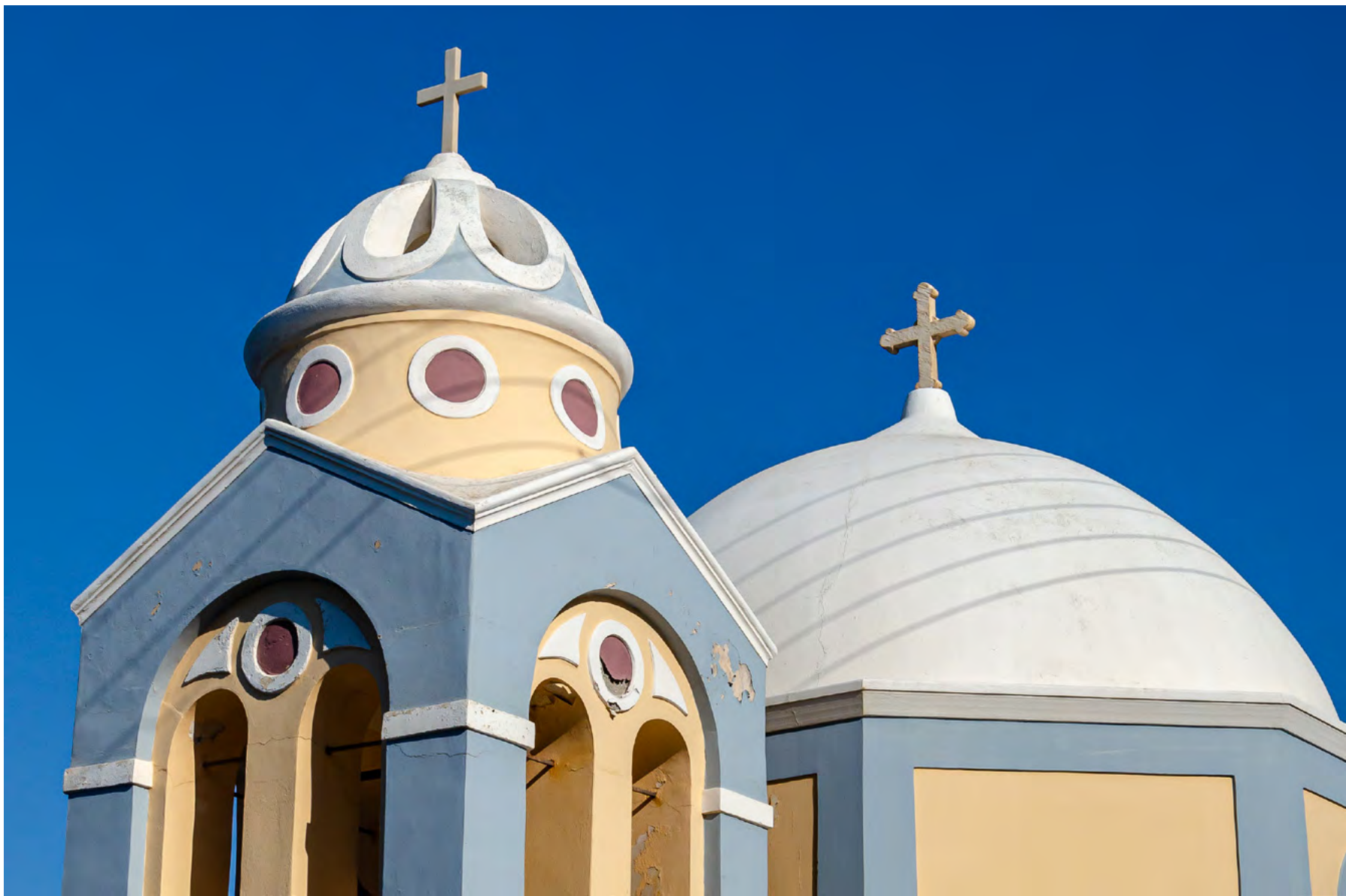
Santorini Nikon D7000 (APSC), Nikkor 18-105mm @ 32mm (48mm for Full Frame) f8, 1/250sec, ISO-200