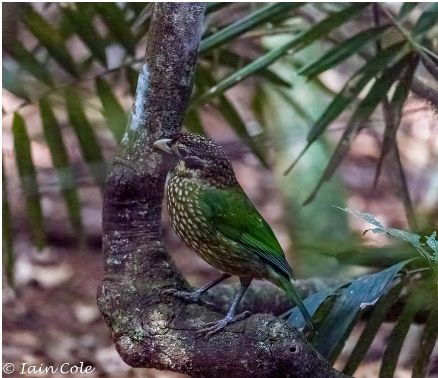
Spotted Catbird, near Malanda Falls Iain Cole