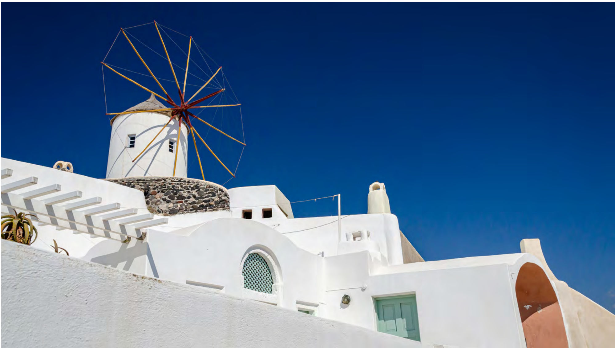
Santorini Nikon D7000 (APSC), Nikkor 18-105mm @ 18mm (27mm for Full Frame) f10, 1/1000sec, ISO-200