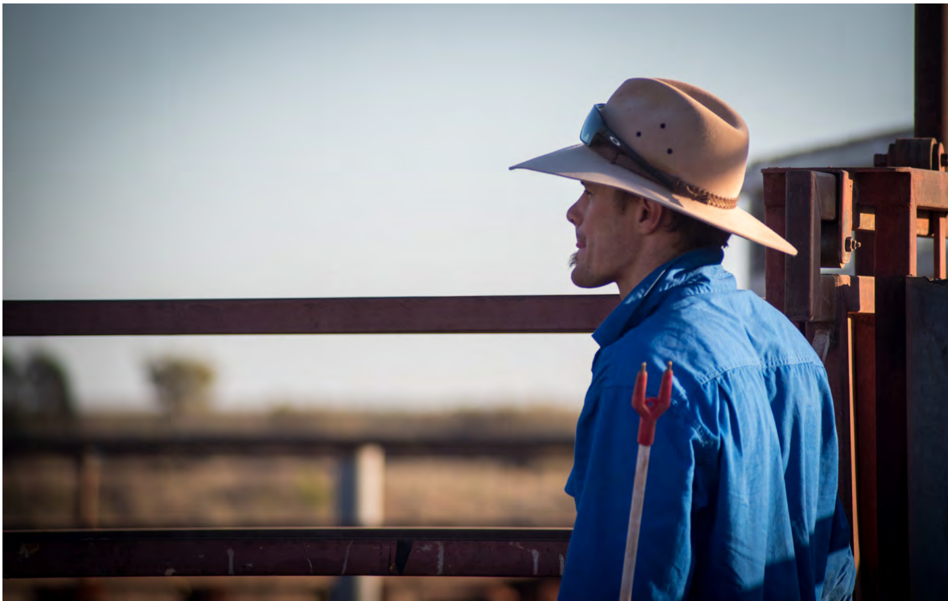
Ringer, Tobermorey Stn, NT, ISO 400, f5.6, 1-400s, 300mm Warren Hicks