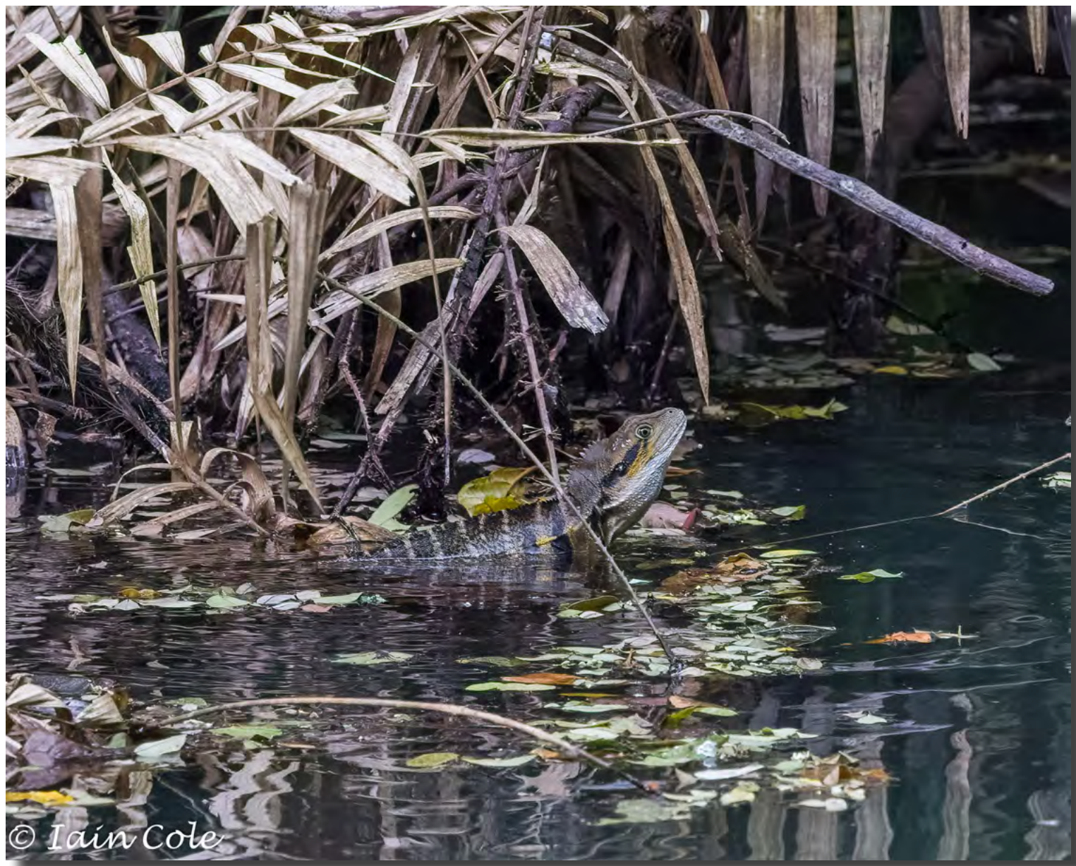
Water dragon swimming on the South Johnstone River, Malanda