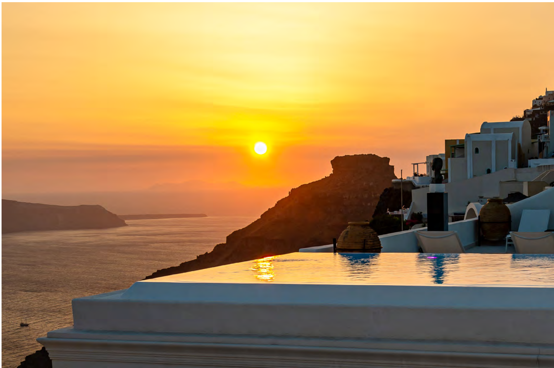
Santorini Nikon D7000 (APSC), Nikkor 18-105mm @ 25mm (37mm for Full Frame) f8, 1/20sec, ISO-100