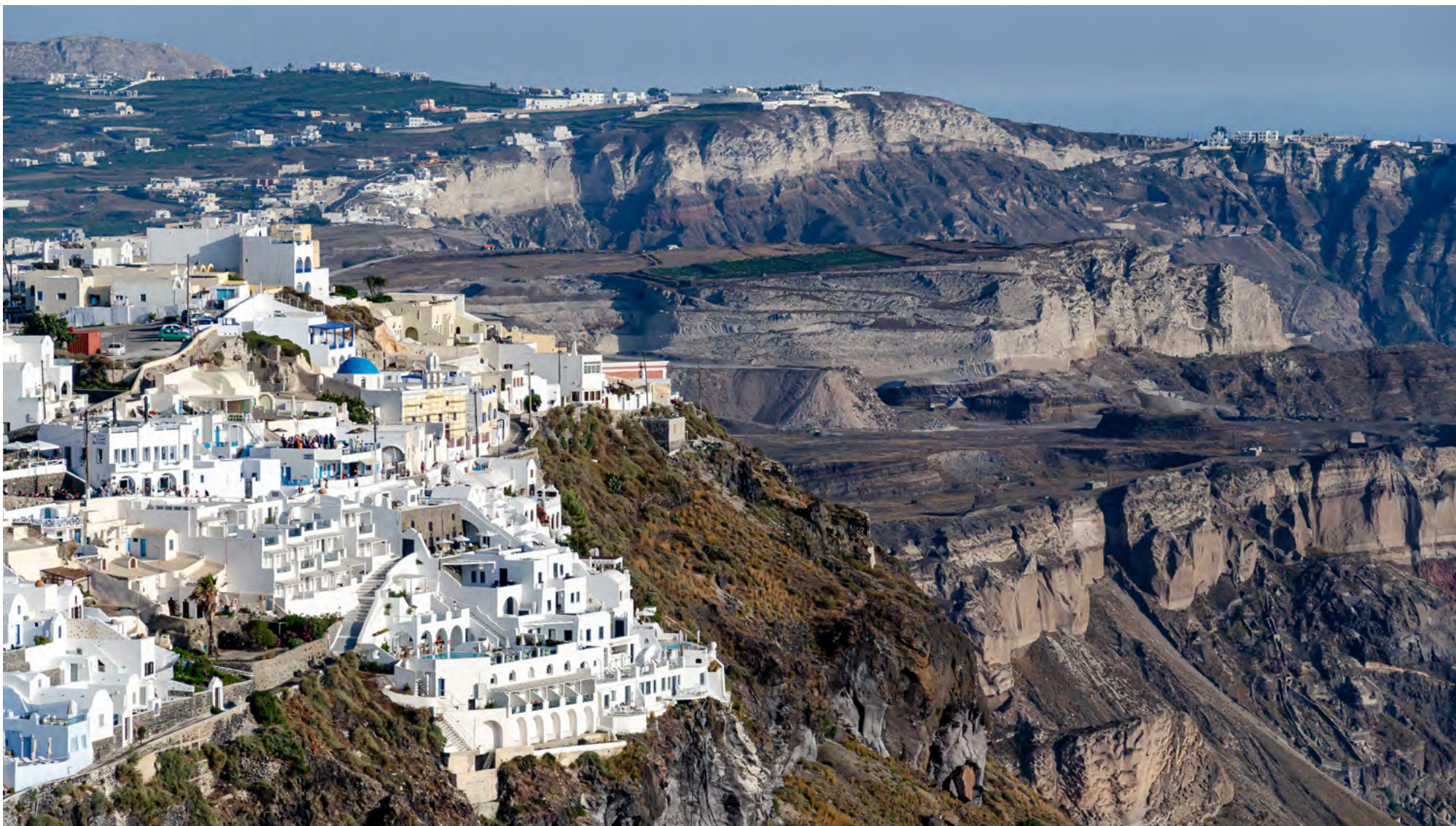
Santorini Nikon D7000 (APSC), Nikkor 18-105mm @ 92mm (138mm for Full Frame) f7.1, 1/640sec, ISO-100