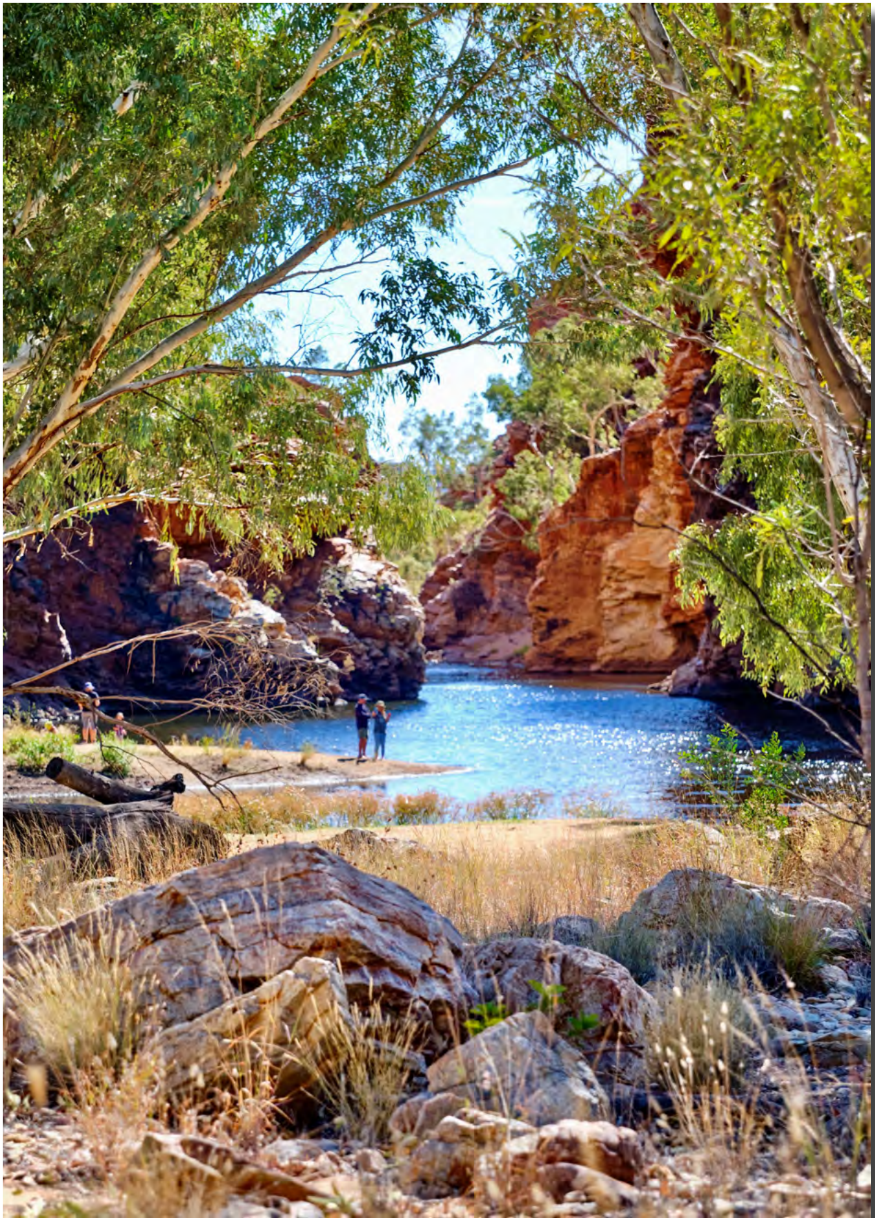
Fujifilm XT2 Leowa 9 mm Subramaniam Sukumar