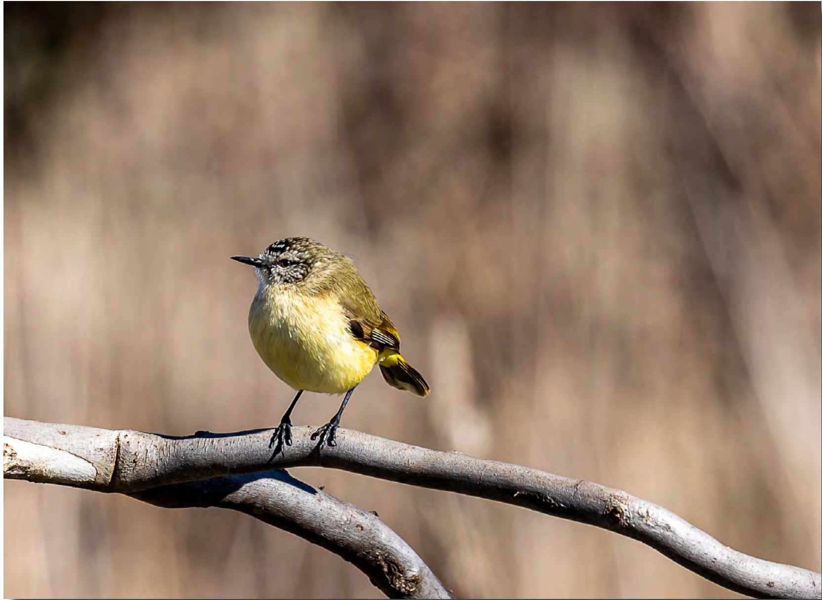
Thornbill Luminita Lenuta