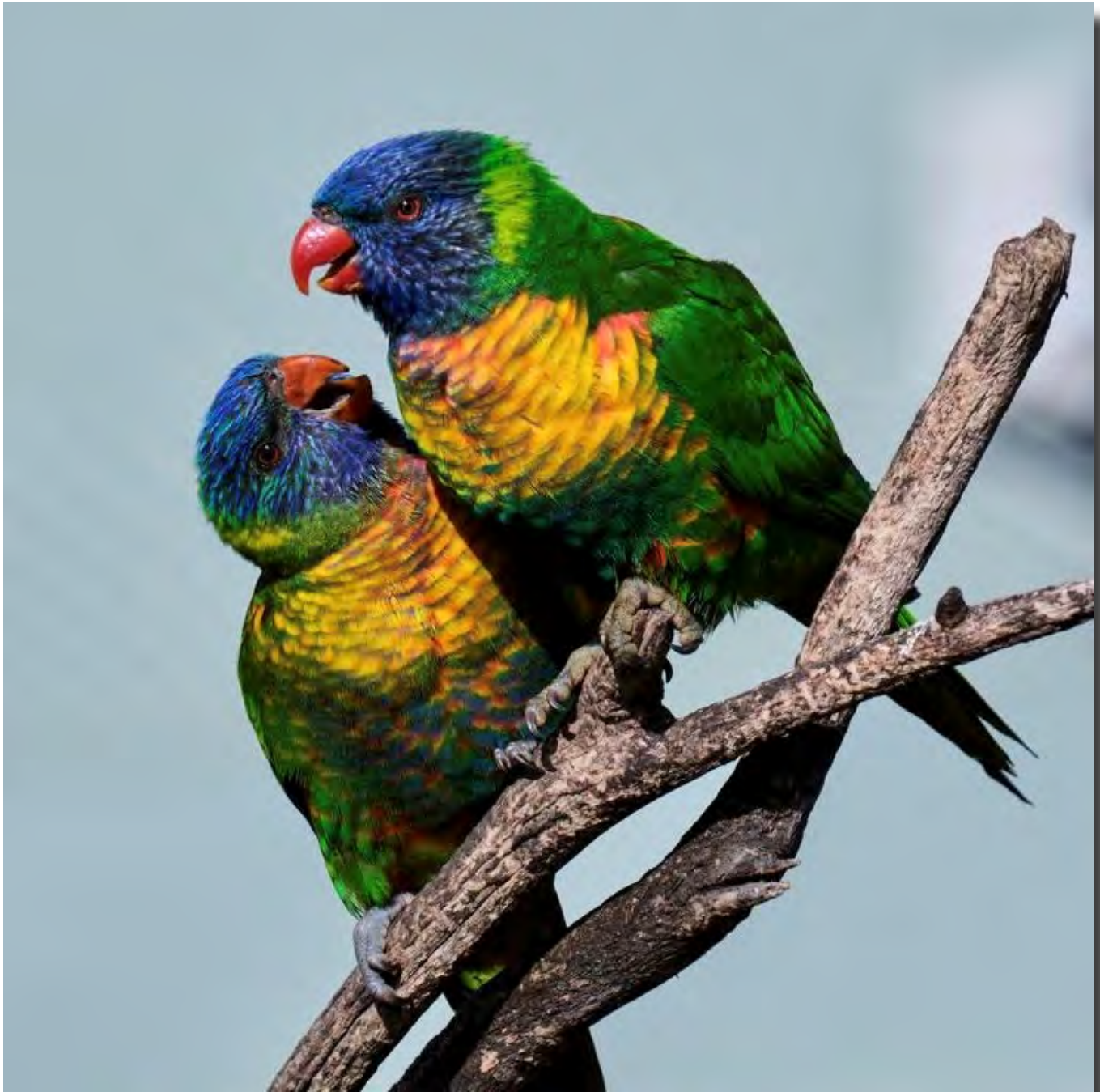
Rainbow Lorikeets Fujifilm XT3, Fujifilm XF55-200, f5 Subramaniam Sukumar