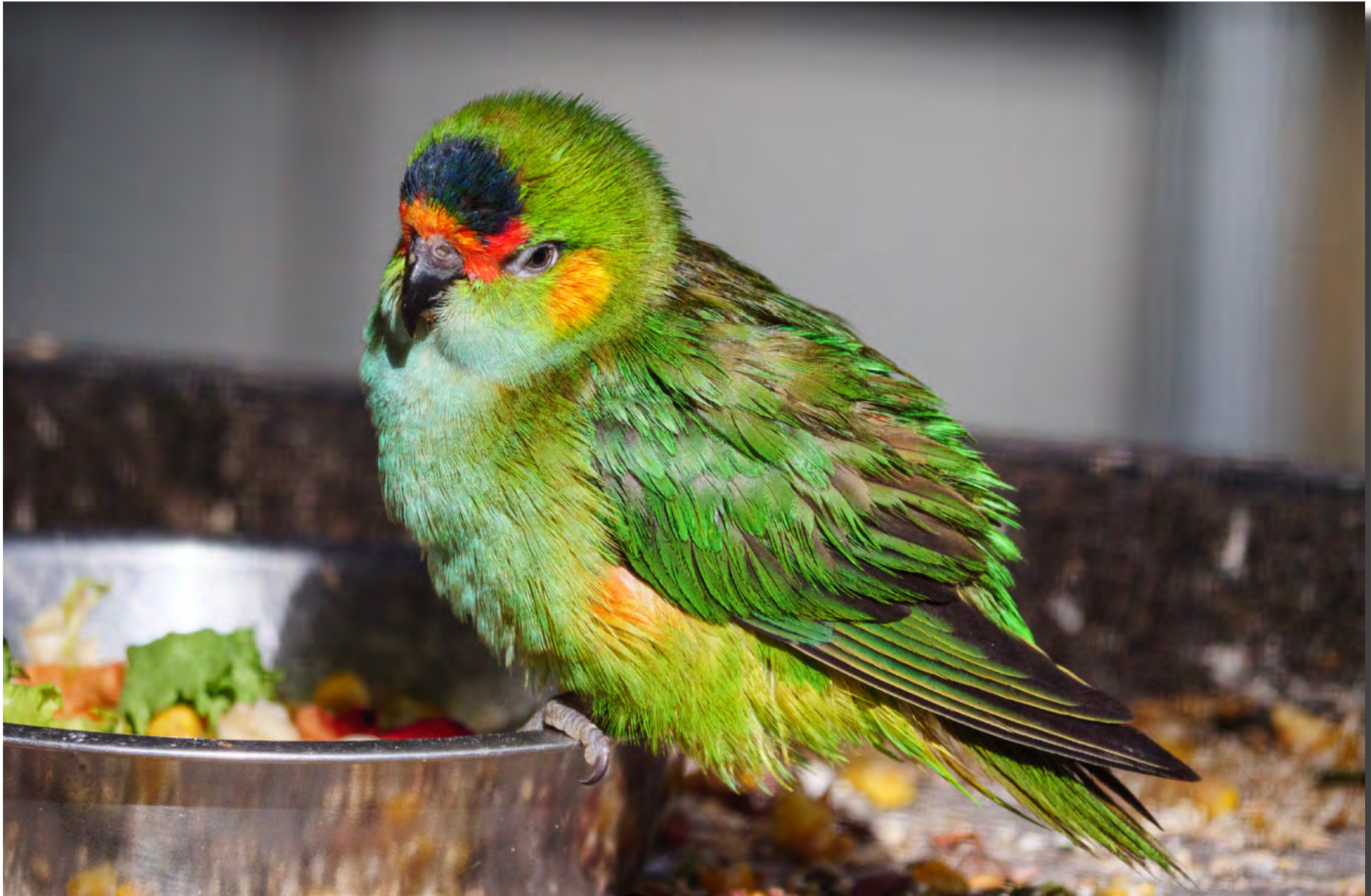
Walk-in bird aviary, Federation Square: taken through 1' wire mesh Helen Dawes