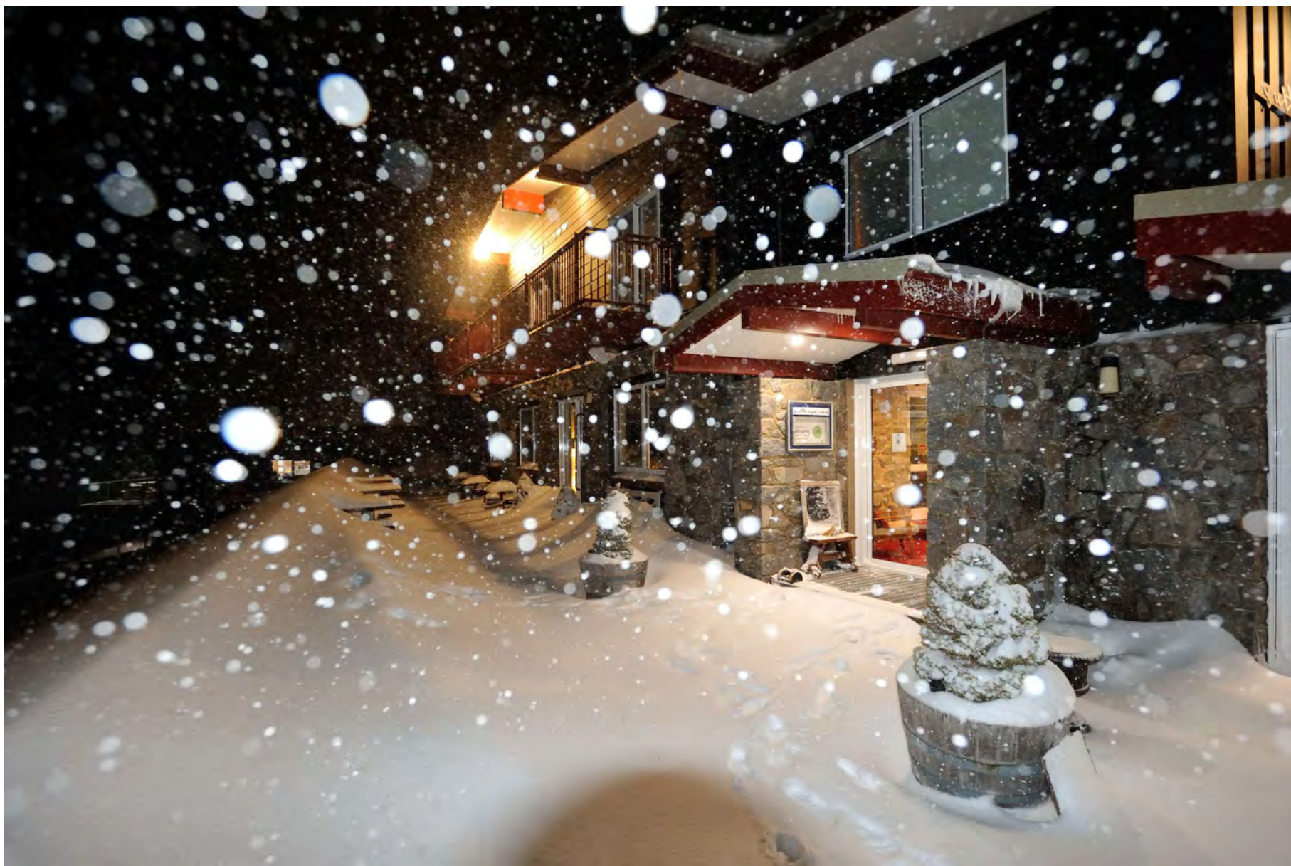
Guthaga Inn July 2021 handheld Nikon D700, ISO 3200, f2.8, 1/30, handheld with flash to highlight the snow Giles West