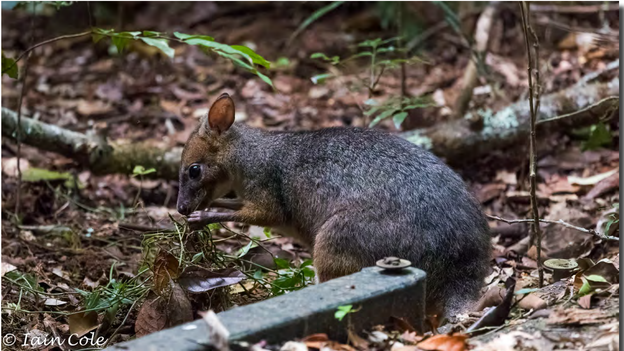
Red Necked Pademelon, near Malanda Falls