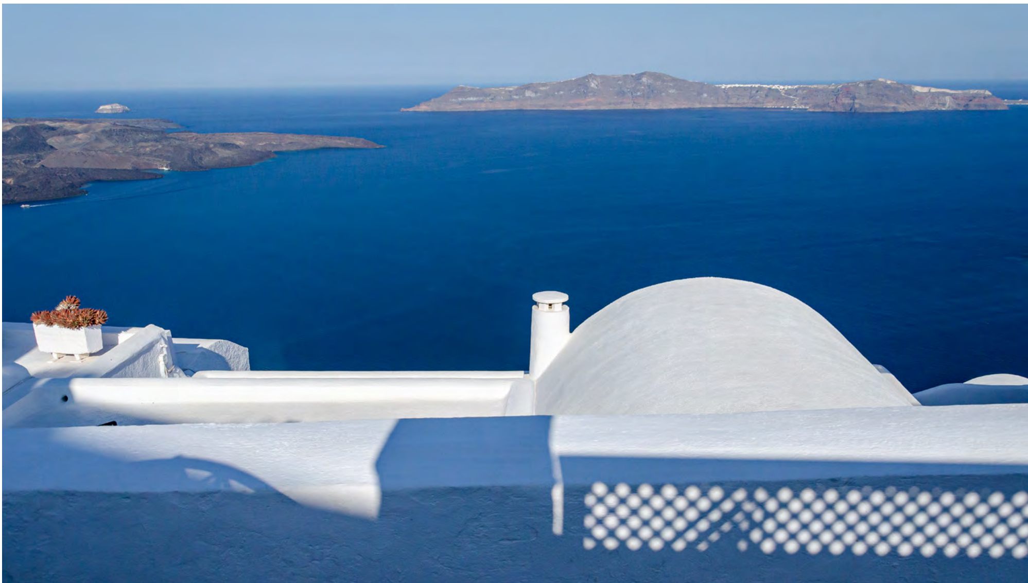
Santorini Nikon D7000 (APSC), Nikkor 18-105mm @ 18mm (27mm for Full Frame) f8, 1/250sec, ISO-200