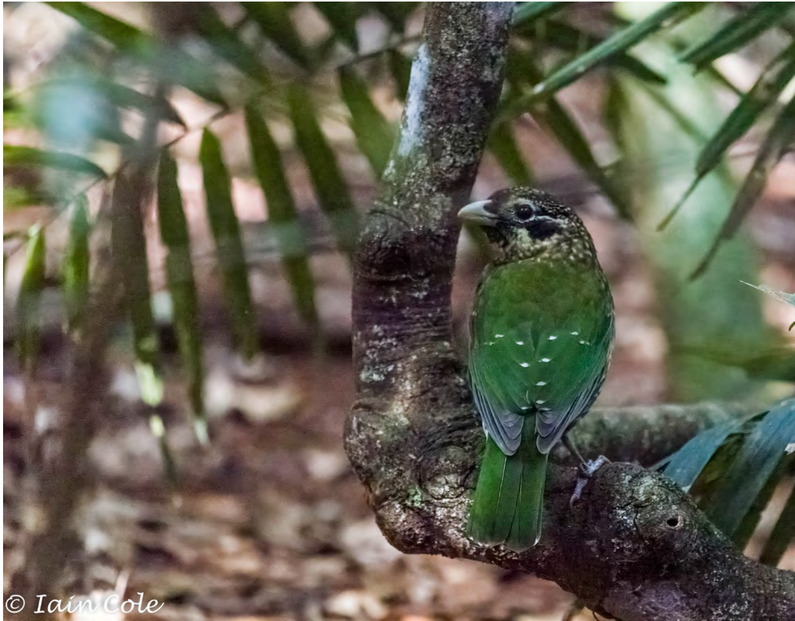
Spotted Catbird, near Malanda Falls Iain Cole