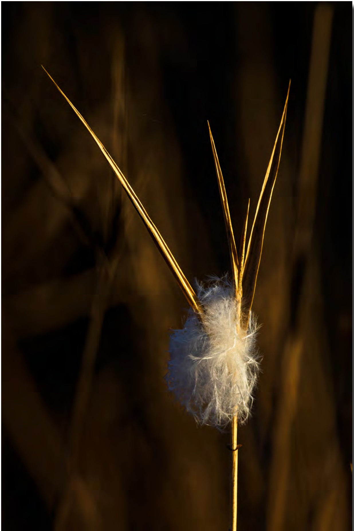
Relic of summer