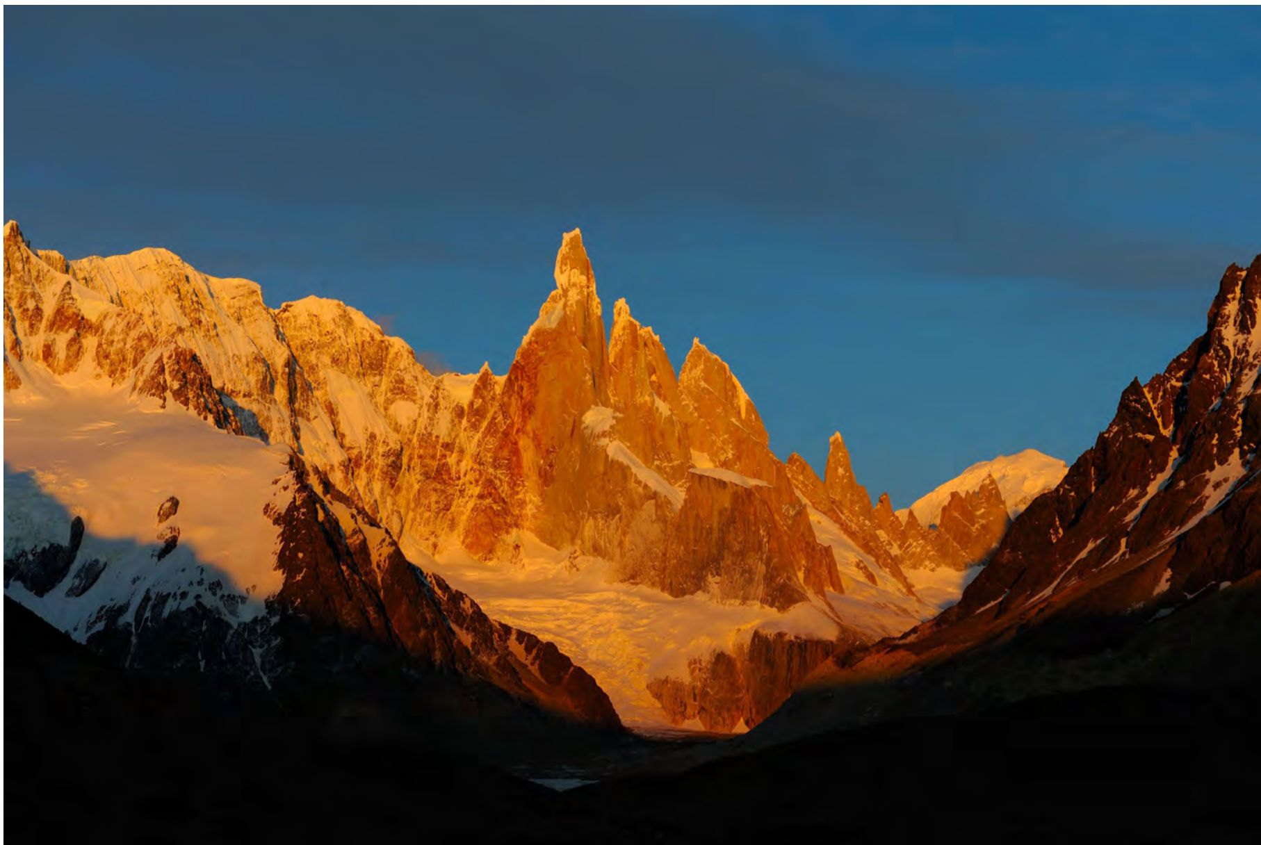
Patagonia El Chalten Cerro Torres November 2017, Nikon D700, ISO 200, f8, 1/160 Giles West