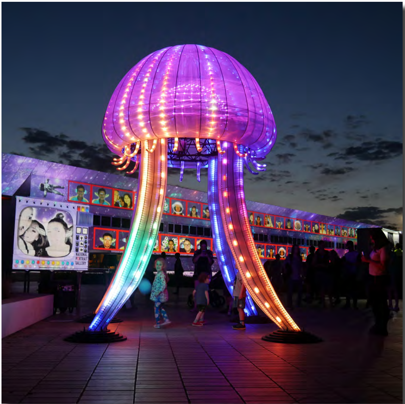
Kids Enjoying the Jelly Fish: at Enlighten March 2019 Lumix G7, f/3.5, 1/25, ISO 1000, 28 mm (35 mm equivalent focal length) Bill Blair