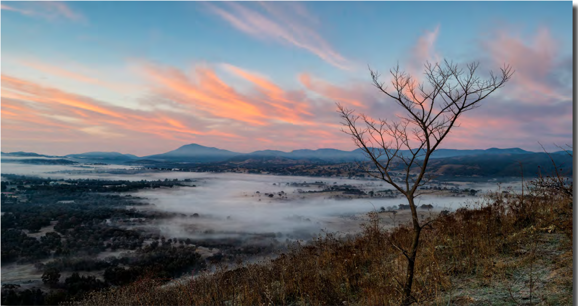
Dawn over the Murrumbidgee Valley