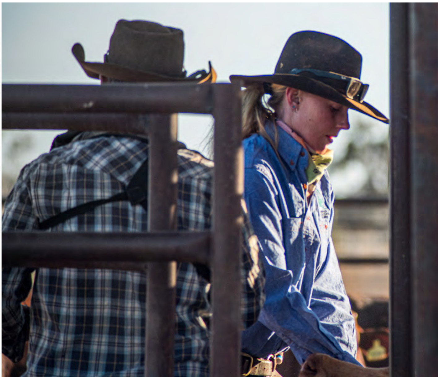
Jillaroo, Tobermorey Stn, NT, ISO 400, f5.6, 1-500s, 300 mm Warren Hicks