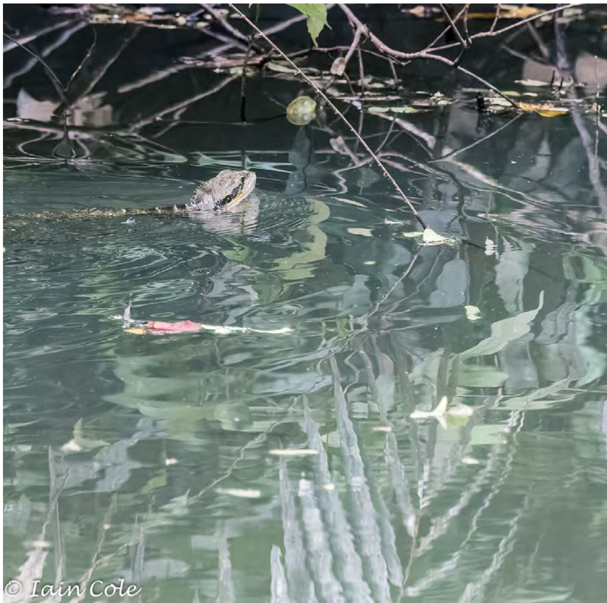
Water dragon swimming on the South Johnstone River, Malanda