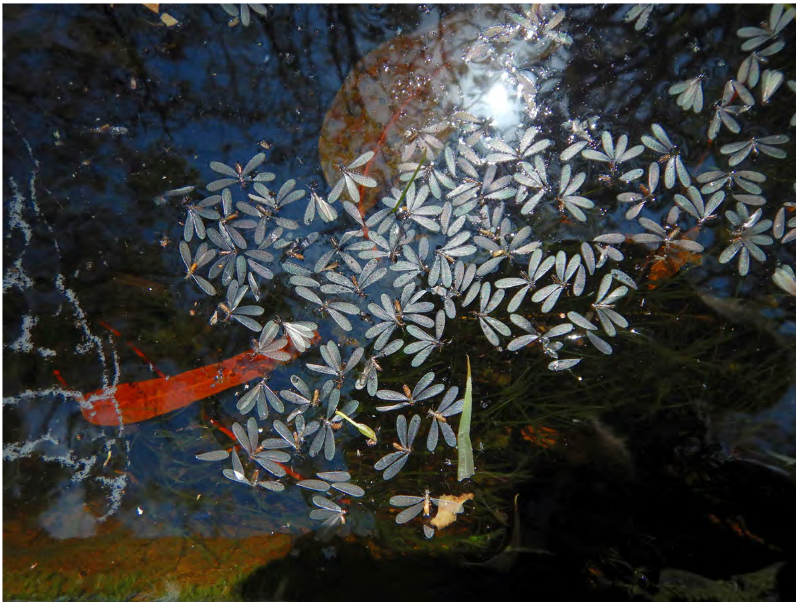
Winged termites Ben Boyde National Park Nikon W300, ISO 200, auto Giles West