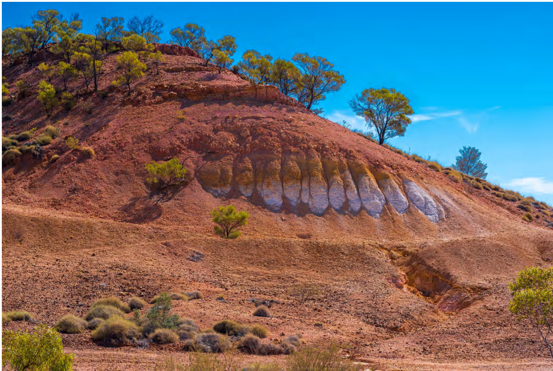
Laterite Mesa, Lark Quarry, Winton, Qld, ISO 100, f9, 1-160, 90mm Warren Hicks