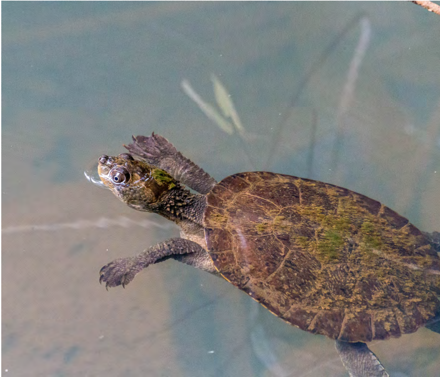
Saw-shelled Turtle, South Johnstone River, Malanda