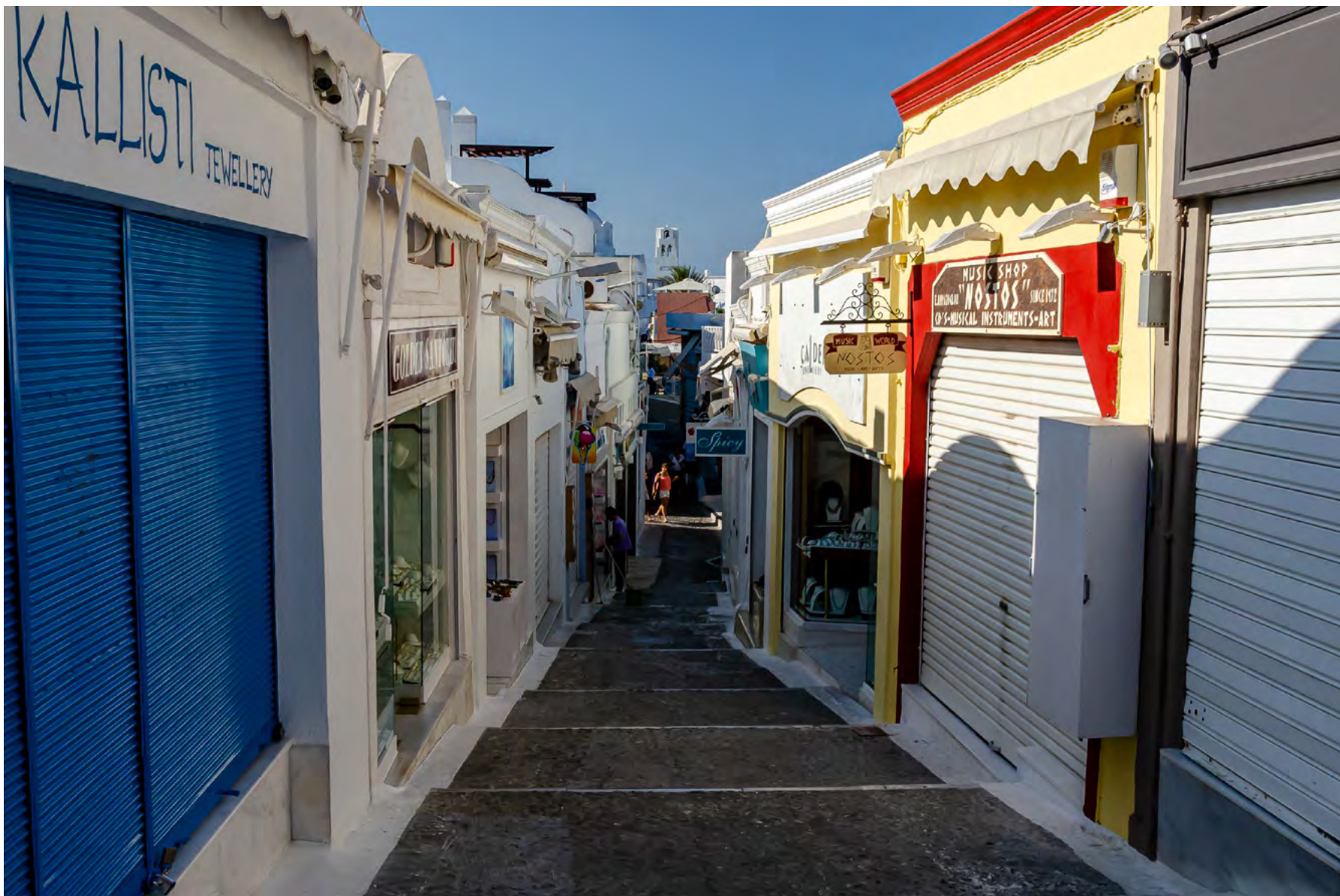
Santorini Nikon D7000 (APSC), Nikkor 18-105mm @ 18mm (27mm for Full Frame) f10, 1/320sec, ISO-200