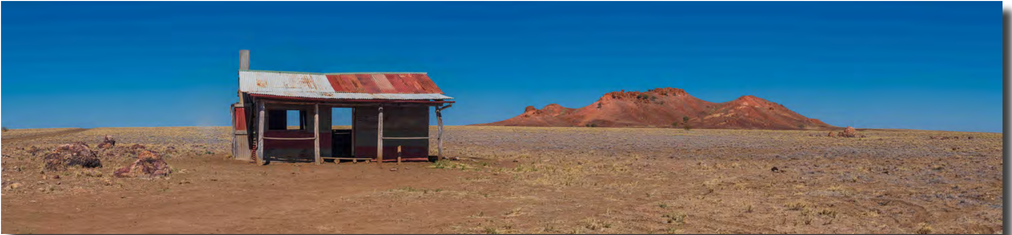
Goldstone movie set, Middleton, Kennedy Dev Rd. Qld, Pano 24 frames, ISO 400, f11, 1-1000s, 90mm