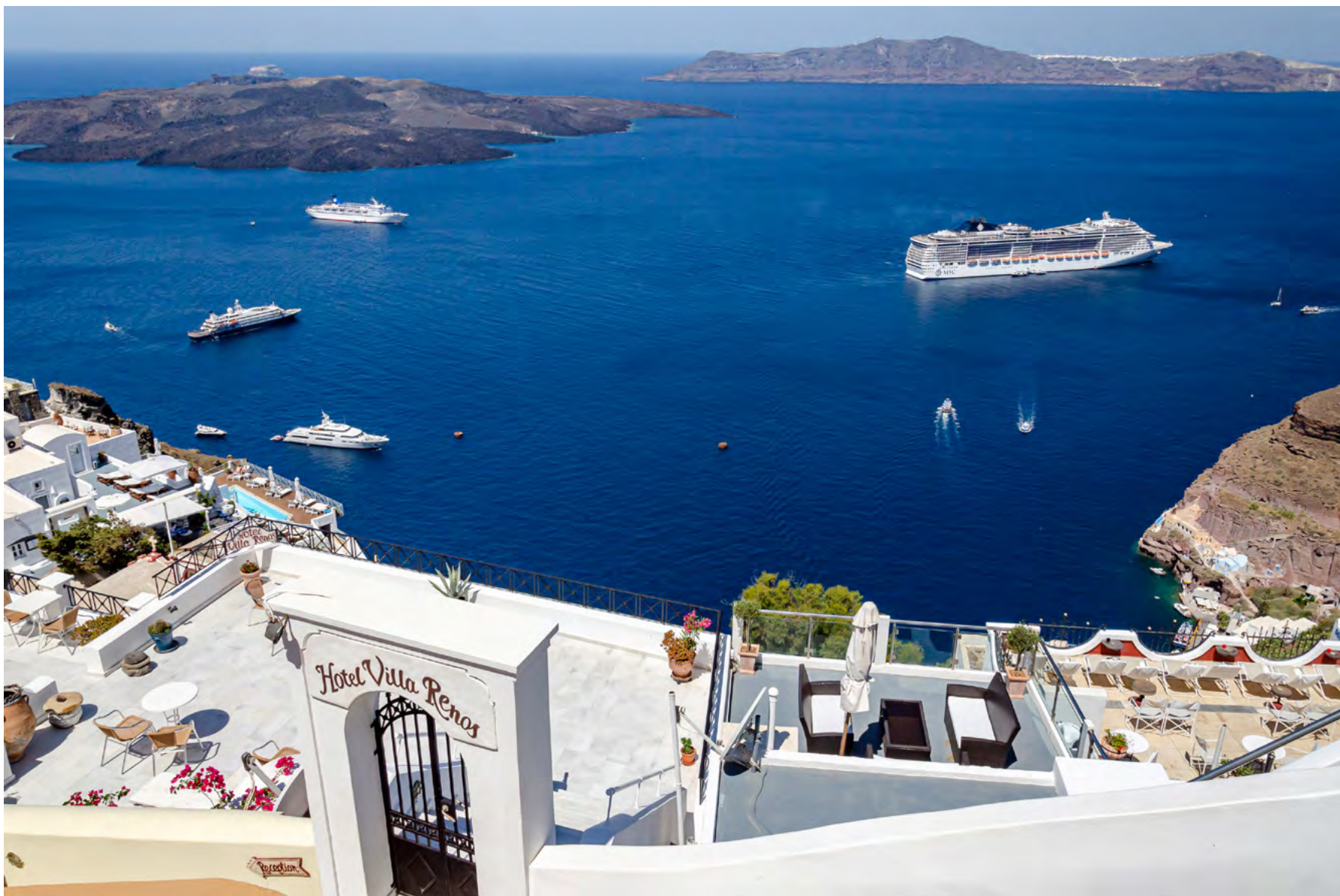
Santorini Nikon D7000 (APSC), Nikkor 18-105mm @ 18mm (27mm for Full Frame) f11, 1/800sec, ISO-200