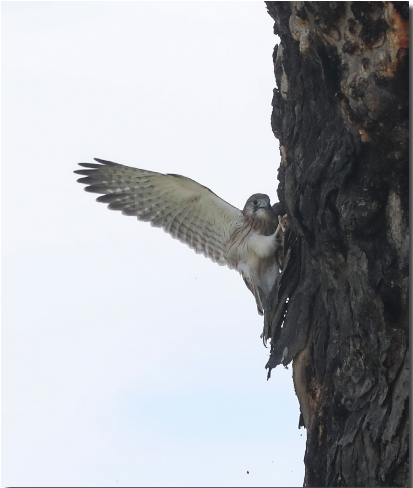
Young Kestrel