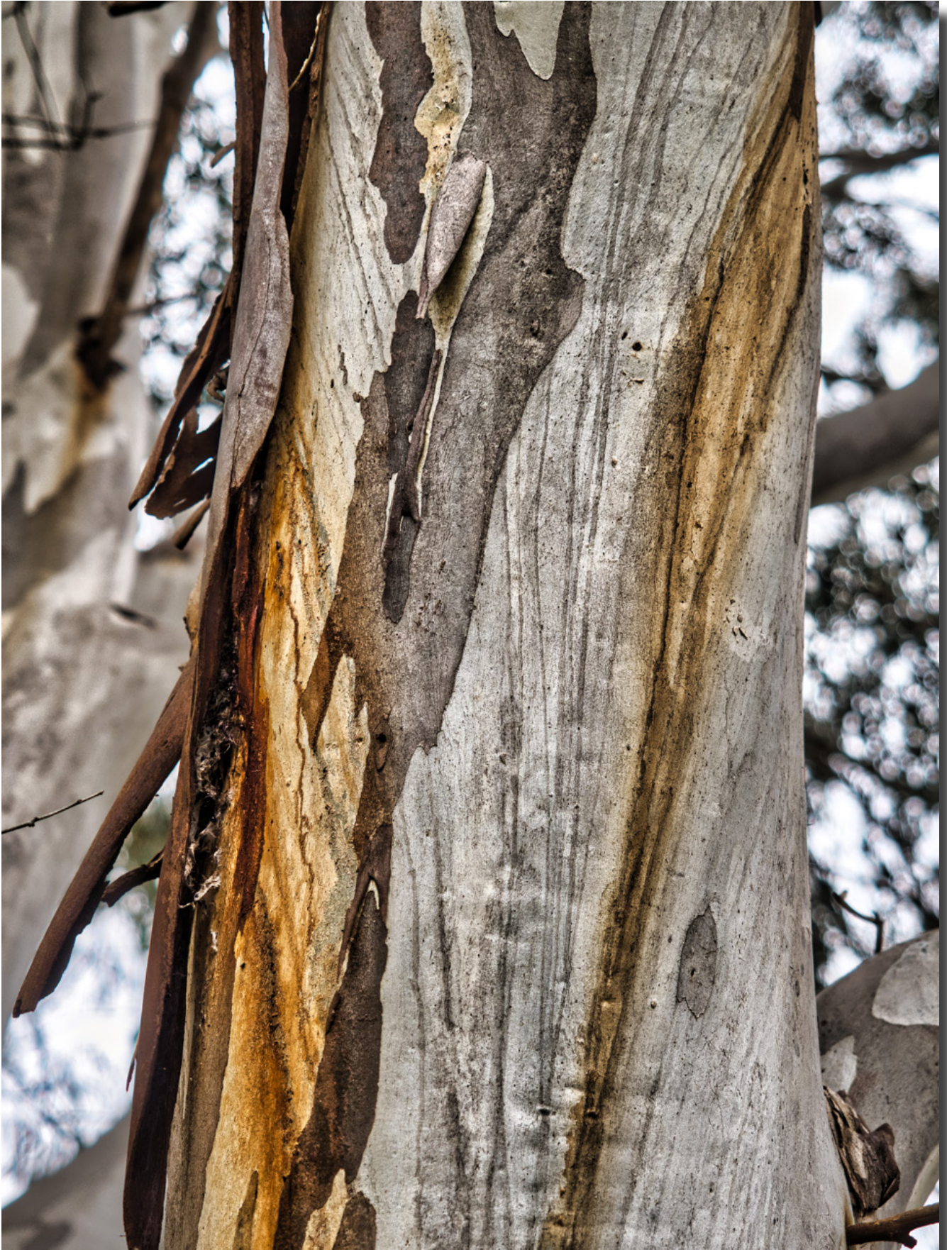
Eucalyptus Mannifera bark Laurie Westcott