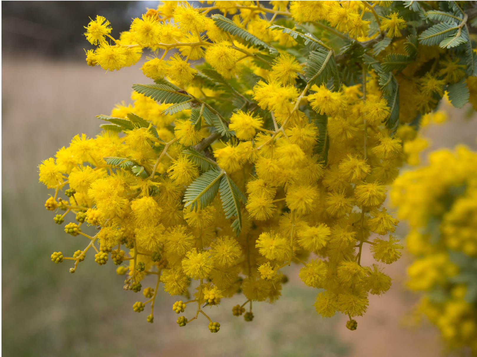
Spring Wattle Laurie Westcott