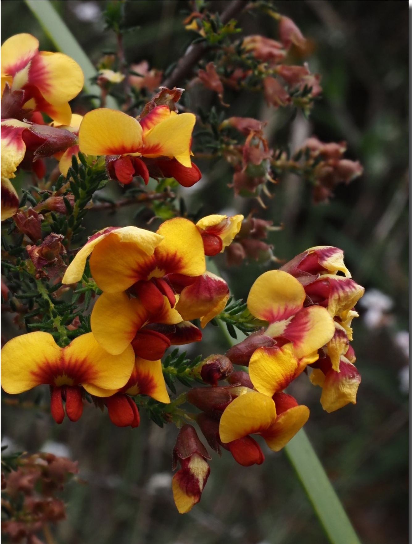
Small-leaf Parrot-Pea on Black Mountain Laurie Westcott