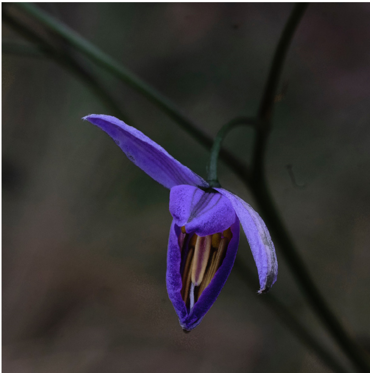
Waxlip orchid, Black Mountain Subramaniam Sukumar