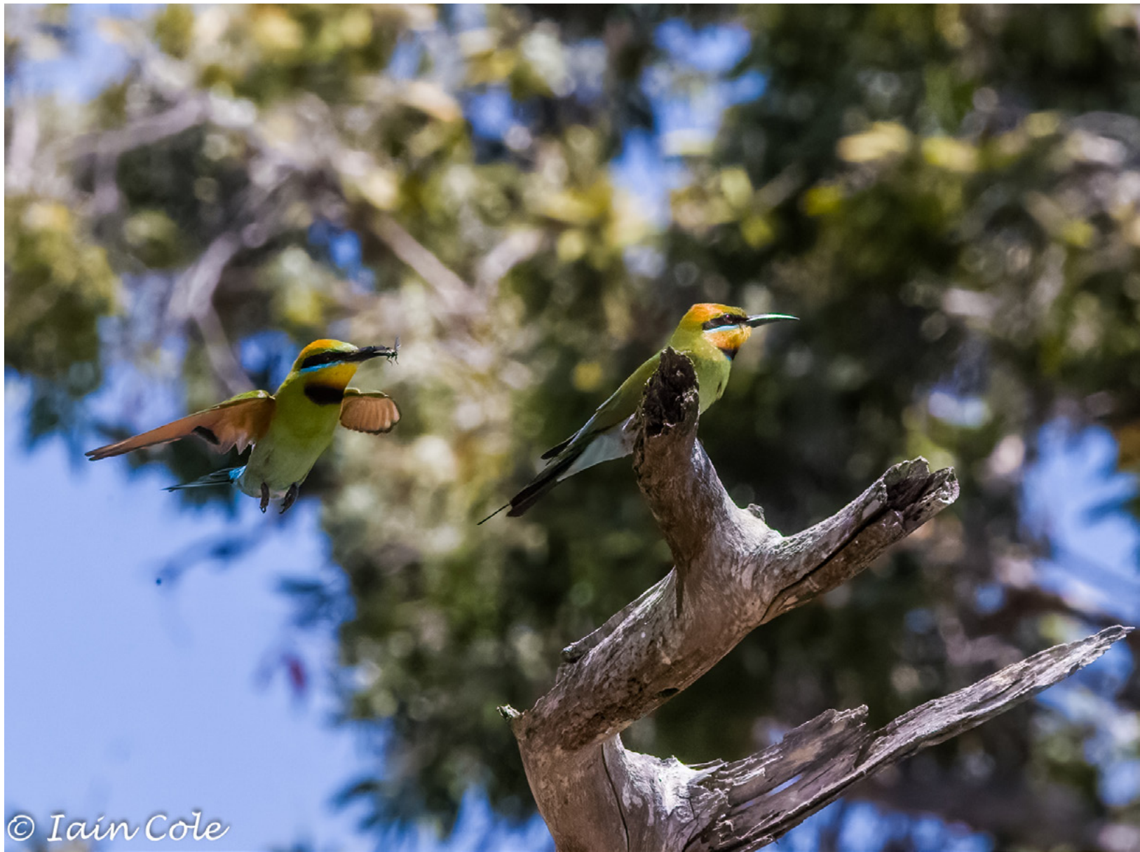
Bringing home the bacon part 1. Rainbow Bee-eaters at Seaforth Iain Cole