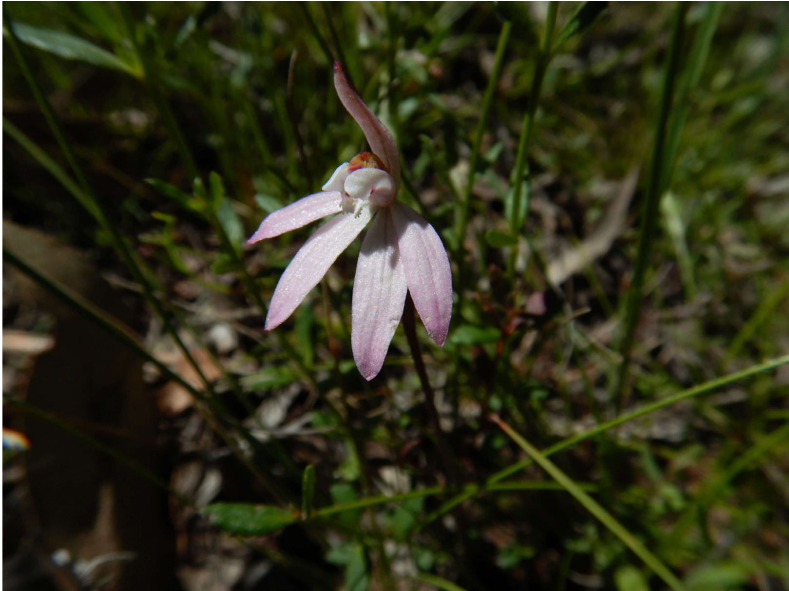
Dusky fingers orchid Giles West