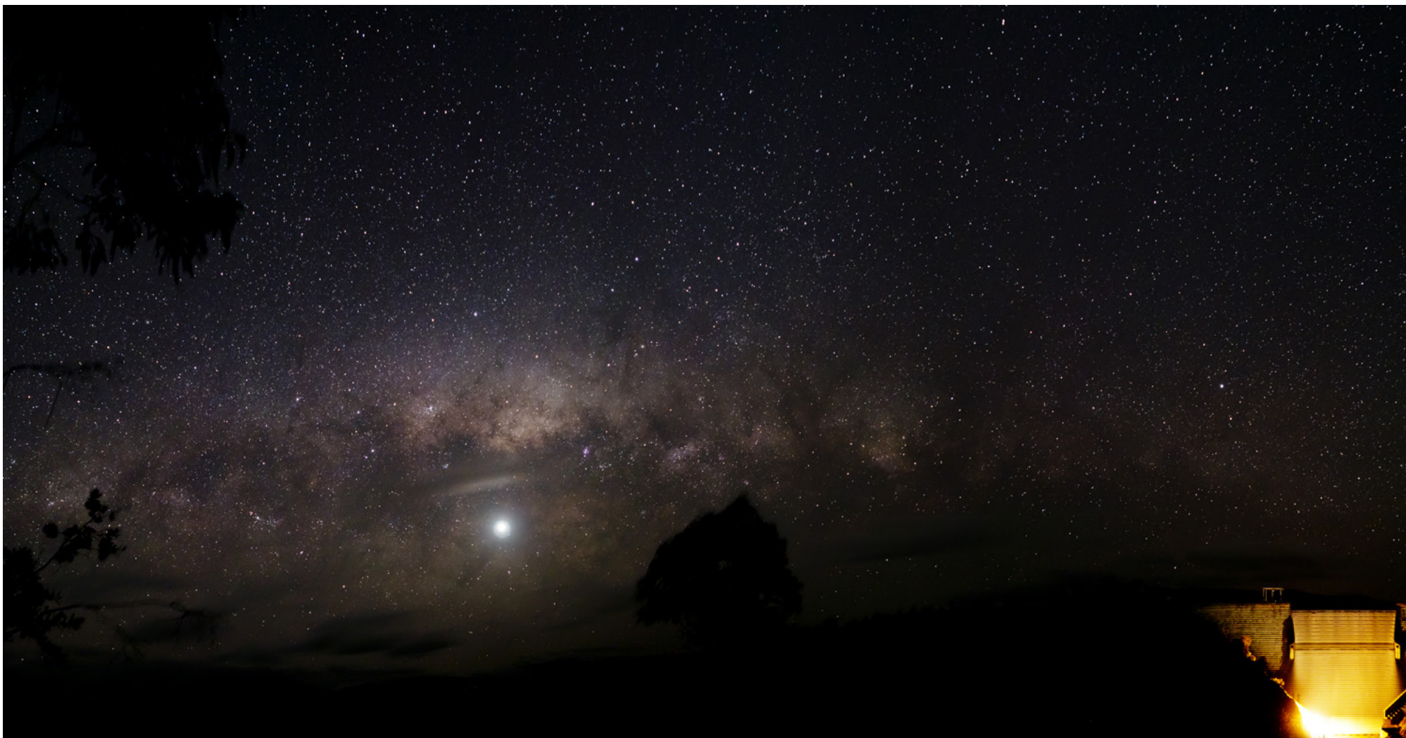
Milky Way over Cotter Dam