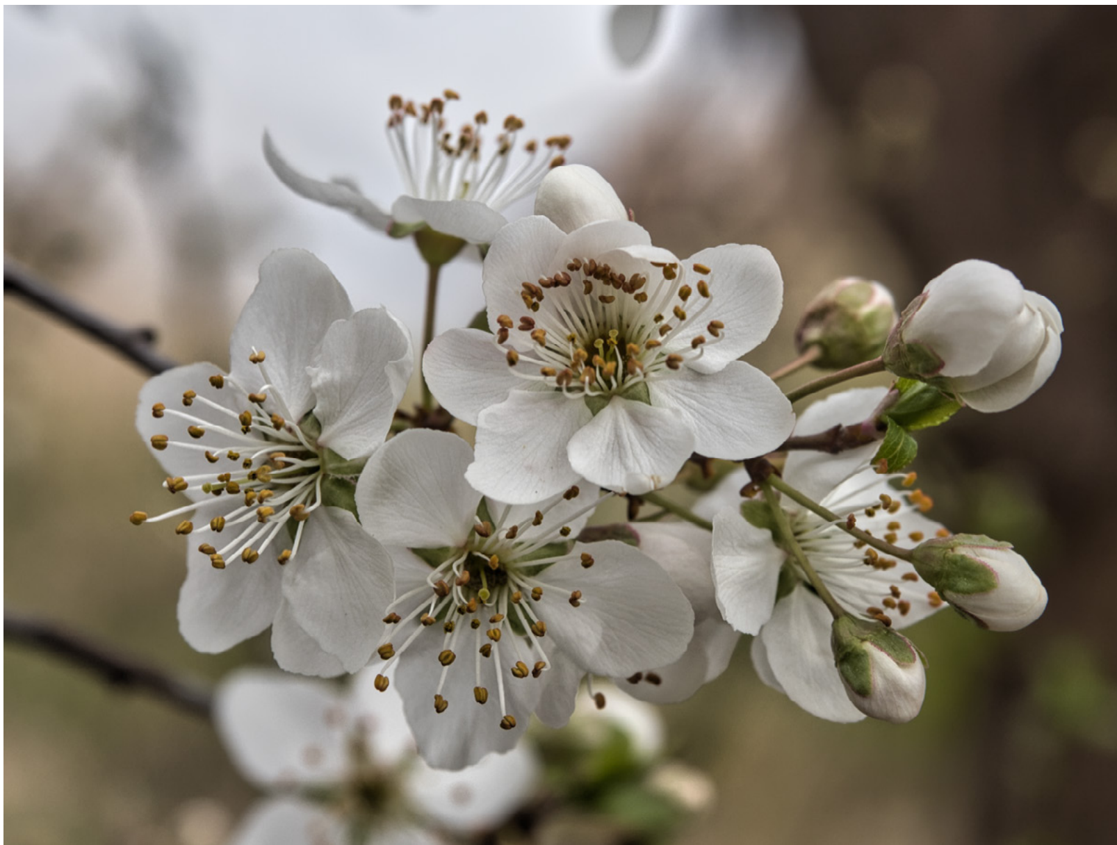
Spring Plum Laurie Westcott