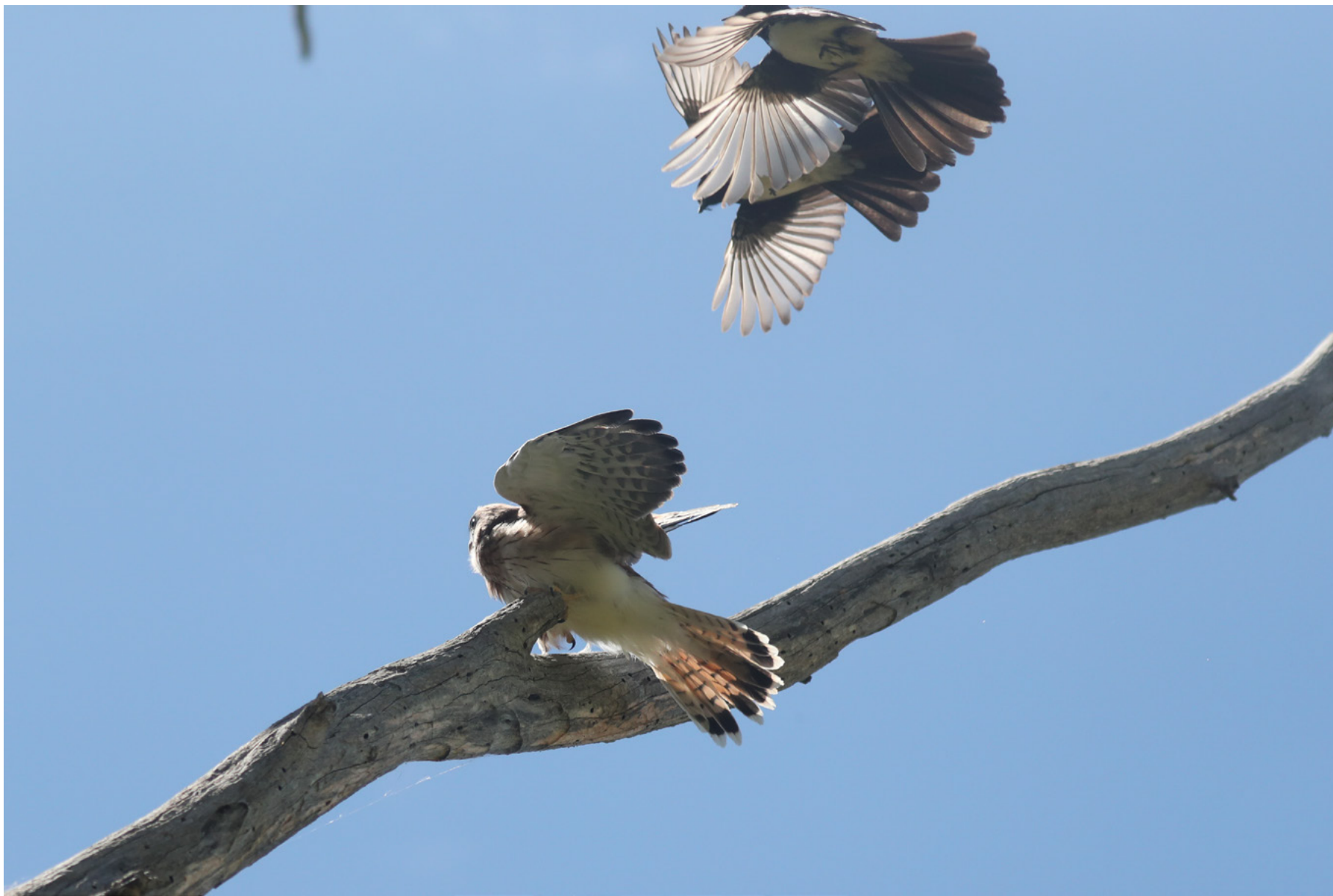
Willie Wagtails protecting a nearby nest with four chicks Alison Milton