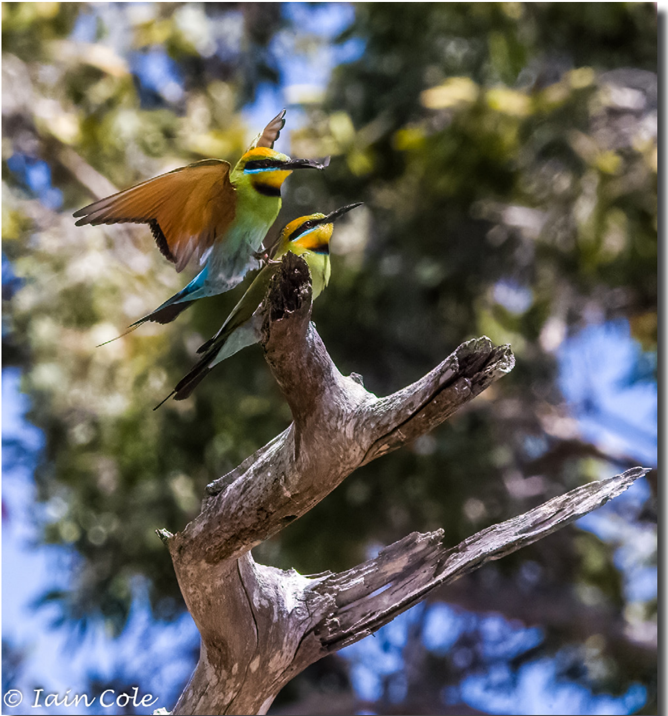
Bringing home the bacon part 2. Rainbow Bee-eaters at Seaforth Iain Cole