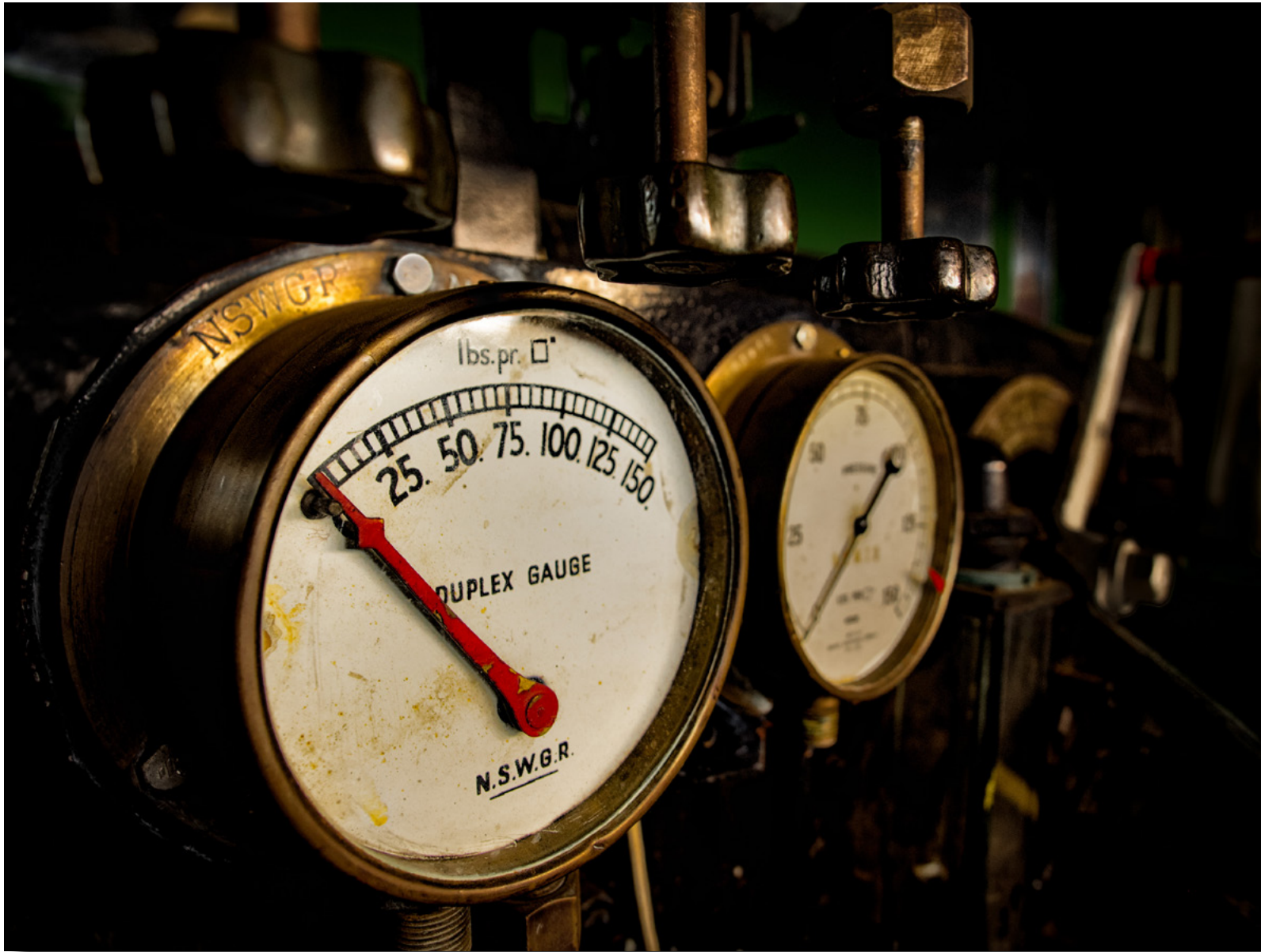
Gauges and valves, NSW Class Z24 locomotive