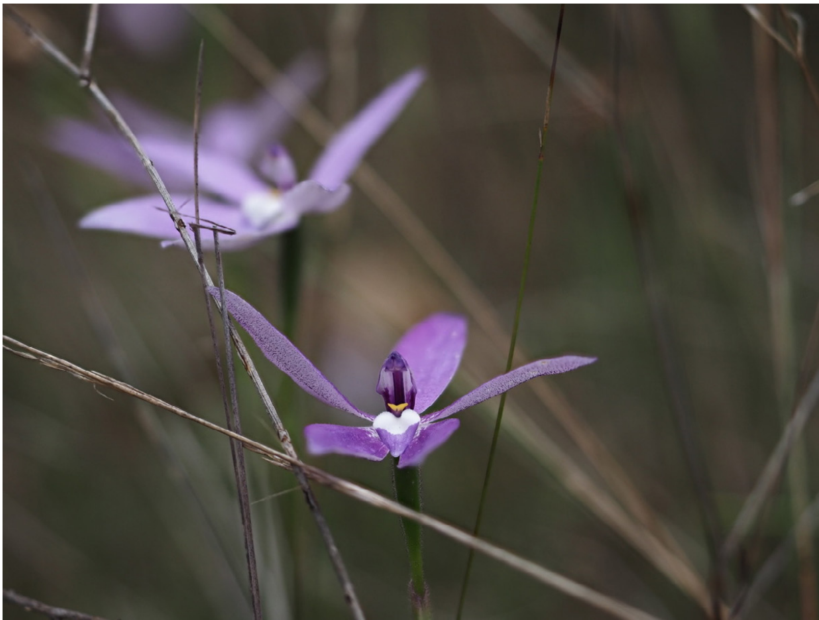
Waxlip orchid, Black Mountain Laurie Westcott