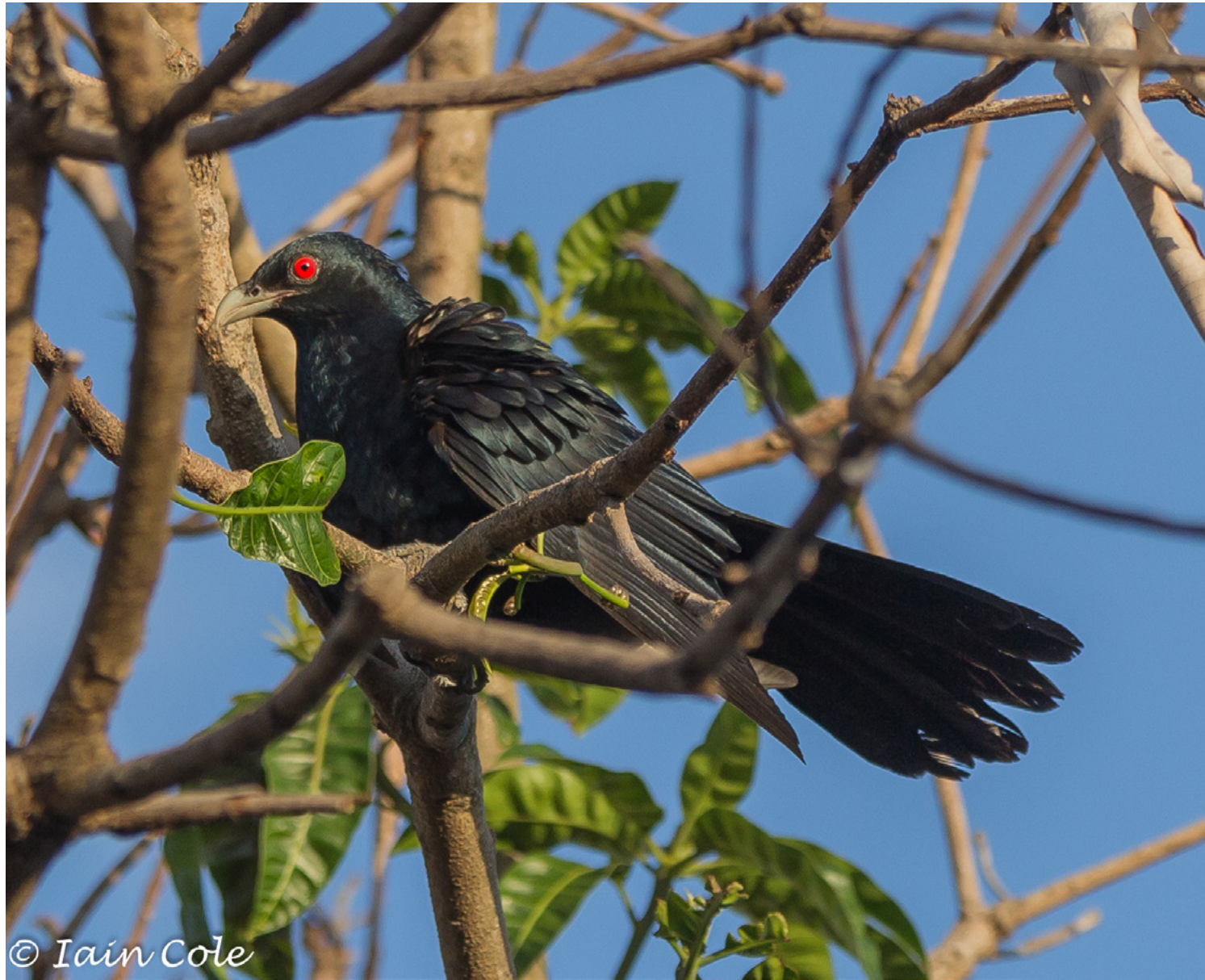
Eastern Koel at Mackay Iain Cole