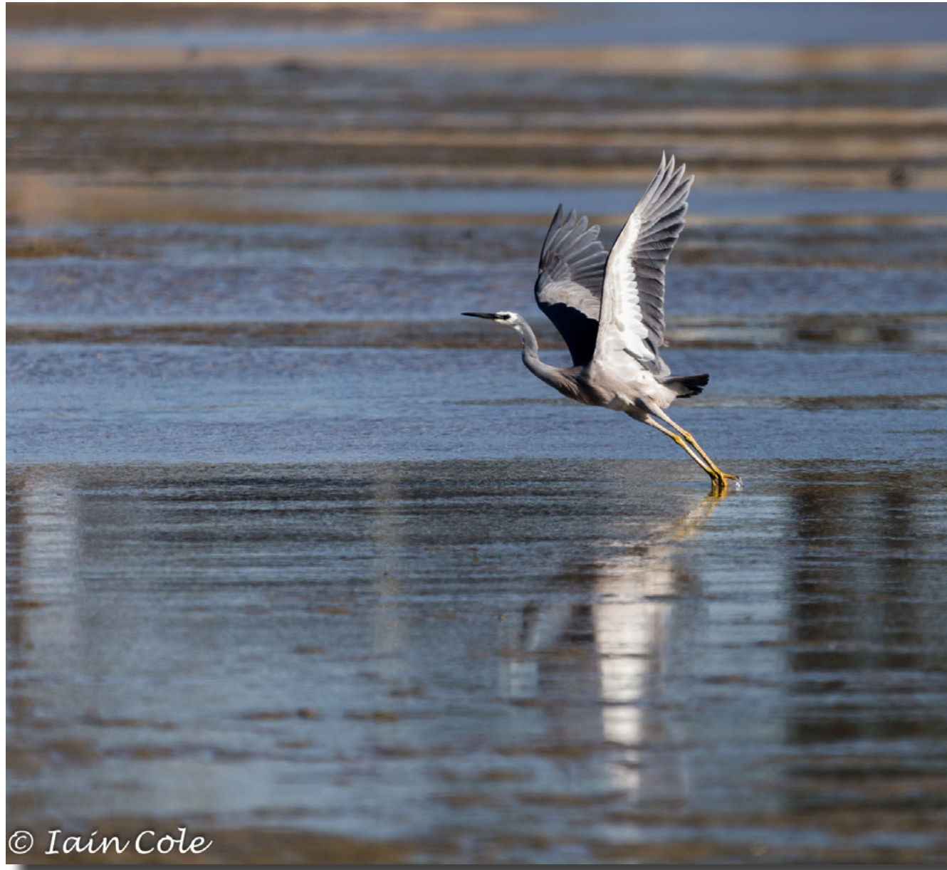
The Leap. Blue Heron at low tide Iain Cole