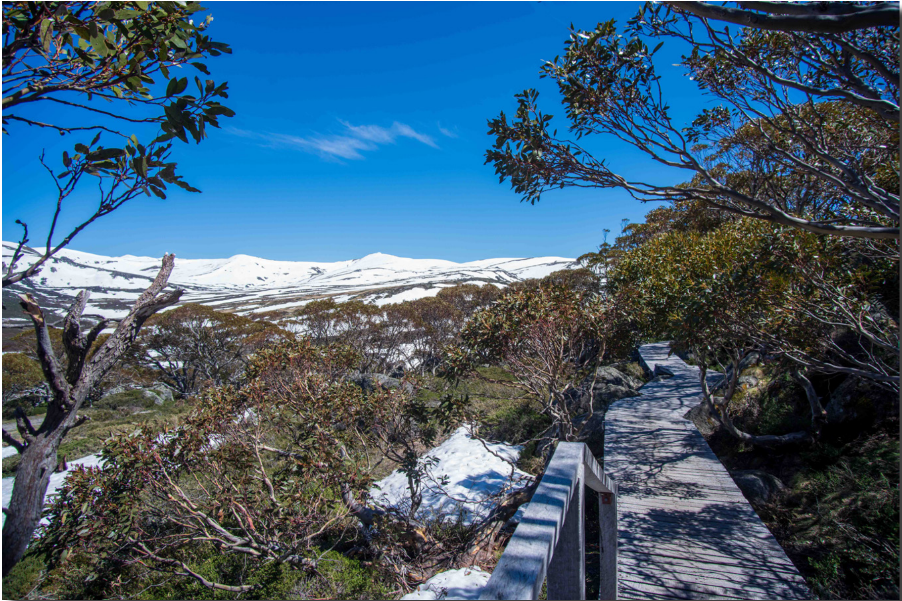
Charlottes Pass late October Warren Hicks