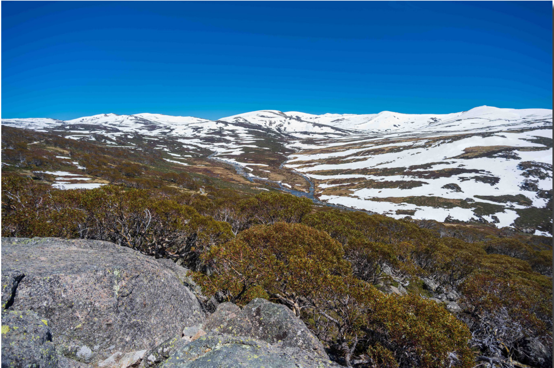
Charlottes Pass Lookout late October Warren Hicks