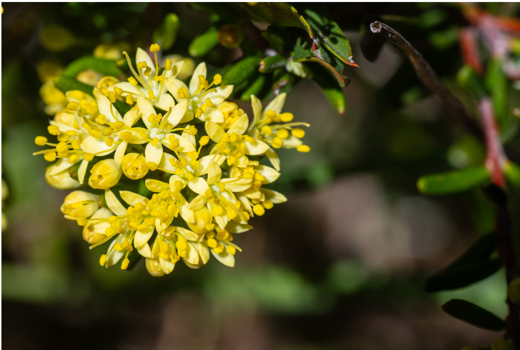
Alpine Phebalium, Island Bend, Snowy River Warren Hicks