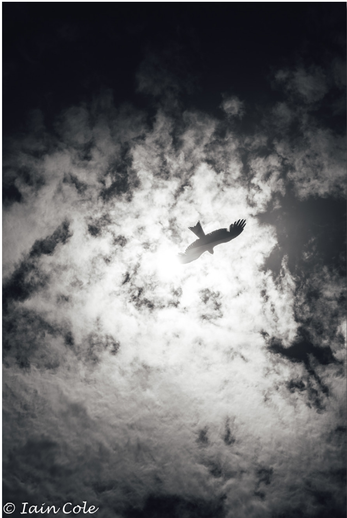
Icarus. Black Hawk crossing the sun Iain Cole