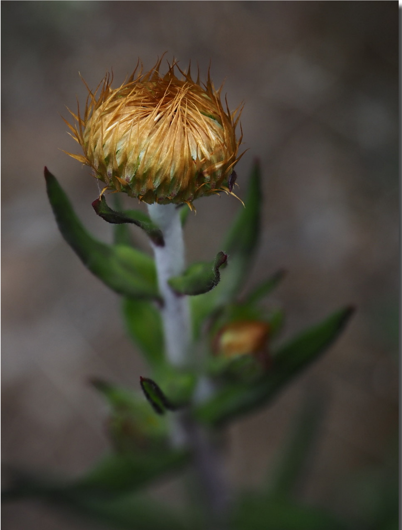
Daisy, Black Mountain Laurie Westcott