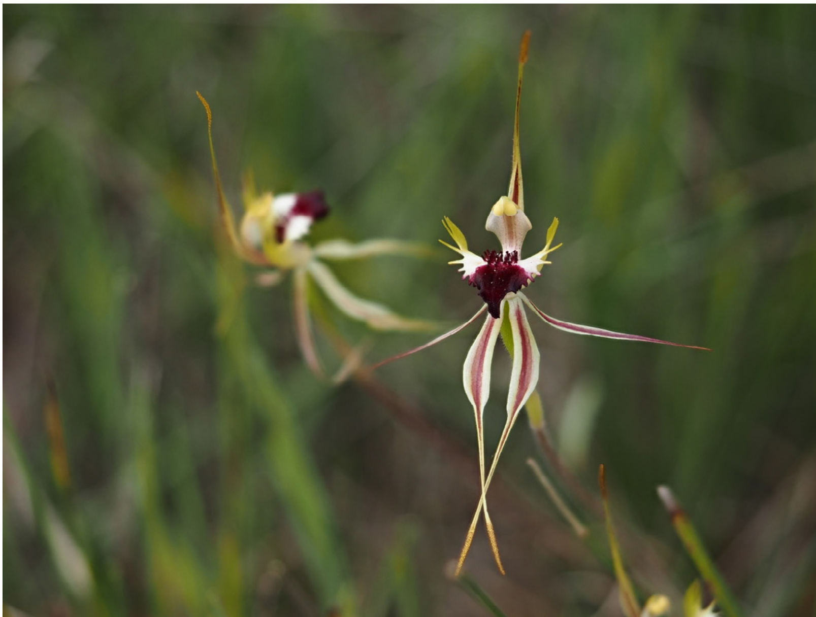
Green Comb Orchid, Black Mountain Laurie Westcott