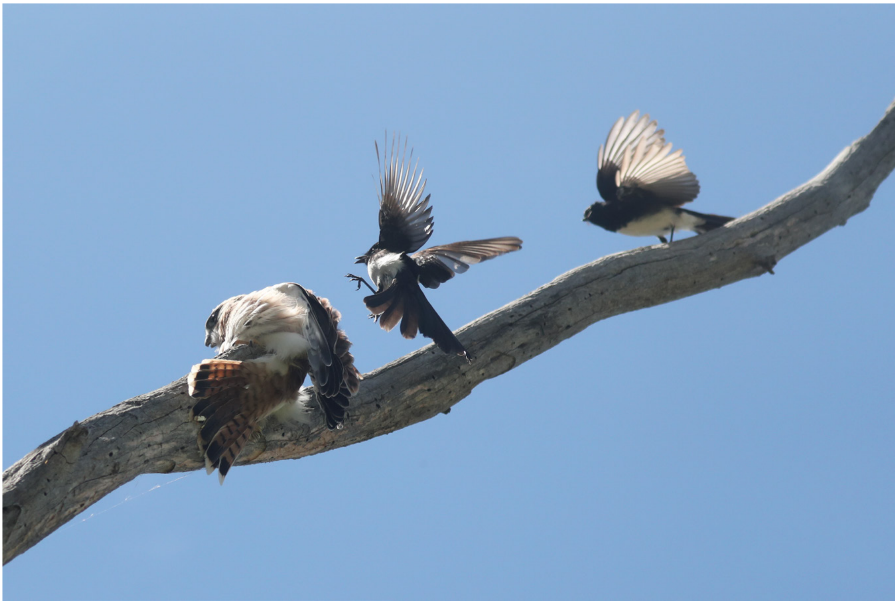
Willie Wagtails protecting a nearby nest with four chicks Alison Milton