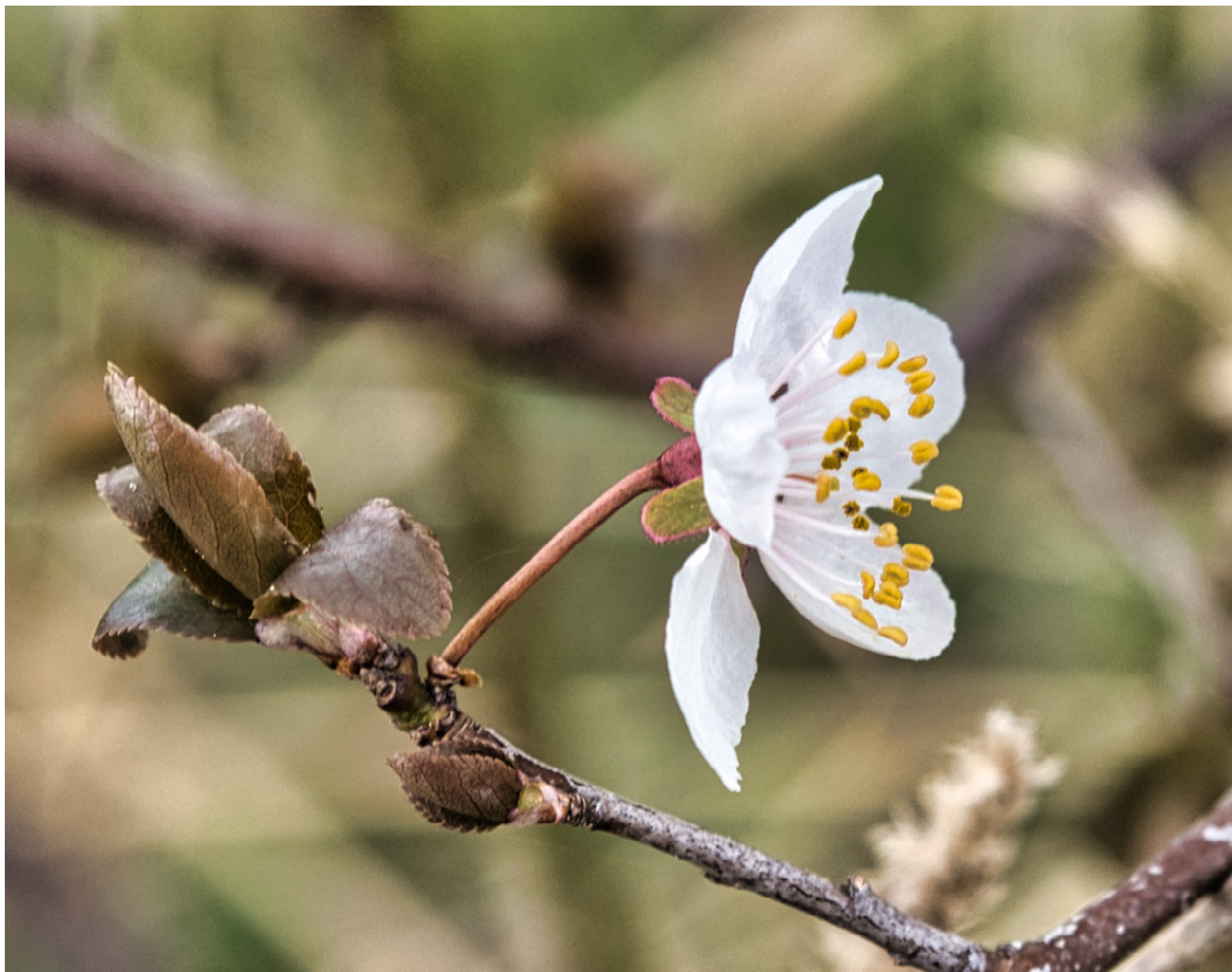
Spring Plum Laurie Westcott