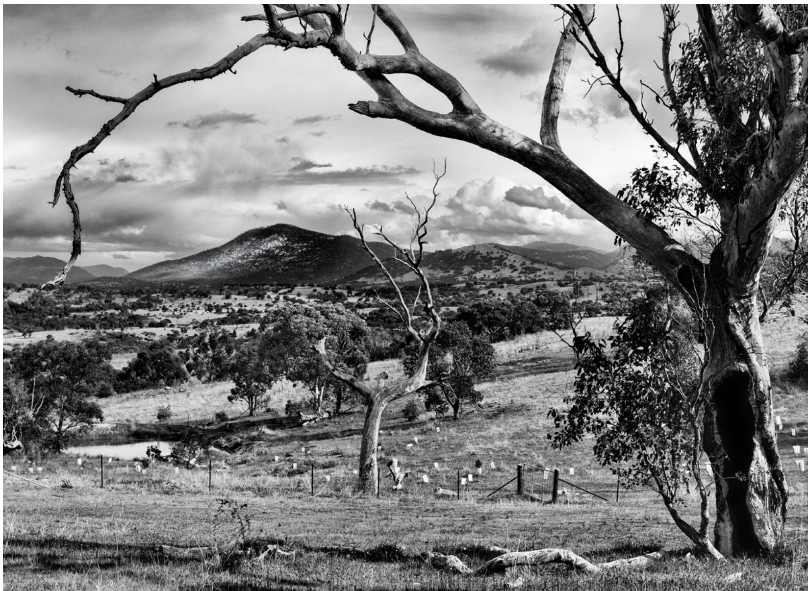
Mt Tennant and the Murrumbidgee Valley