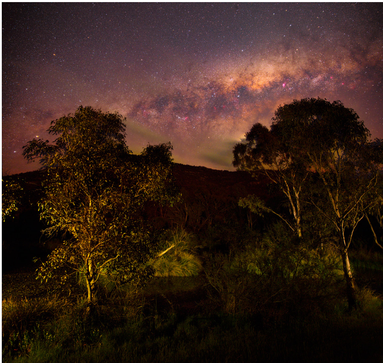
Namadgi Visitors Centre nightscape of the pond with the Milky Way