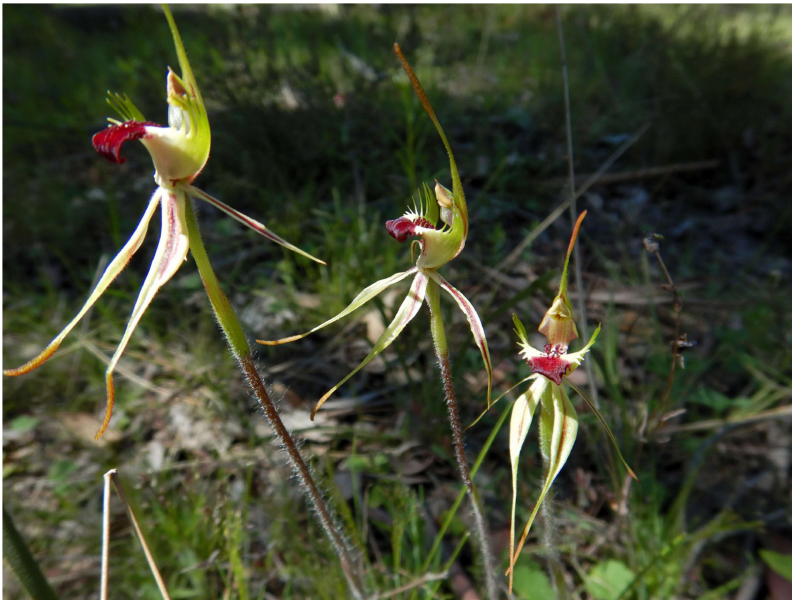
Green Comb Spider orchid Giles West