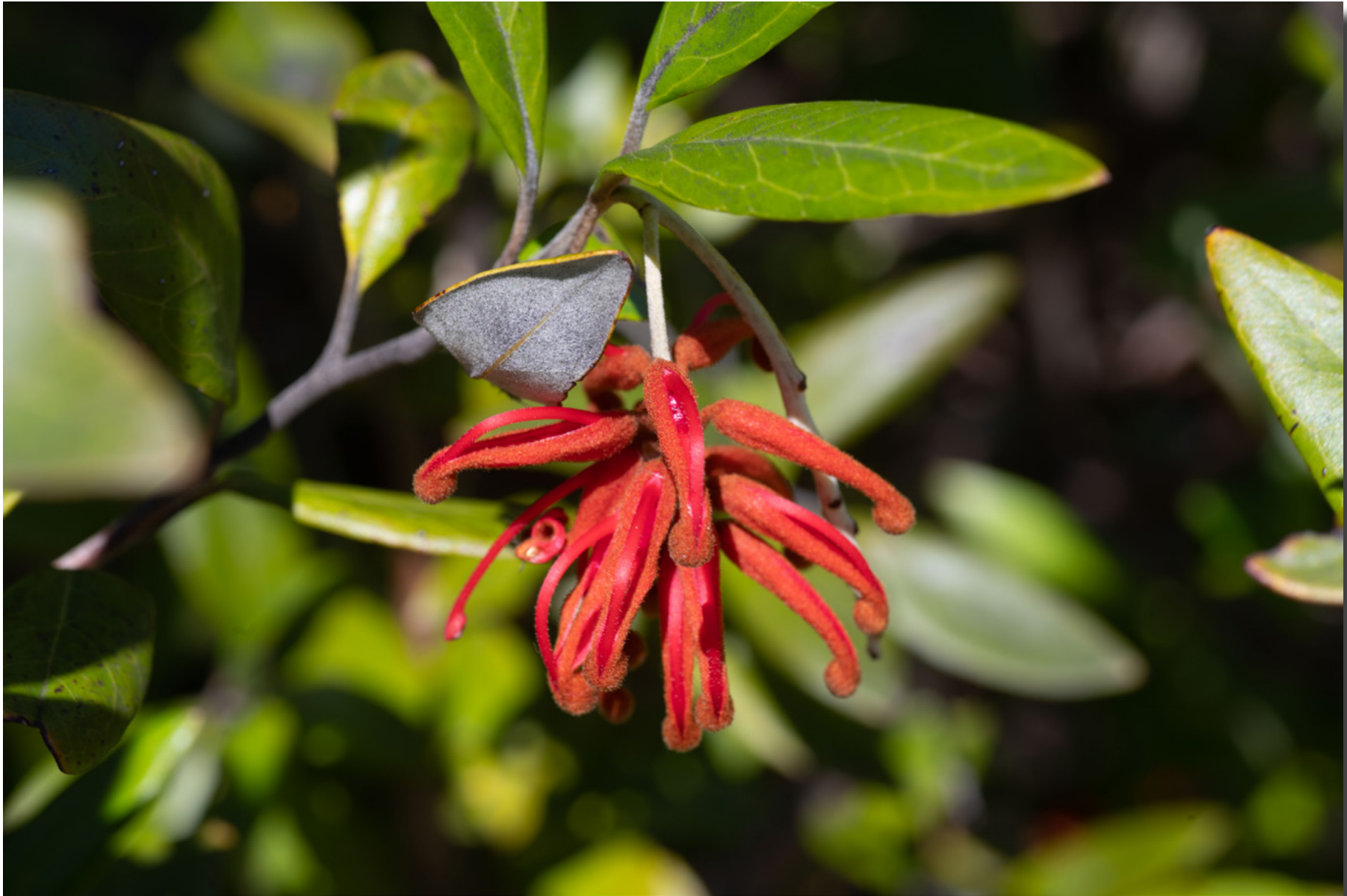
Grevillea victoriae , Island Bend, Snowy River Warren Hicks