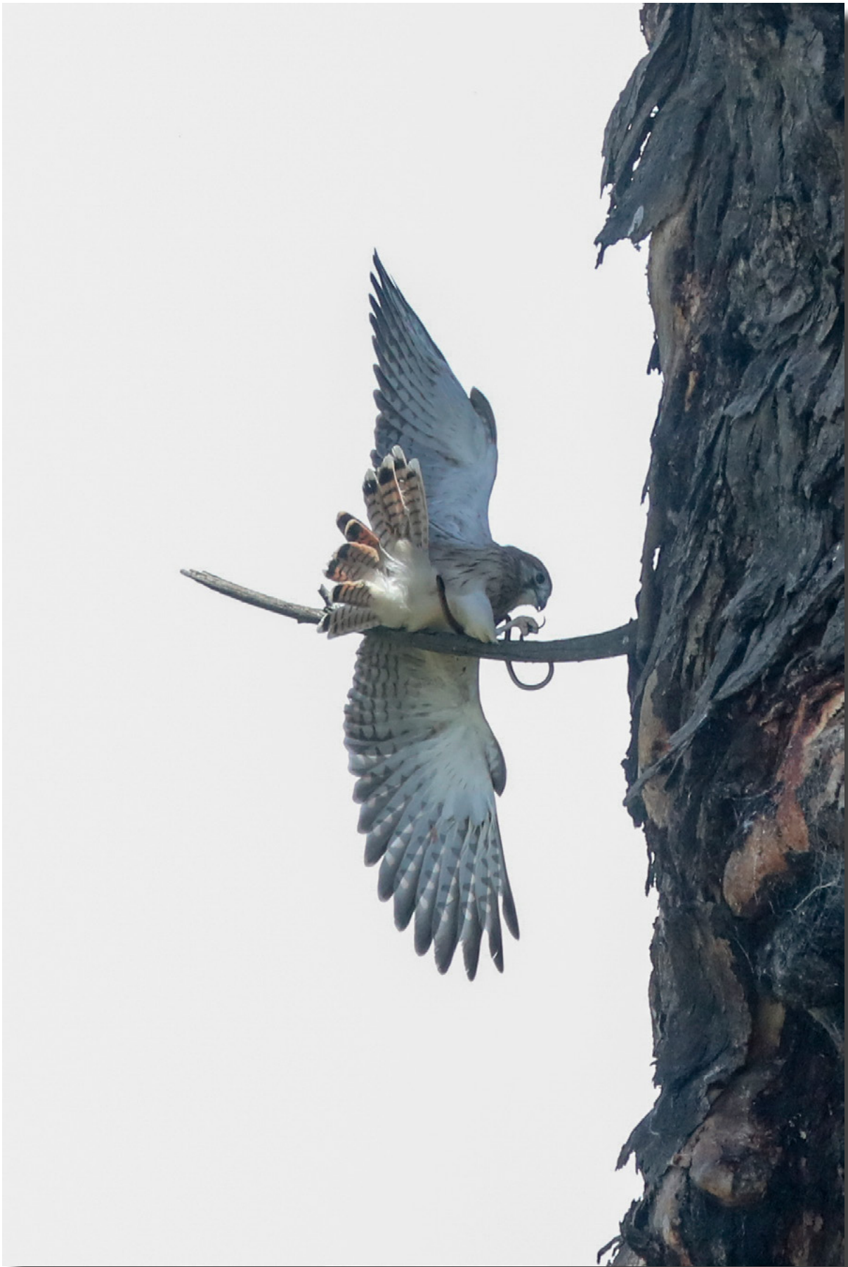
All mine: Young Kestrel claiming the offering from the parents