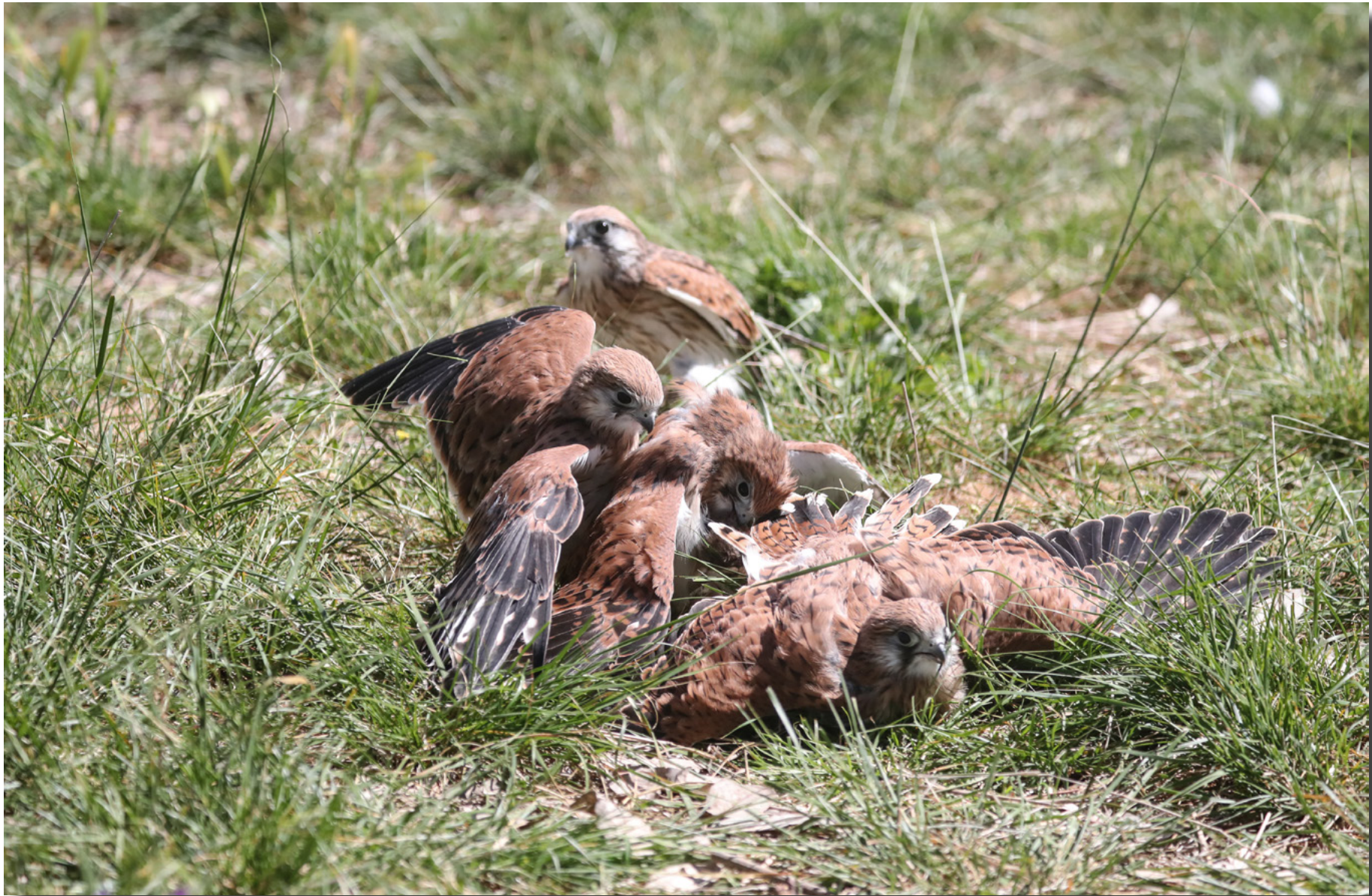
Best experience ever: mum brought in a mouse and one of the five Kestrel chicks took off with it and landed on the ground just a few metres in front of Dave and I. Then three more flew down and there was a mad scramble for the feed. Note photos not cropped: they were that close and only two of us to witness. Alison Milton