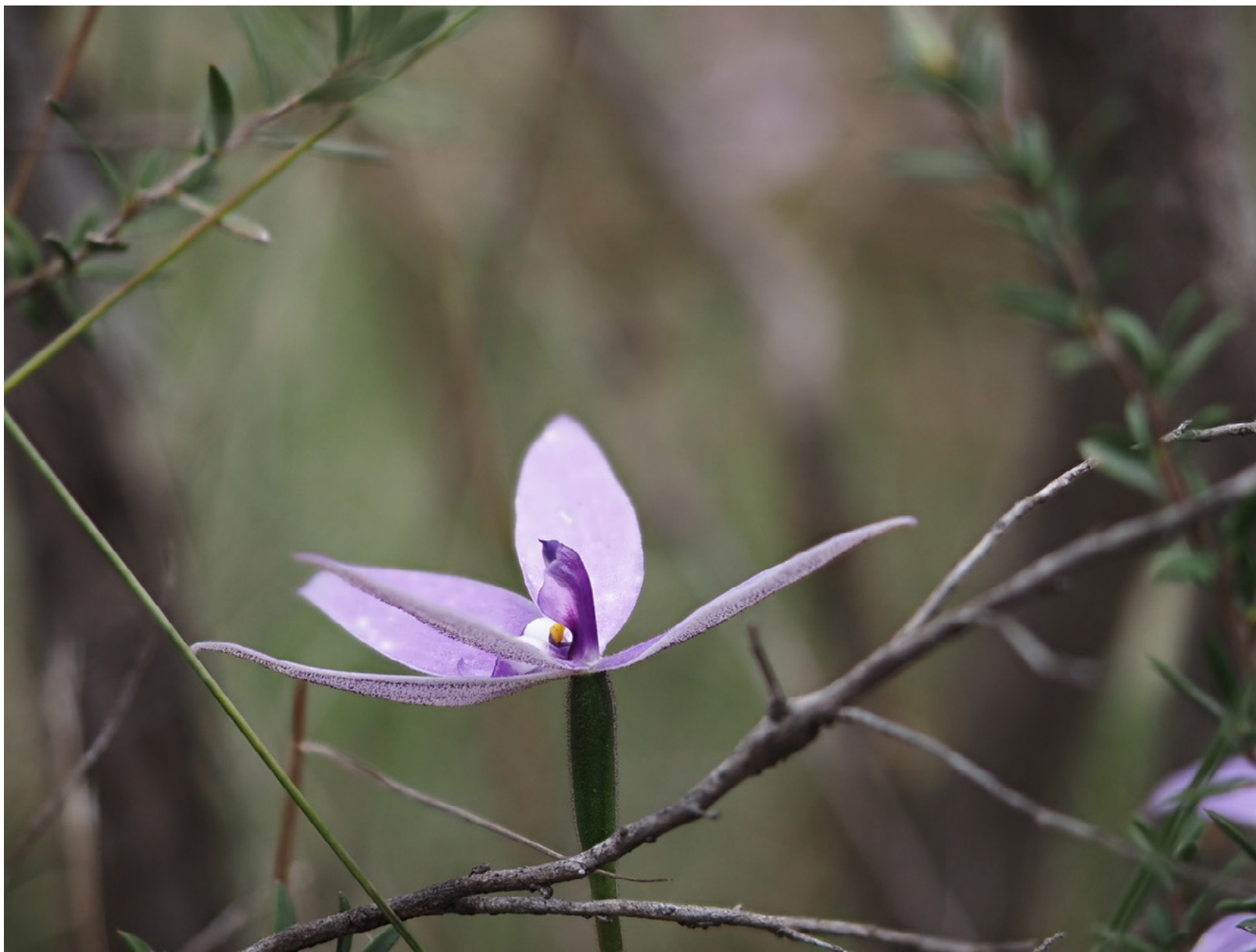
Waxlip orchid, Black Mountain Laurie Westcott