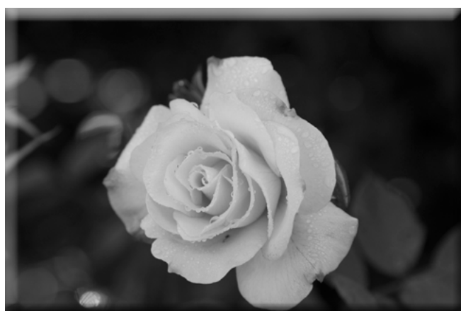
Lab color conversion