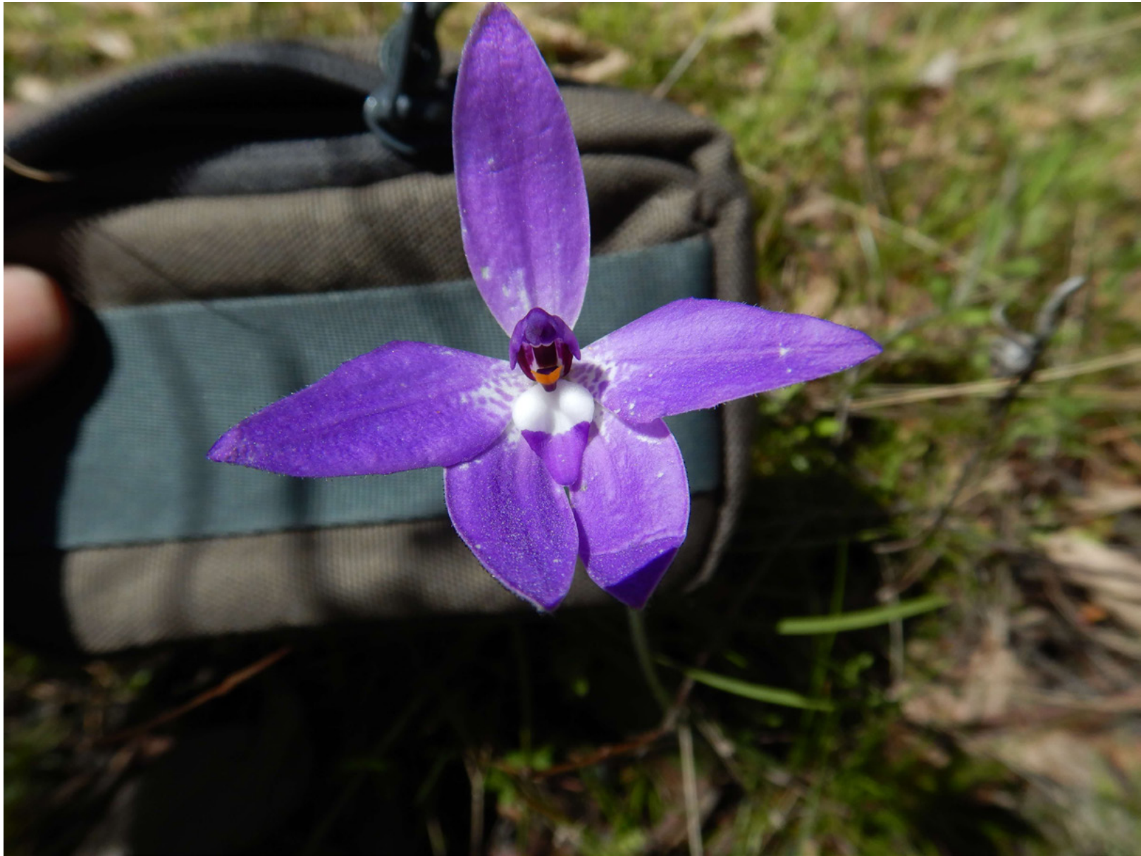
Waxlip orchid Giles West