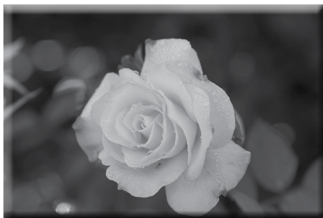
Black and white conversion