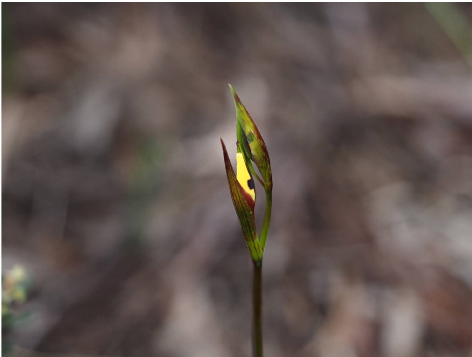
Tiger orchid in bud, Black Mountain Laurie Westcott