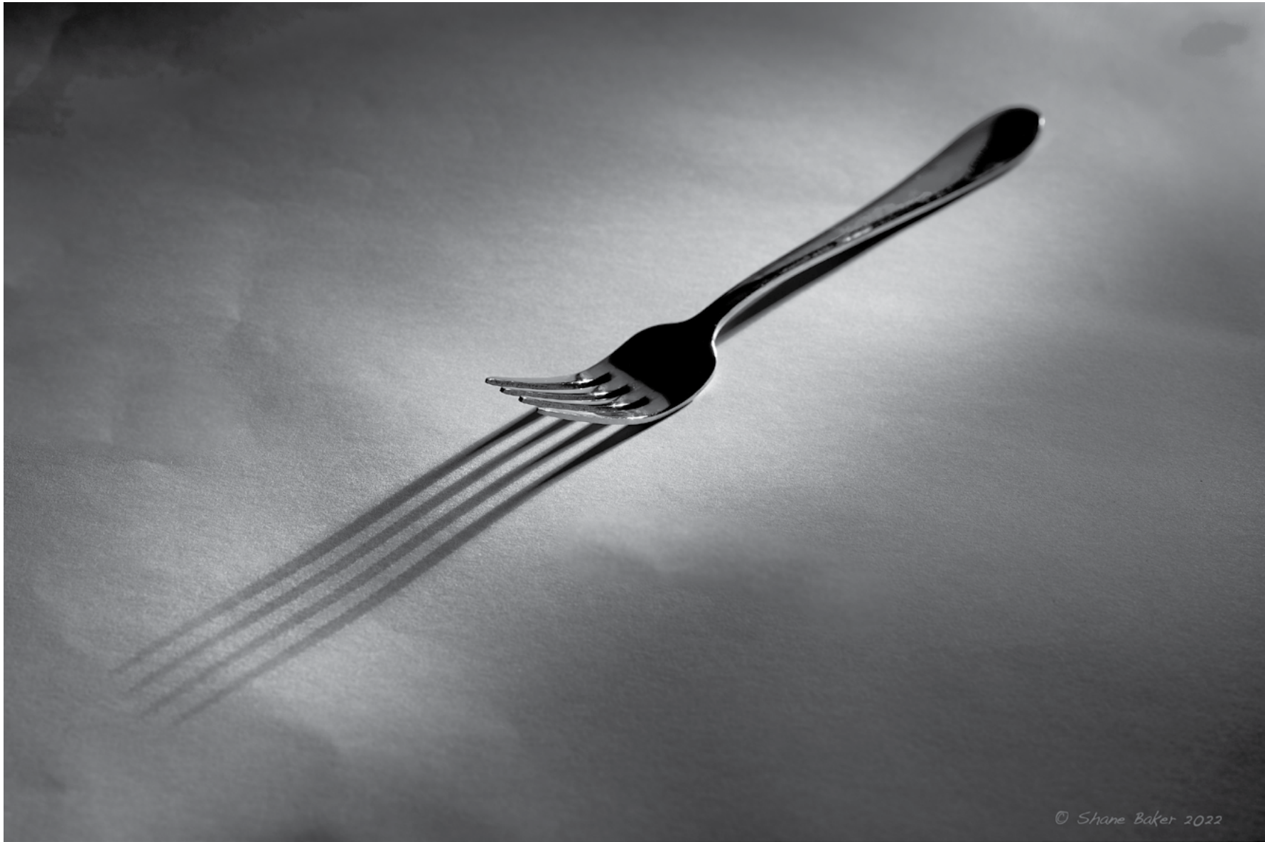
Light and shadow Nikon Z6ii with the Z 105 f/2.8 macro lens and a Godox V1 speedlight Shane Baker