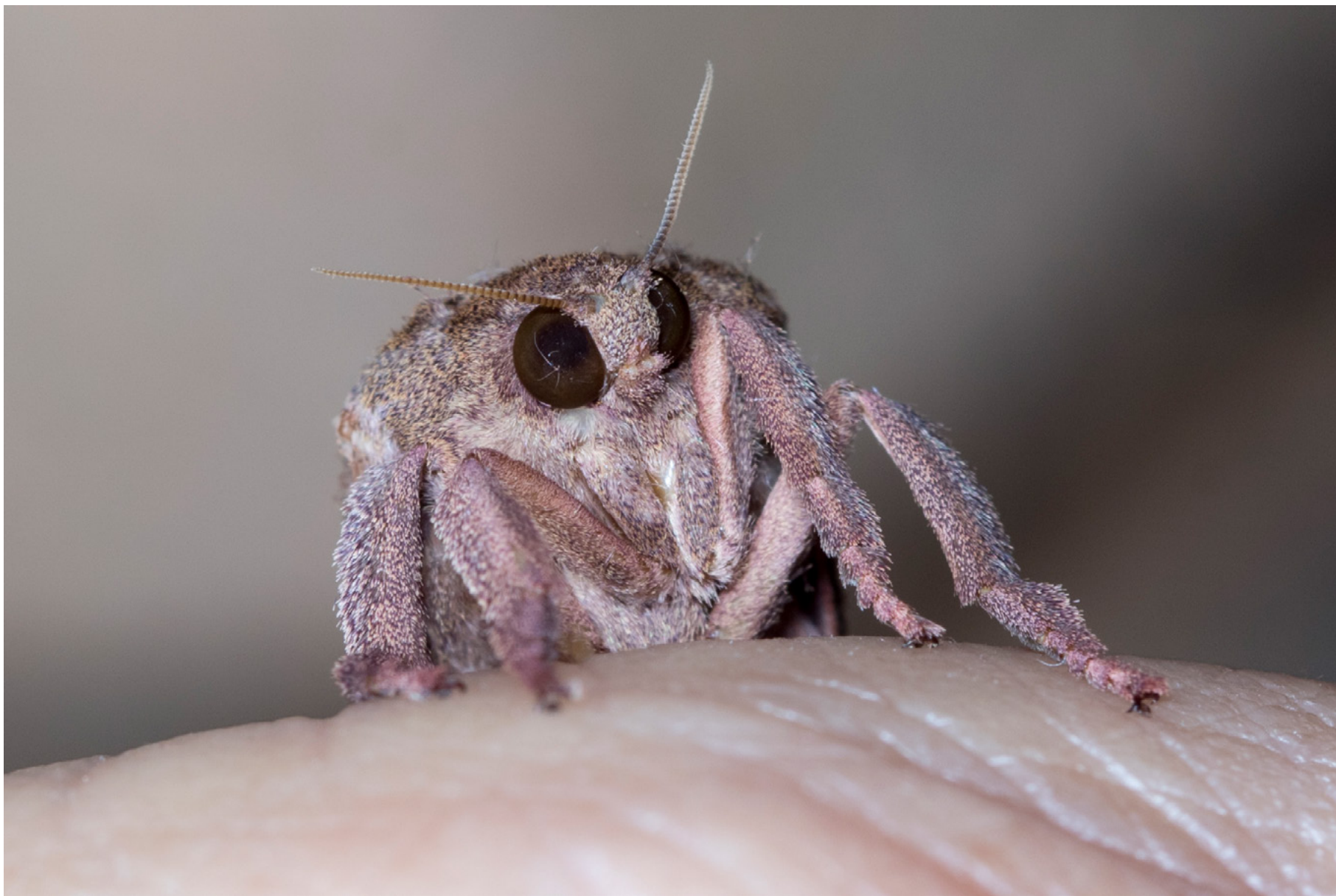
Moth close-up