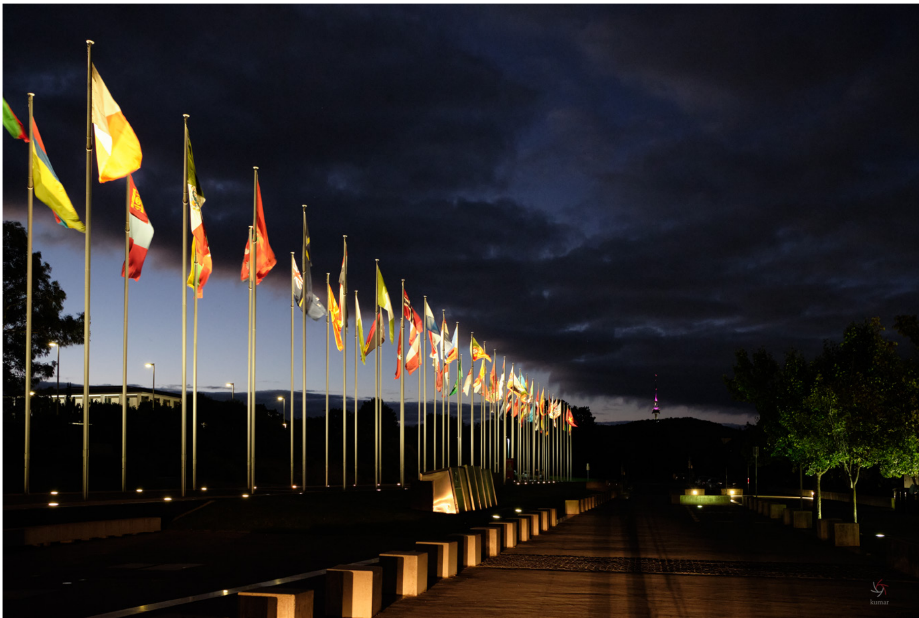
Federation Square Subramaniam Sukumar