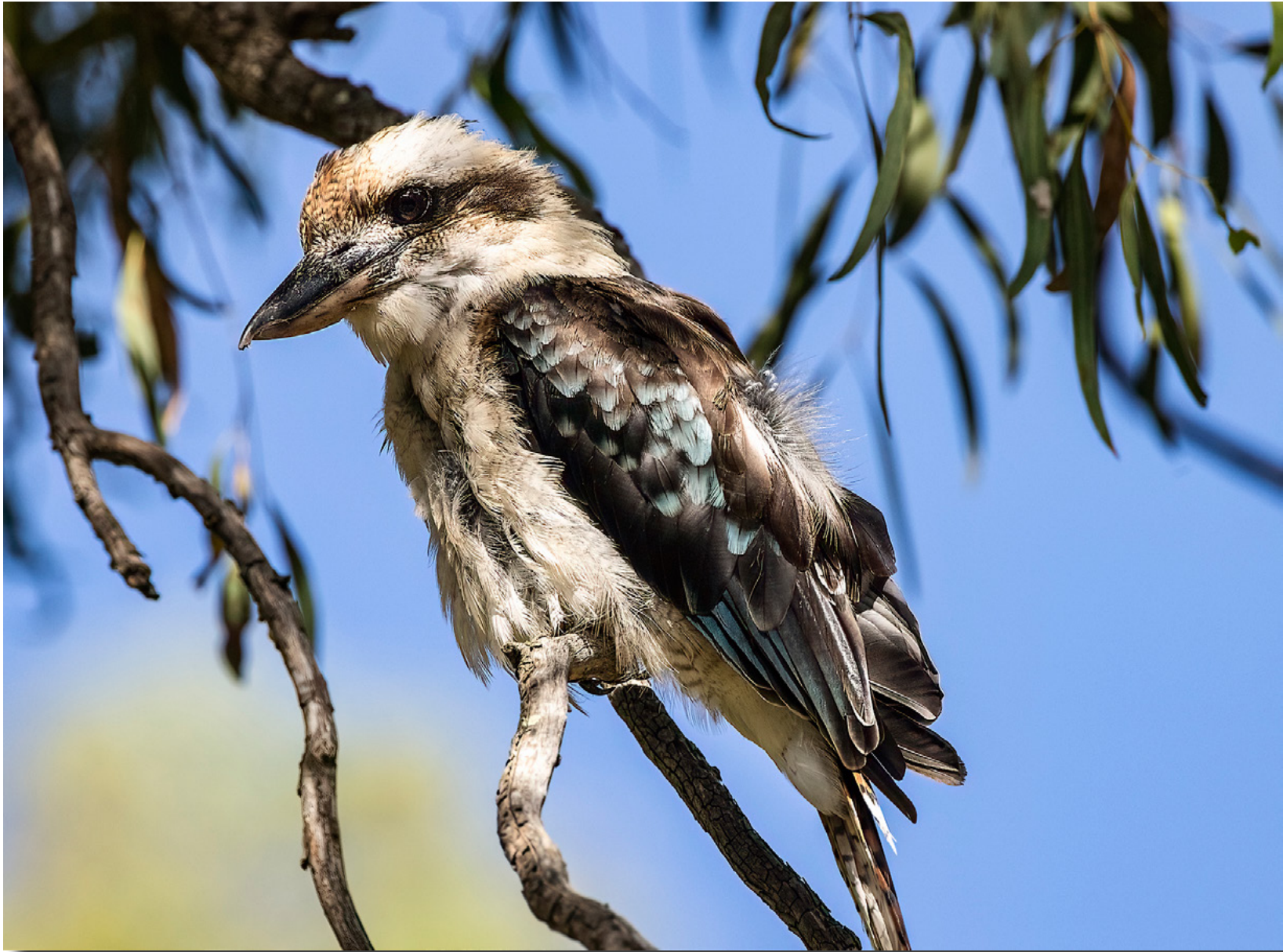
Kookaburra