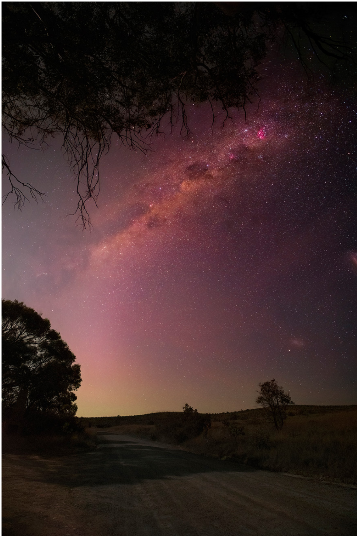
Smiths Rd Milky Way, south of Tharwa, 3 am