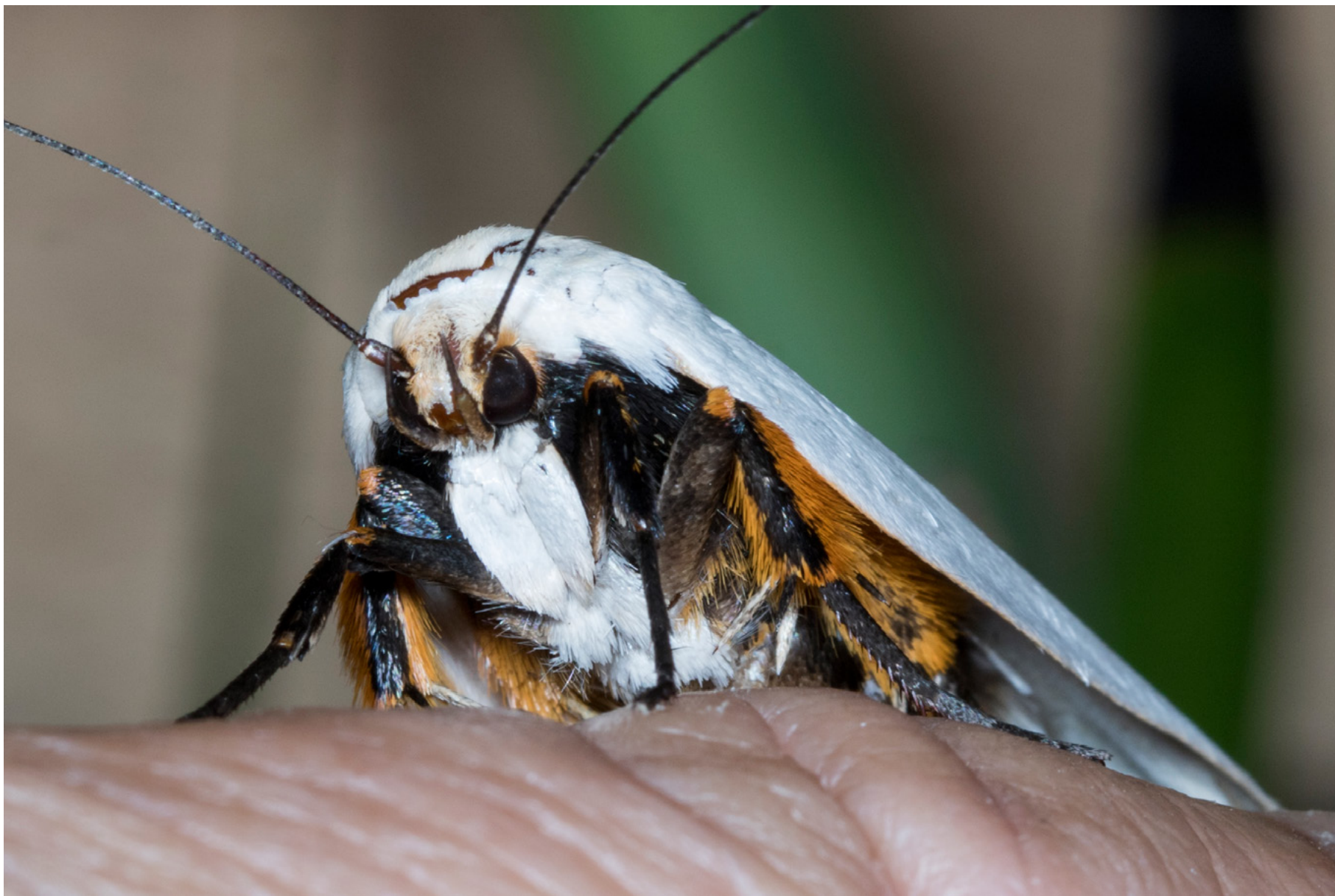
Moth close-up