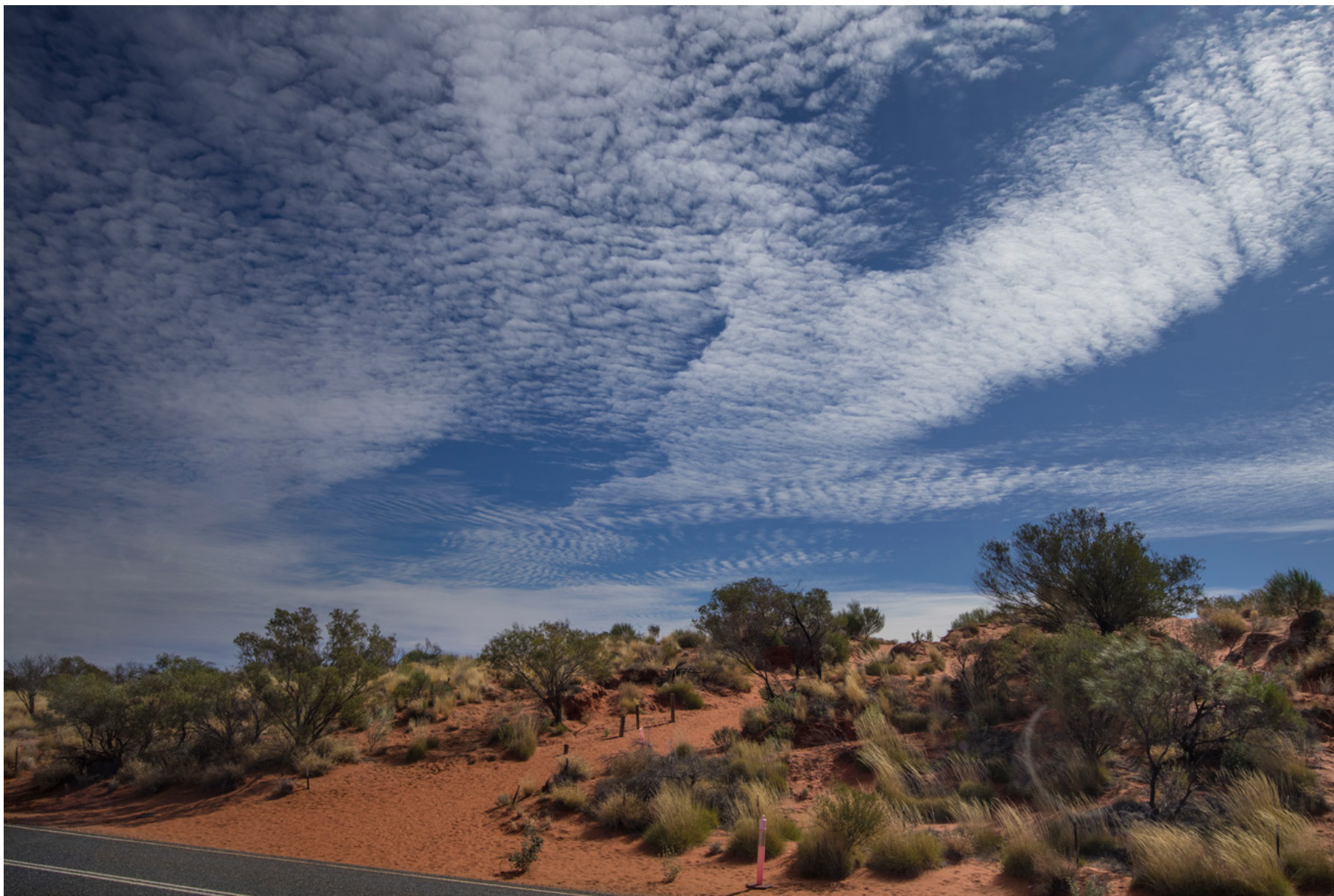
Sand dune opposite Mount Connor, Northern Territory