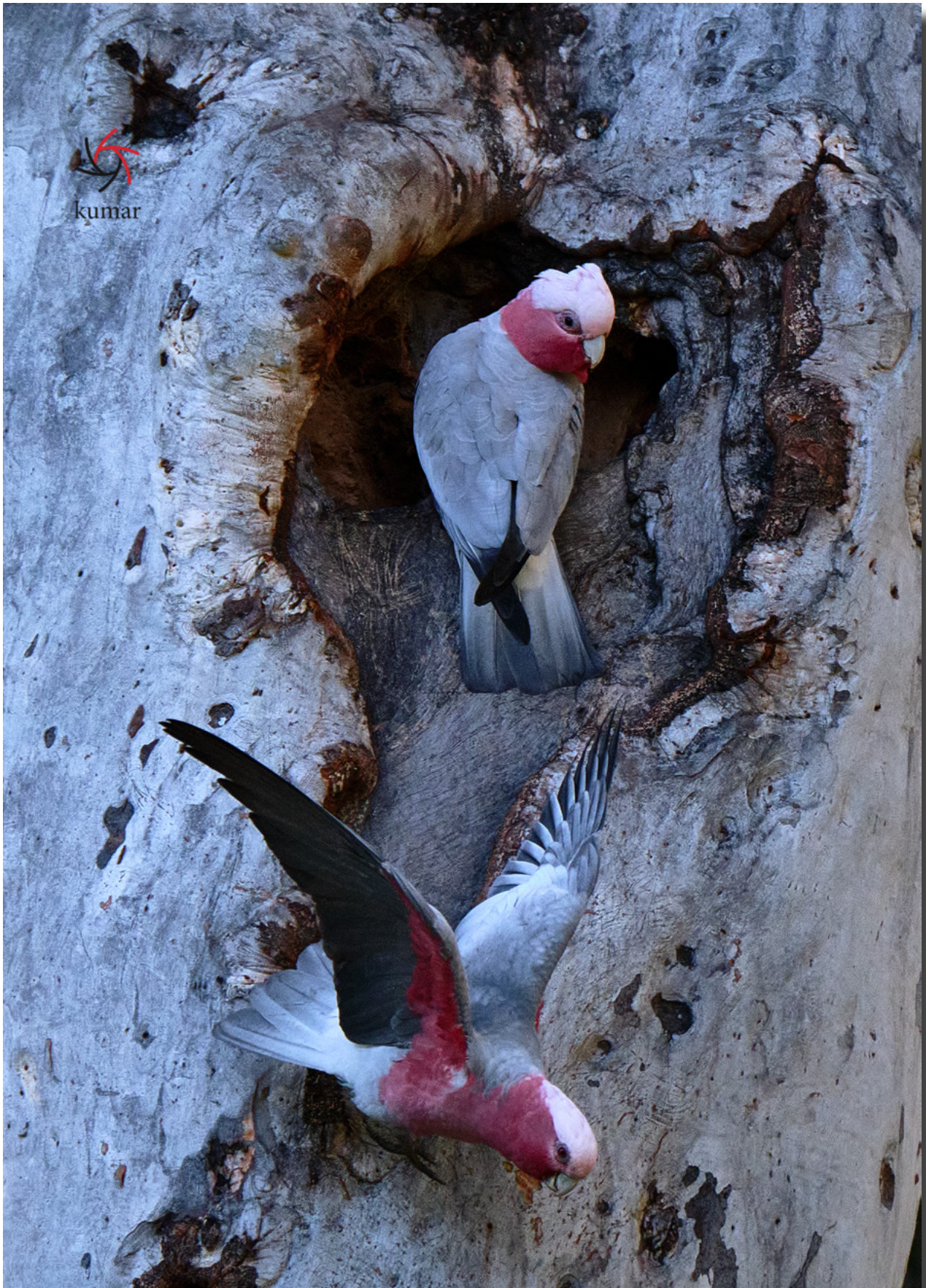
Galahs at the Australian National Botanic Gardens