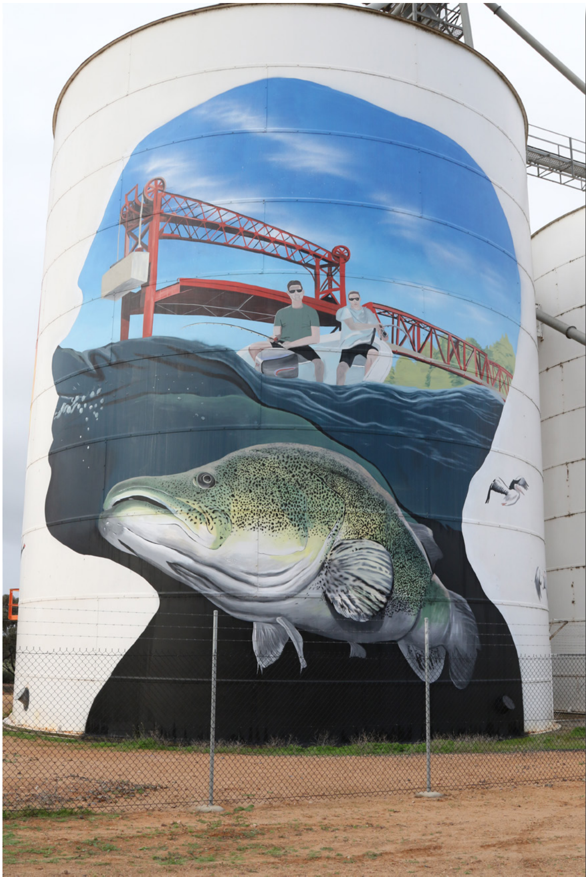
Silo art, Darlington Point, New South Wales