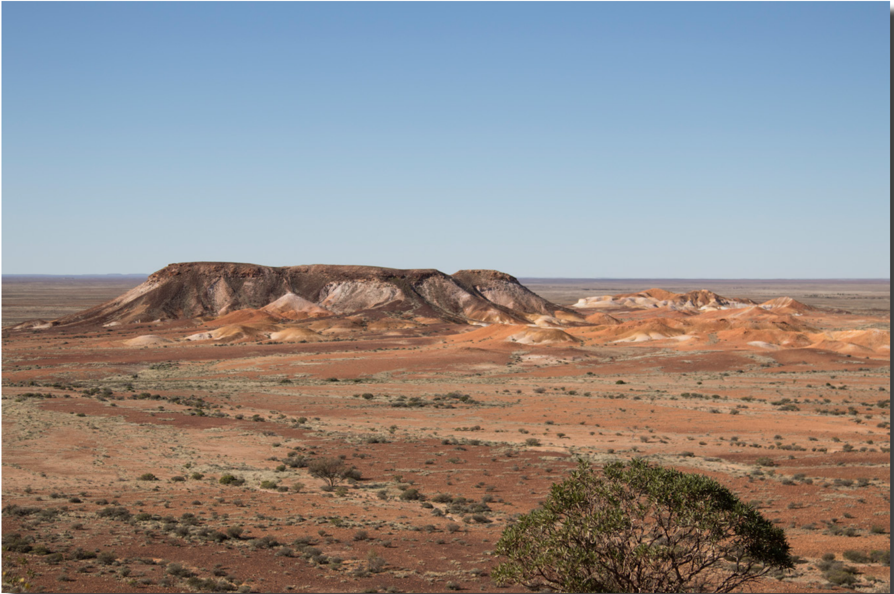
The Breakaways, Coober Pedy