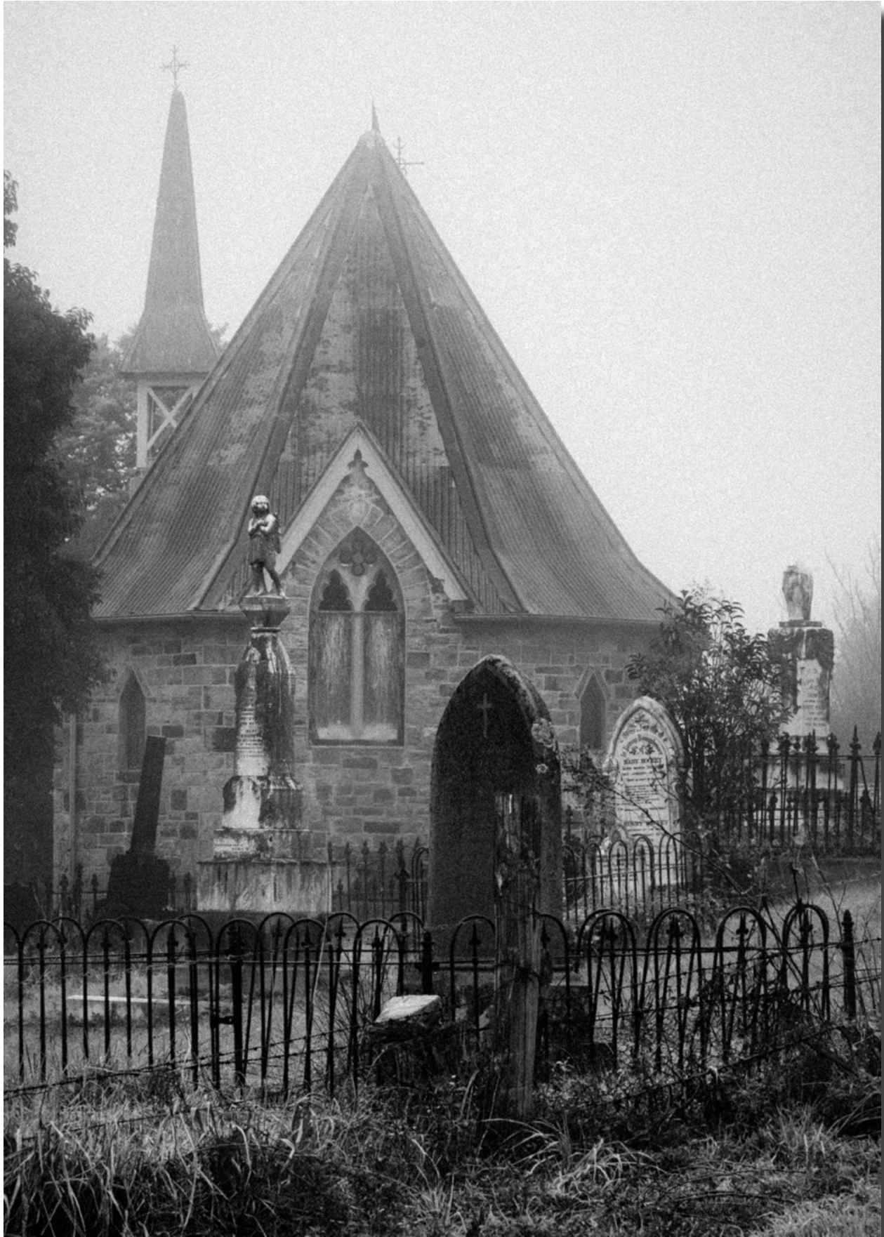
St Johns church, Georges Plain