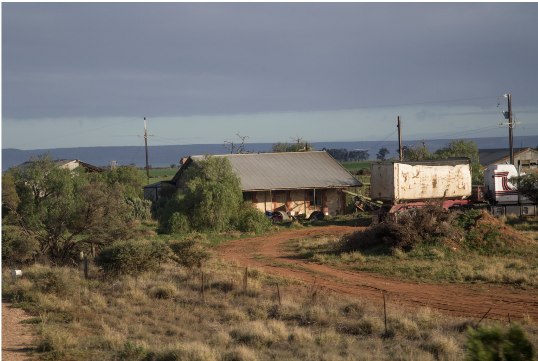
Rural scene, South Australia somewhere near Port Pirie, taken from a moving bus. Alison Milton