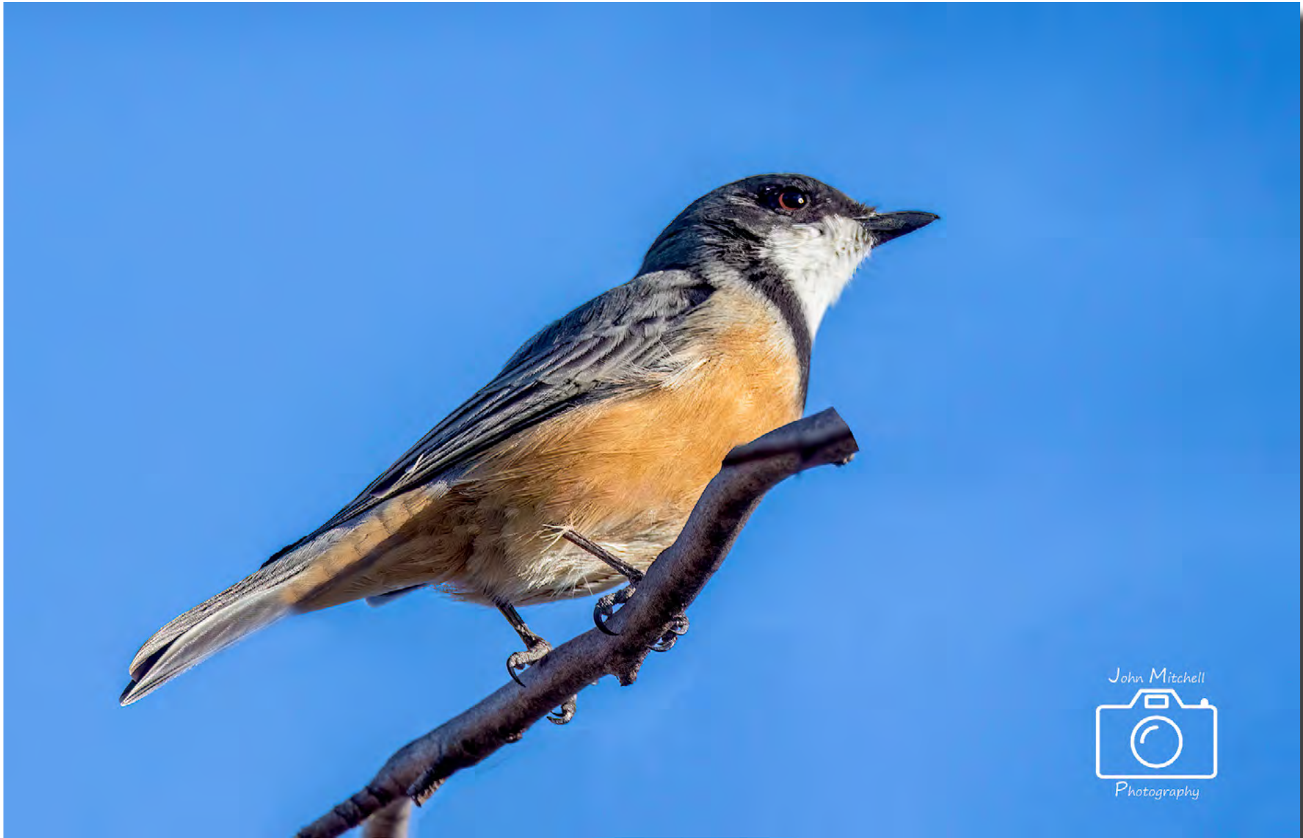
Rufous Whistler at Bluetts Block