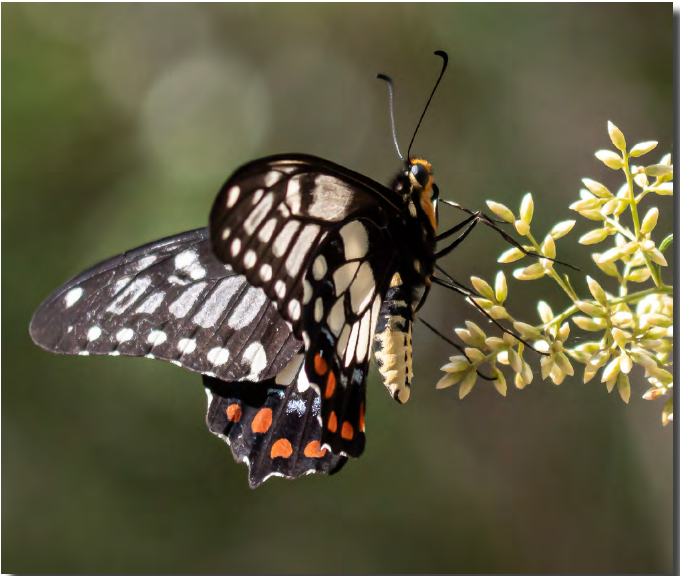
Female Orchard Swallowtail Butterfly Helen Dawes