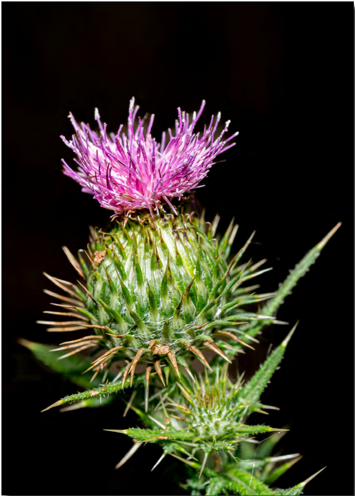
Scotch Thistle, Campbell Park Woodlands