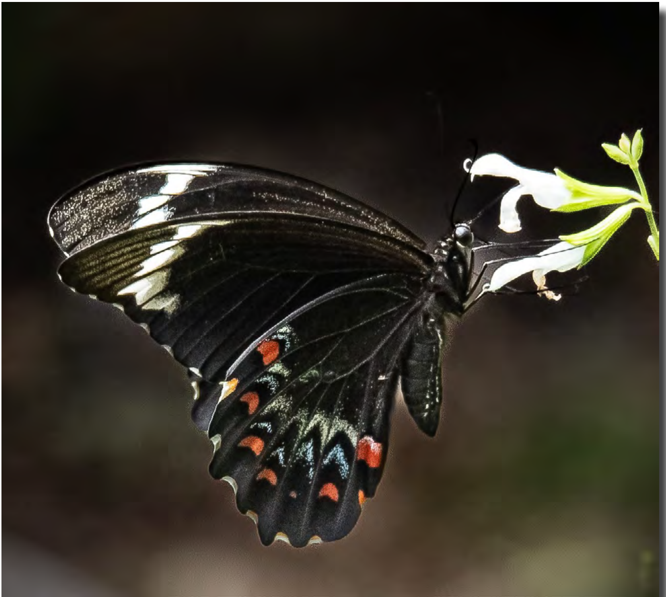
Male Orchard Swallowtail Butterfly Helen Dawes