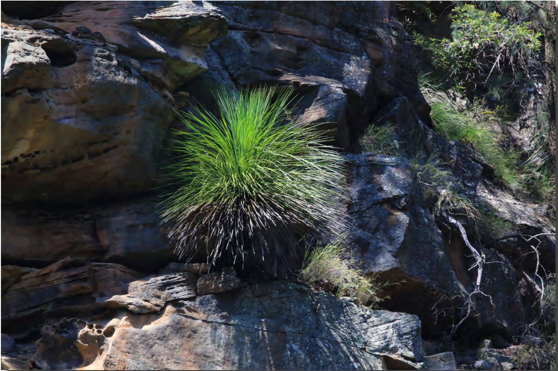
Surviving on the cliffs, Nepean River, Penrith