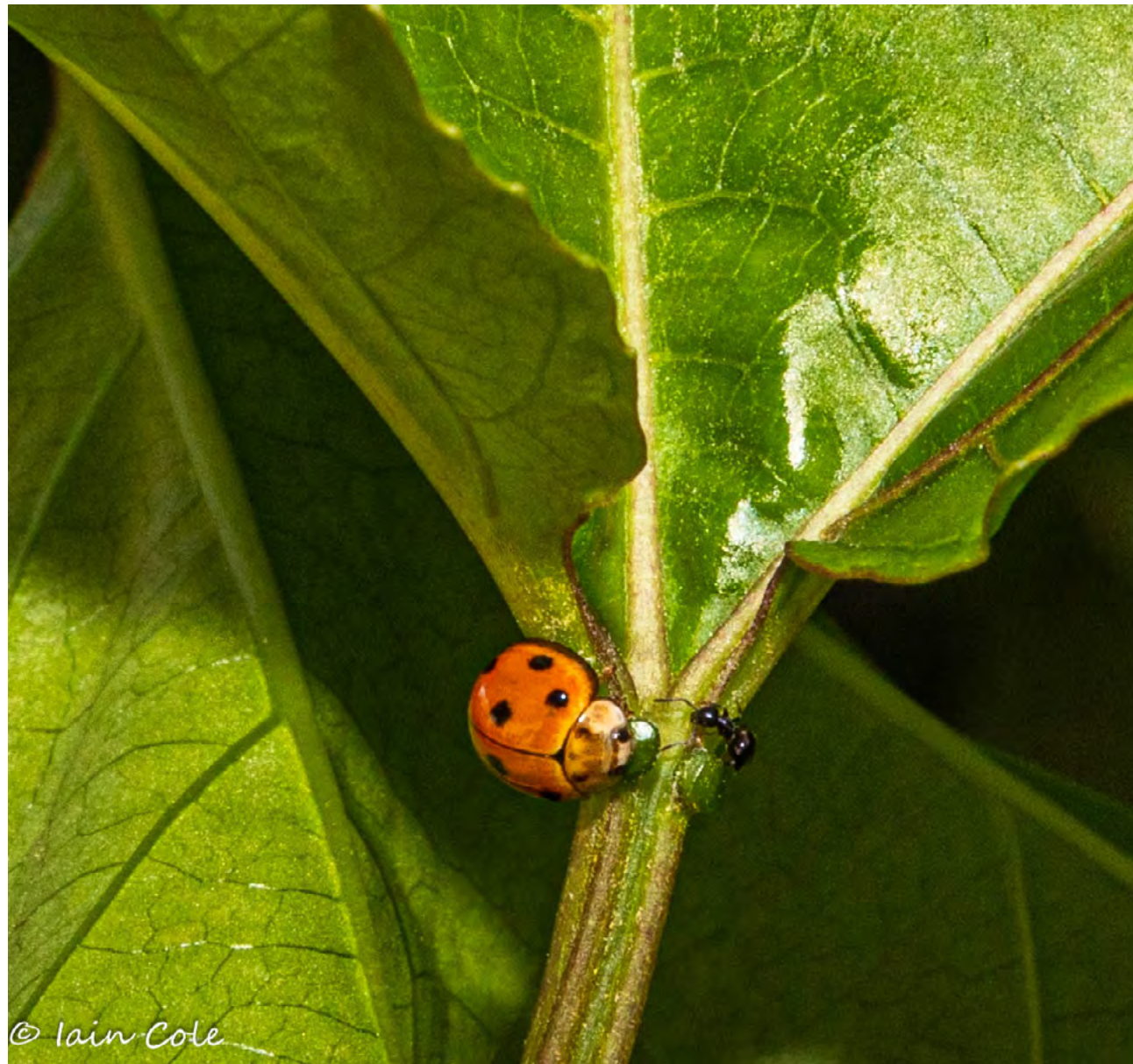
Hunter, or a meeting of minds? Macro shot in the passionfruit vine. Iain Cole