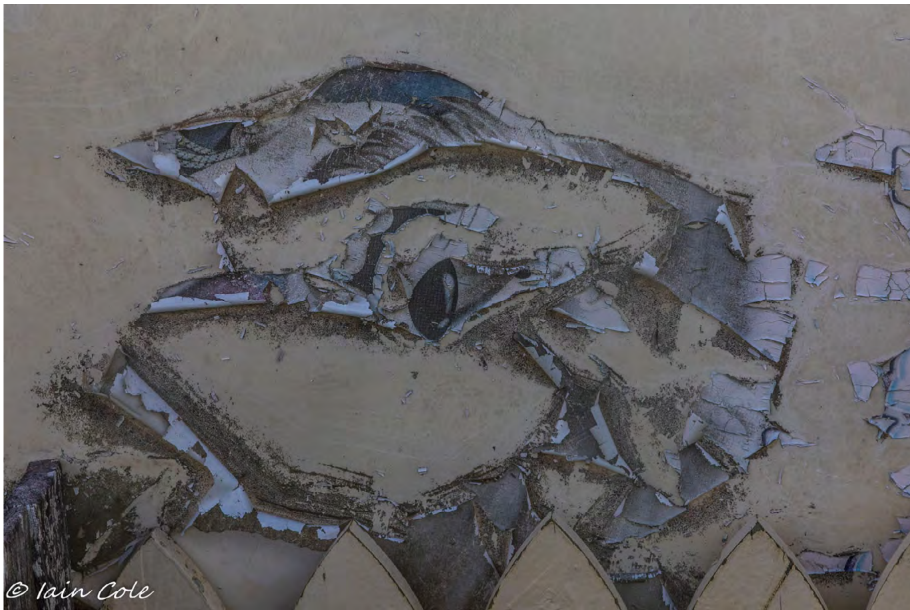
The Eyes have It. From the series Where the Monsters Hide. Iain Cole