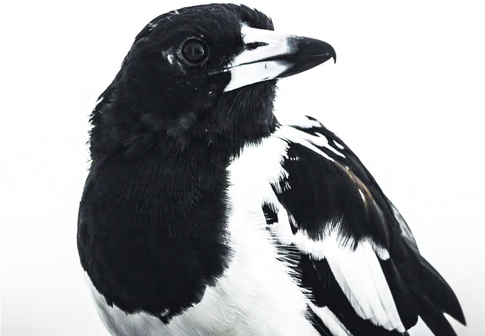
Morning Visitor. Butcherbird waiting for the morning cheese Iain Cole