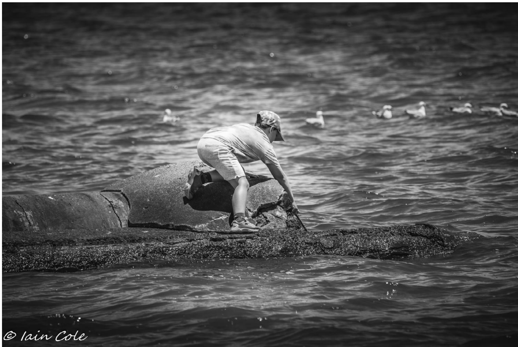
Curiosity. Exploring a stormwater outfall near Redcliffe. Iain Cole