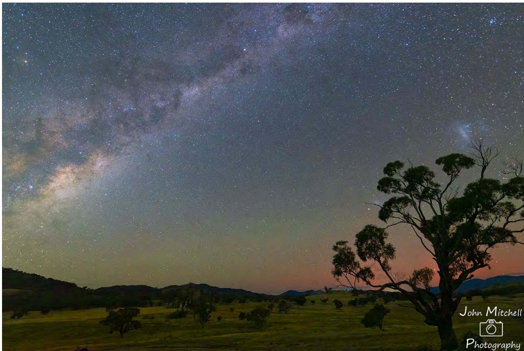
Aurora with Milky Way at Williamsdale NSW