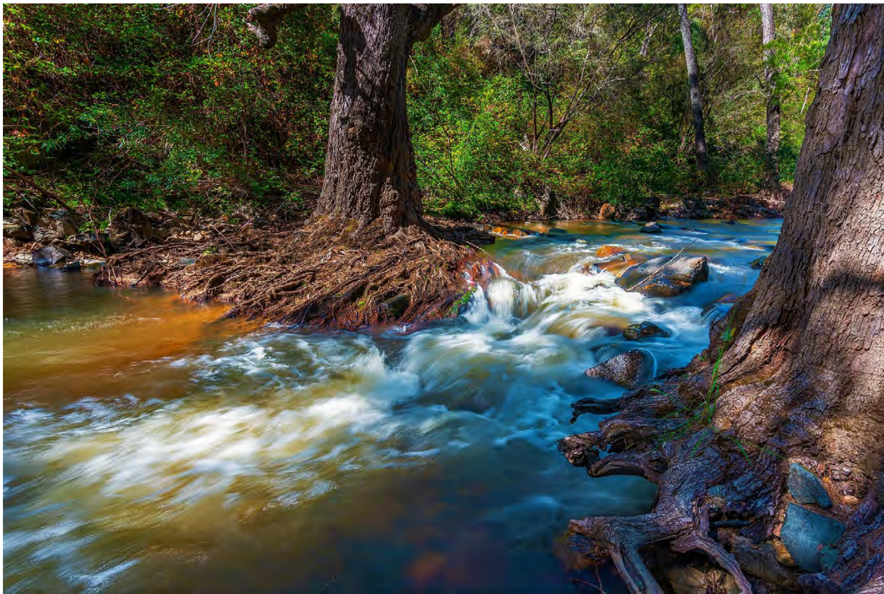
Micalong creek near Wee Jasper