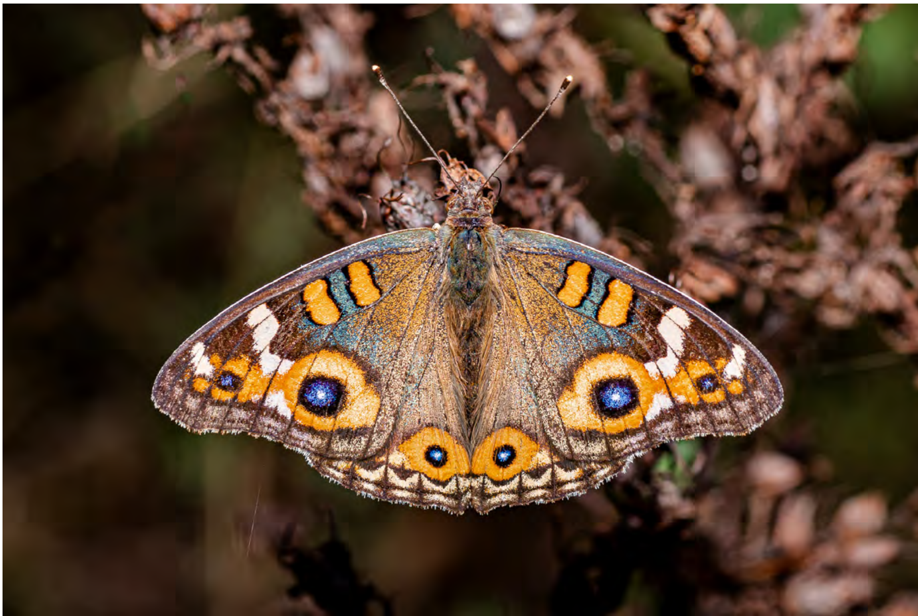
Meadow Argus Butterfly, Campbell Park Woodlands