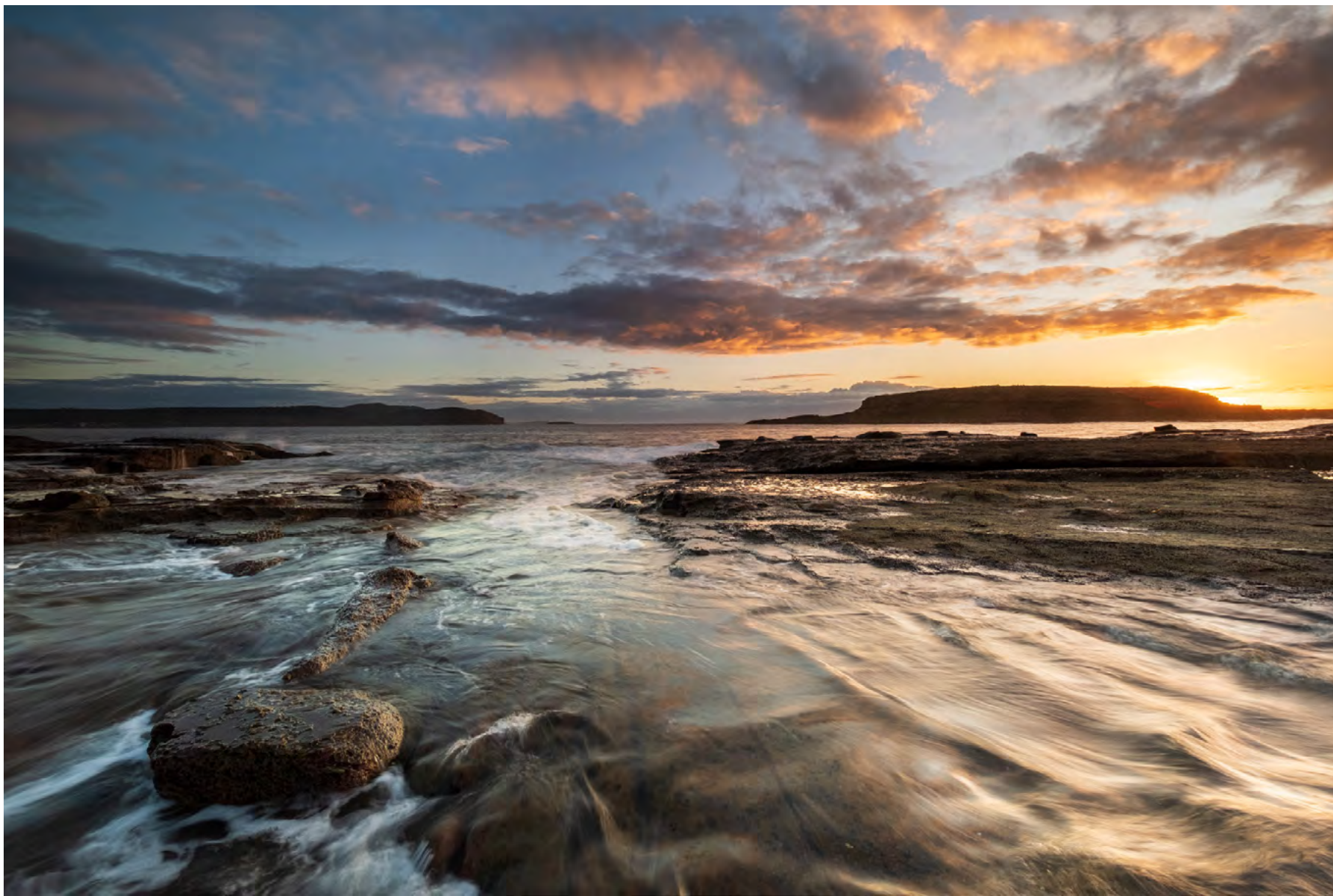
Sunrise flows at South Durras Rod Burgess