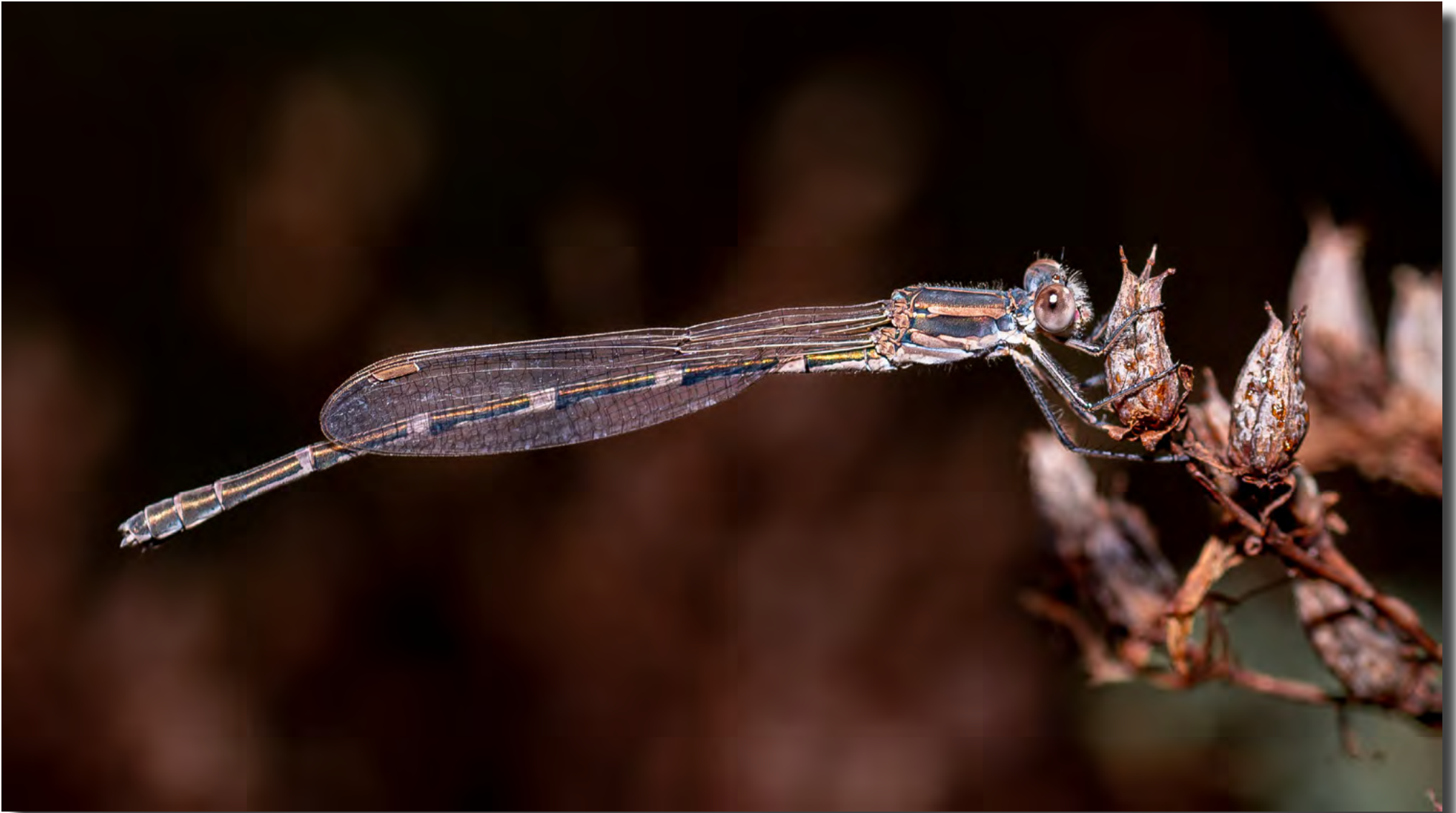
Damselfly, Campbell Park Woodlands