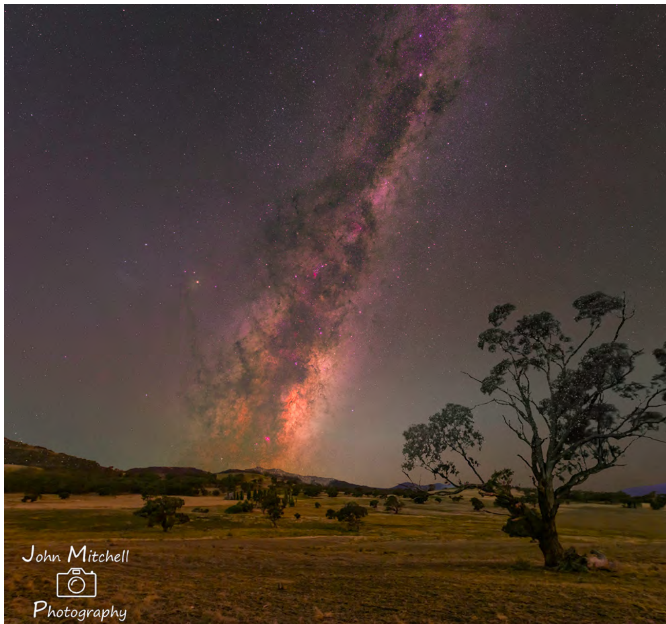
Milky Way at Williamsdale NSW