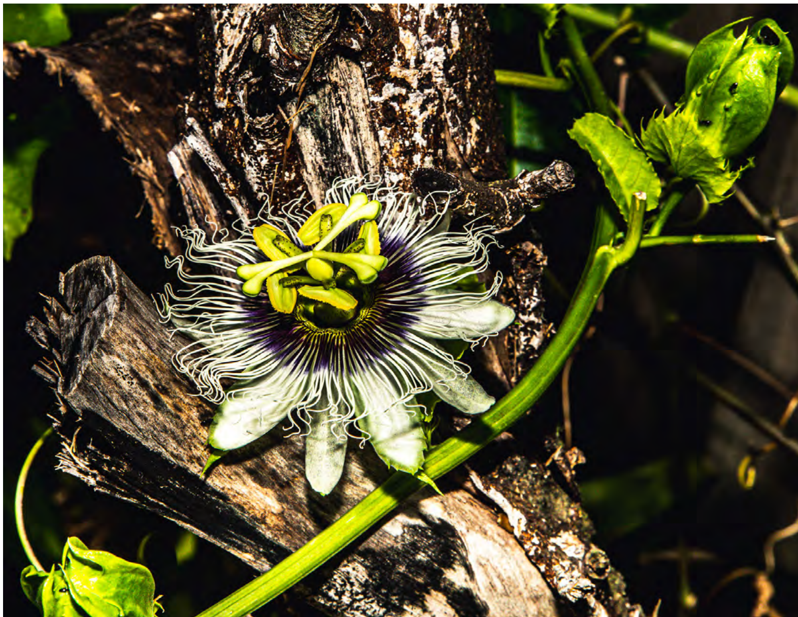
Knock on Wood. Passionfruit flower Iain Cole