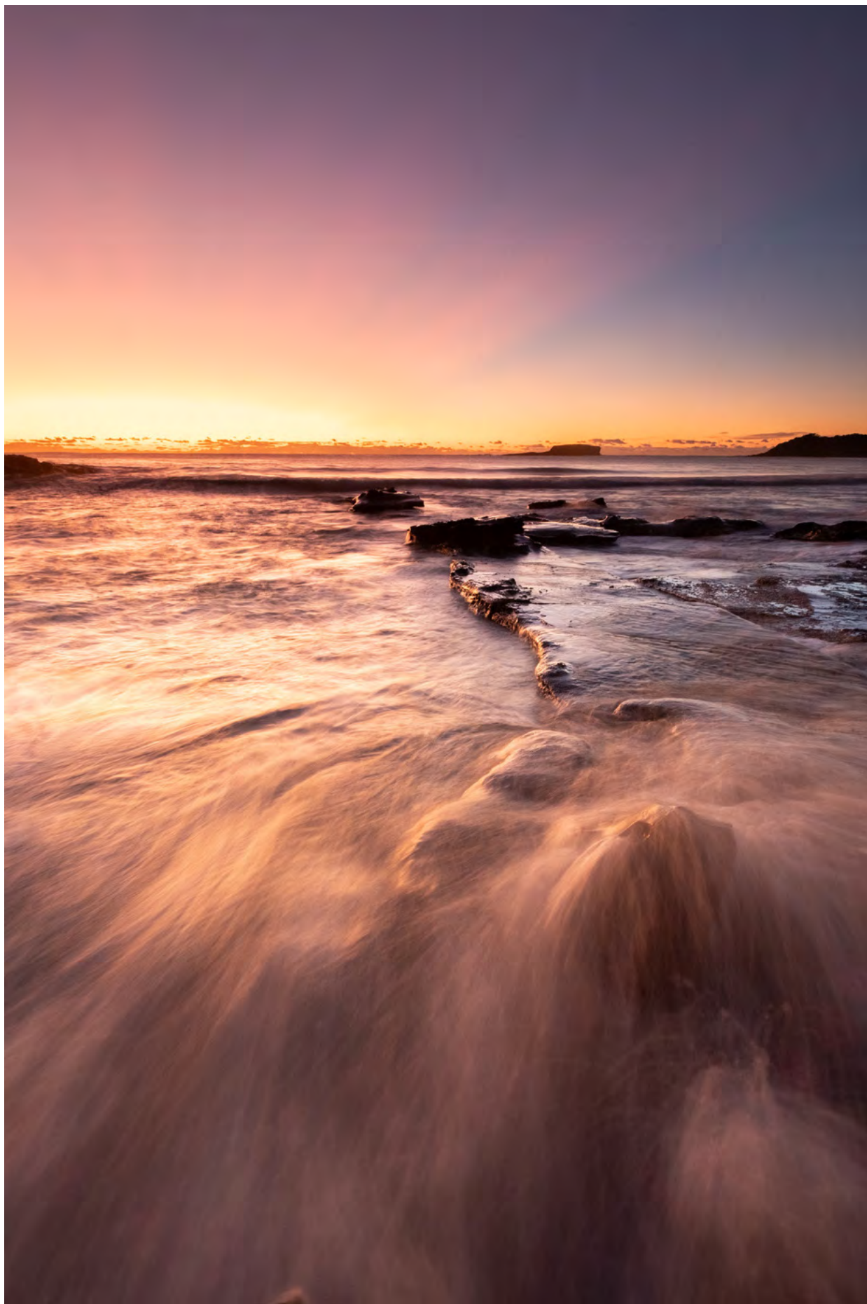
Sunrise flows at South Durras Rod Burgess