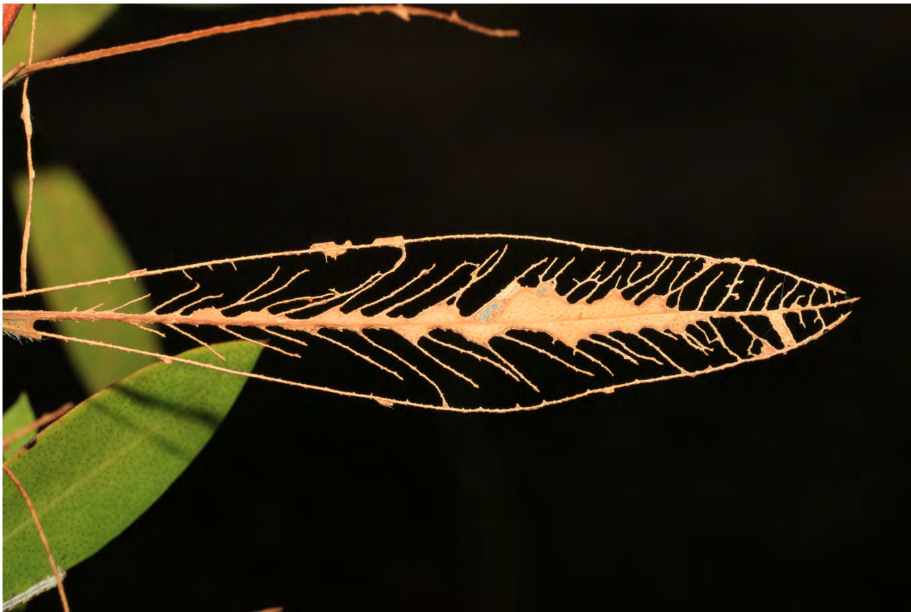
Exfoliation of Callistemon leaf by Sawfly larvae