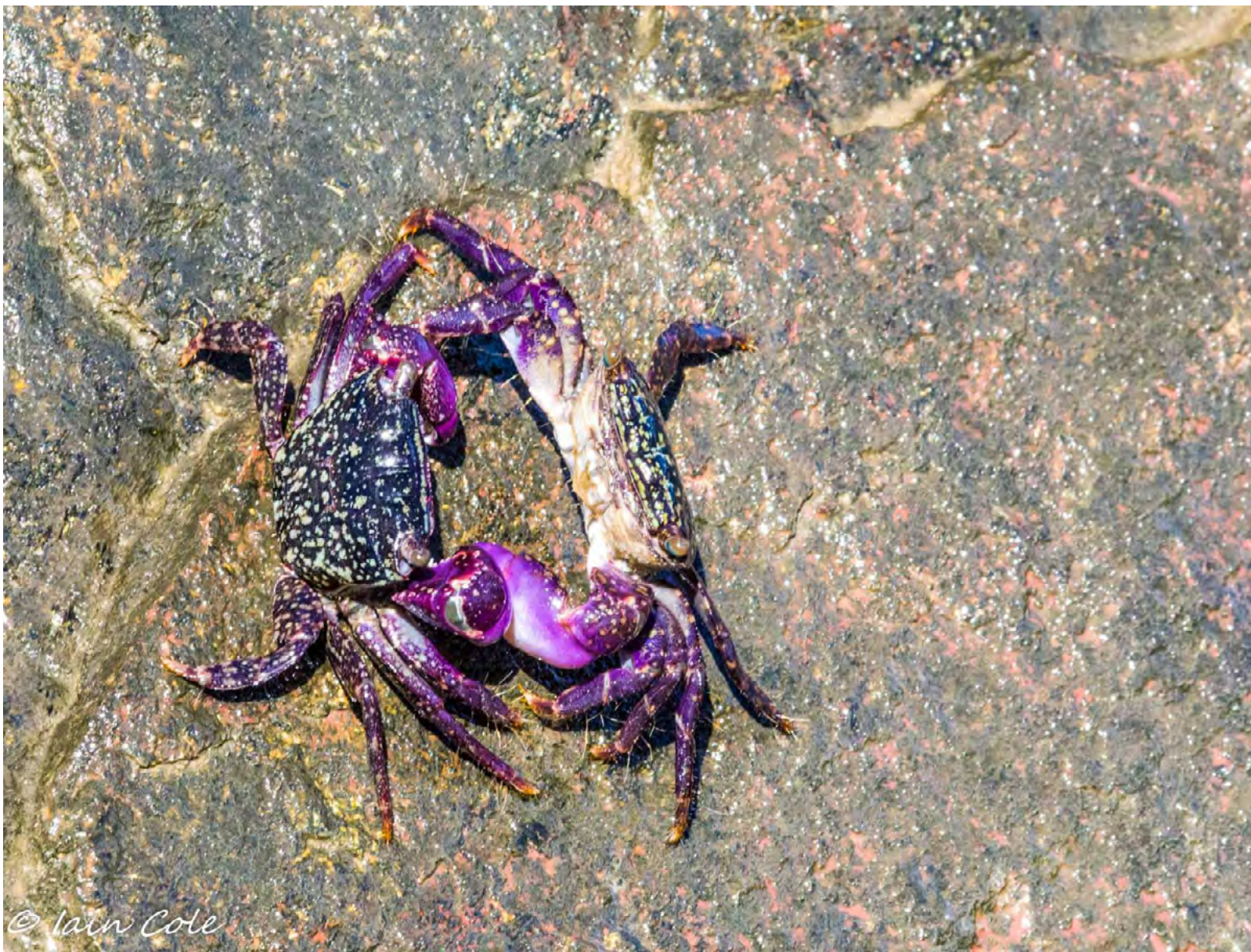
The Struggle for Domination. Swimmer crabs at Dohles Rocks. Iain Cole