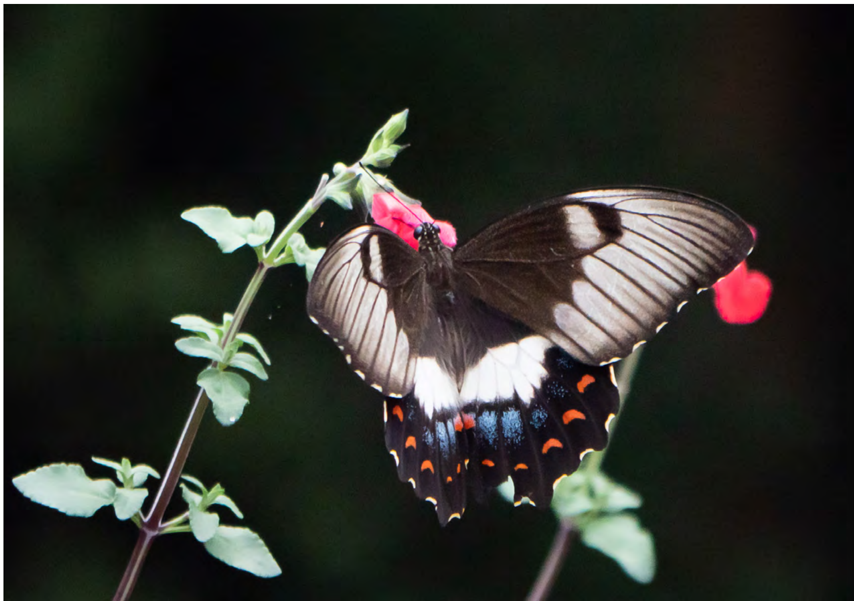
Female Orchard Swallowtail Butterfly Helen Dawes