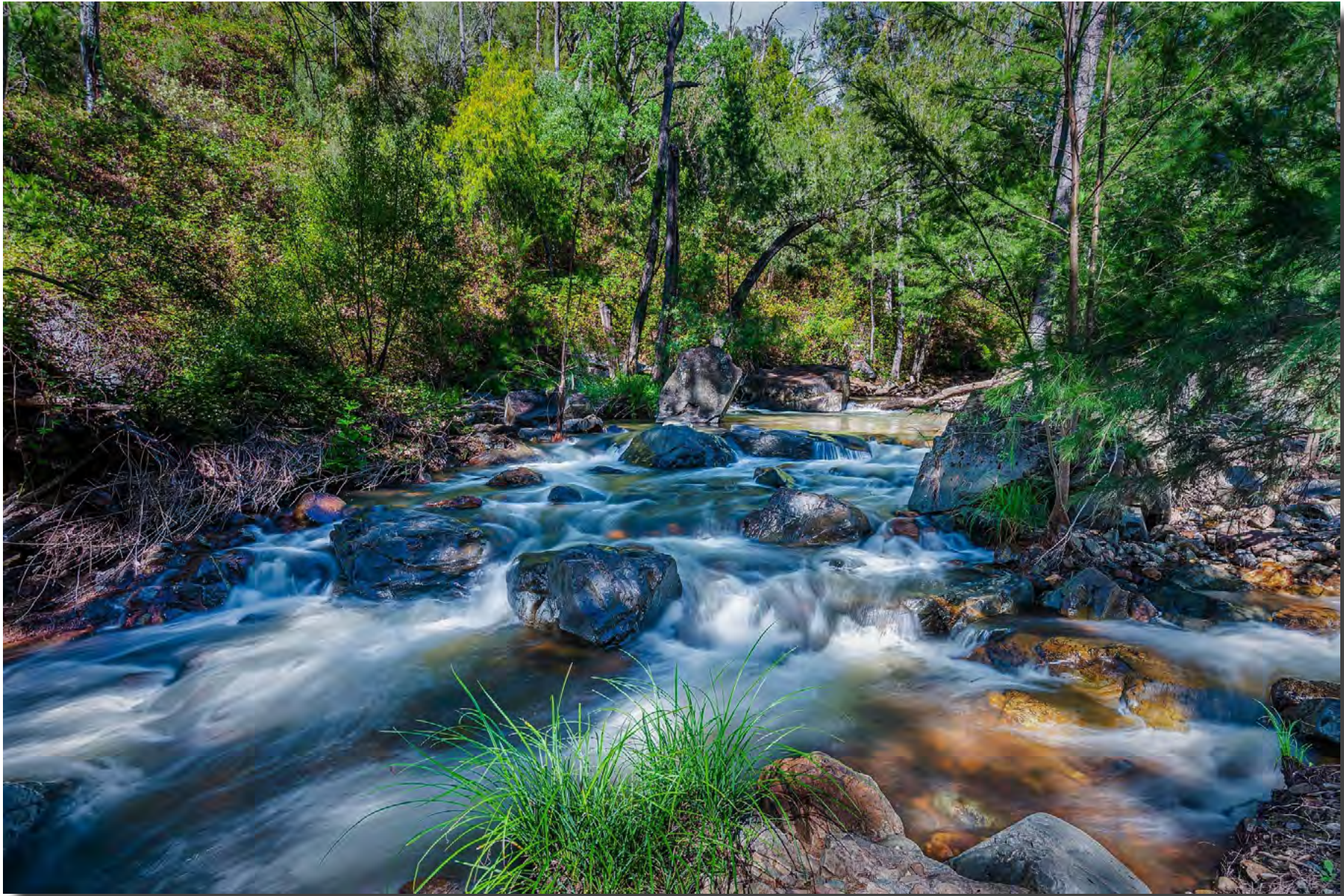
Micalong creek near Wee Jasper