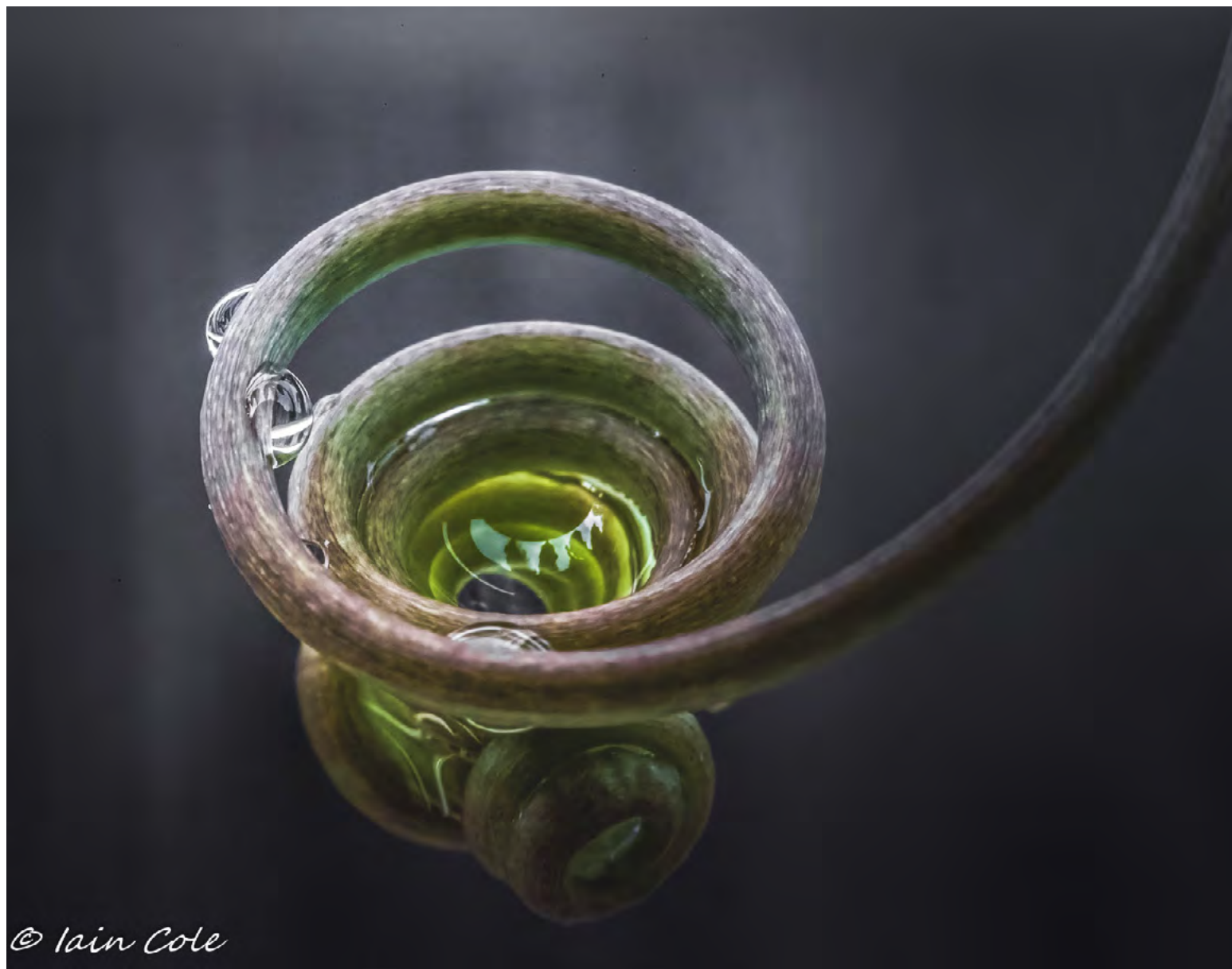
Water Catcher. Macro shot of a passionfruit tendril with reflections after the rain Iain Cole