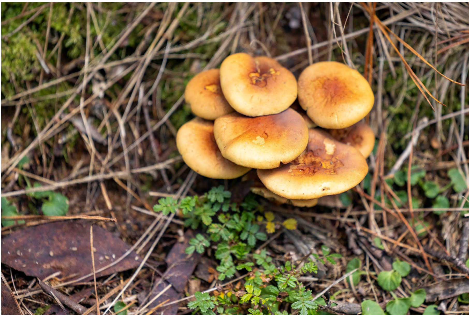
Bendora Arboretum