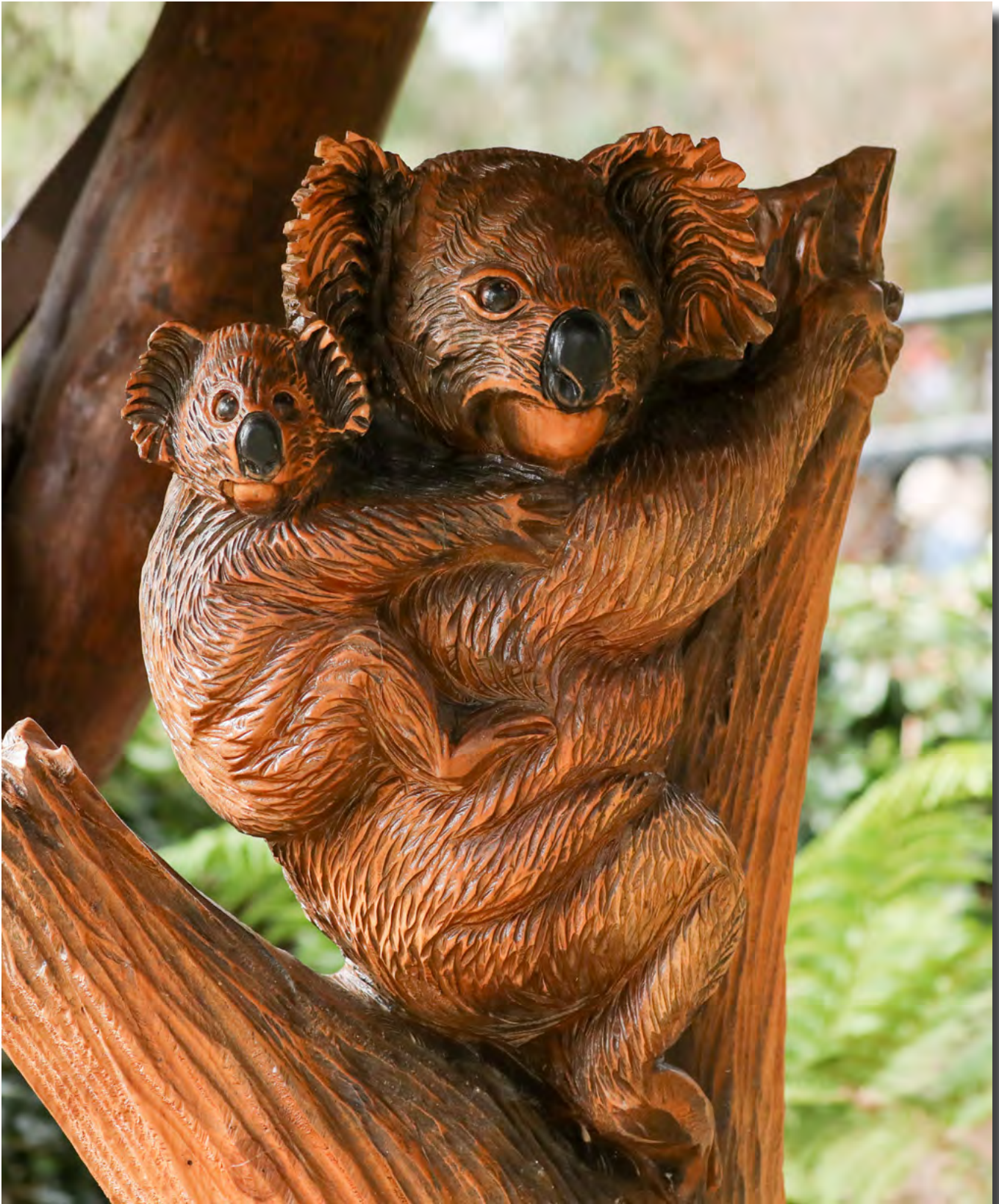
Koala sculpture, National zoo