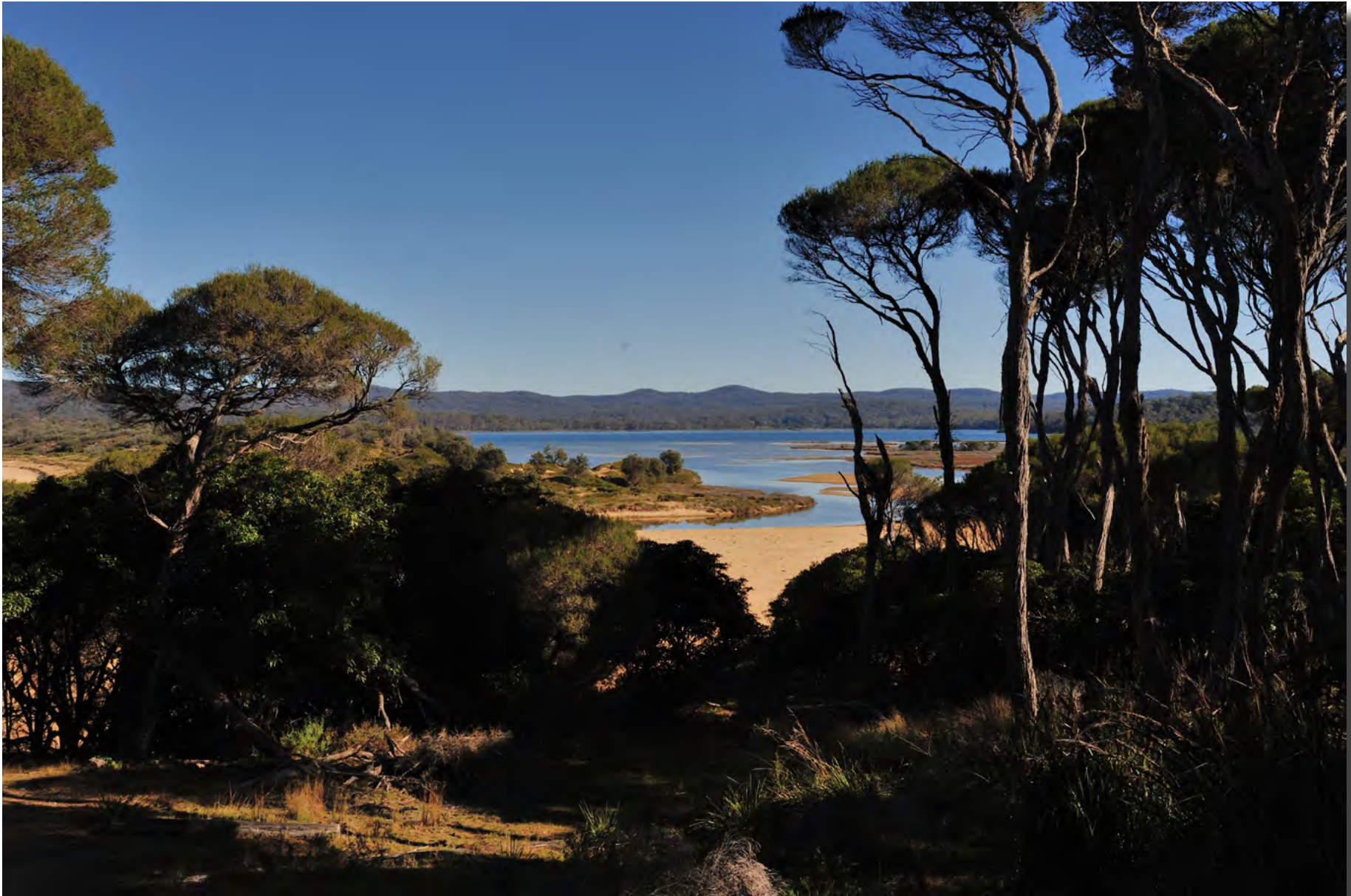
Merimbula Wallagoote Giles West