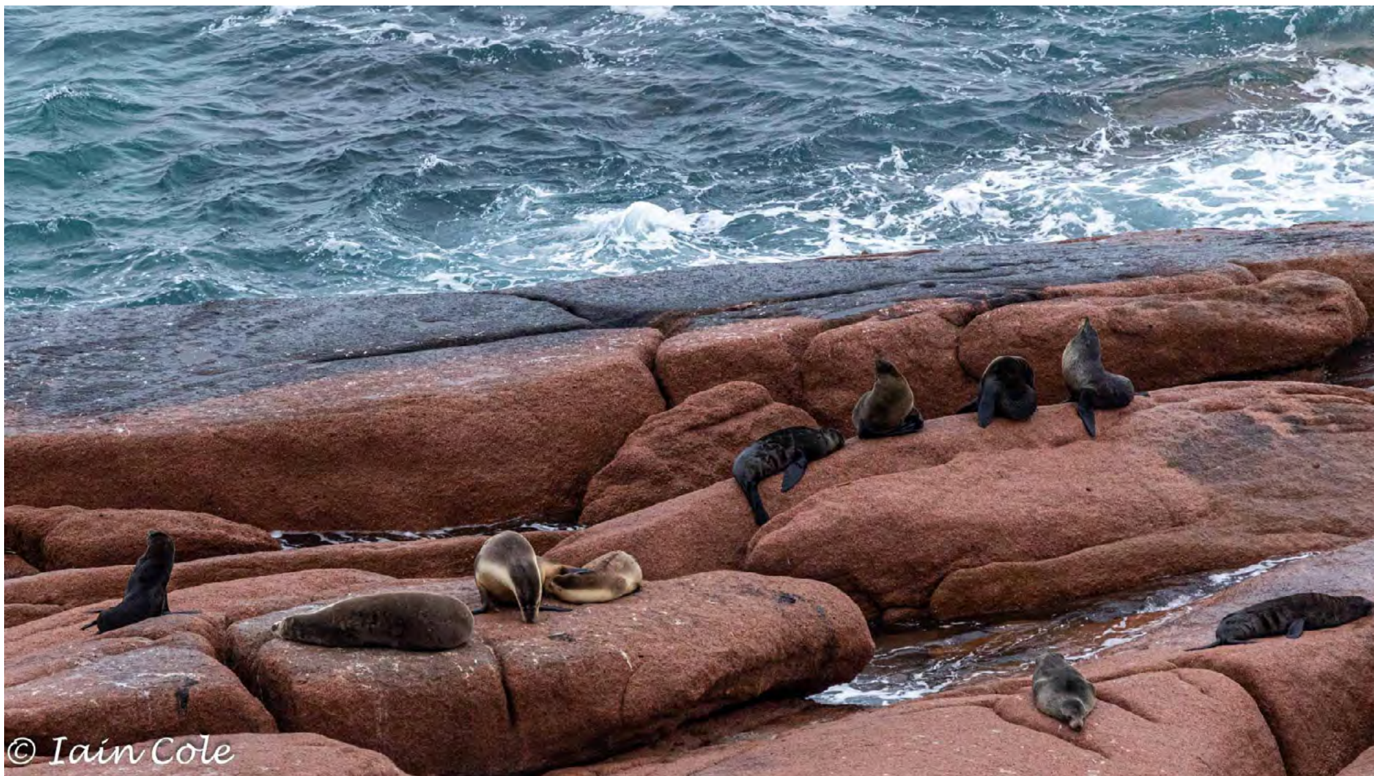
Sealion Colony, Point Labatt, south of Streaky Bay. This is the only mainland sealion colony in Australia Iain Cole