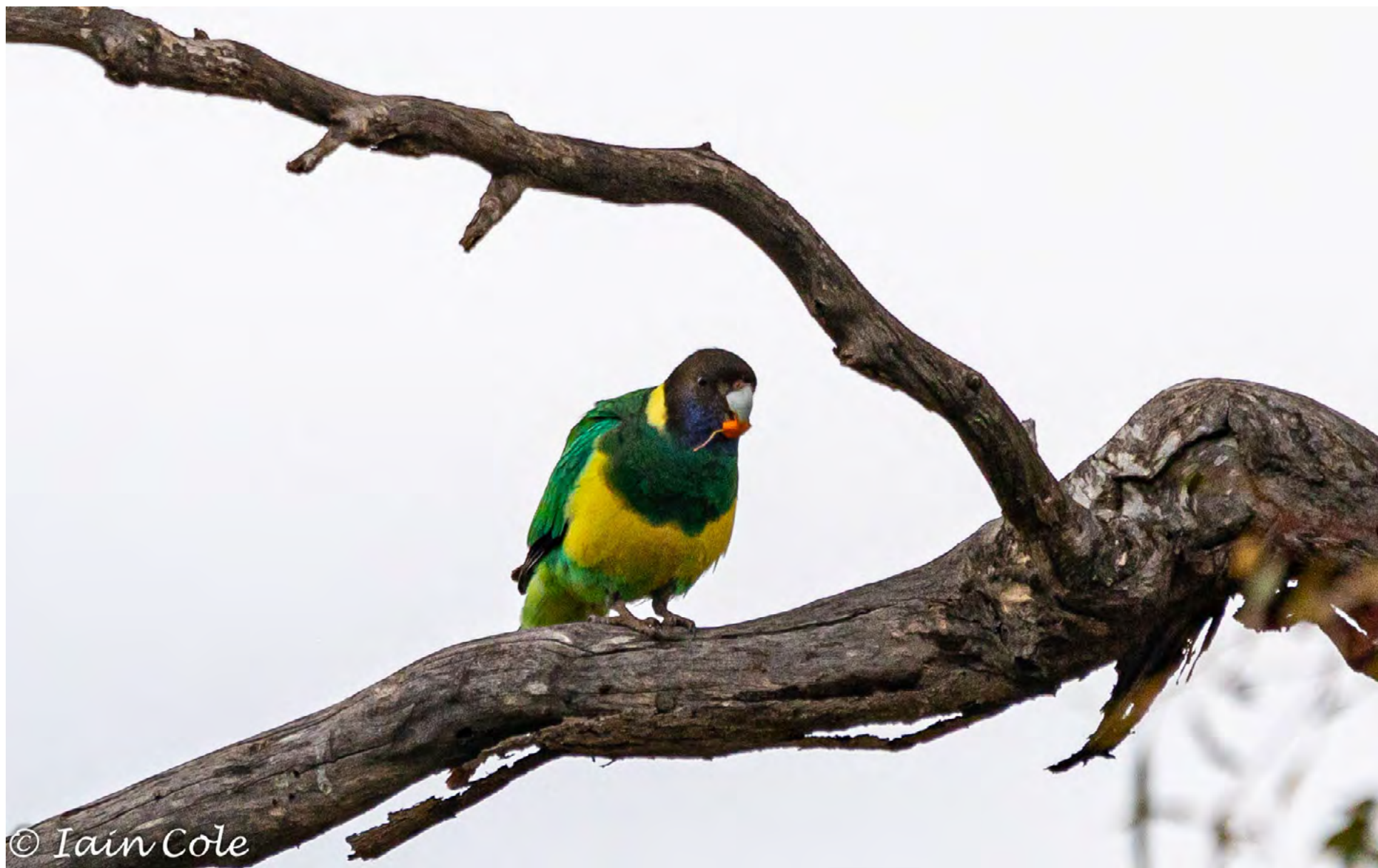
Australian Ringneck Parrot, Port Lincoln family. (A first sighting for me) Iain Cole