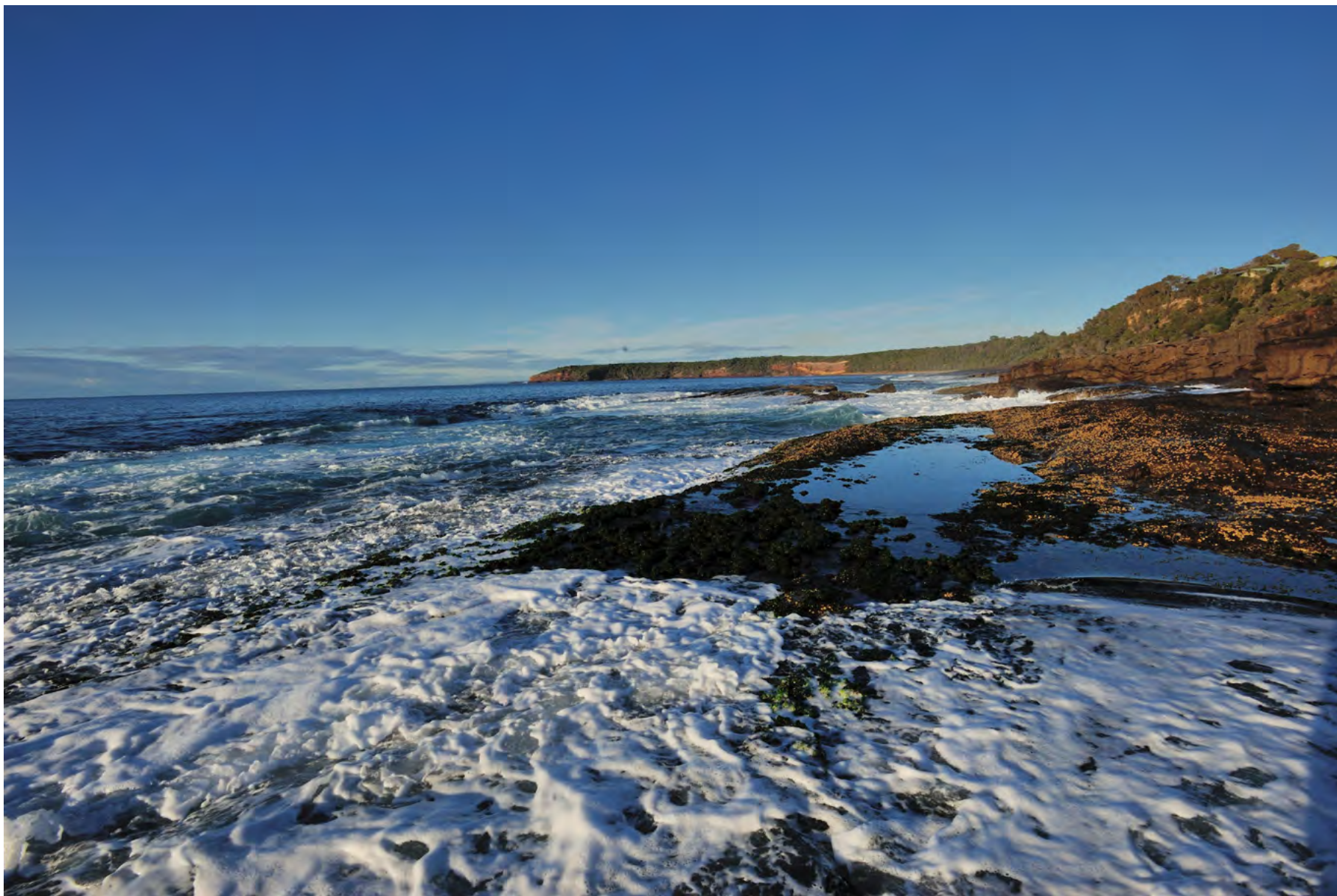
Merimbula Short Point Giles West