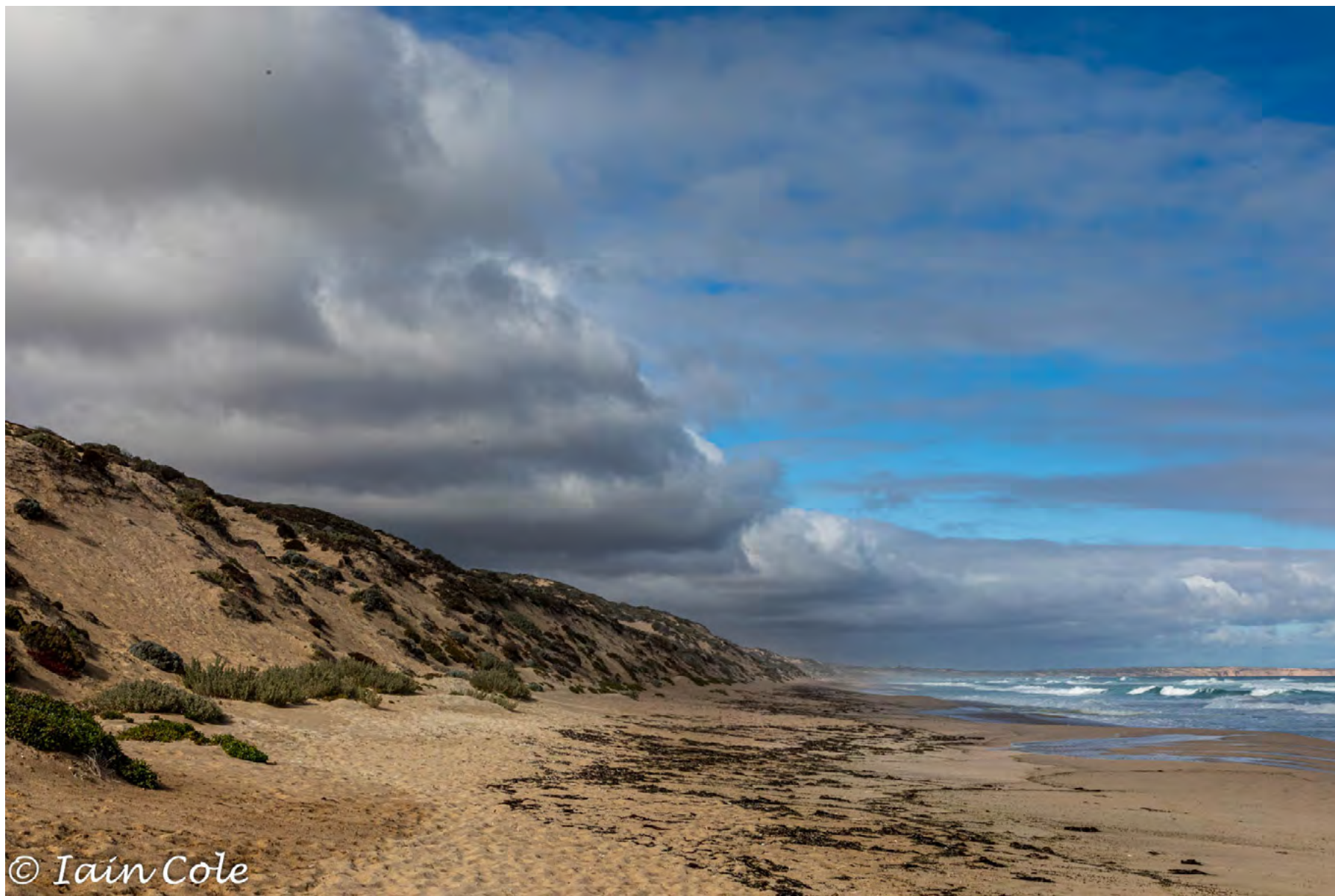
Where the weather starts. Streaky Bay loop drive Iain Cole