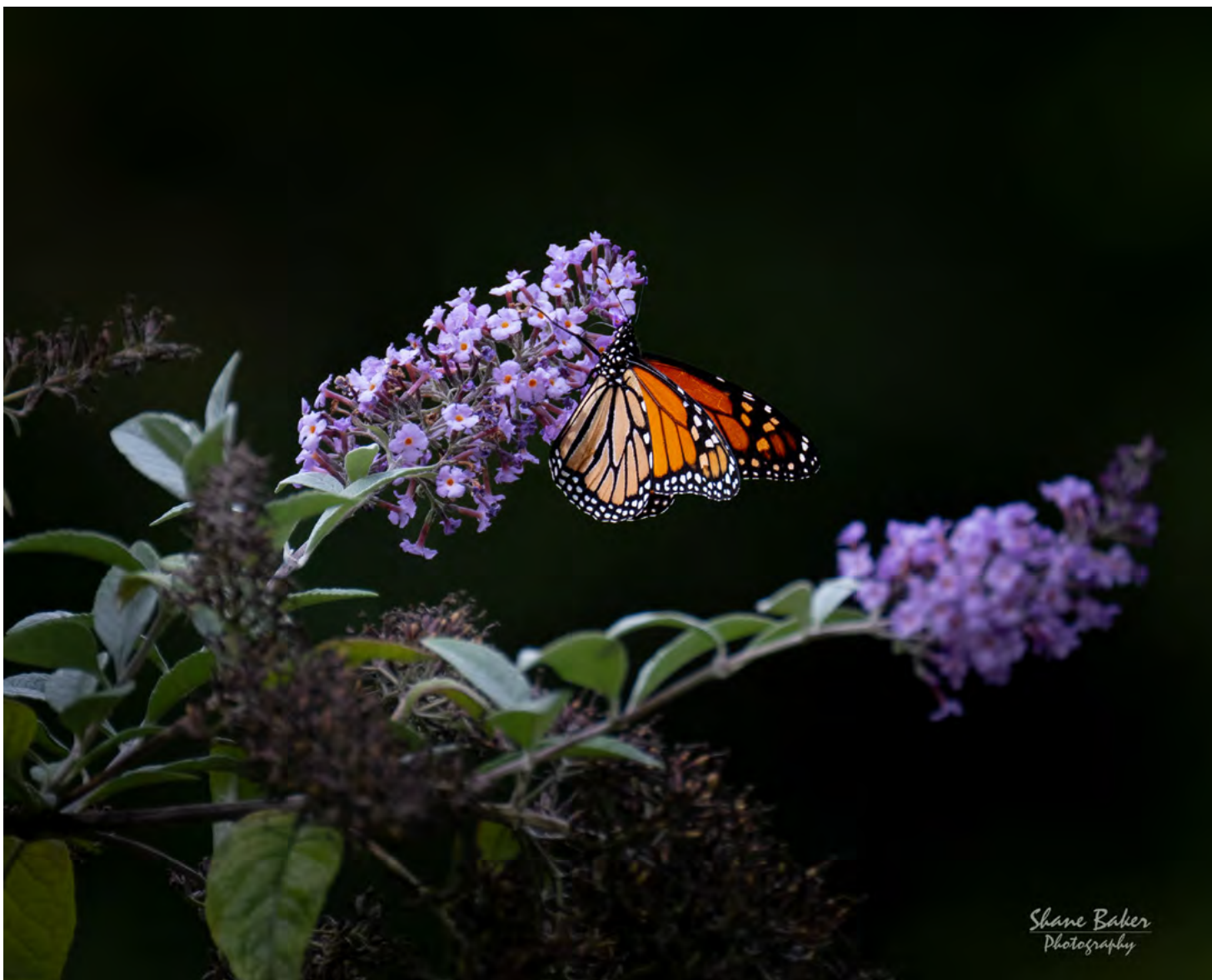
Monarch butterfly, Araluen, Perth Hills. Nikon Z9 with Nikkor Z 100-400mm at 400mm