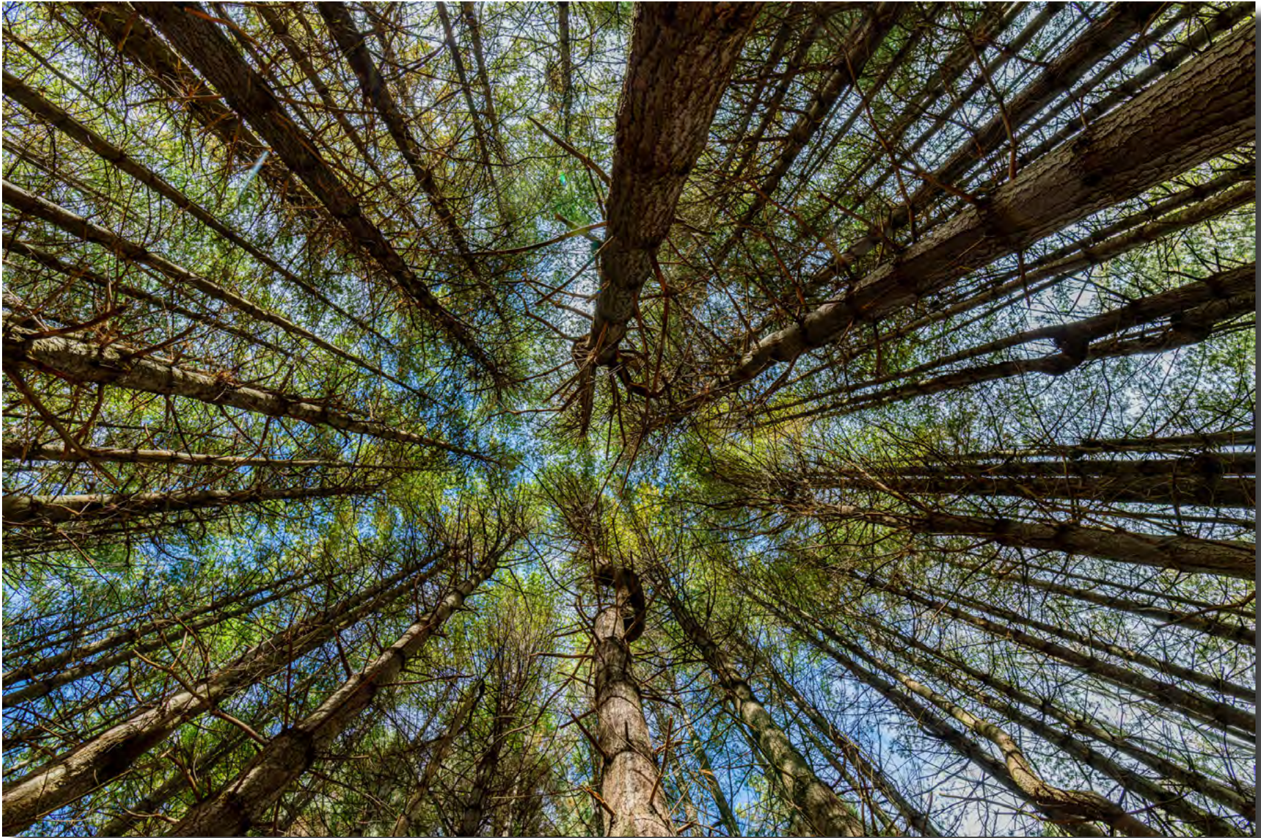
Bendora Arboretum