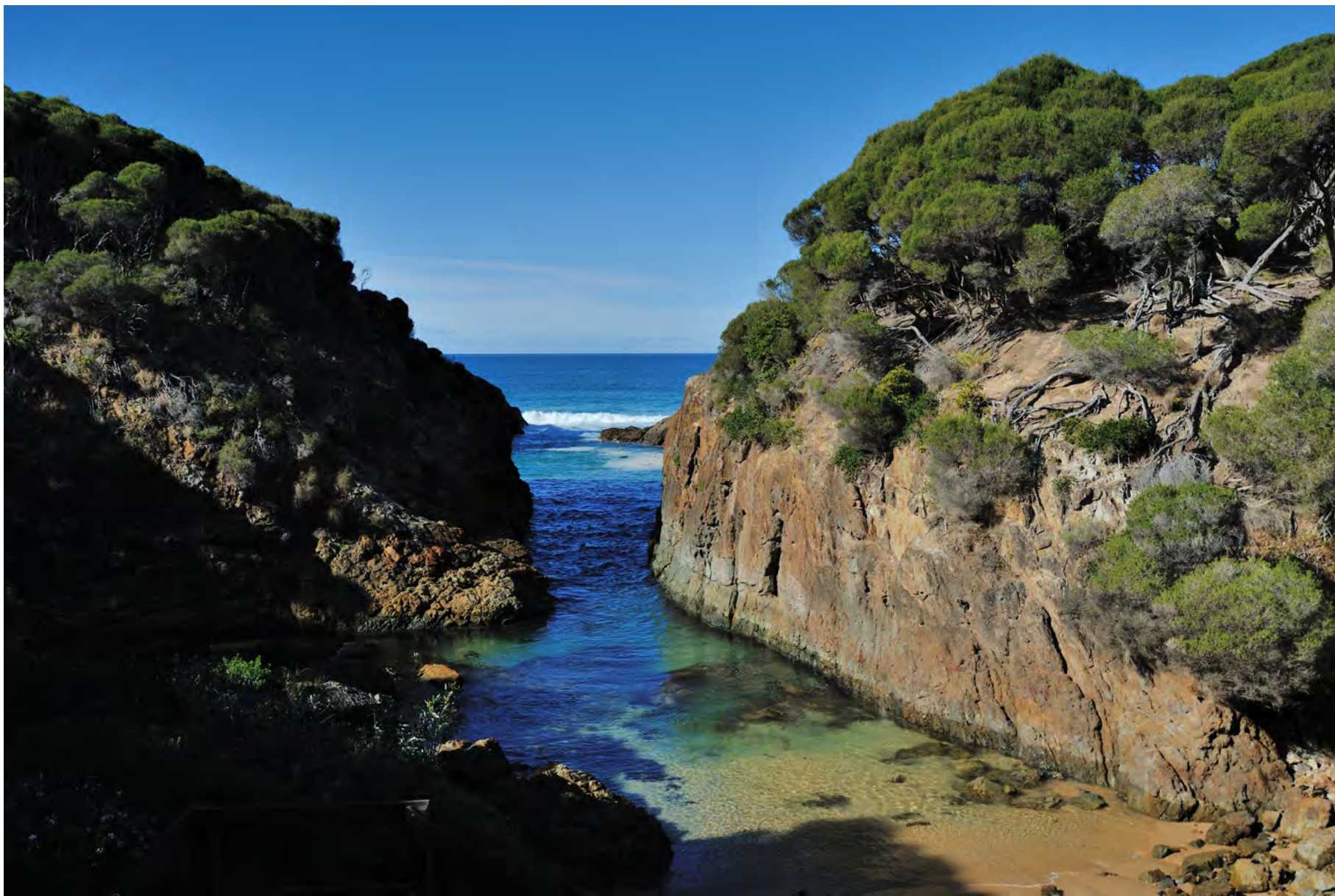
Merimbula Wallagoote Giles West