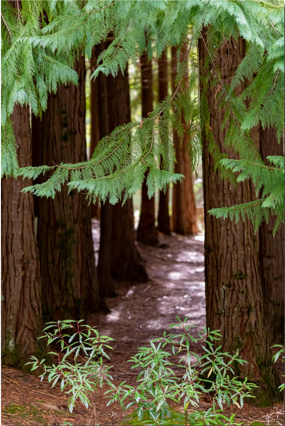
Bendora Arboretum