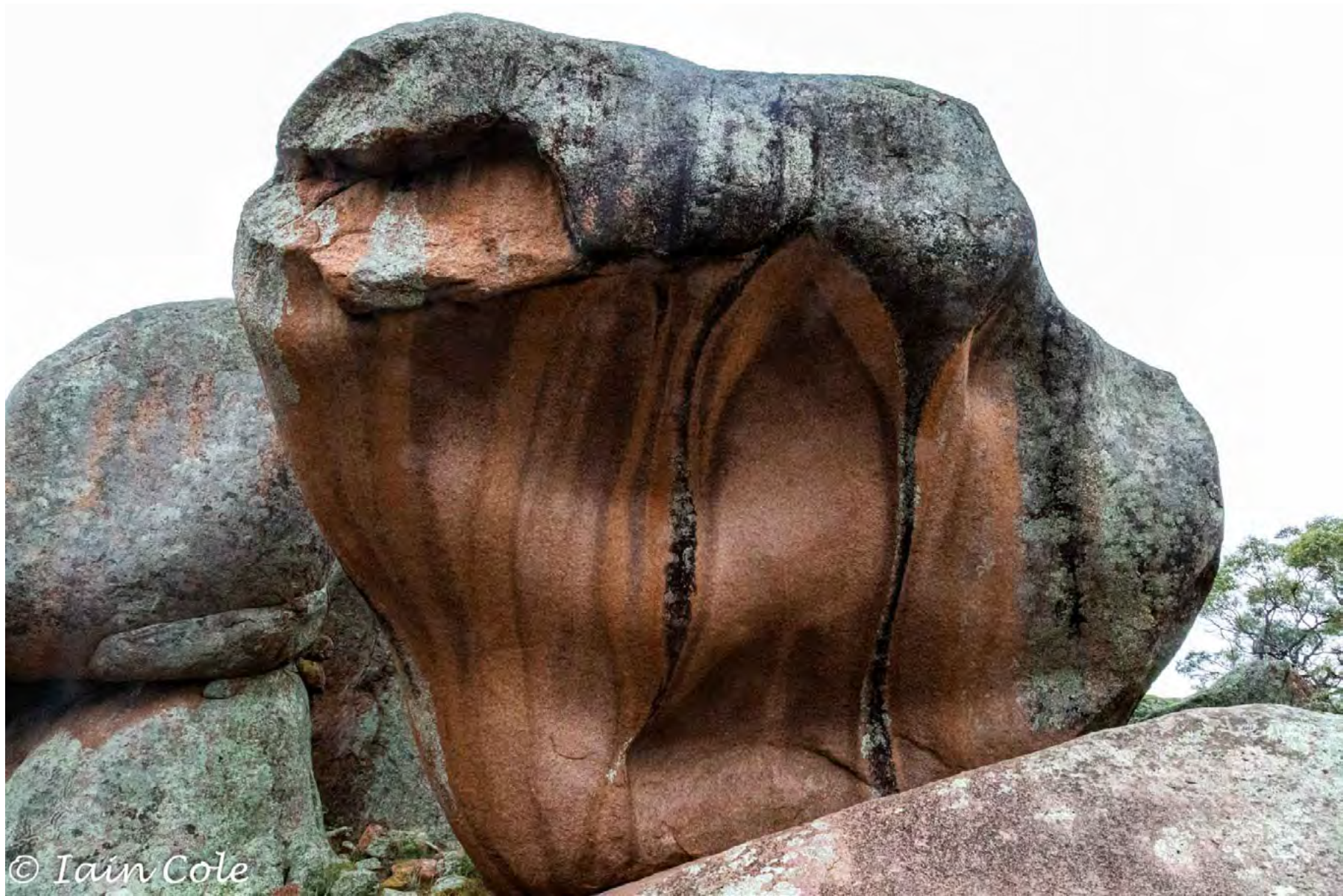
Portal to another realm. Part of Murphys Haystacks, on the way to Streaky Bay