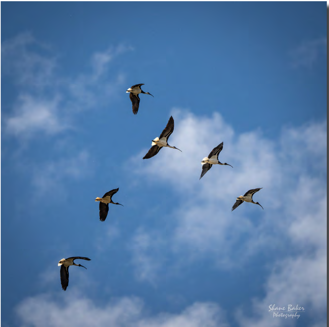
Straw Necked Ibis in formation, Herdsman Lake, Perth. Nikon Z9 with Nikkor 500mm pf - 1/1250 sec at f/6.3 and ISO 200