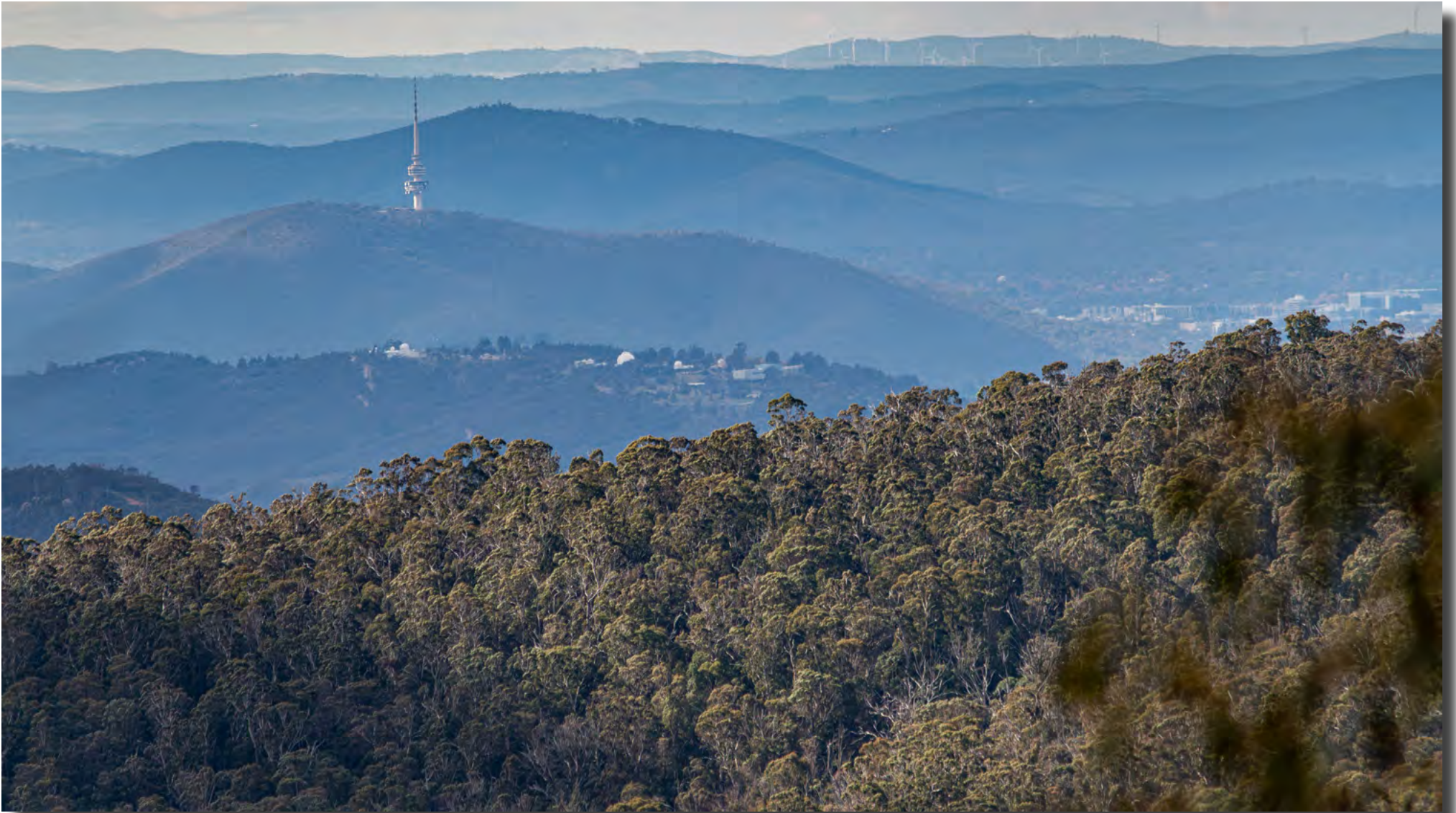
View from Bendora Arboretum trail head