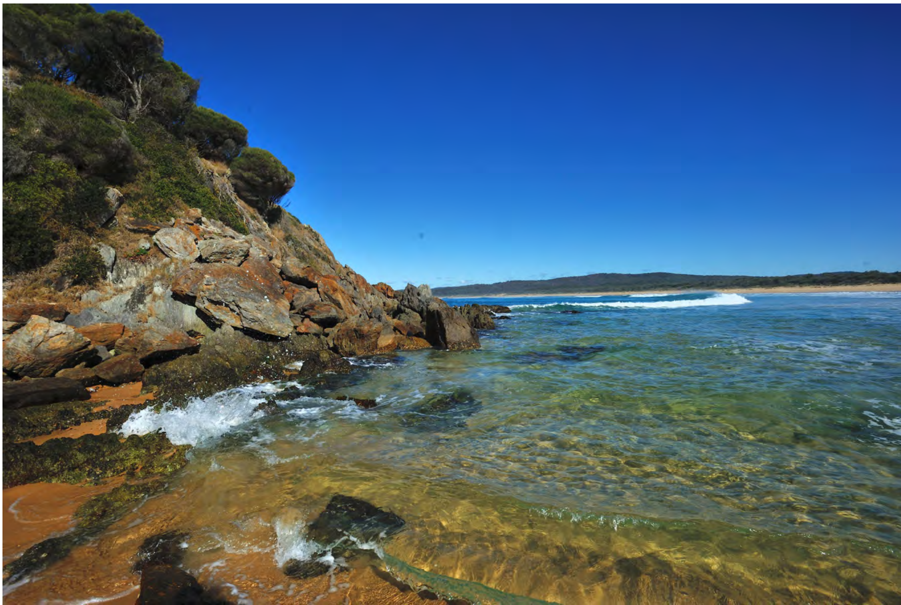
Merimbula Wallagoote Giles West