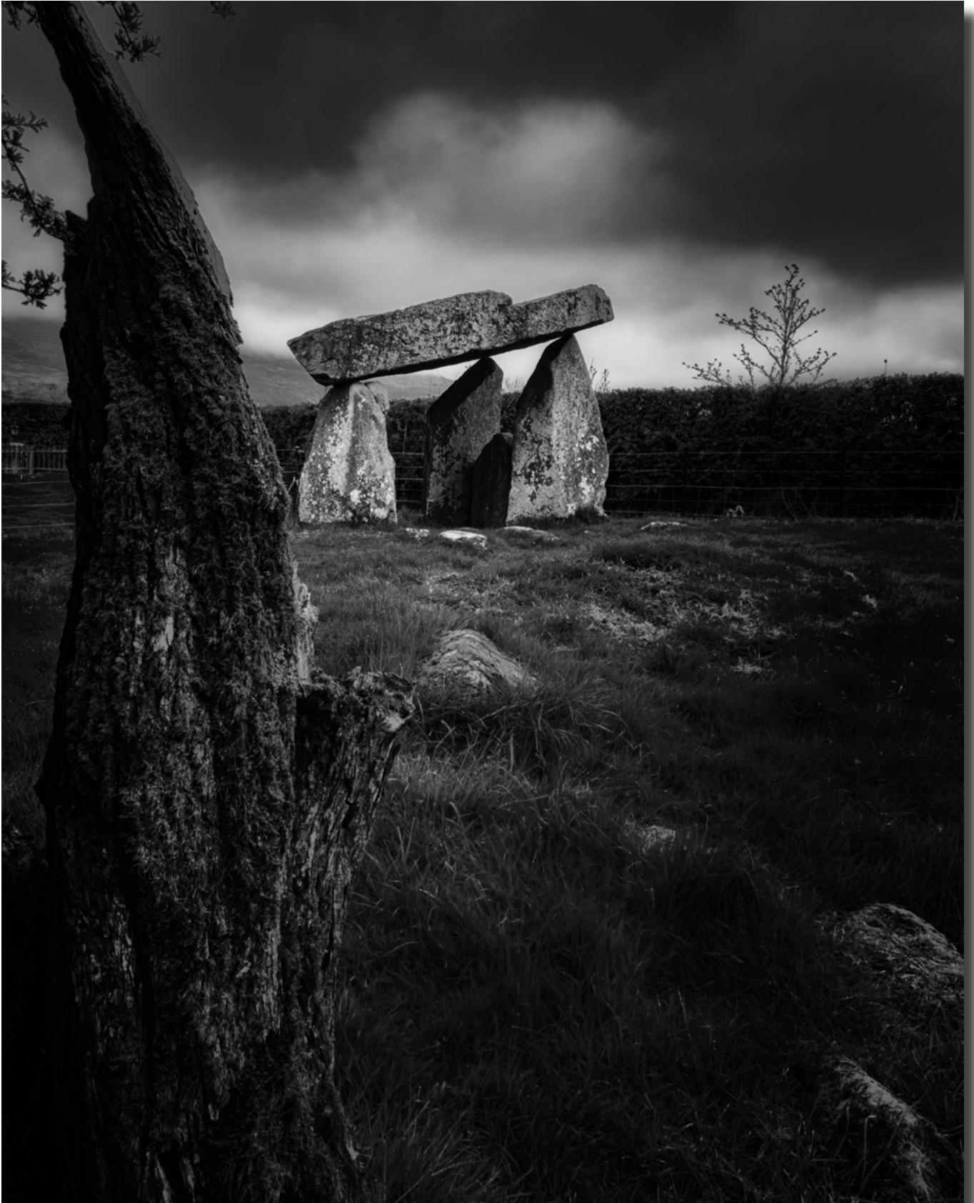
Portal Tomb, County Armagh, Ireland