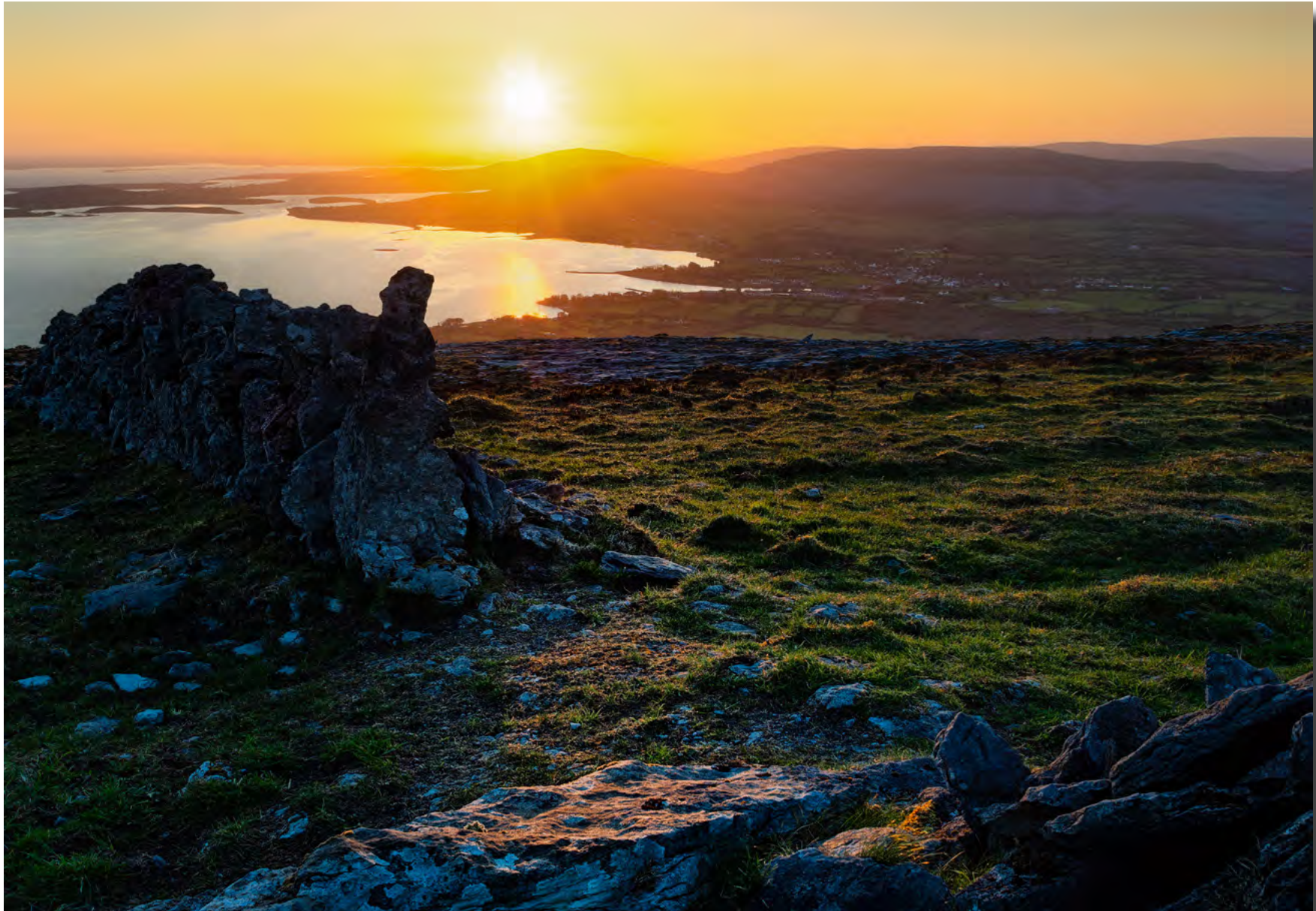
Sunrise over Ballyvaughn Bay, Ireland