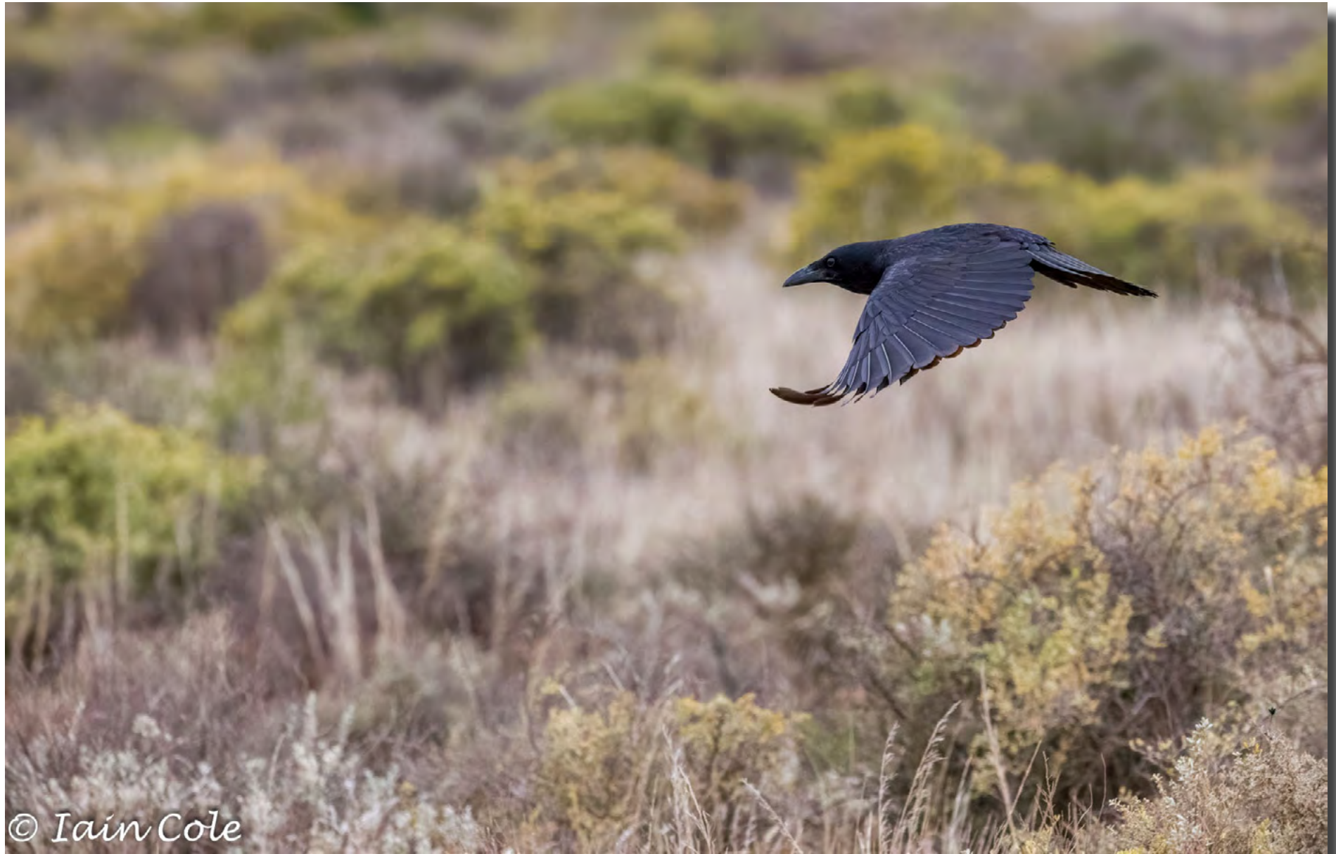
Sleek Lines. A Raven at Mundrabilla water tanks Iain Cole