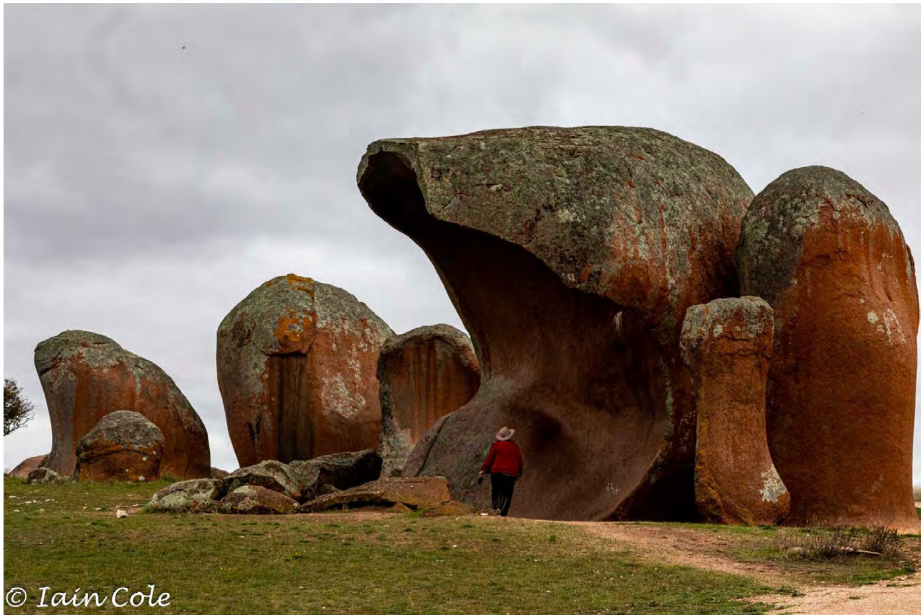
Murphys Haystacks. Their size is deceptive until somebody walks near them Iain Cole