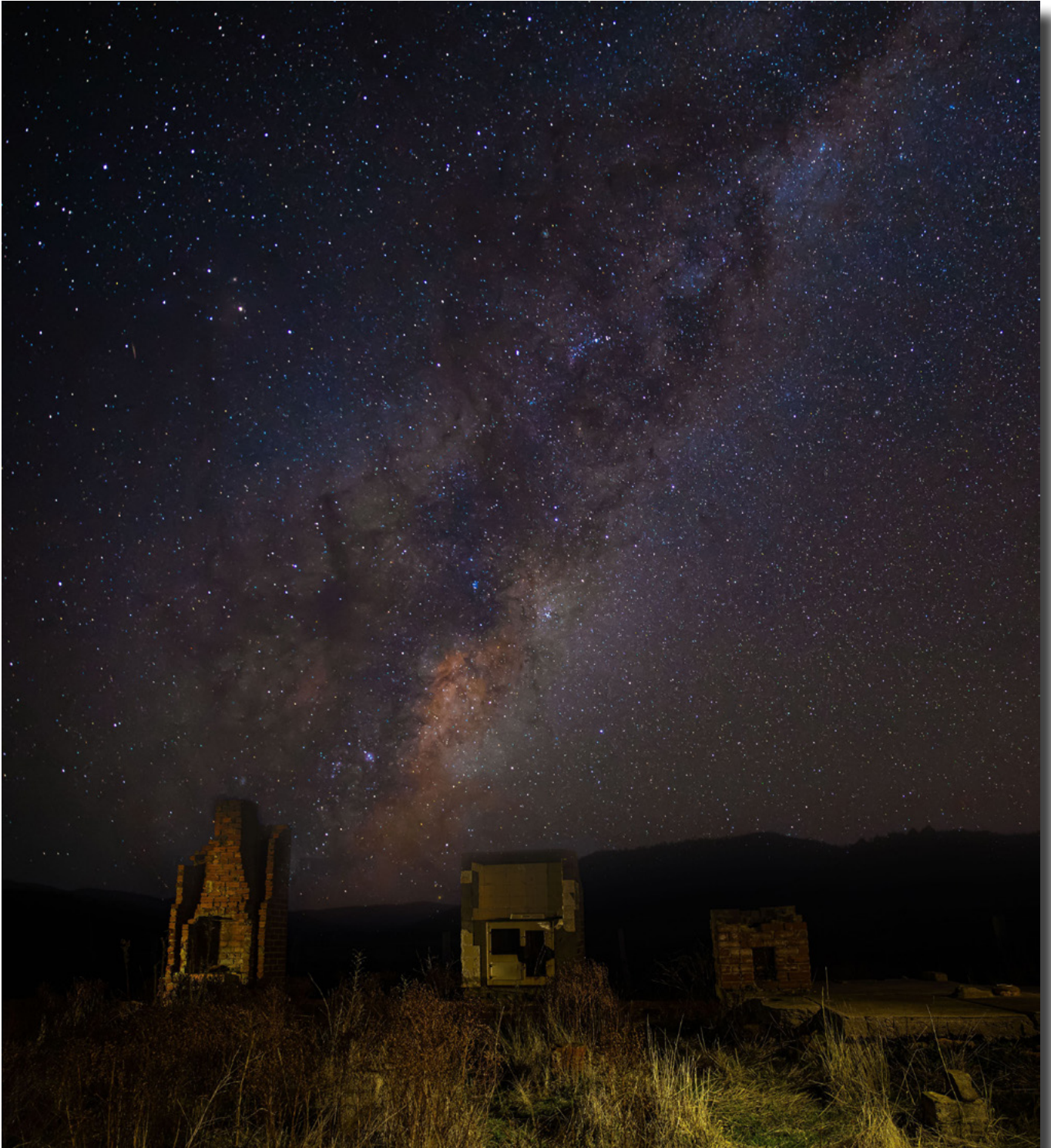
Milky Way Luminita Lenuta