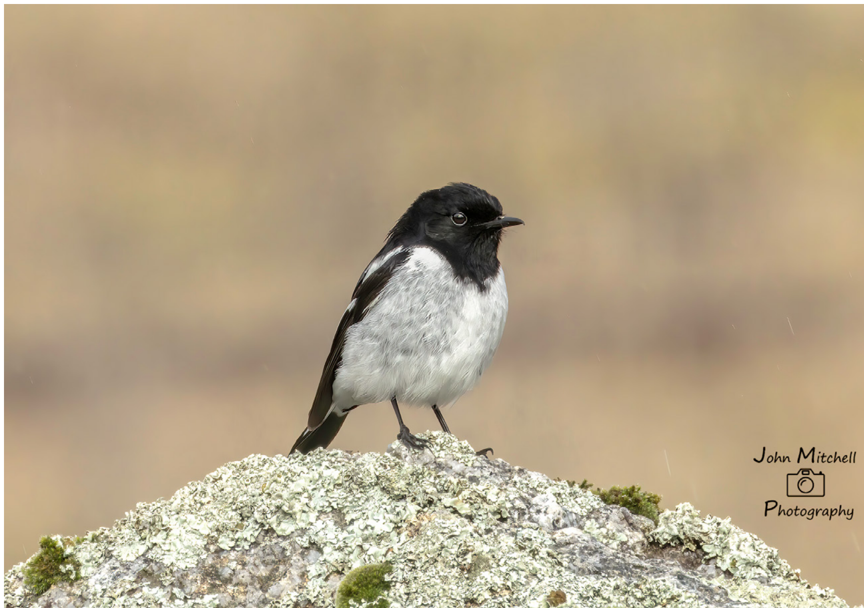
Hooded Robin