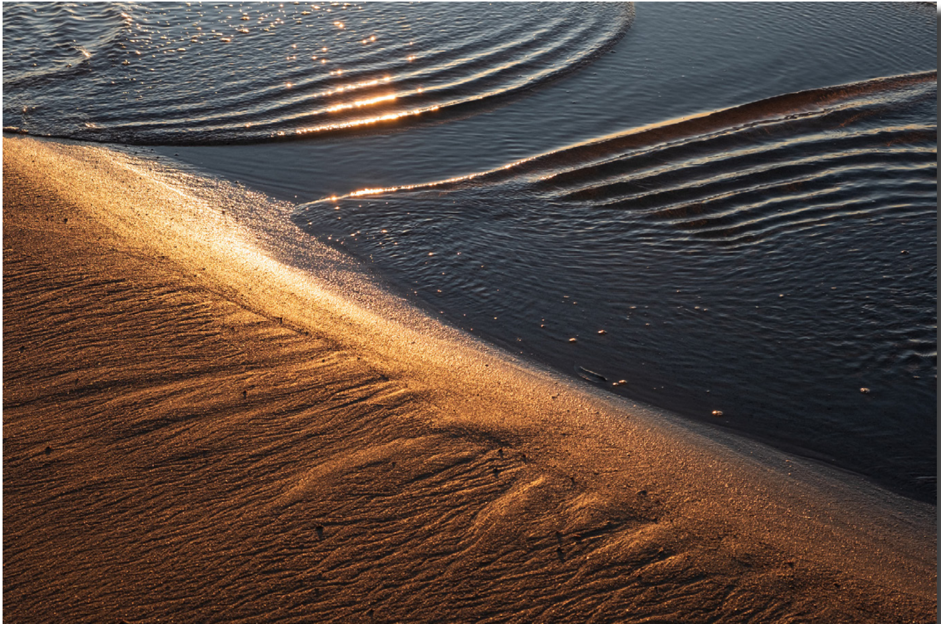
Opposing forces Rod Burgess