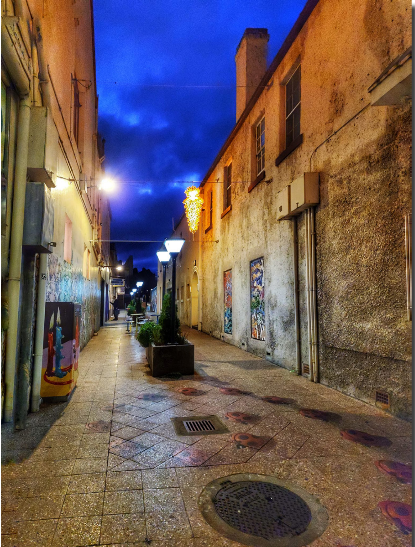
Goulburn night Luminita Lenuta