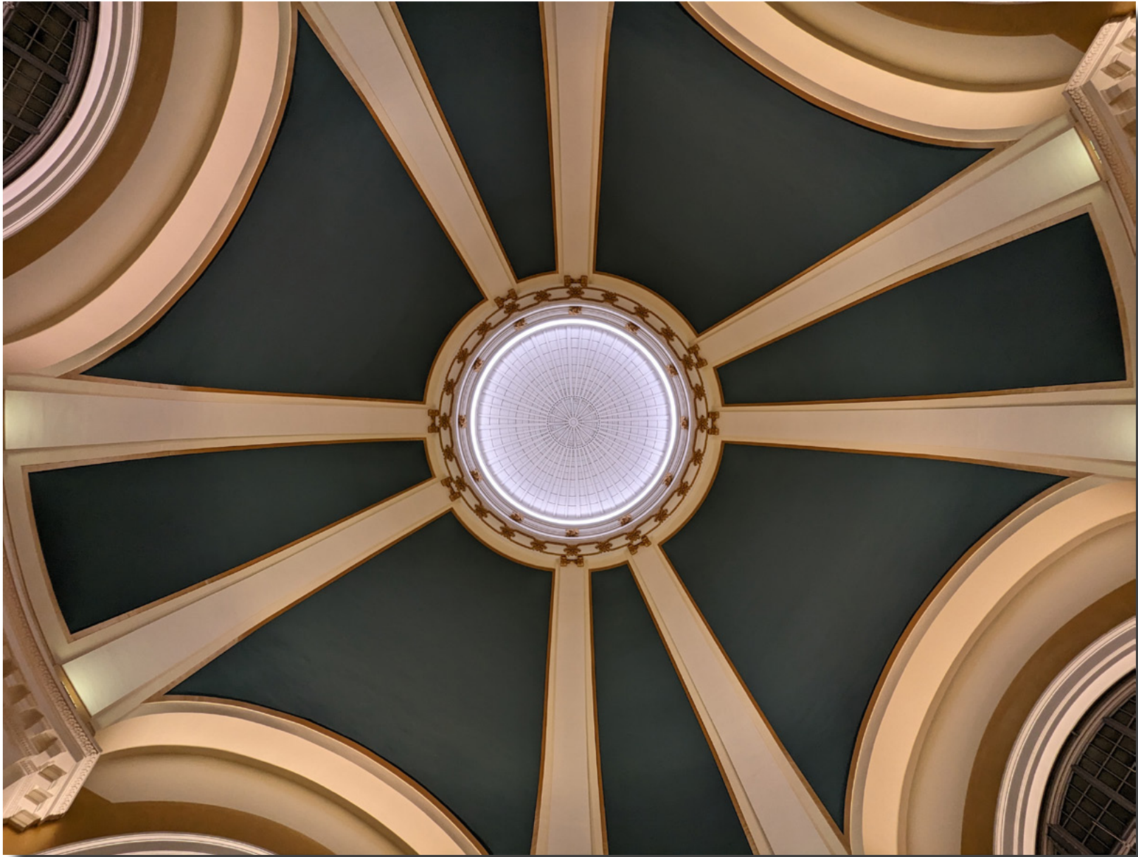
Ceiling in Winnipeg train station, Canada