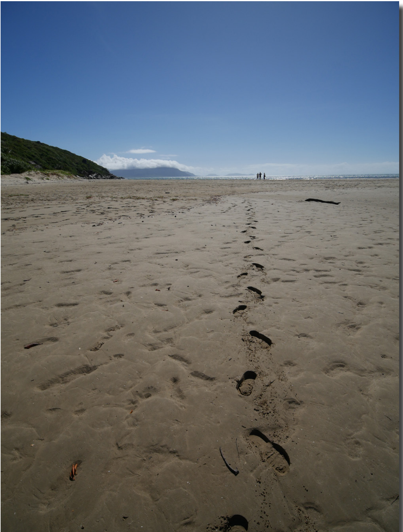
Finch Bay Cooktown Bill Blair