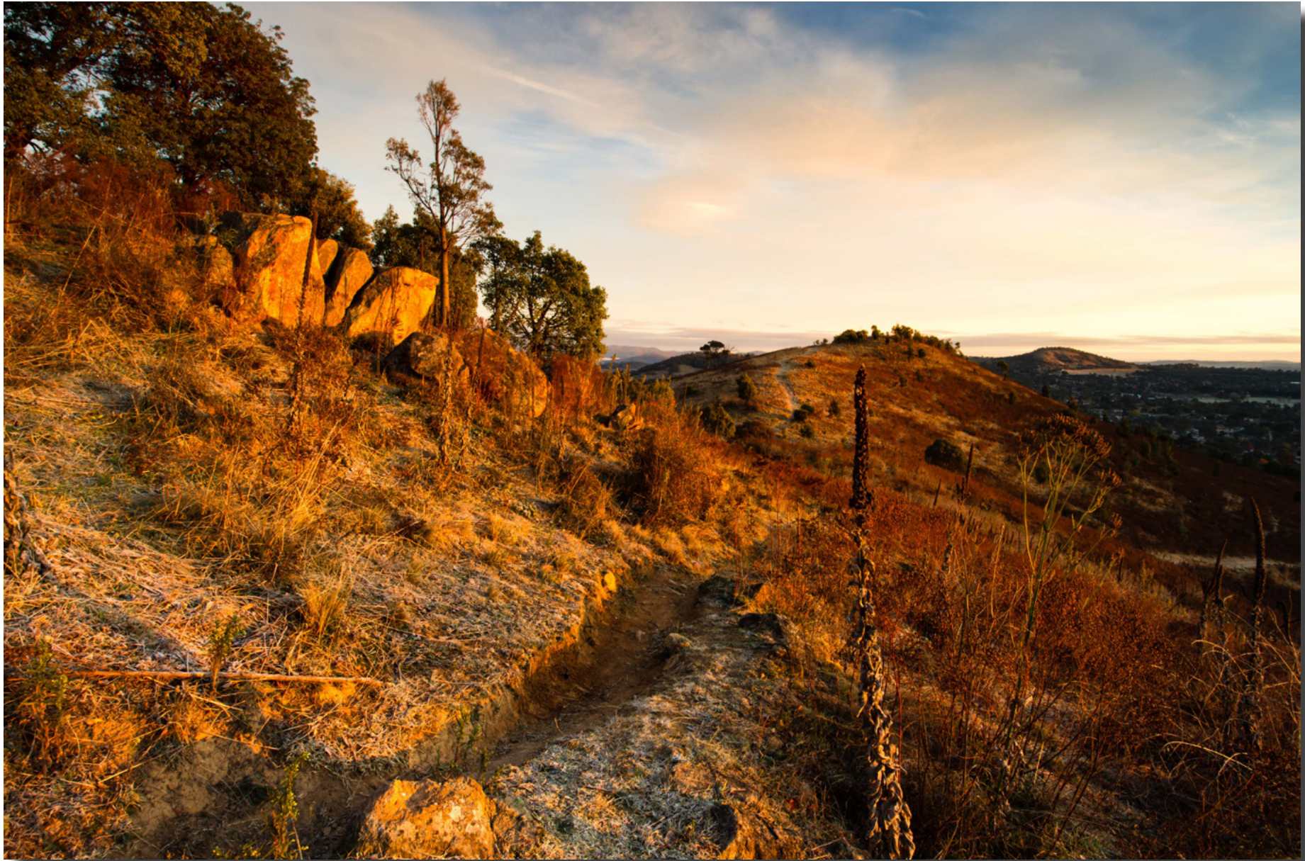
Urambi Hills at dawn