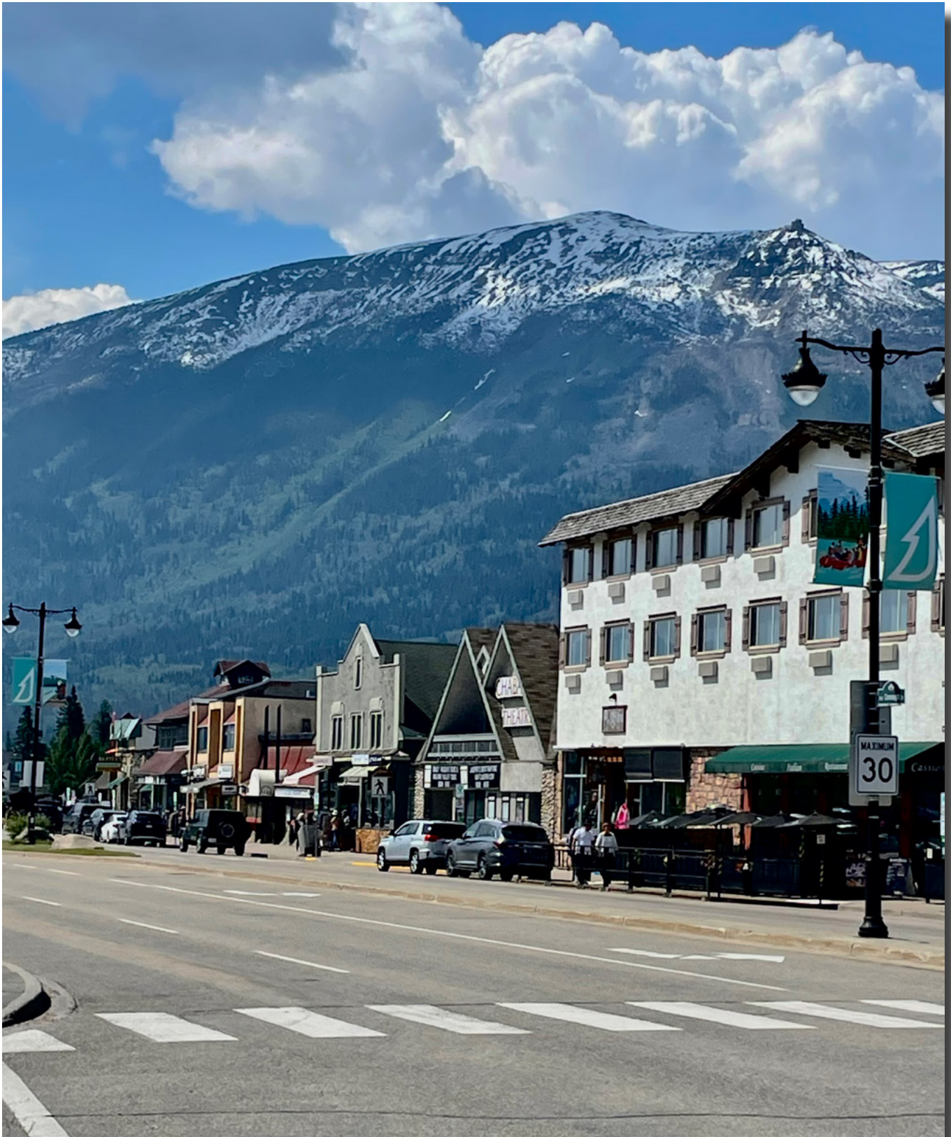
Street in Jasper, Canada