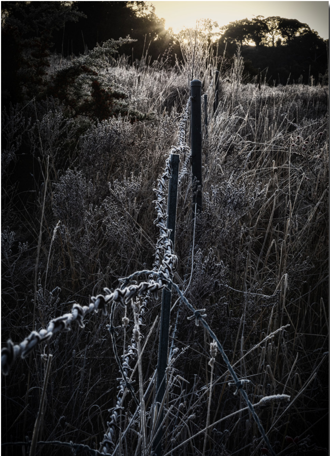
Fence and frost