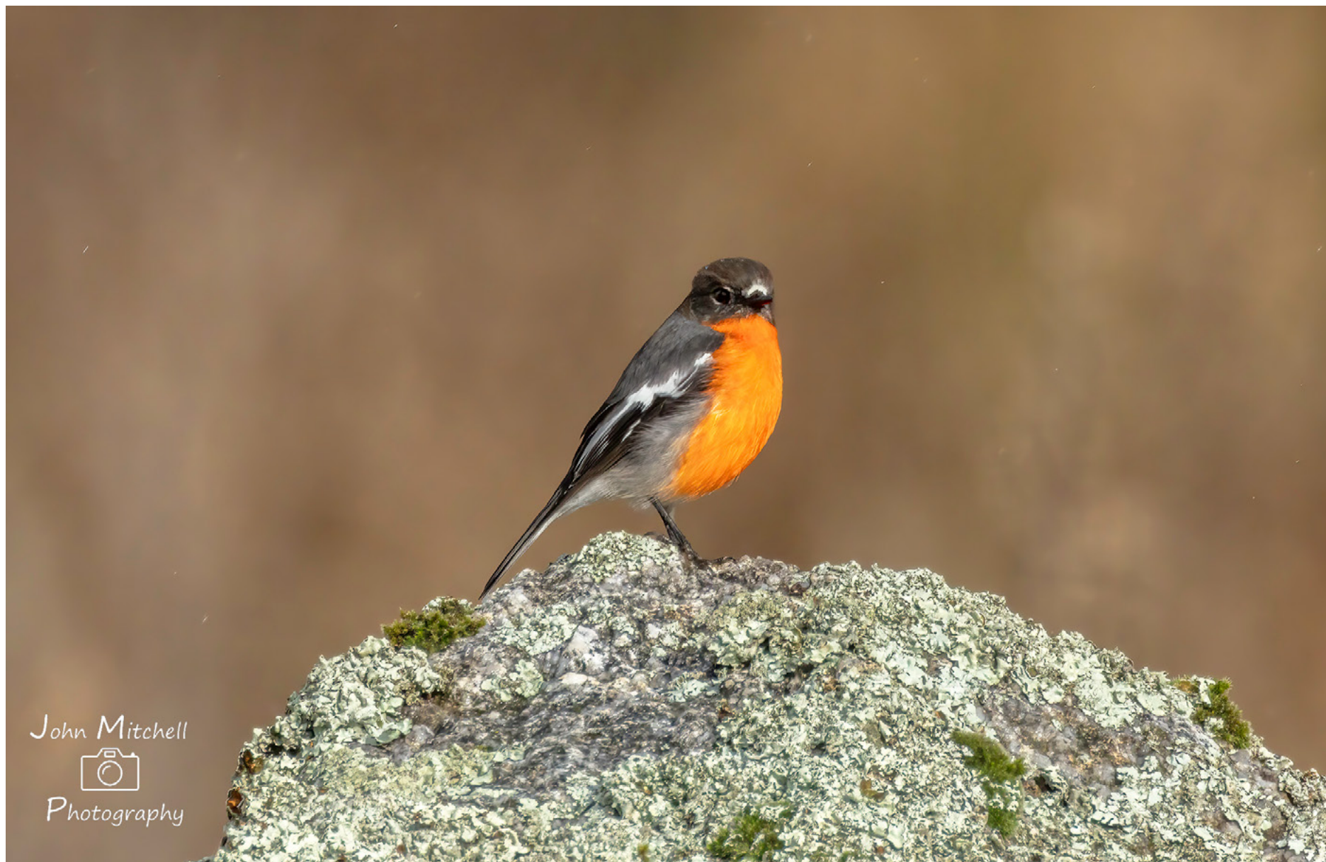
Flame Robin