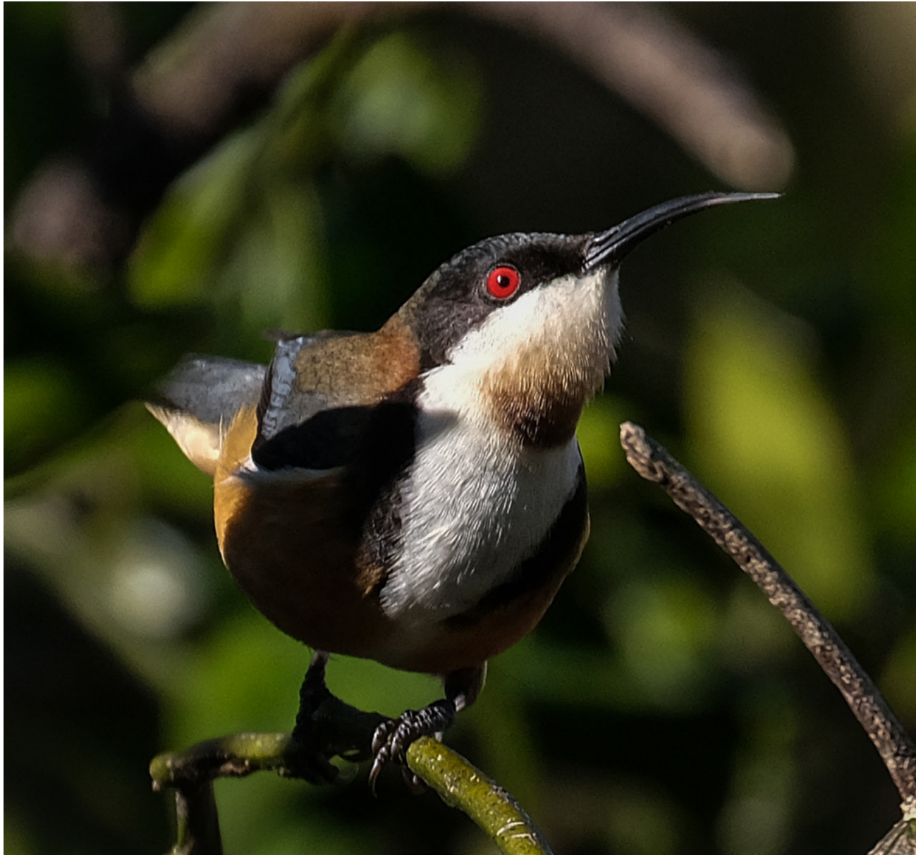
Eastern Spinebill Rod Burgess