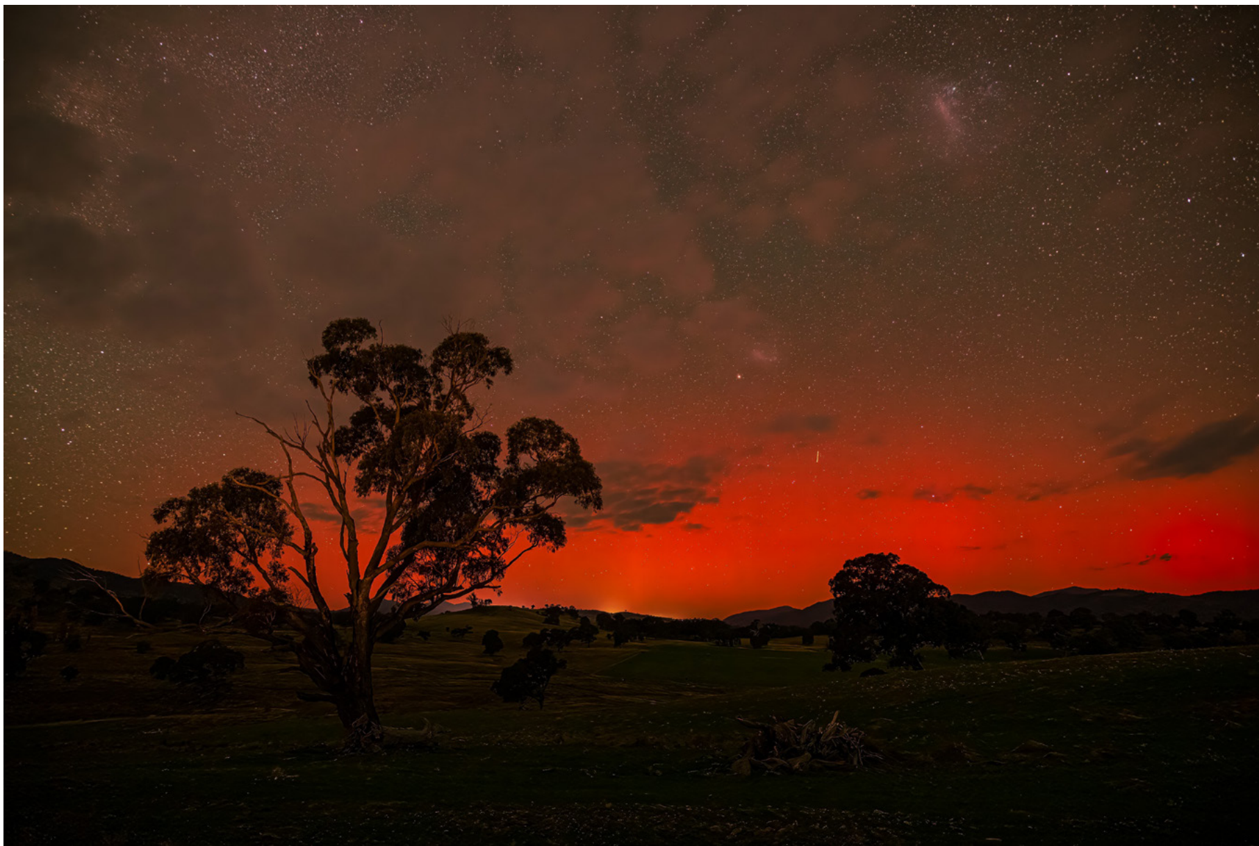
Aurora Luminta Lenuta