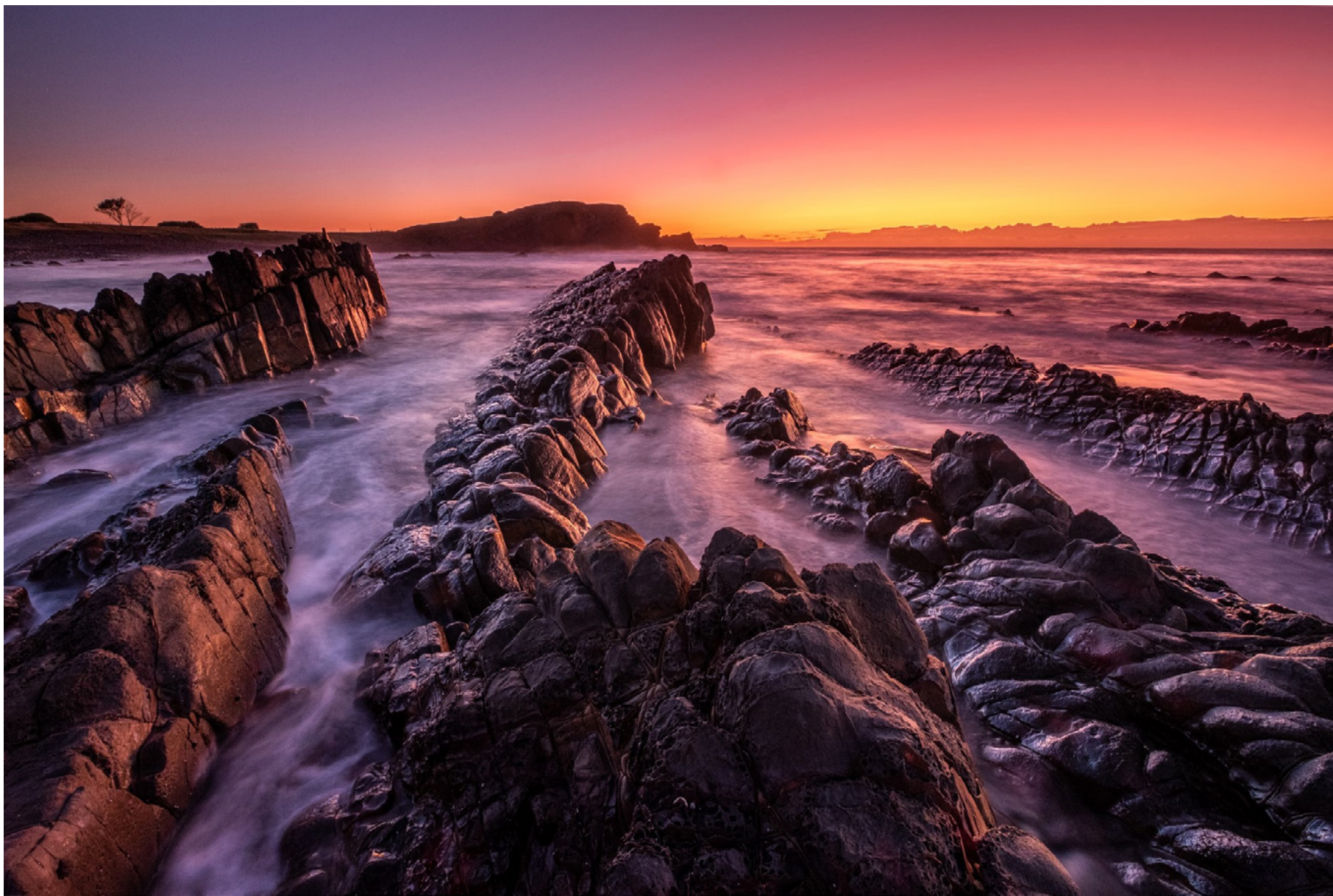
Crescent Head sunrise Rod Burgess