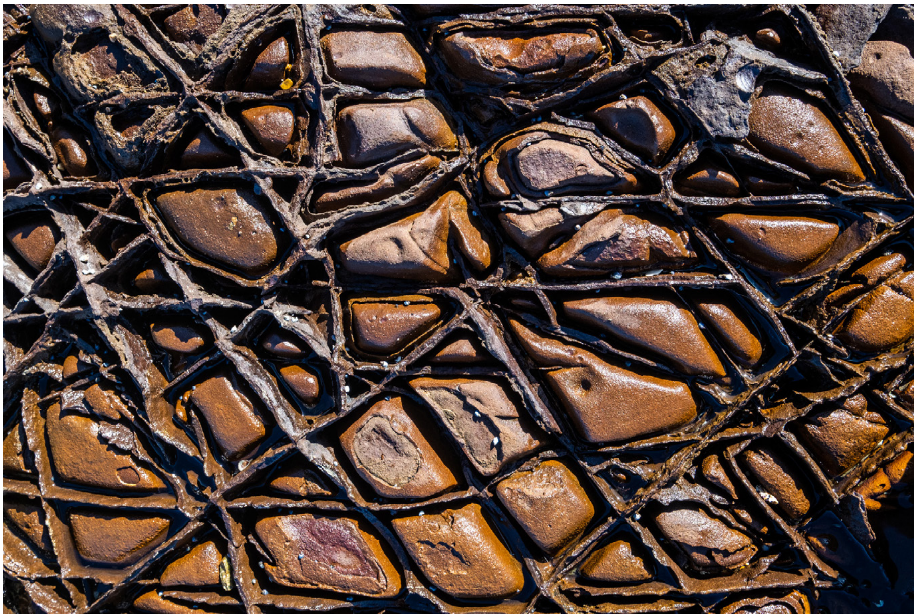
Chocolate box rock Rod Burgess