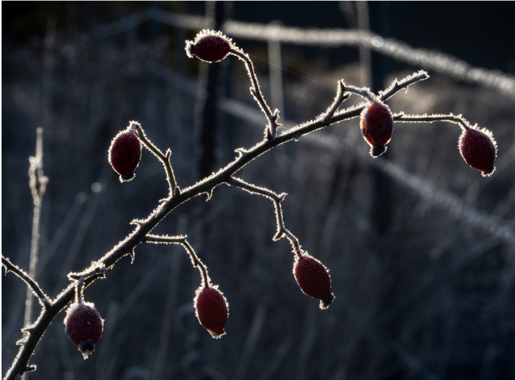
Bound in crystal Bob McHugh