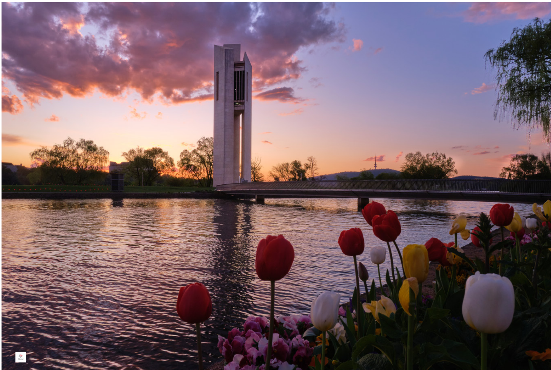
Carillon at dusk Subramaniam Sukumar