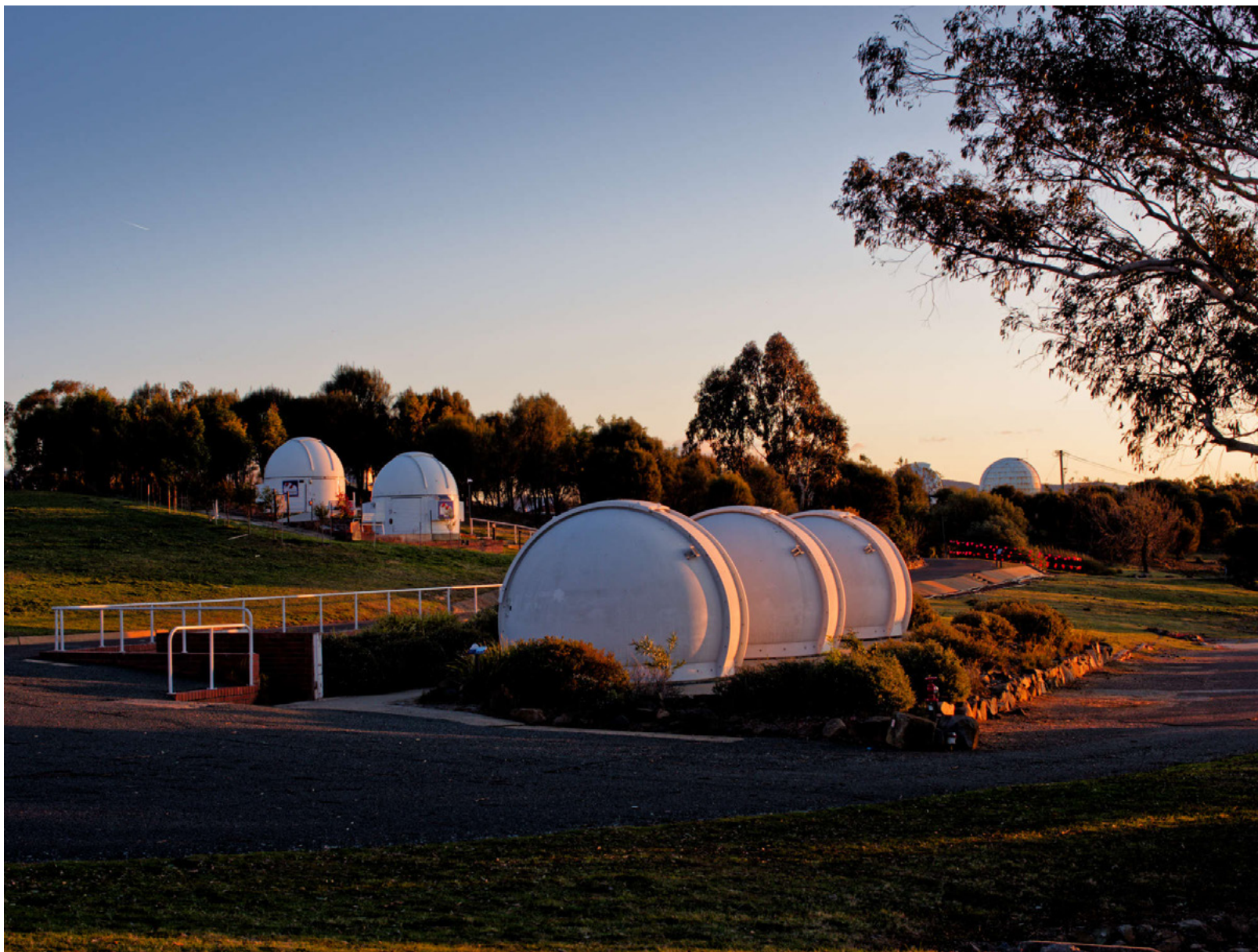
Mt Stromlo Brian Moir