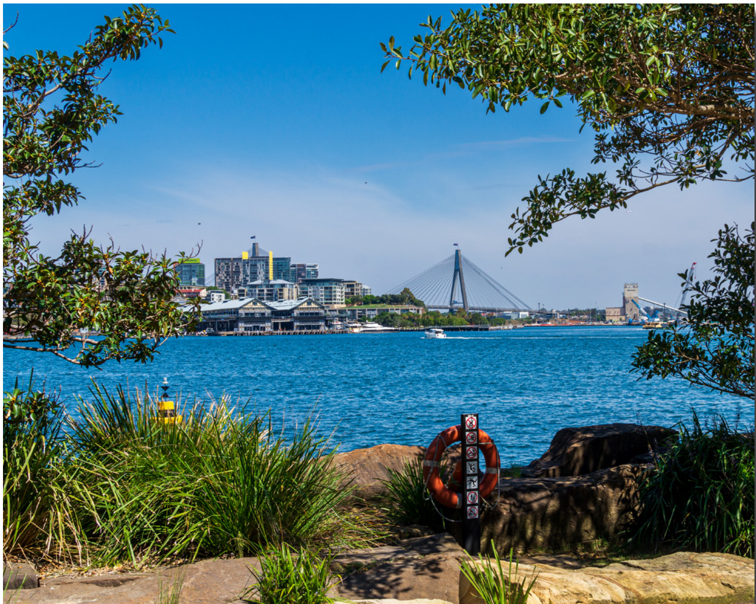
View from Barangaroo Warren Hicks