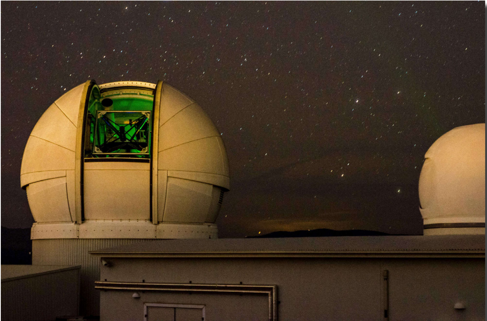
Mt Stromlo Brian Moir