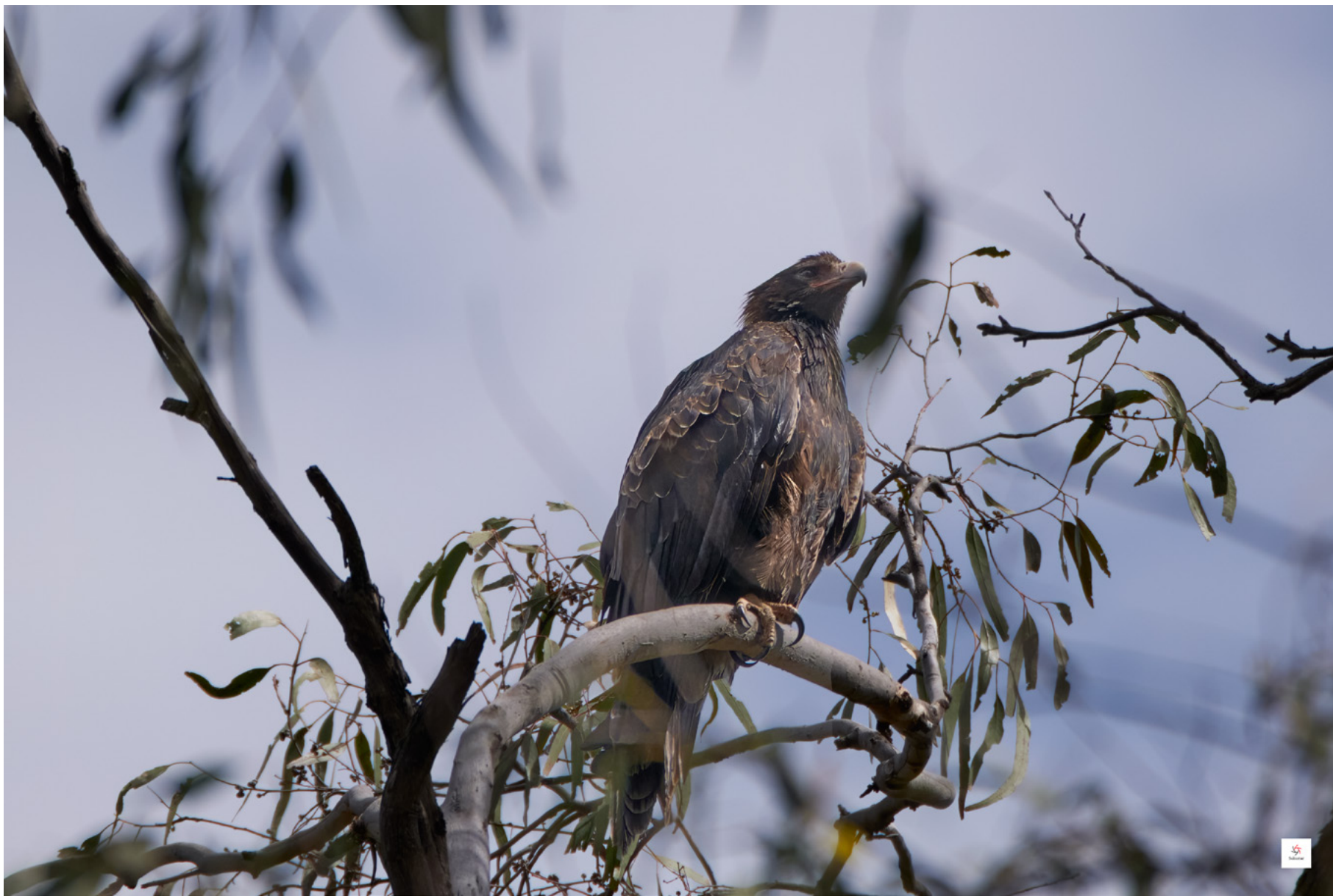
Wedged-tailed Eagle Subramaniam Sukumar