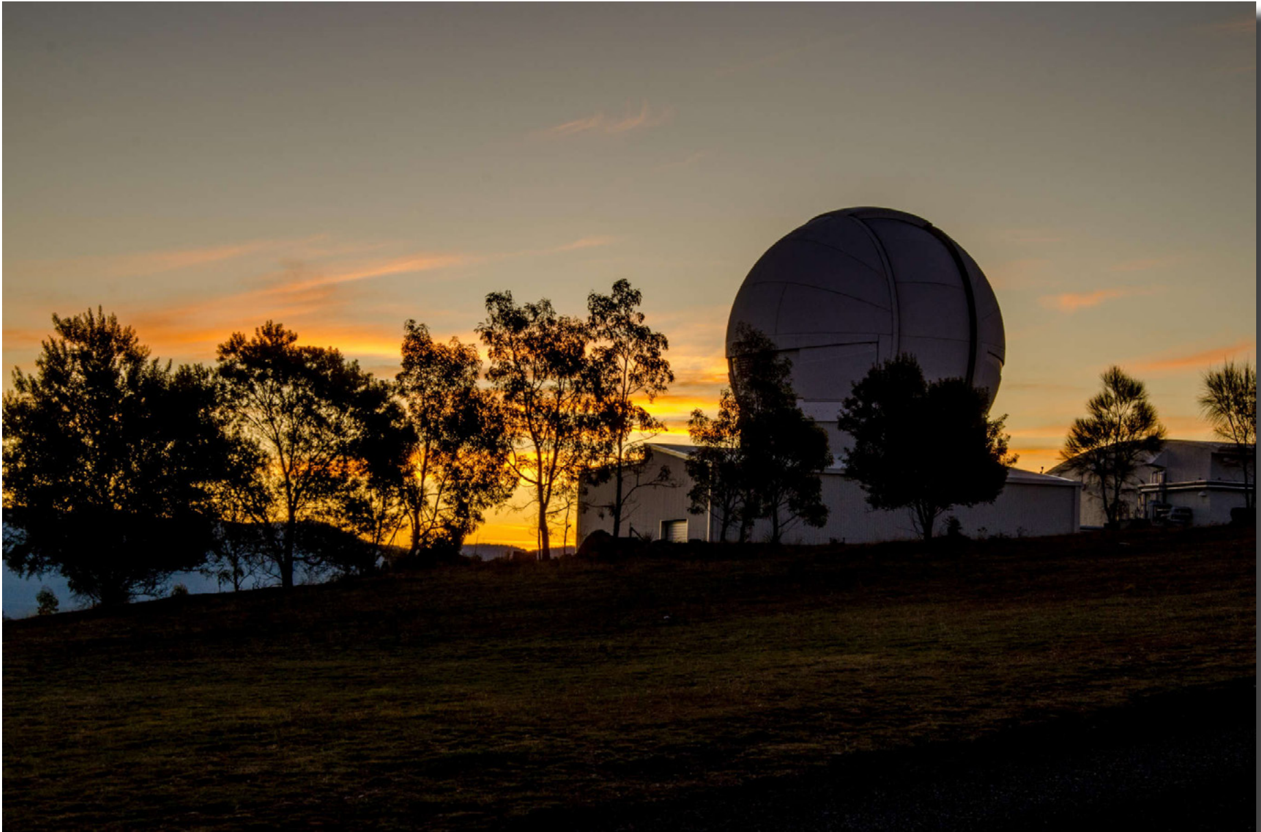
Mt Stromlo Brian Moir