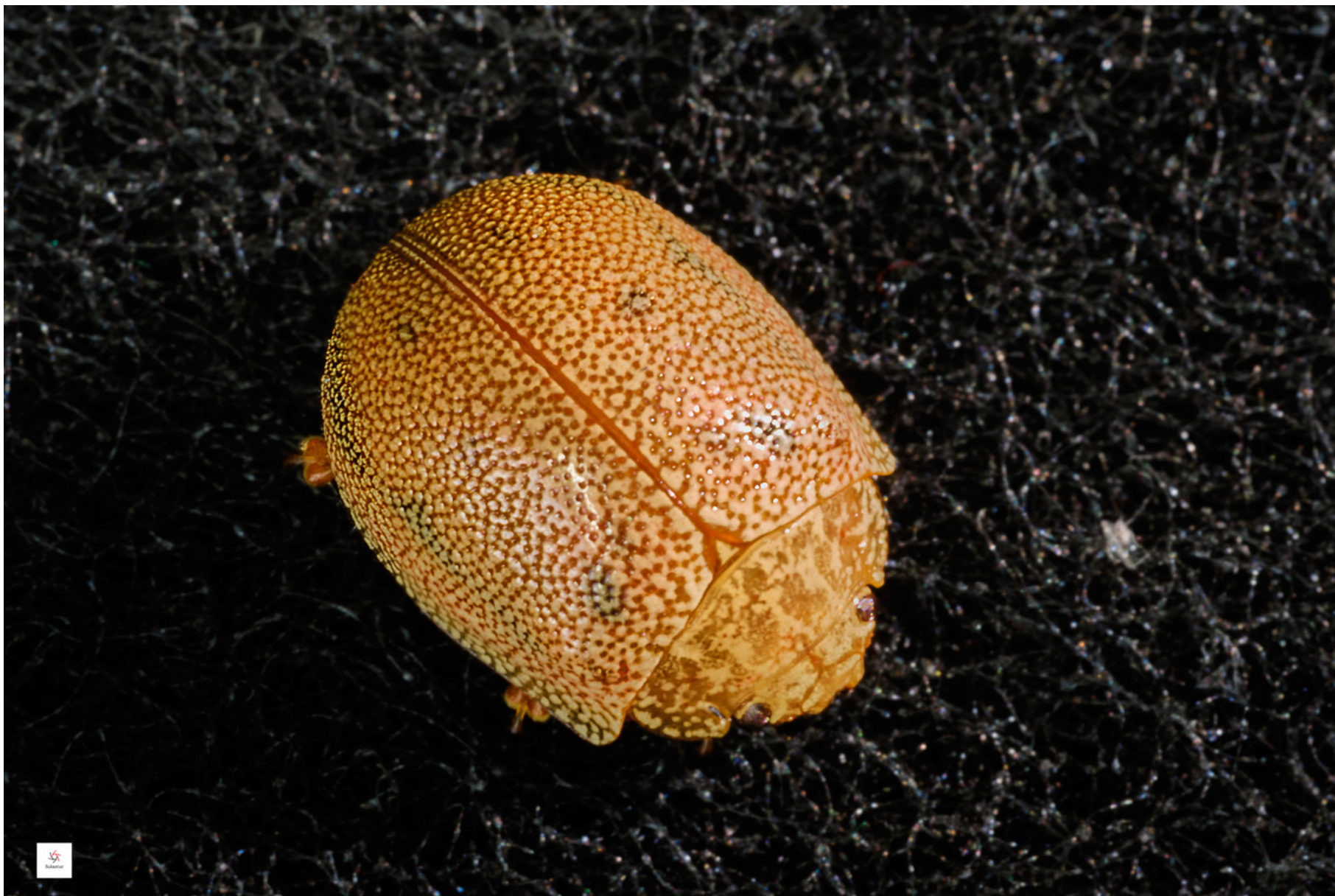
Paropsis atomaria, Eucalyptus leaf beetle Subramaniam Sukumar