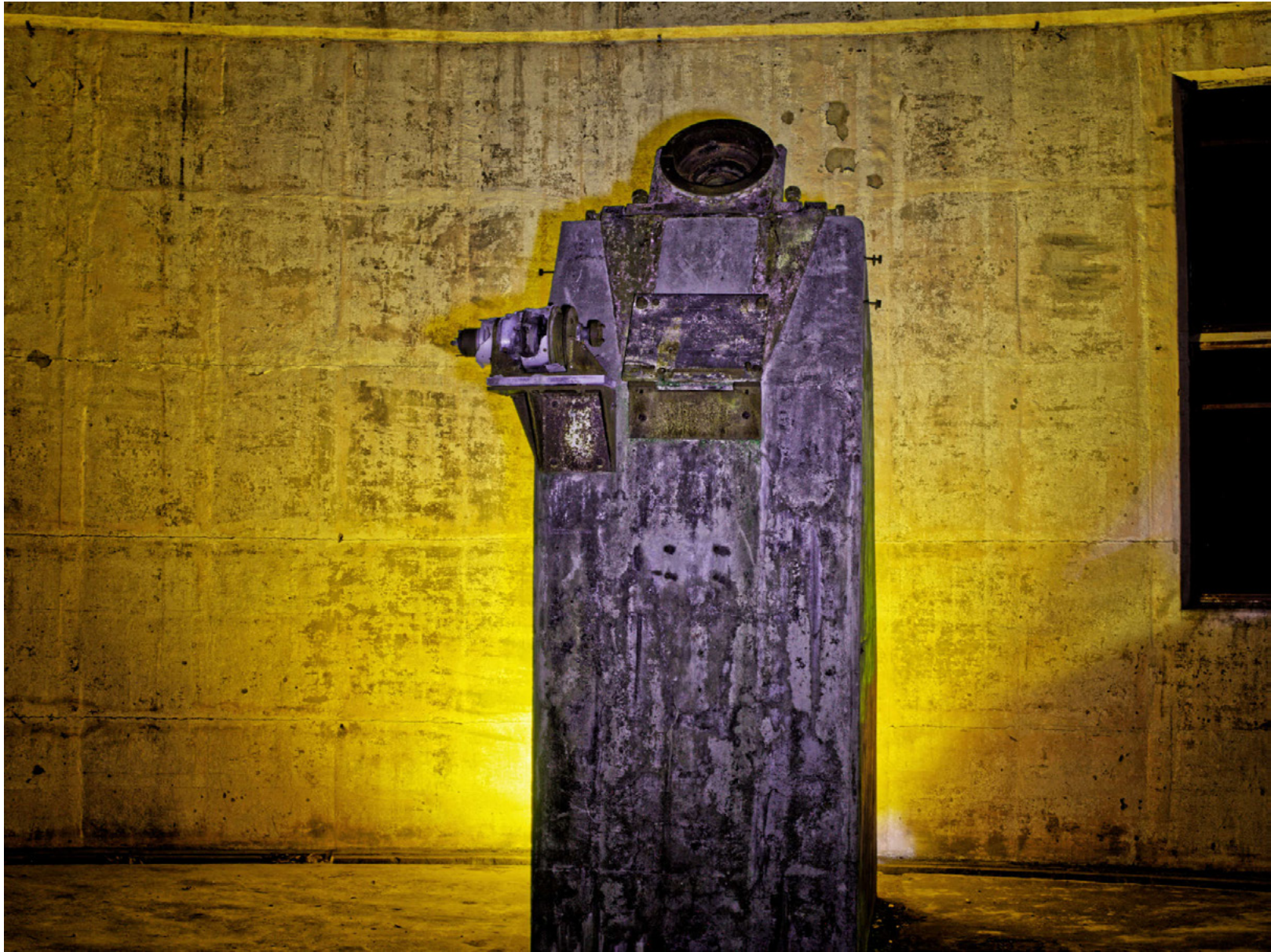
Mt Stromlo Brian Moir