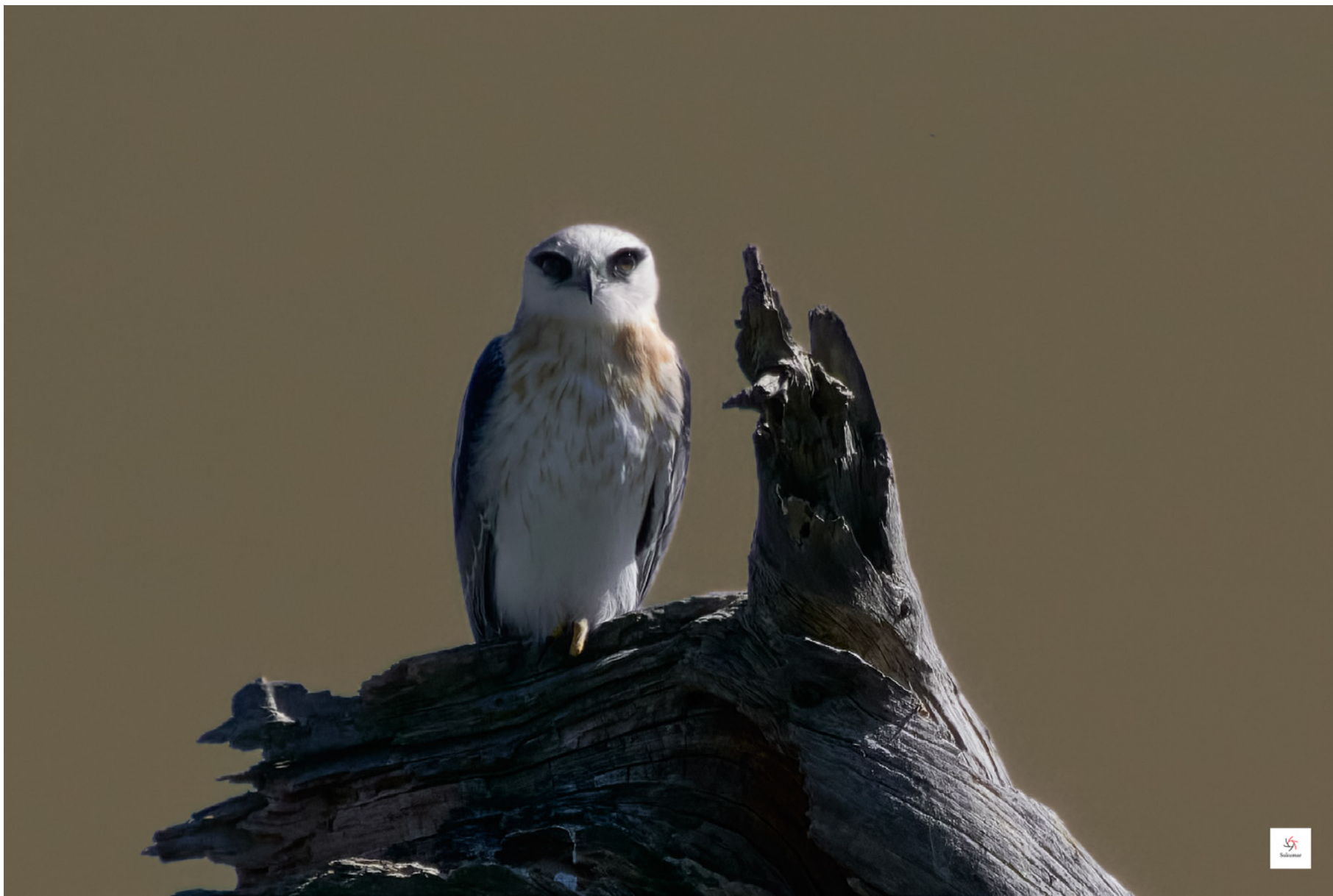
Black-shouldered Kite Subramaniam Sukumar