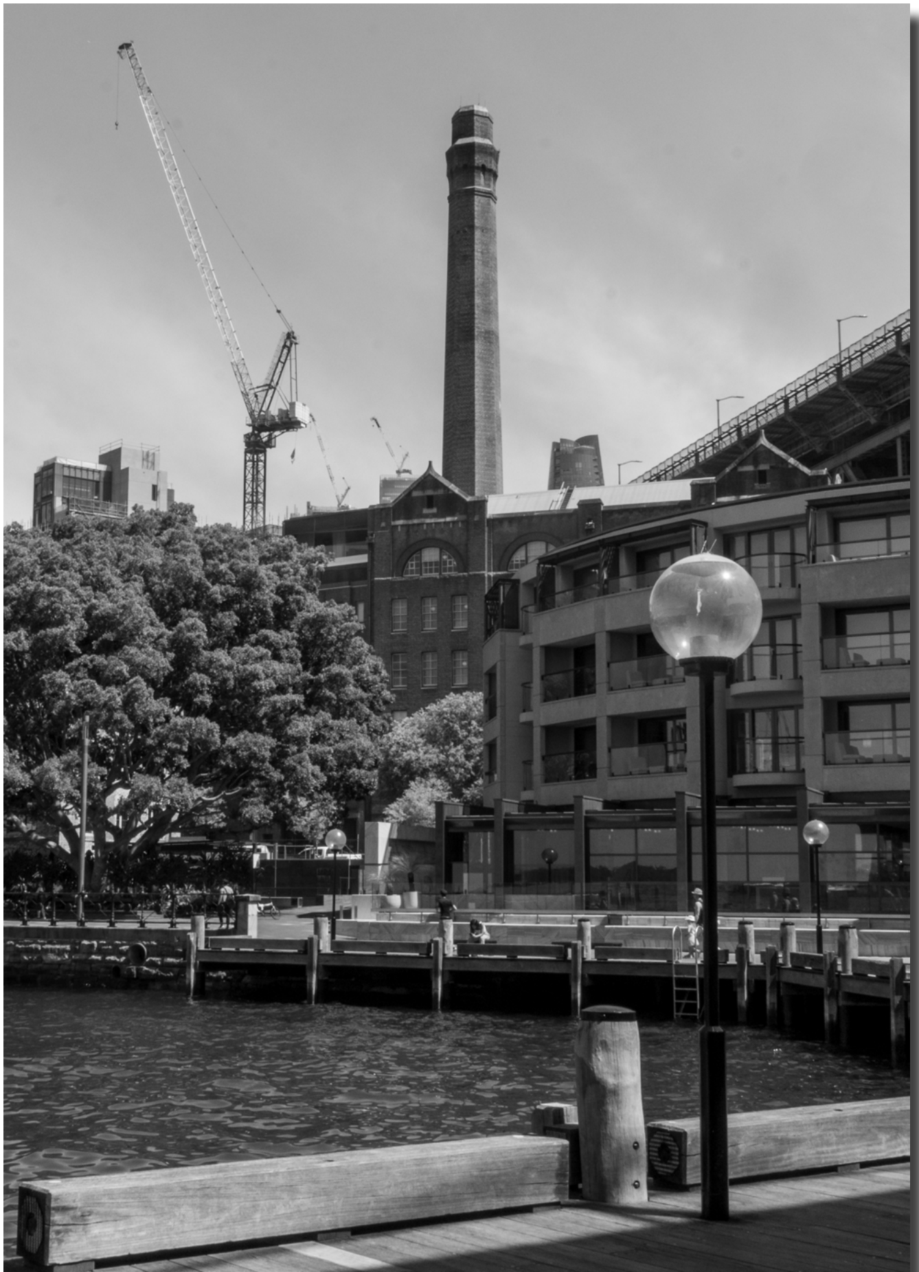
Campbells Cove Warren Hicks