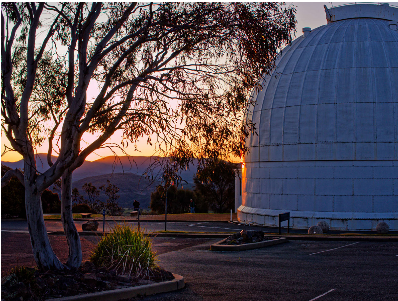
Mt Stromlo Brian Moir