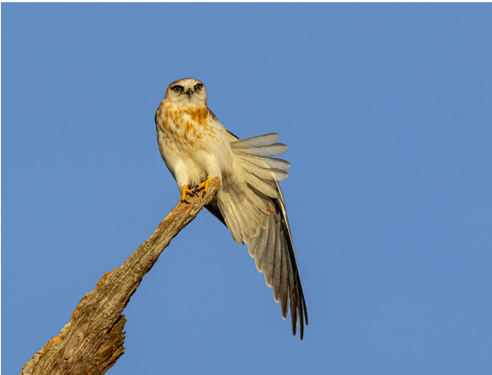
Black-shouldered Kite, Jerrabomberra