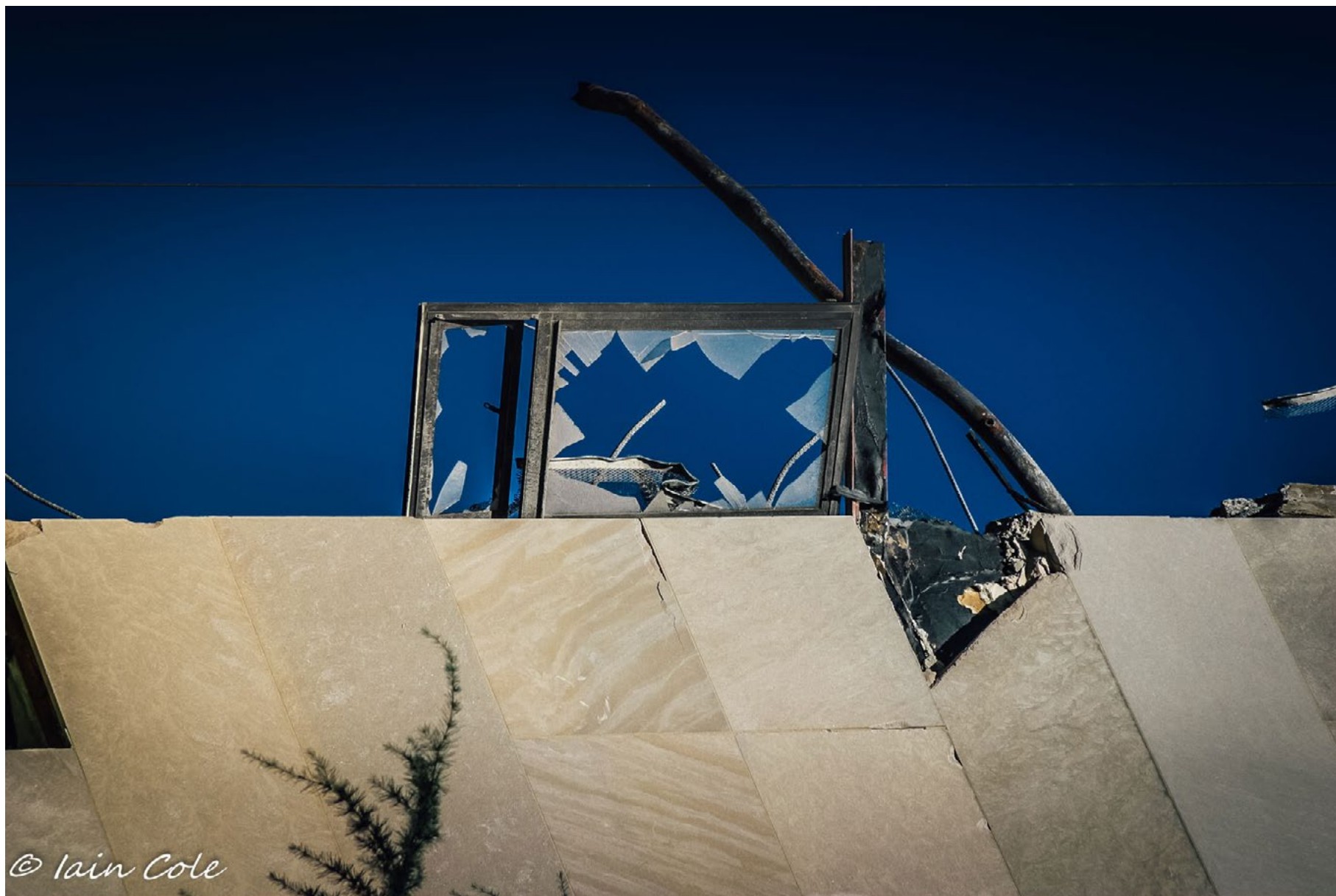
Axed. Demolition of a research building. Washington 2003 Iain Cole