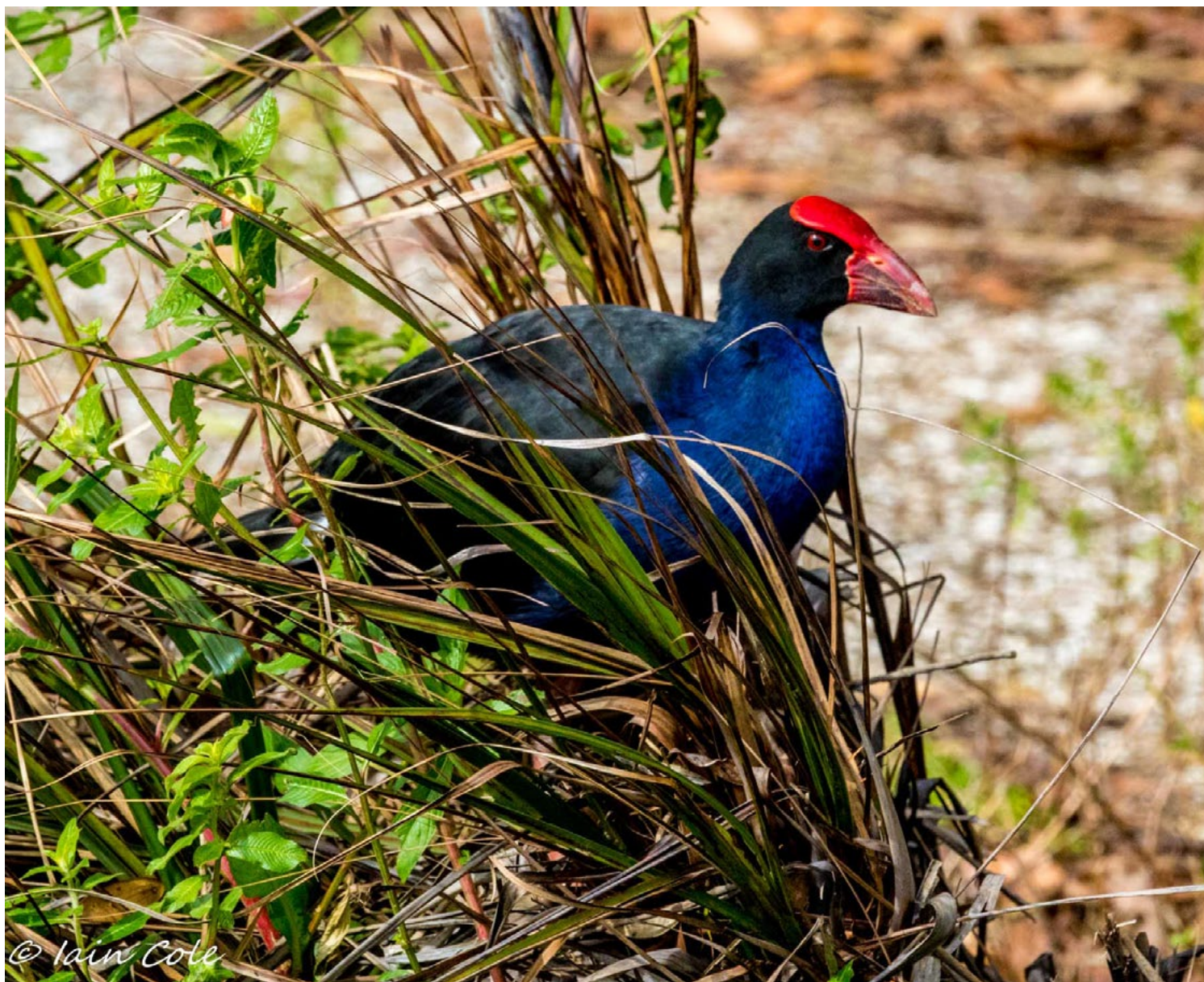
On my mother's side, I am a Velociraptor. Purple Swamp Hen at Ningi Waters Iain Cole