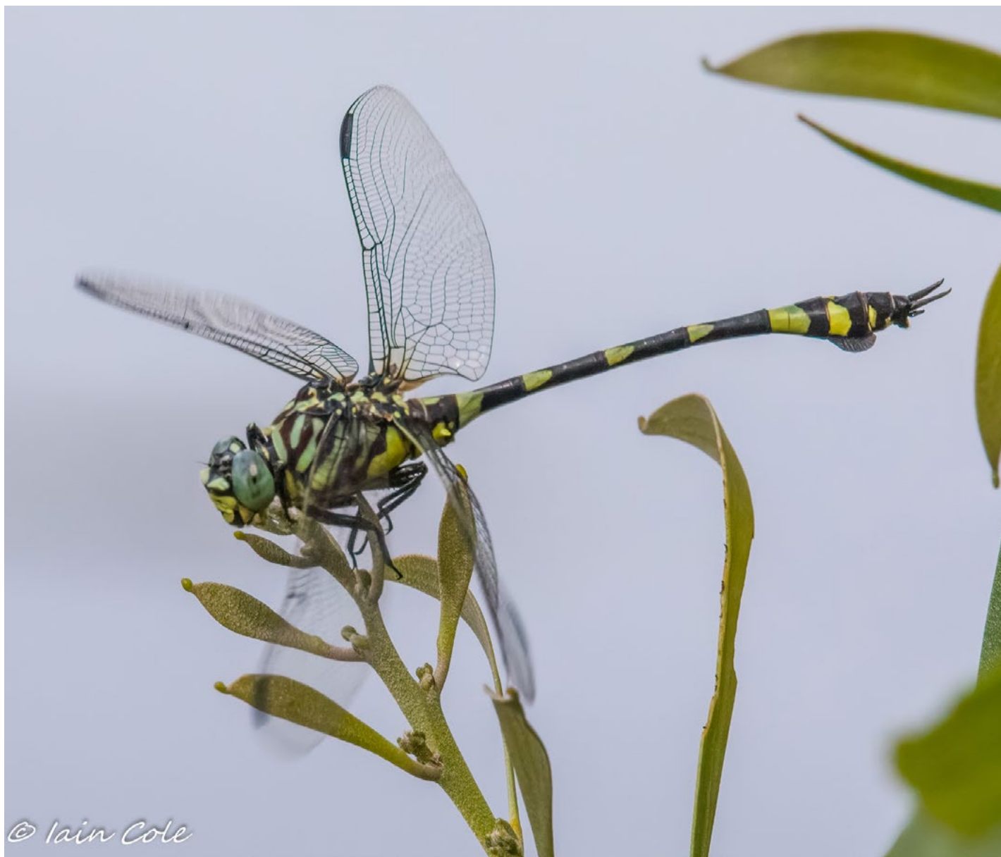
Dragonfly landing at Ningi Waters Iain Cole