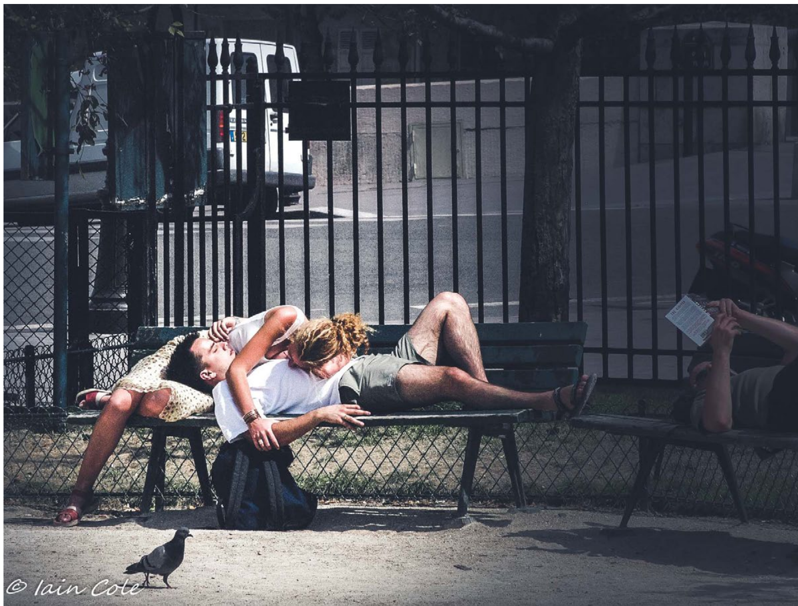
. Tourism and Tiredness. Paris 2003 Iain Cole