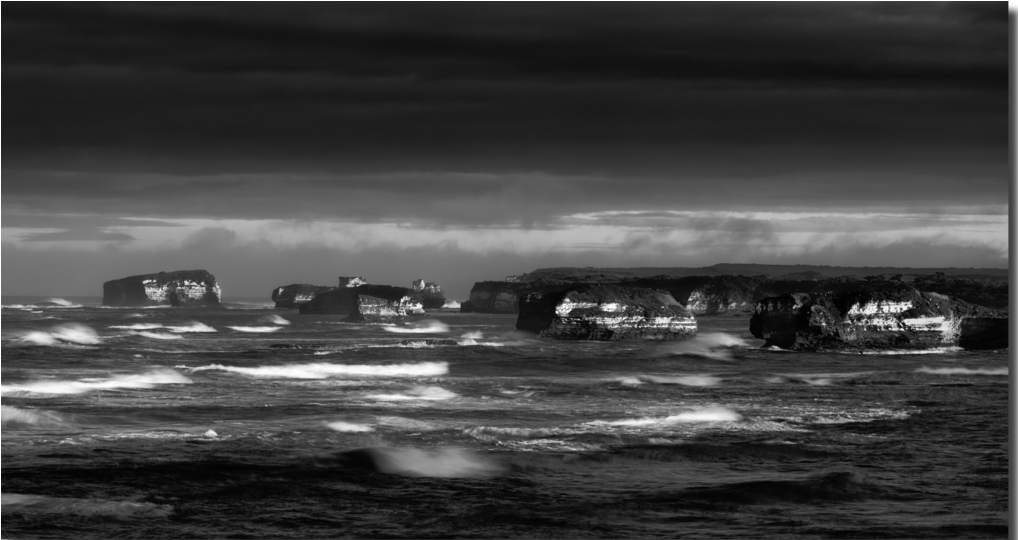
The Bay of Matyrs, Victoria