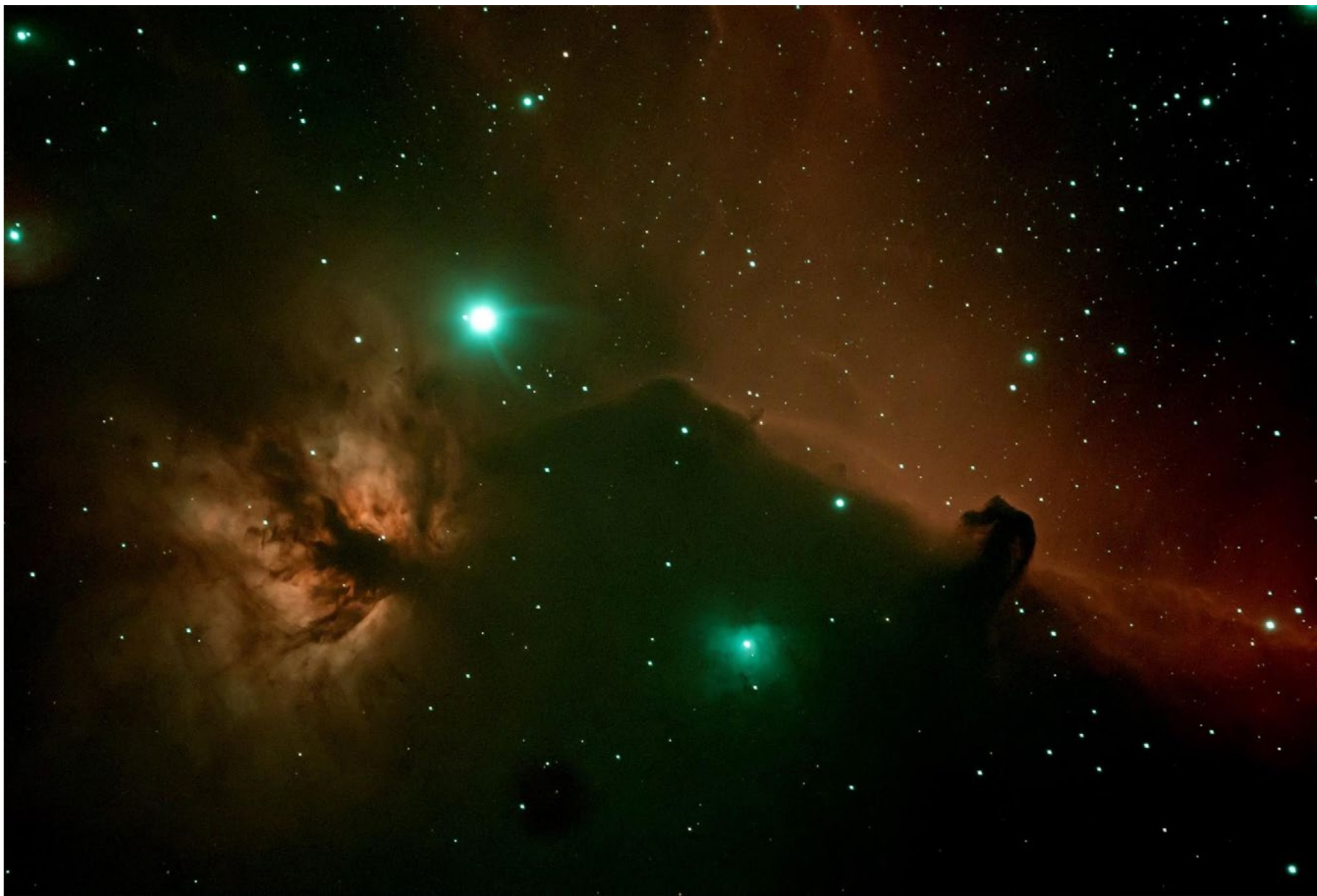
Astro photography , taken from my garden Rose Schmedding