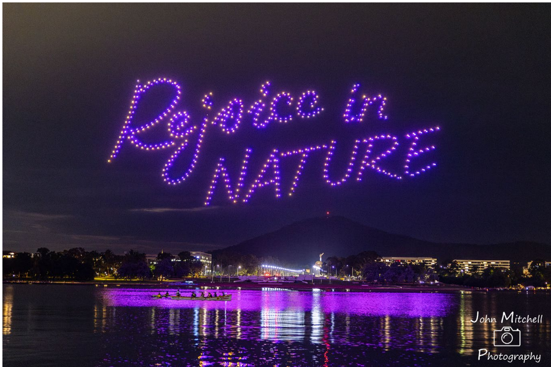
Drone light show