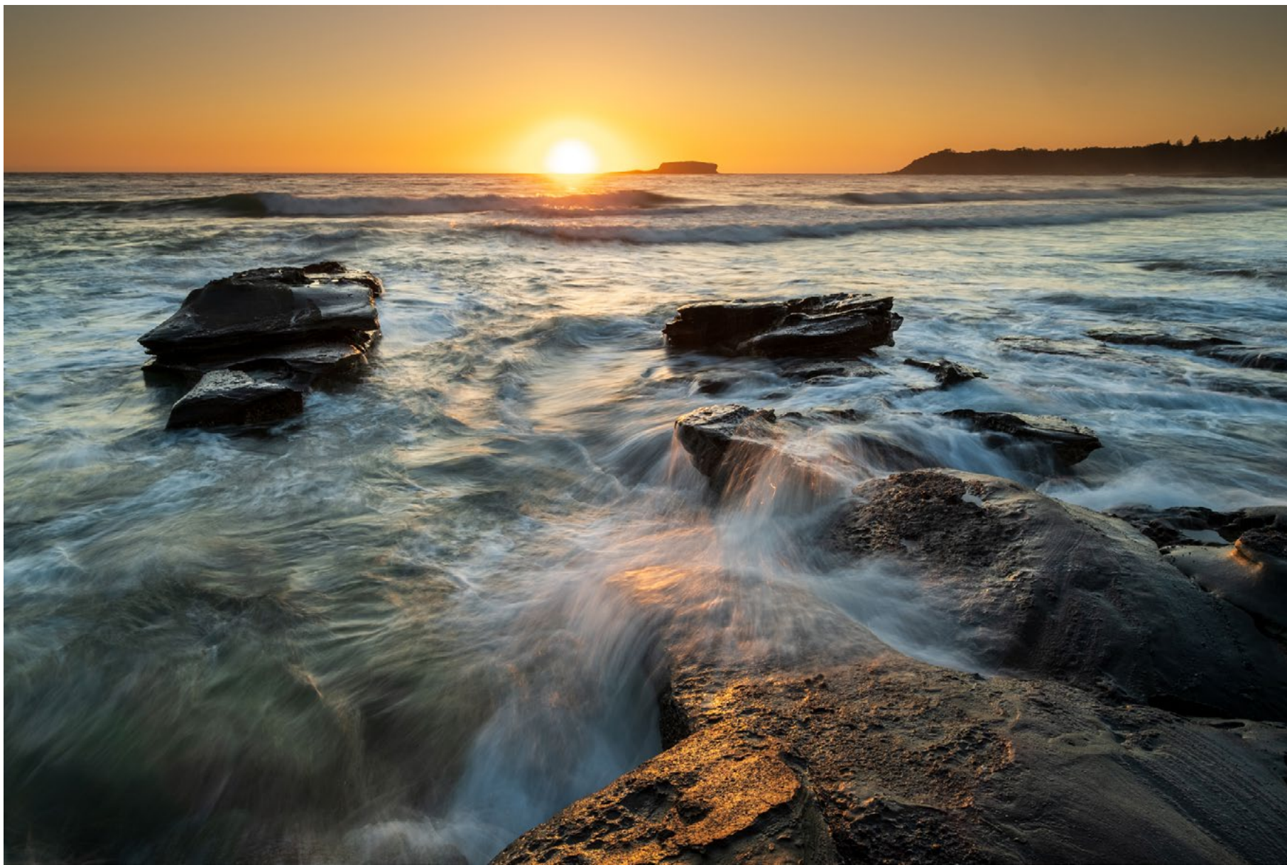
Wave splashes at sunrise, South Durras Rod Burgess