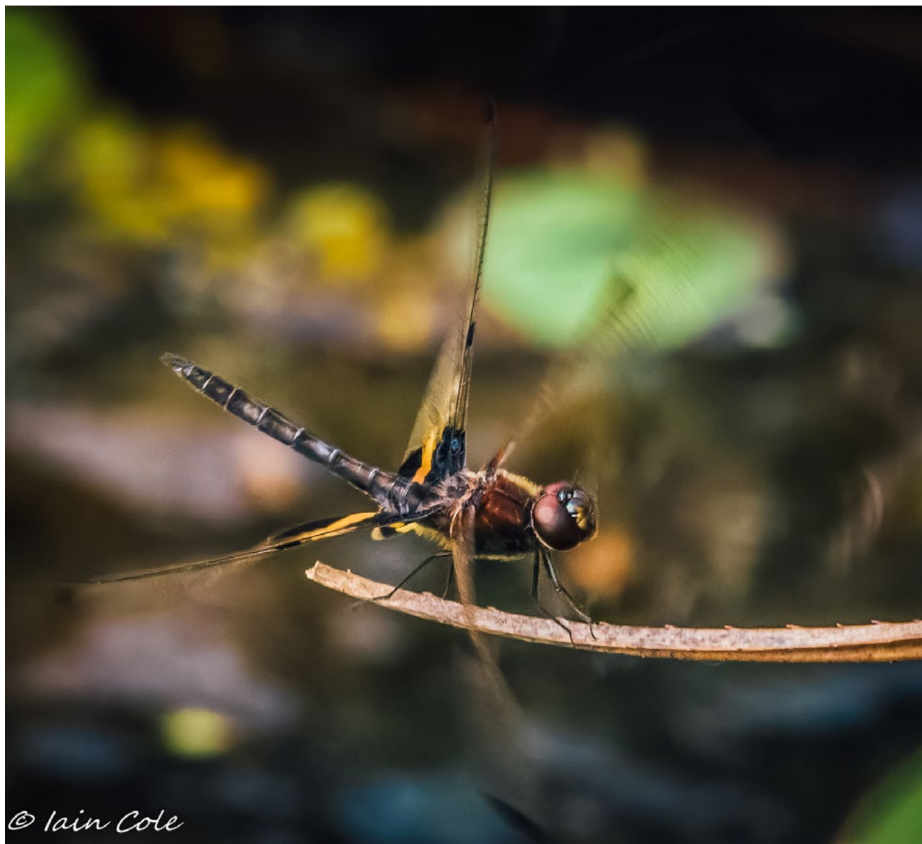
Dragonfly landing at Ningi Waters Iain Cole