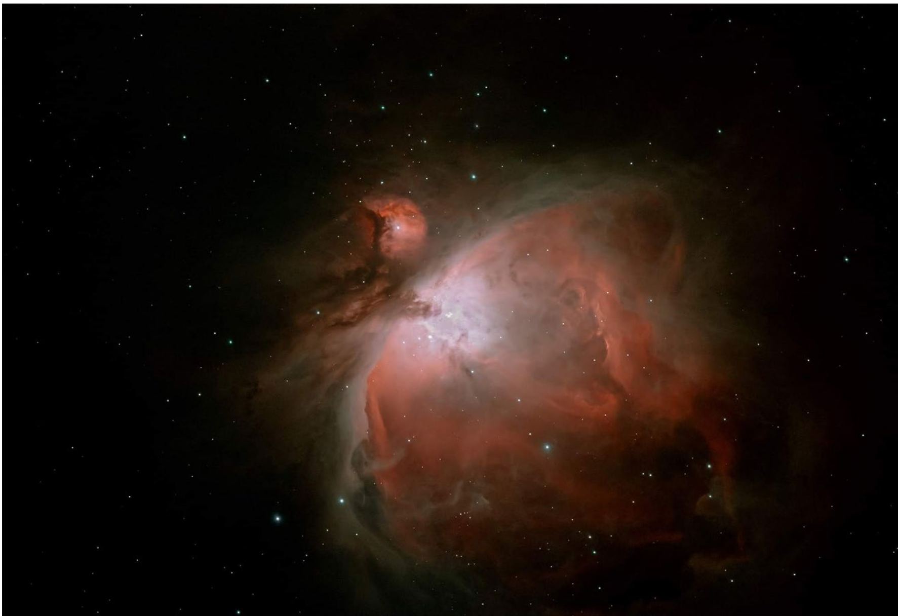
Astro photography , taken from my garden Rose Schmedding