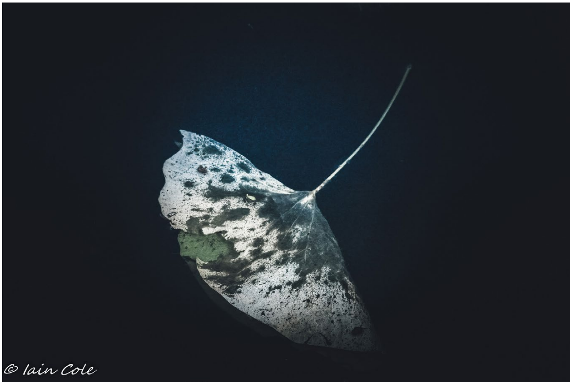
NoNoise - Drifting. - Waterlily pad drifting on Ningi Waters Iain Cole