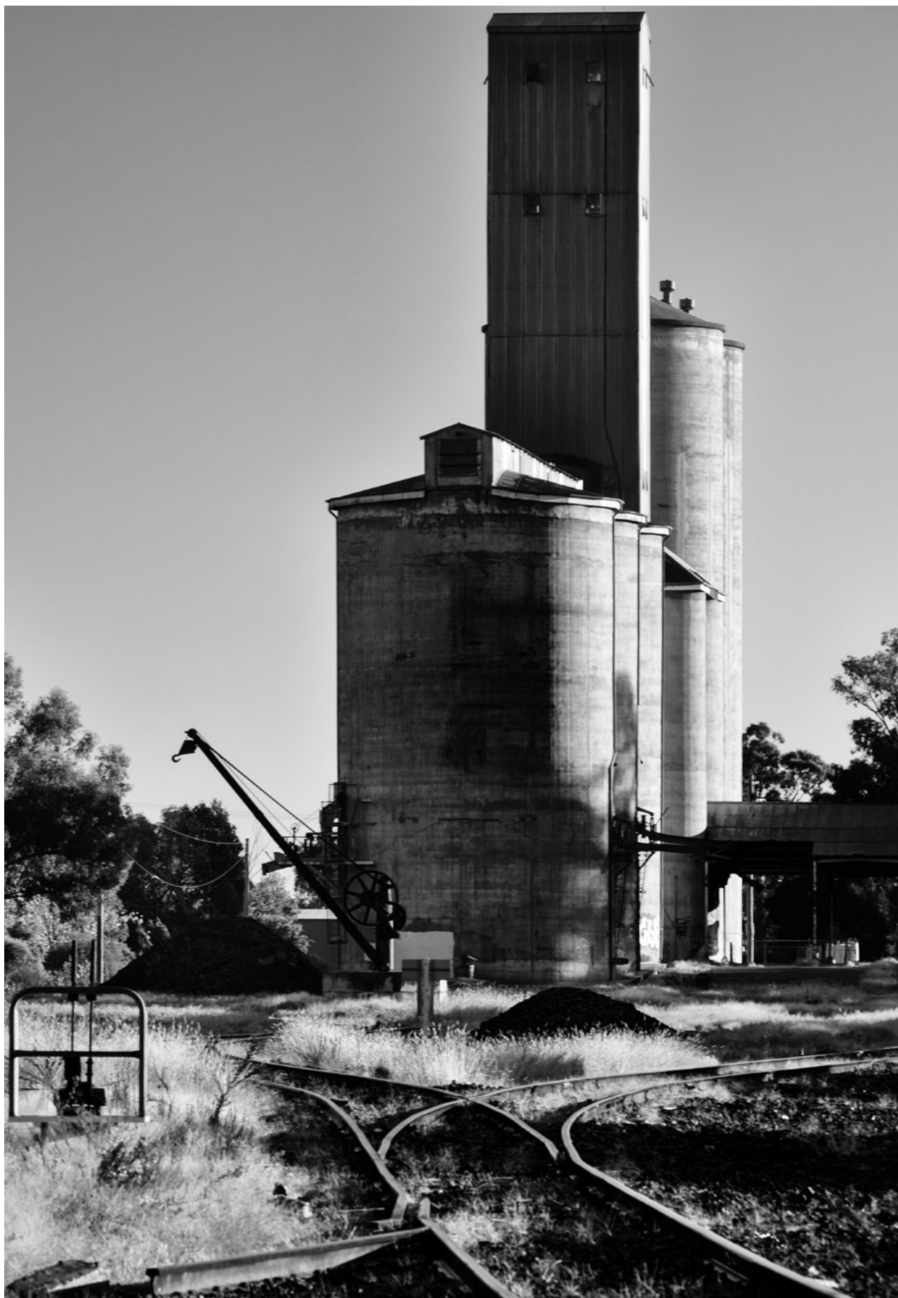
Working Silo, Culcairn