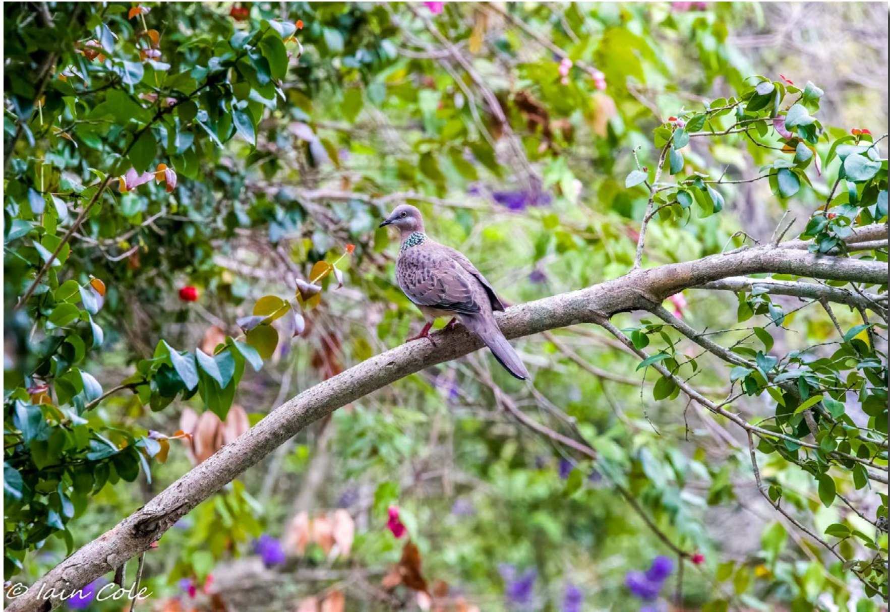
Spotted Dove at Ningi Waters Iain Cole