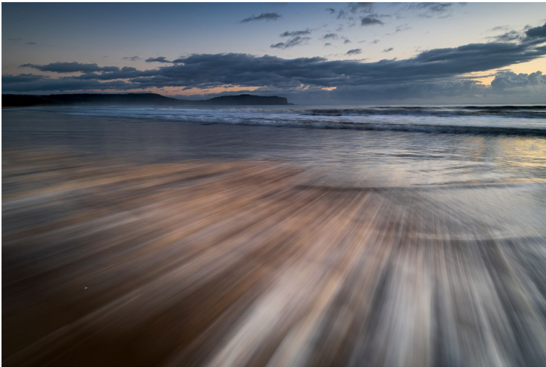
Foamy beach streaks, South Durras Rod Burgess