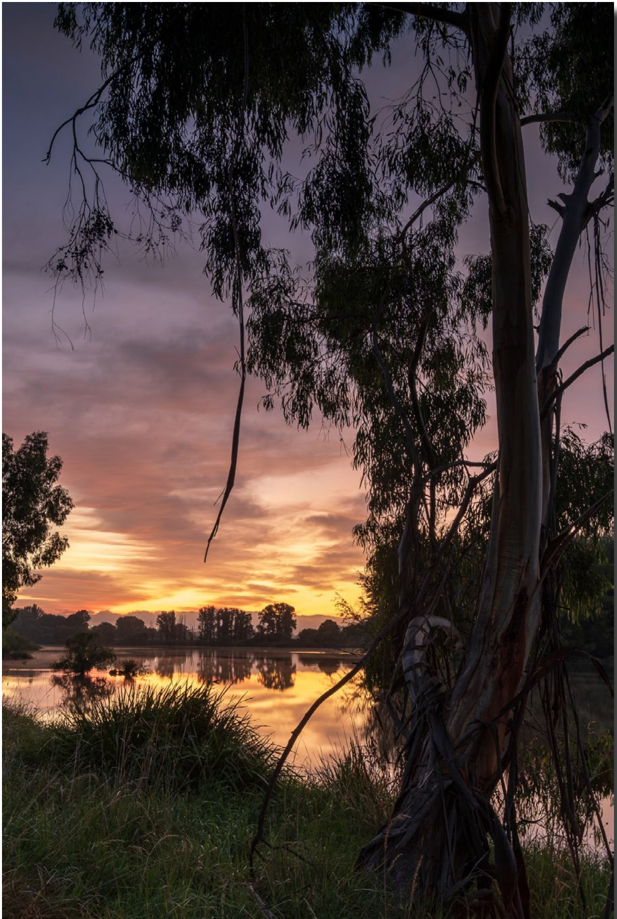
Eucalypt at Dawn, Molong; o Reach Rod Burgess