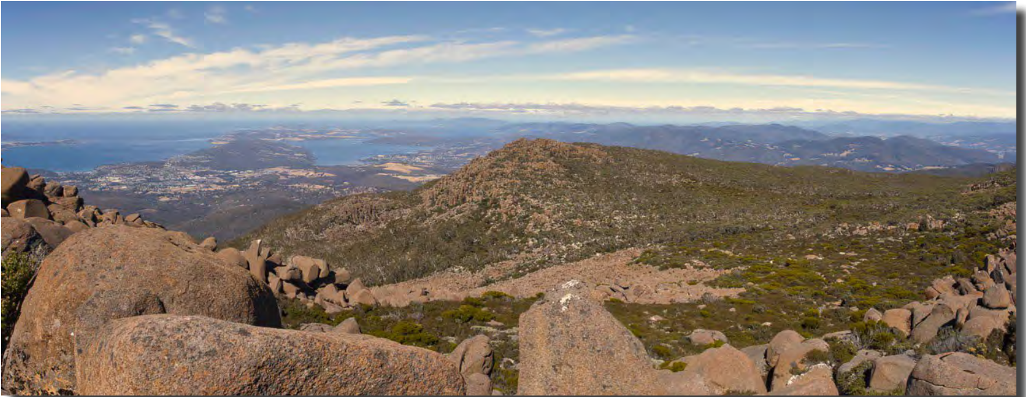
Tasmania Laurie Westcott