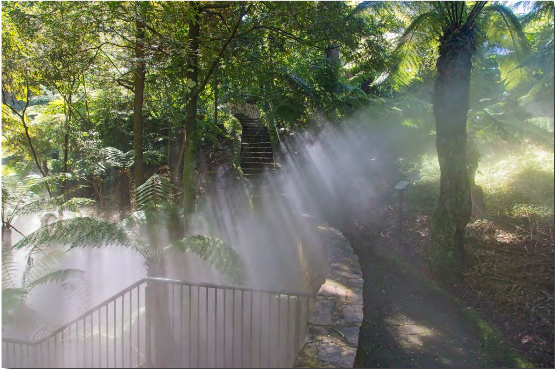
The Terminator Line. ANBG Iain Cole