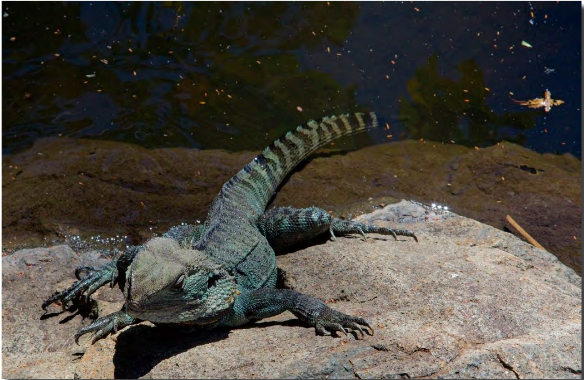
Who you lookin' at? ANBG Iain Cole