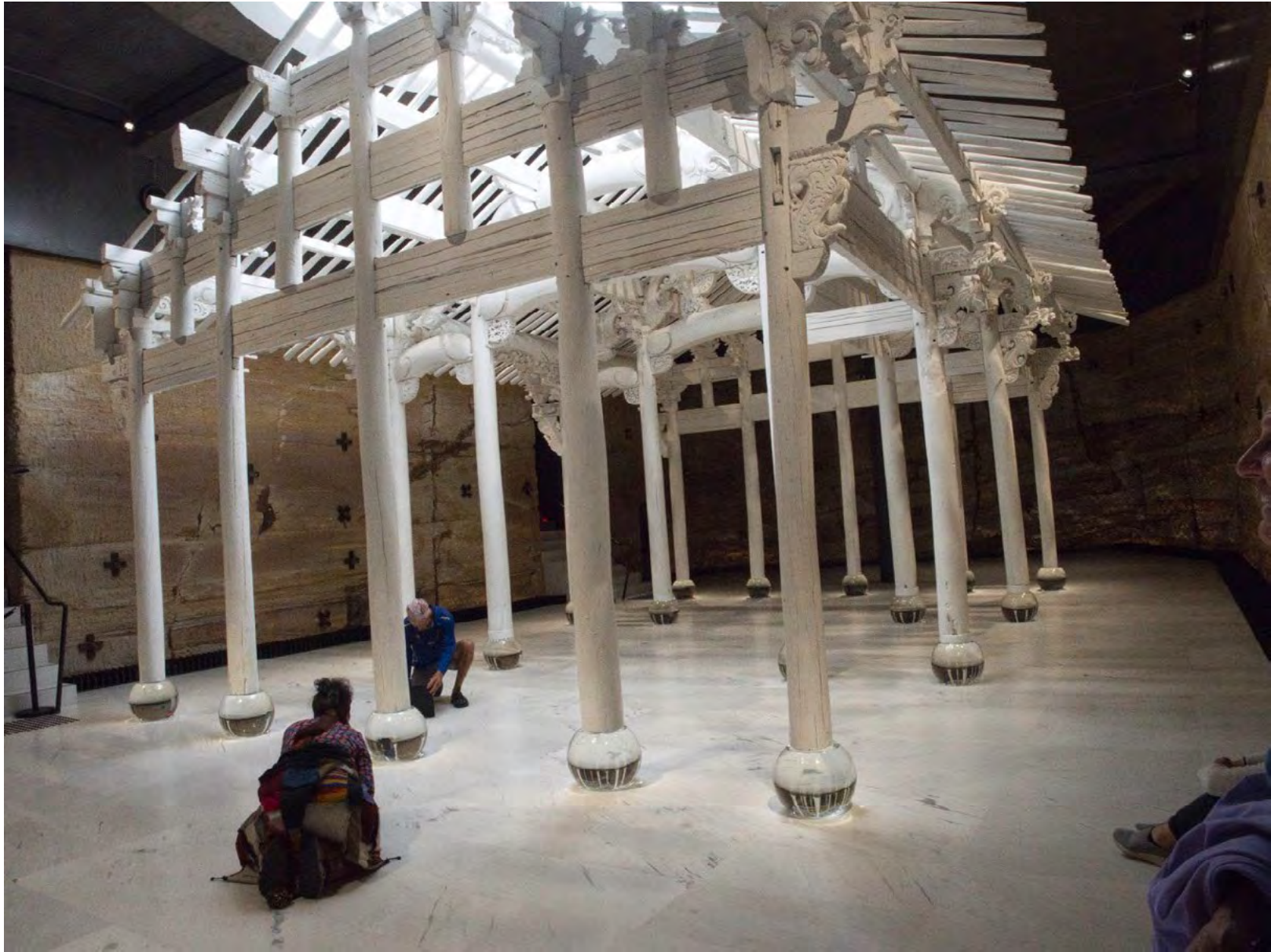
Tasmania Laurie Westcott