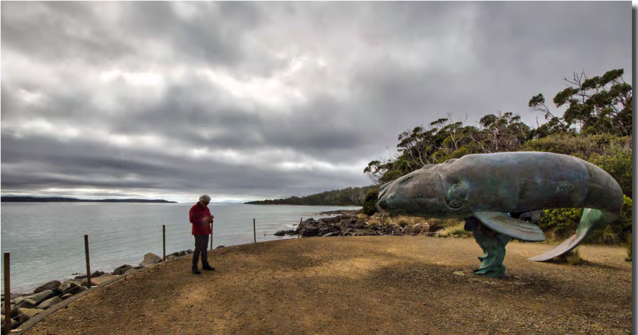
Tasmania Laurie Westcott