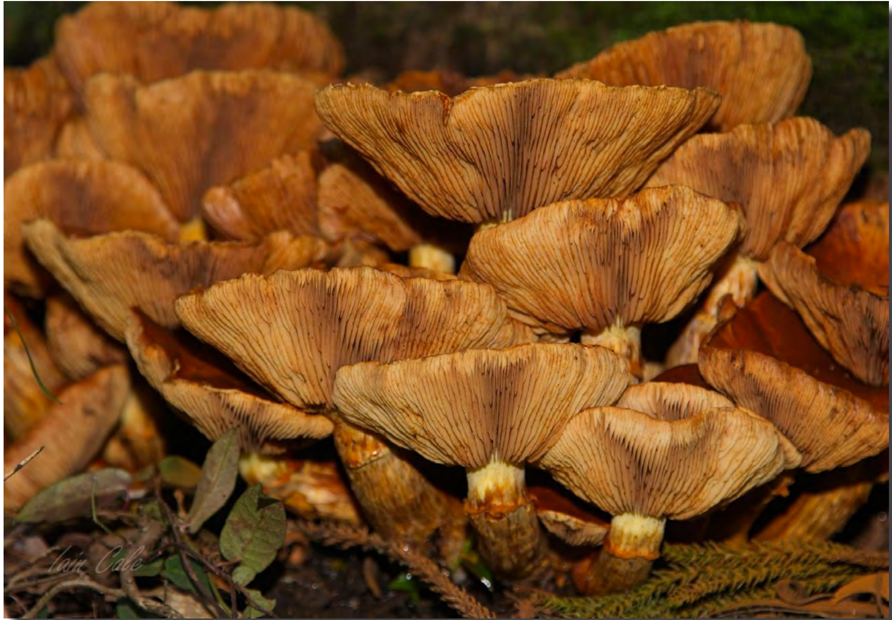
It's a party. Fungi at ANBG Iain Cole