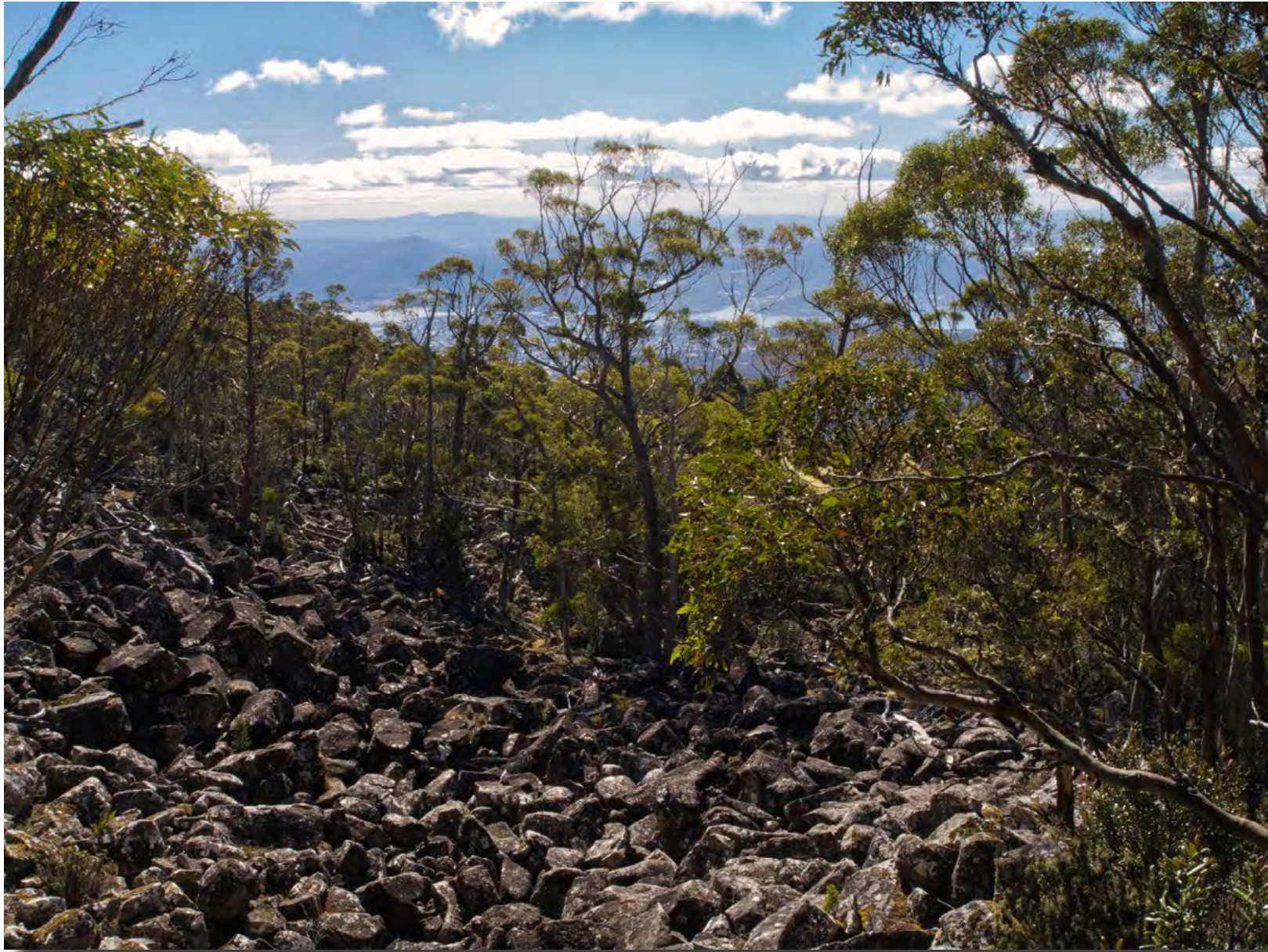
Tasmania Laurie Westcott