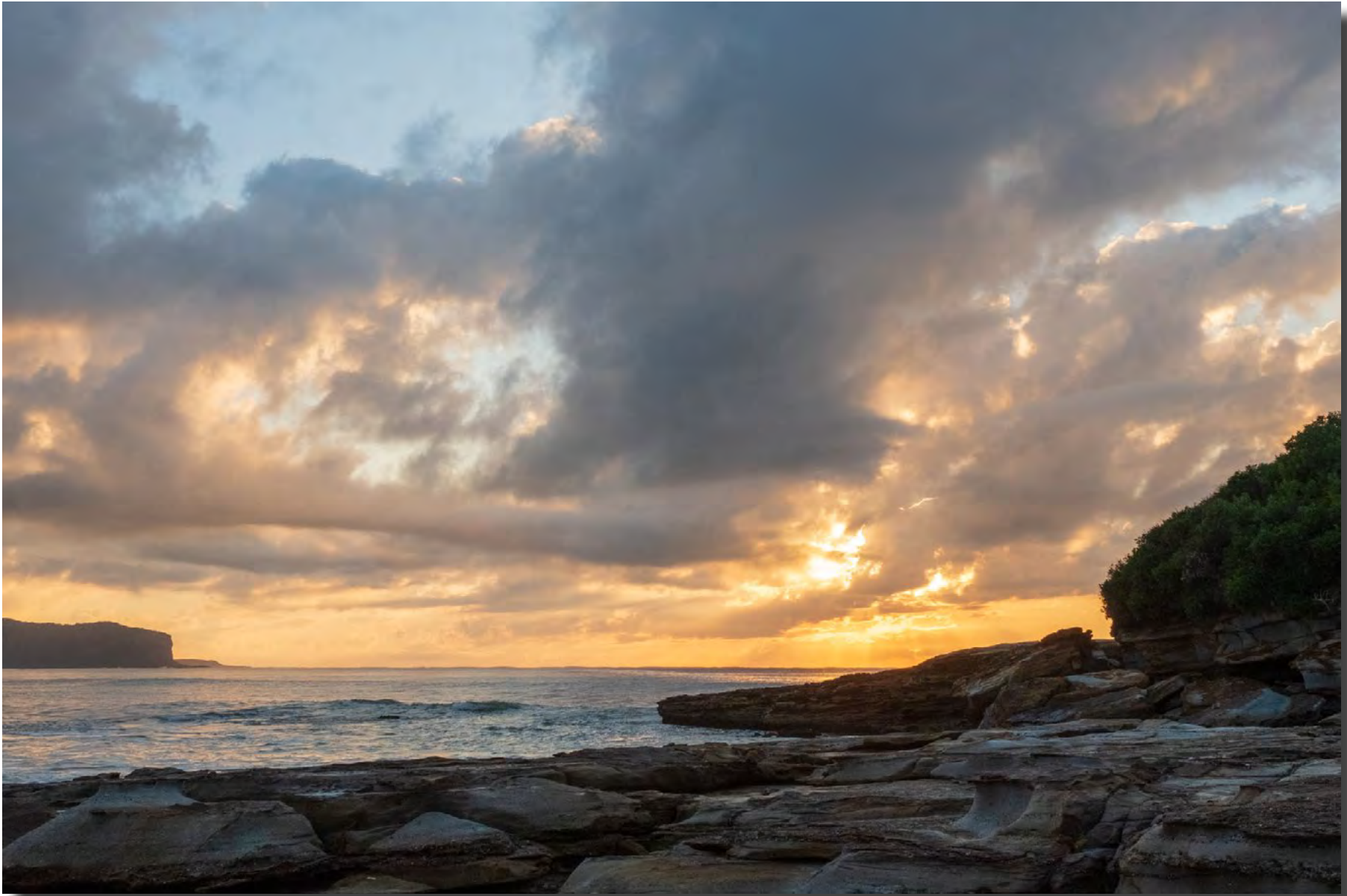
Big cloud morning, Durras Rod Burgess