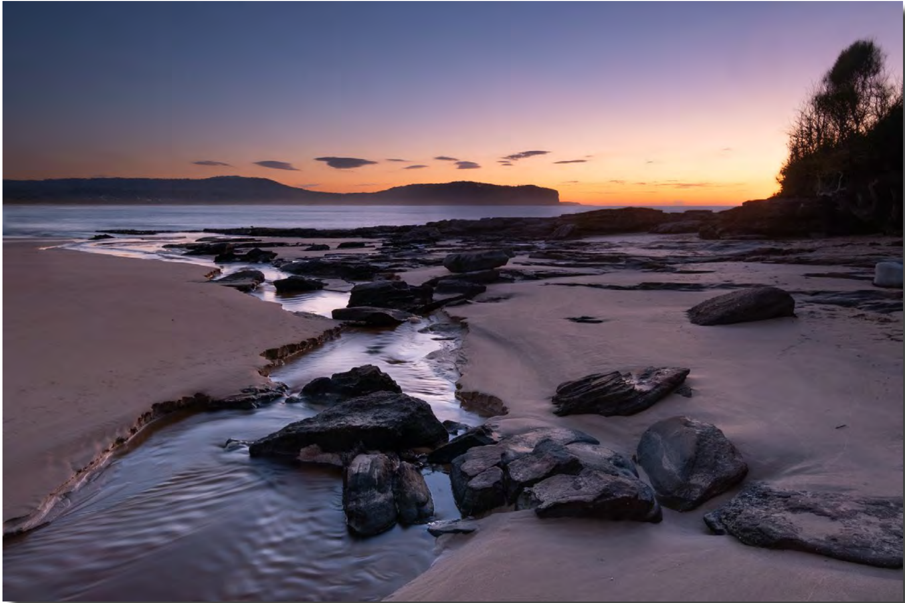
Durras Creek flows again! Rod Burgess