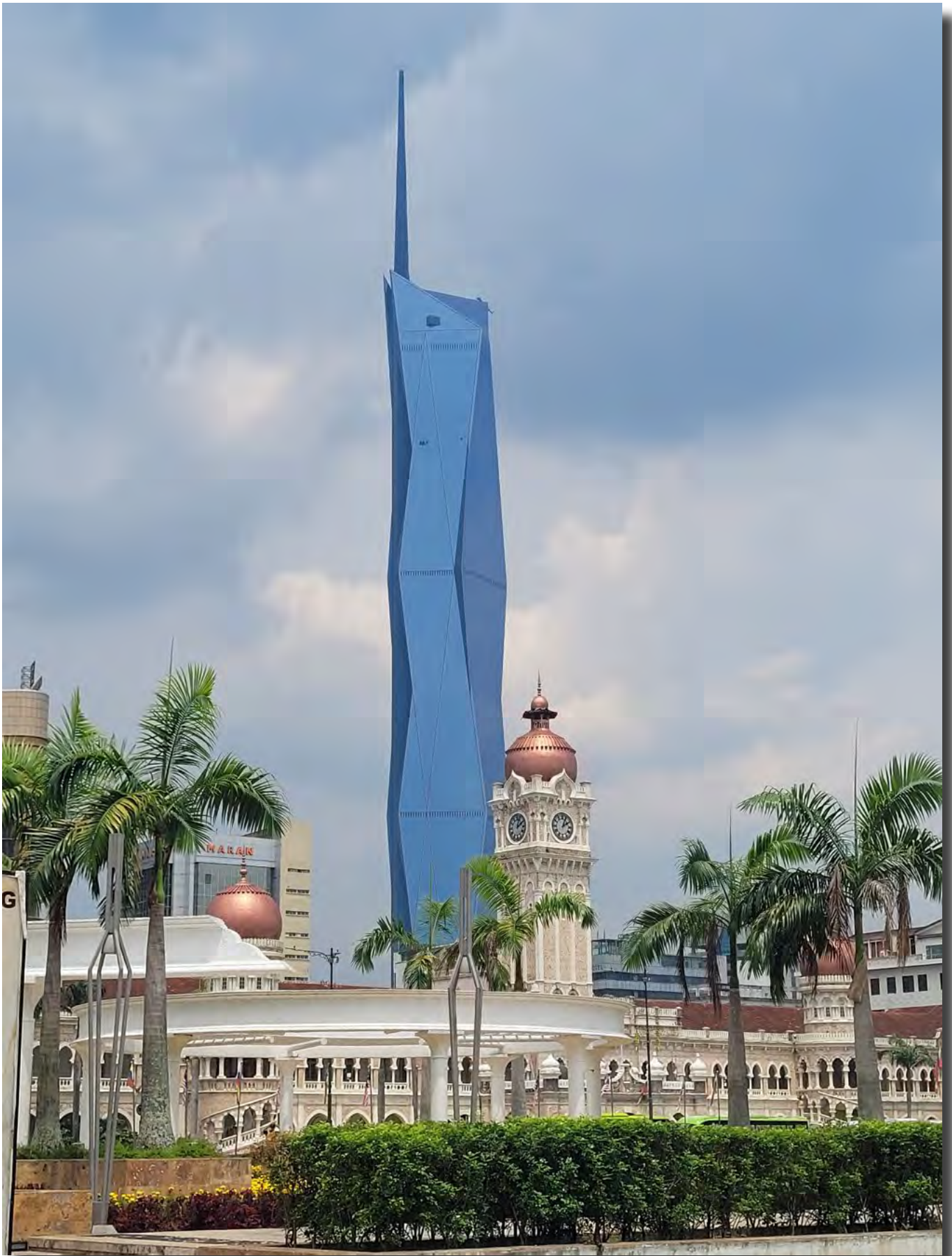
Merdeka 118 with Kuala Lumpur High Court in foreground Bill Blair