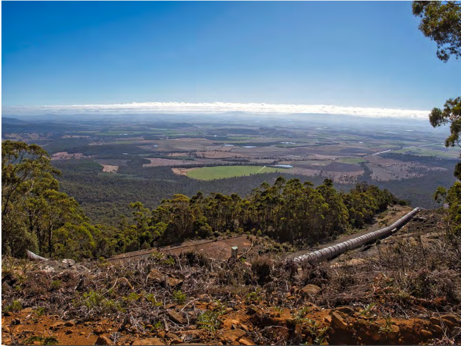
Tasmania Laurie Westcott