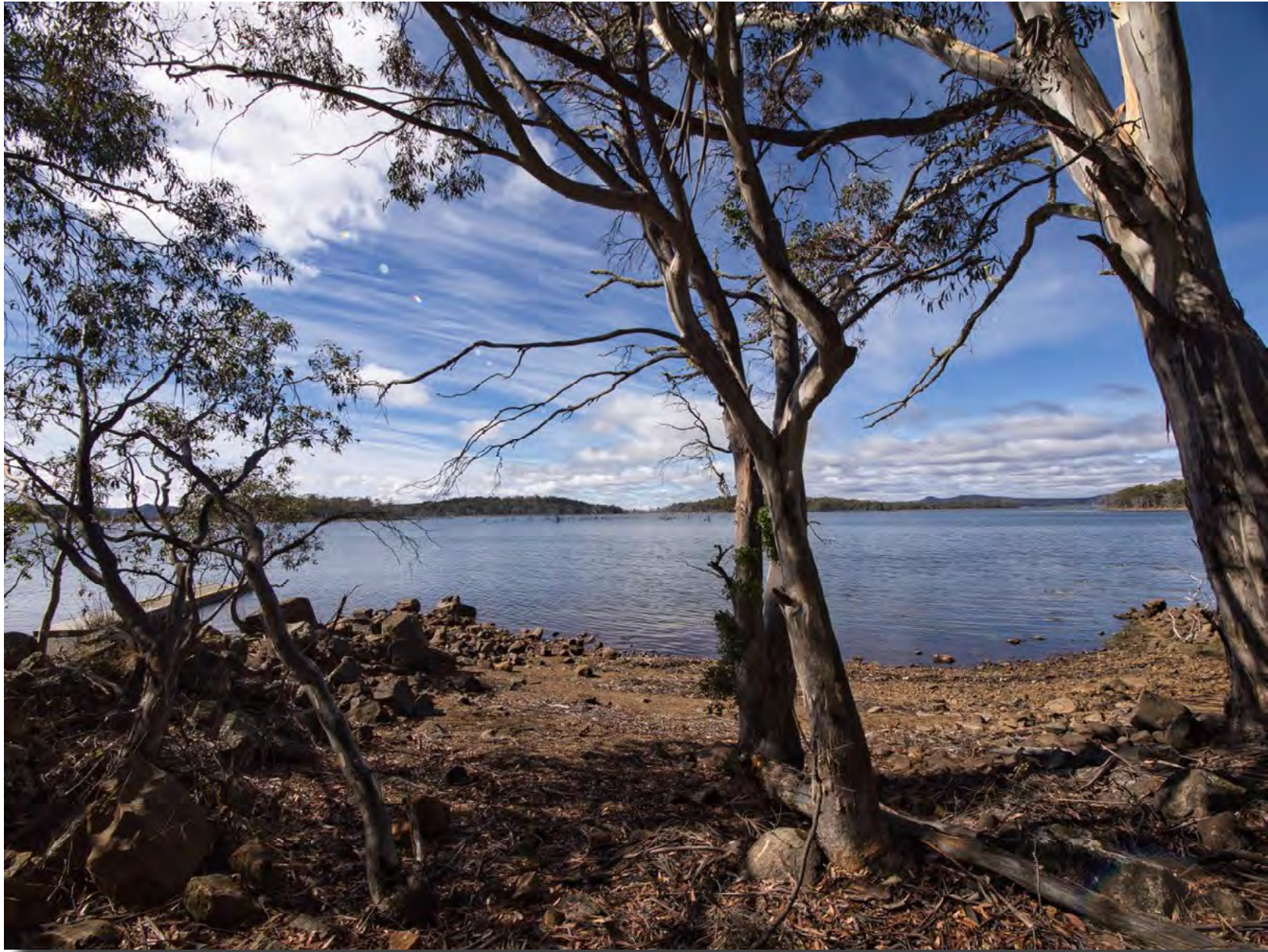
Tasmania Laurie Westcott