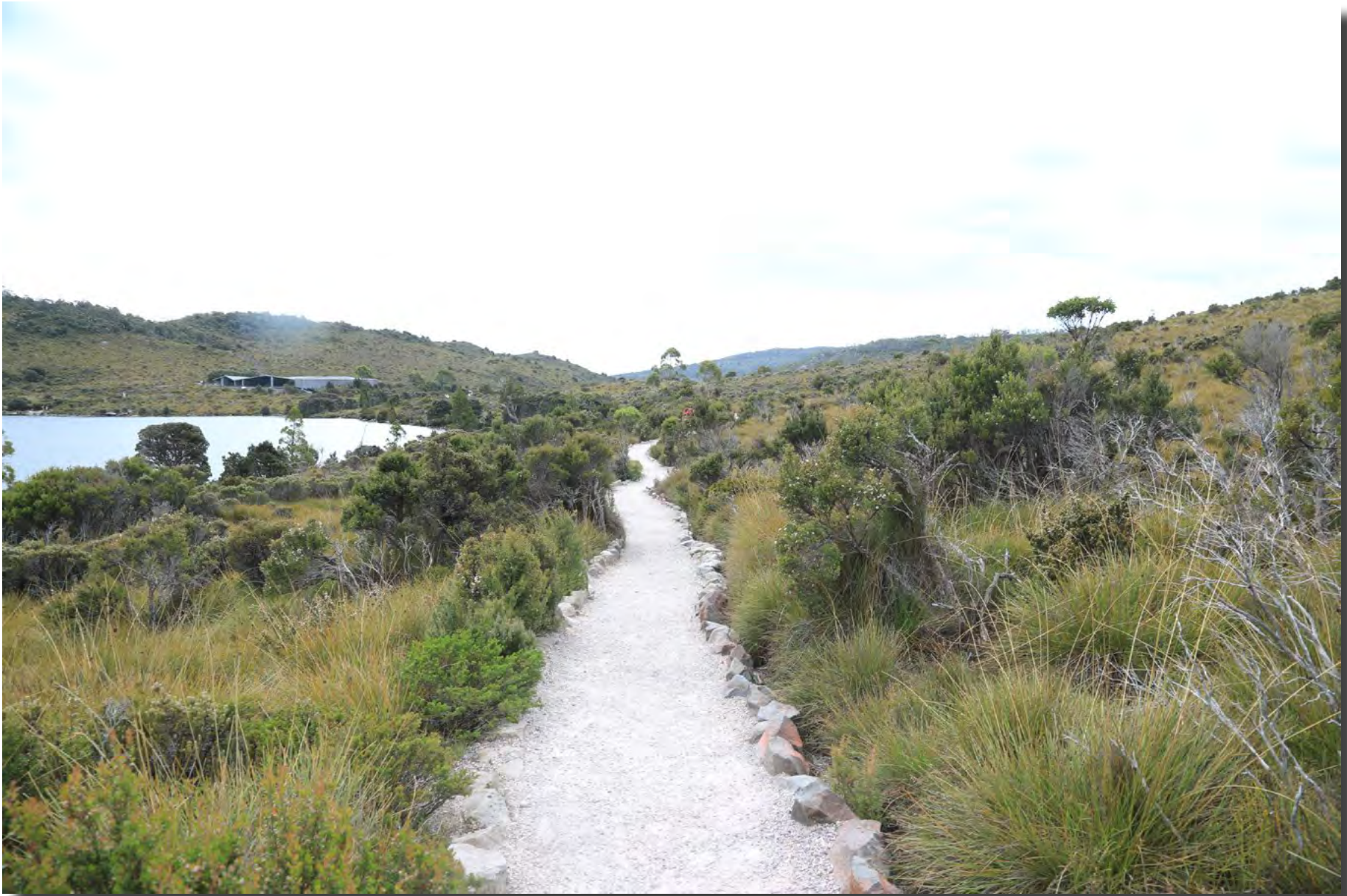
Dove Lake, Cradle Mountain National Park