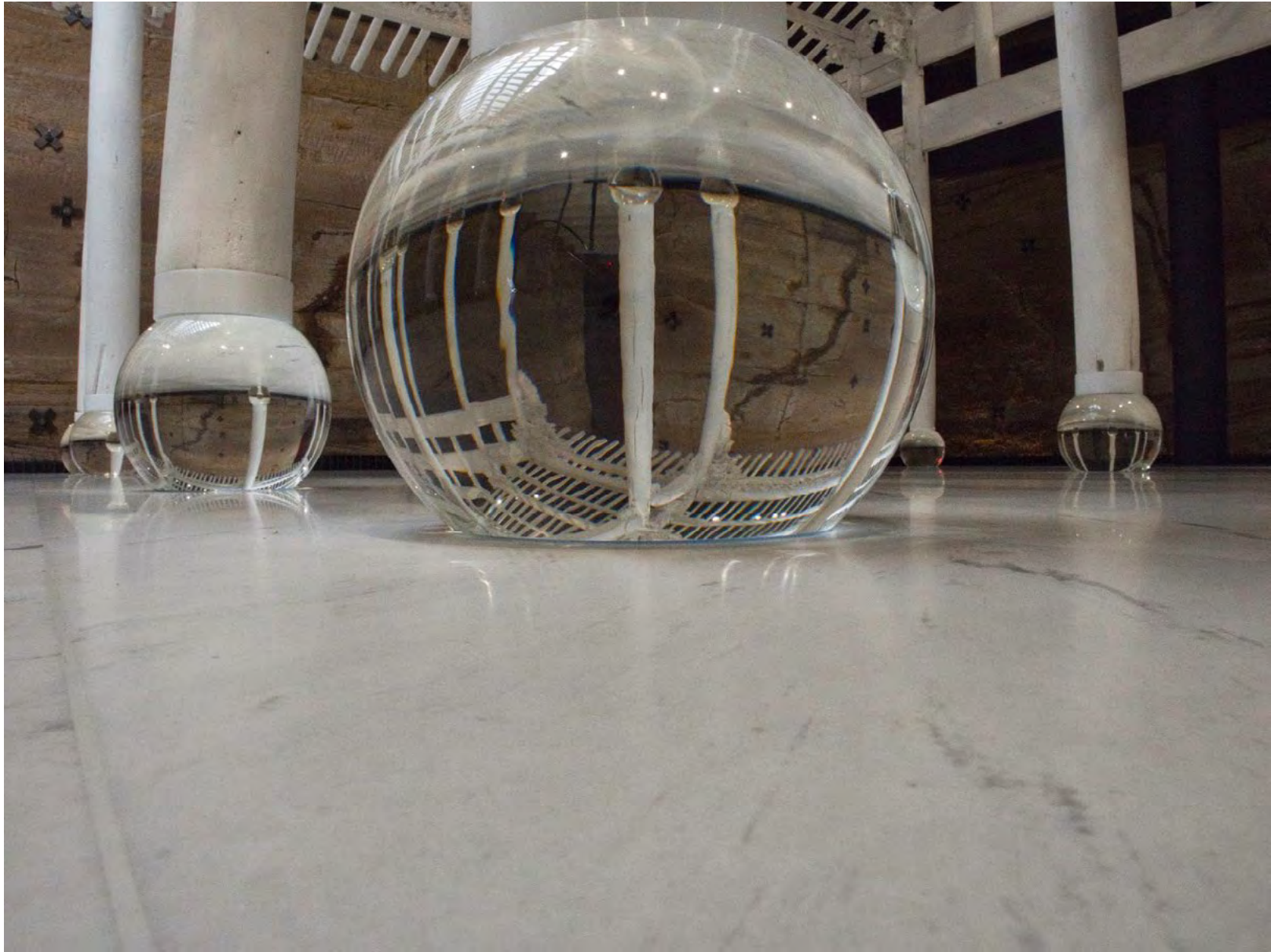
Tasmania Laurie Westcott