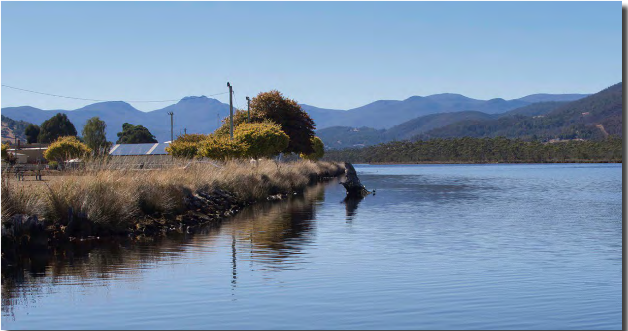
Tasmania Laurie Westcott