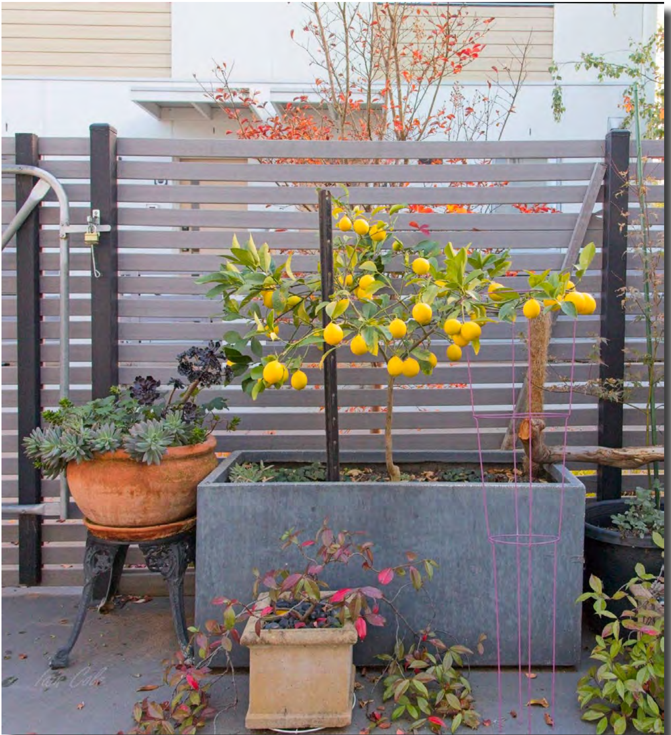
Backyard garden Iain Cole