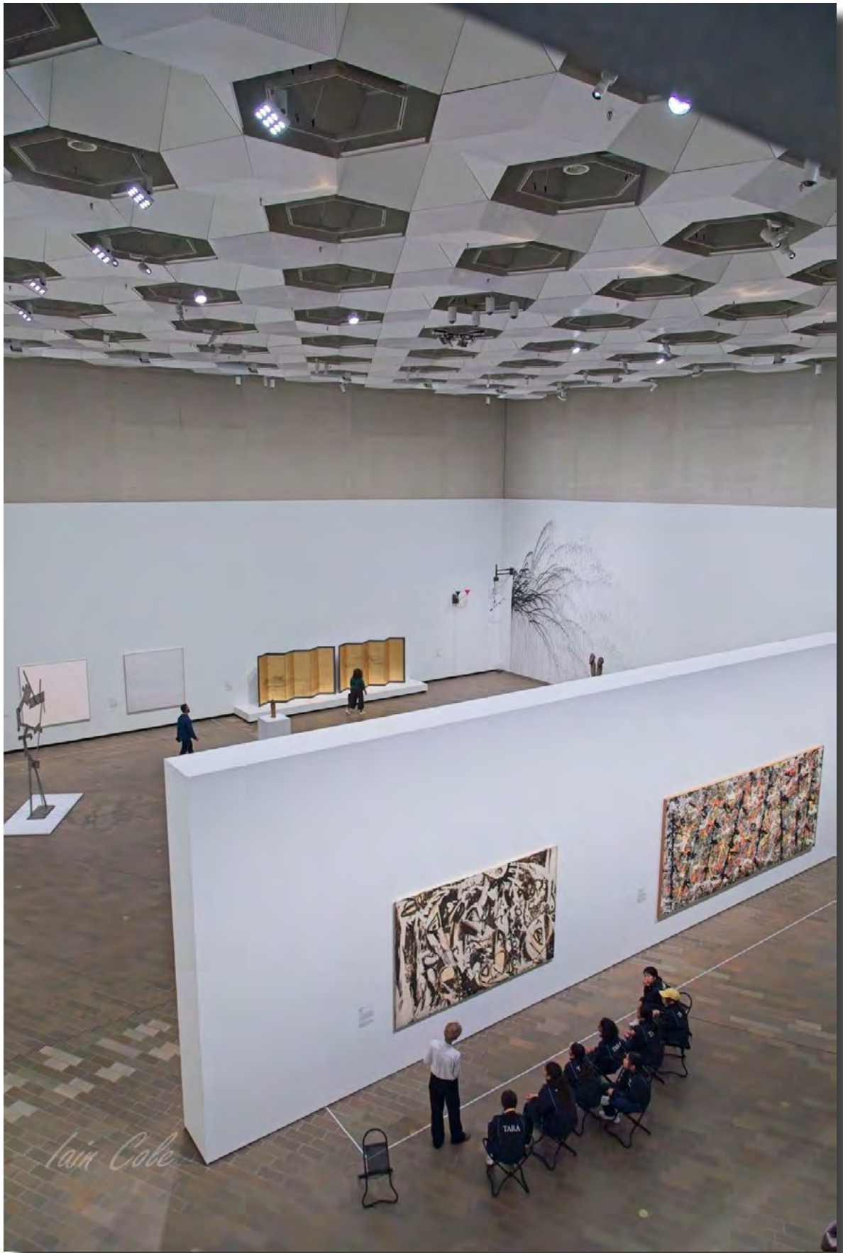
Art Appreciation. ANG art class for students Iain Cole