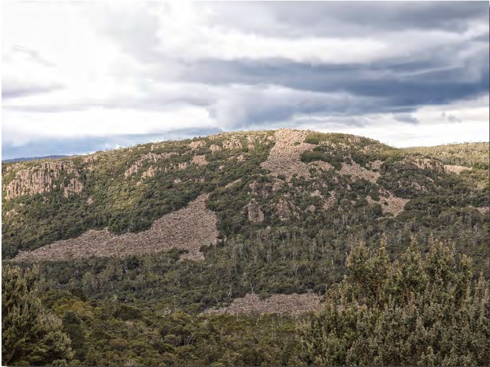
Tasmania Laurie Westcott