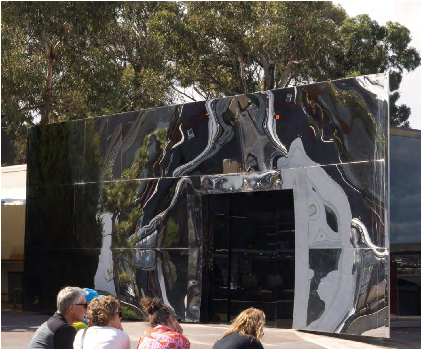
Tasmania Laurie Westcott