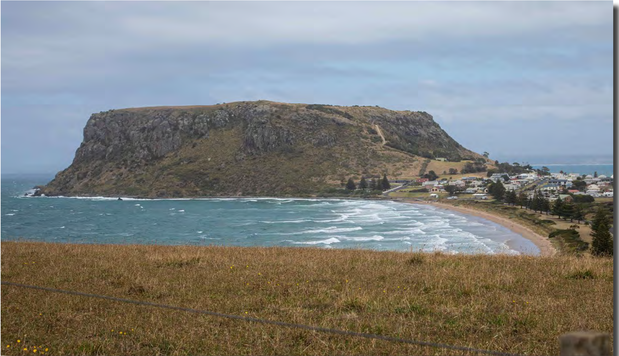
The Butt, Stanley Tasmania, as seen from Highfields