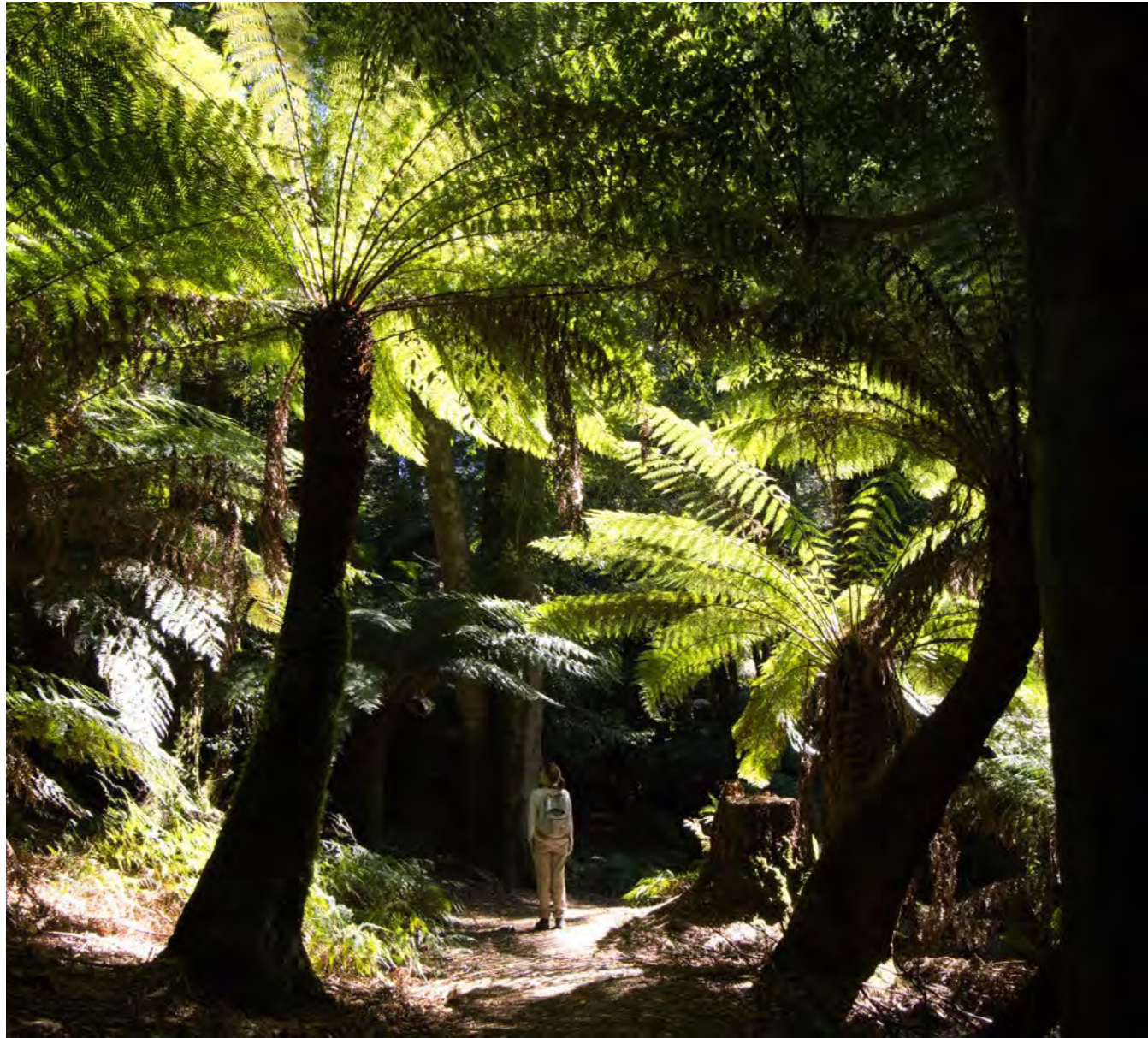
Tasmania Laurie Westcott