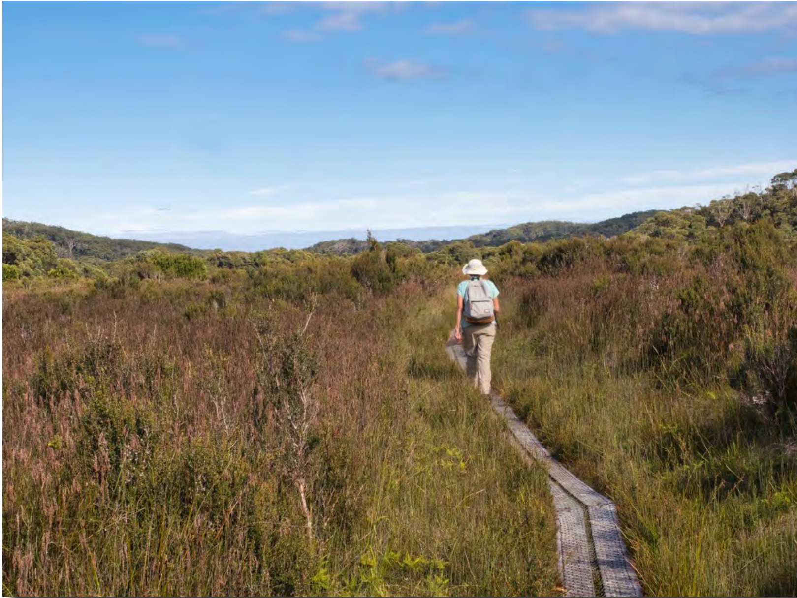
Tasmania Laurie Westcott