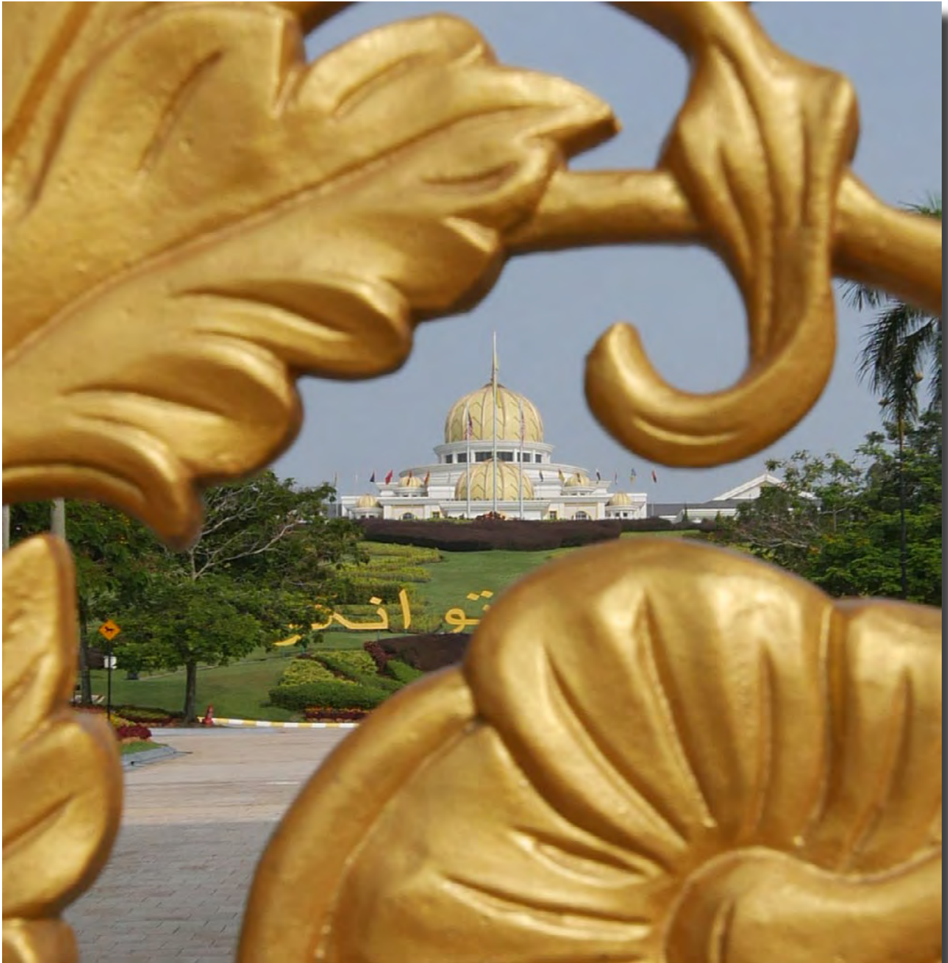
Royal Palace Kuala Lumpur Bill Blair