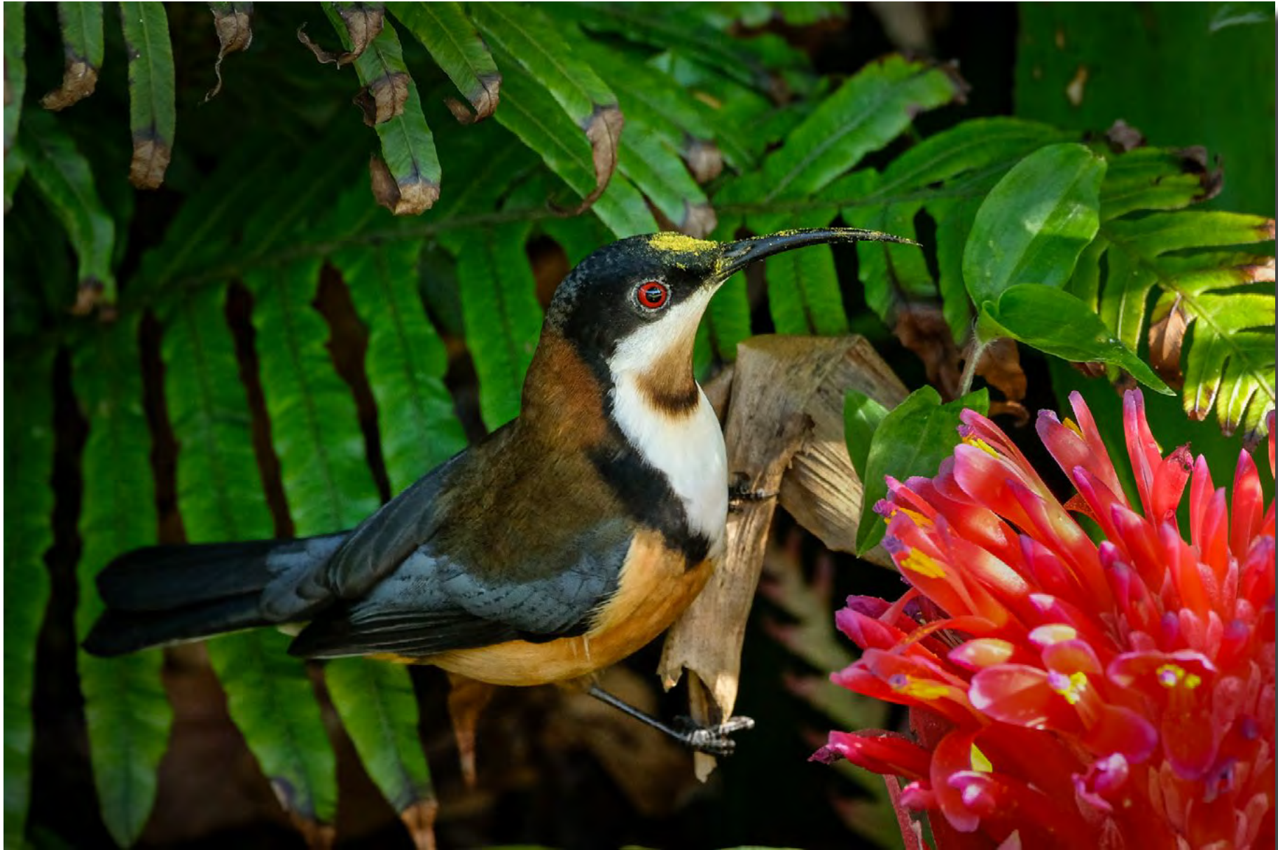
Eastern Spinebill visiting our garden Rod Burgess