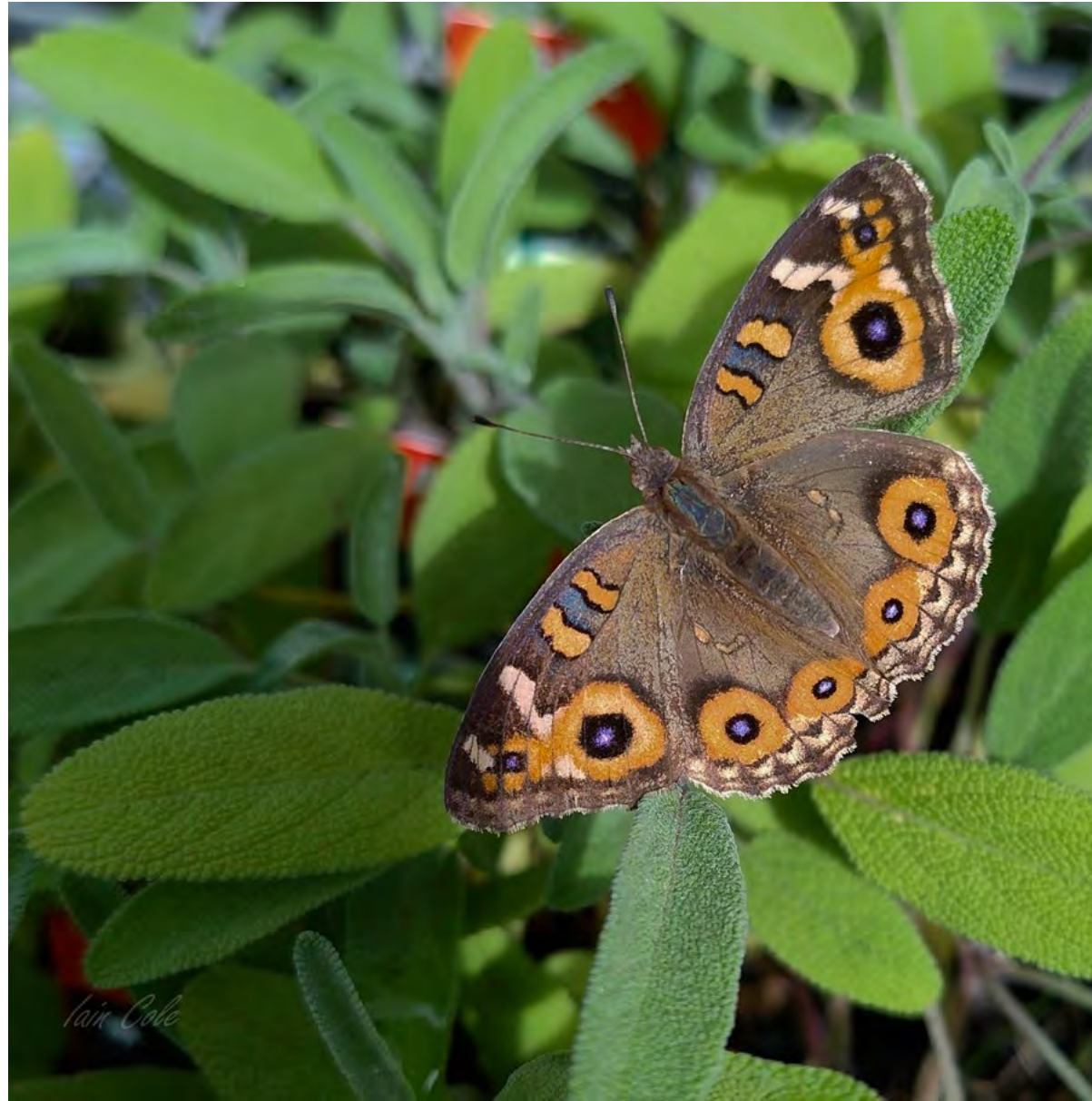
Resting. (Phone photography) Iain Cole