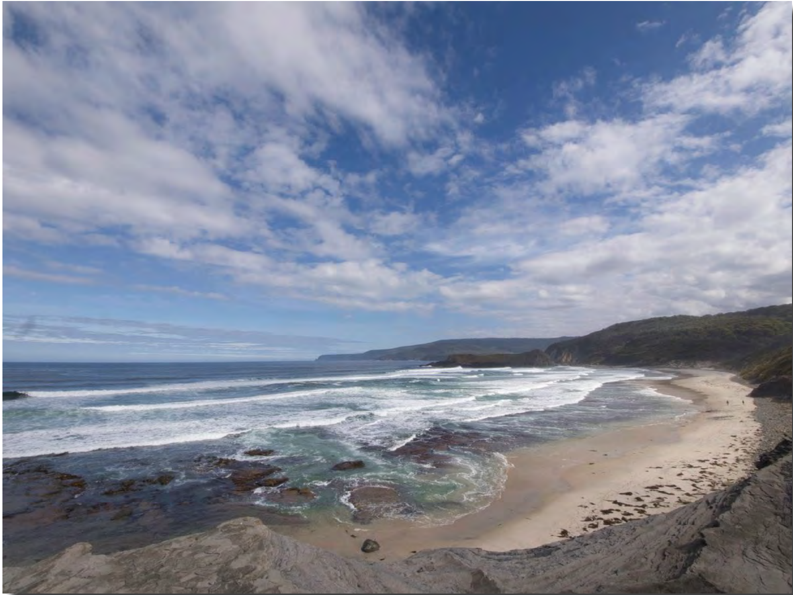
Tasmania Laurie Westcott