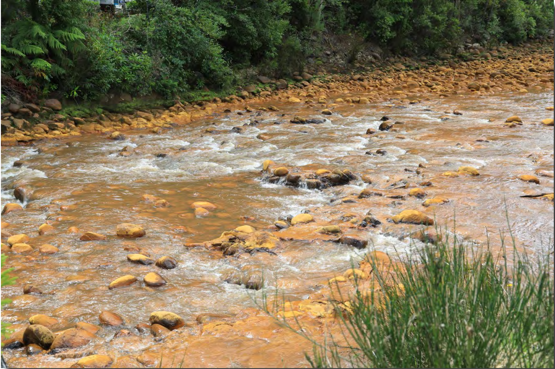
Queen River, Queenstown, Tasmania. The colour is due to high level of pollution caused by mining runoff ,which has led the river to be uninhabitable to life Alison Milton