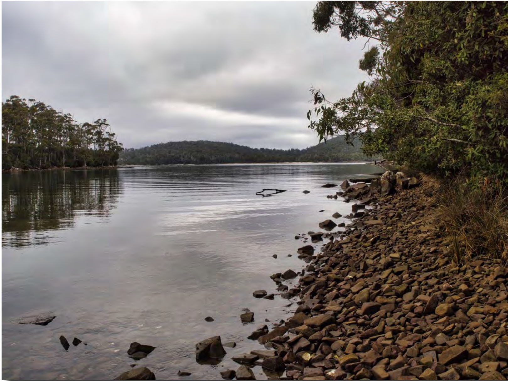
Tasmania Laurie Westcott