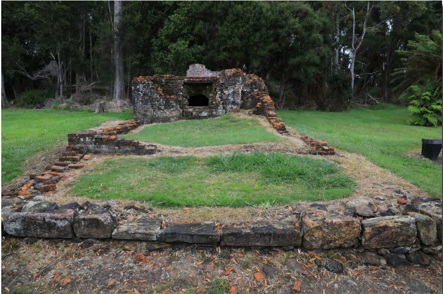
Sarah Island, Gordon River. The setting the book, For the Term of His Natural Life