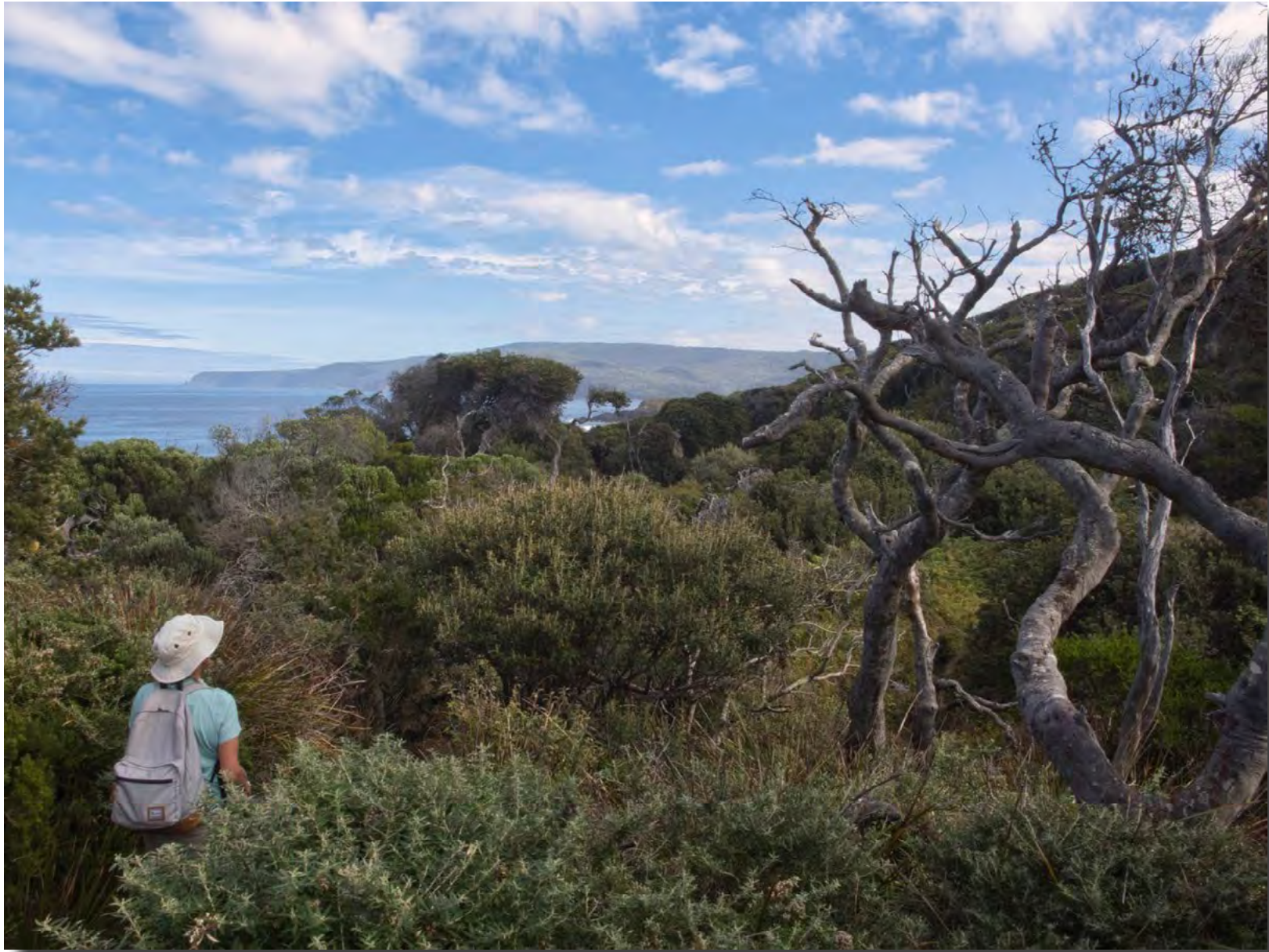
Tasmania Laurie Westcott