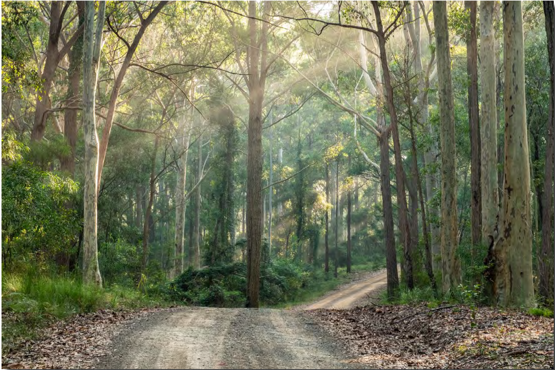
Morning sunbeams, Murramarang National Park Rod Burgess