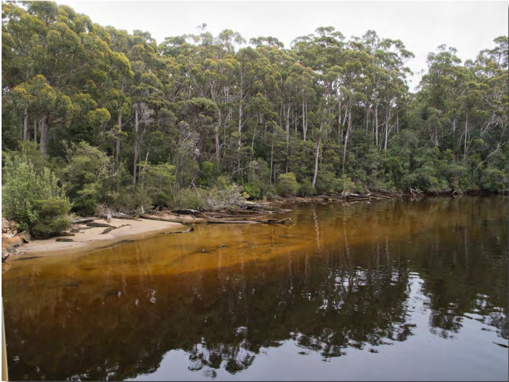
Tasmania Laurie Westcott