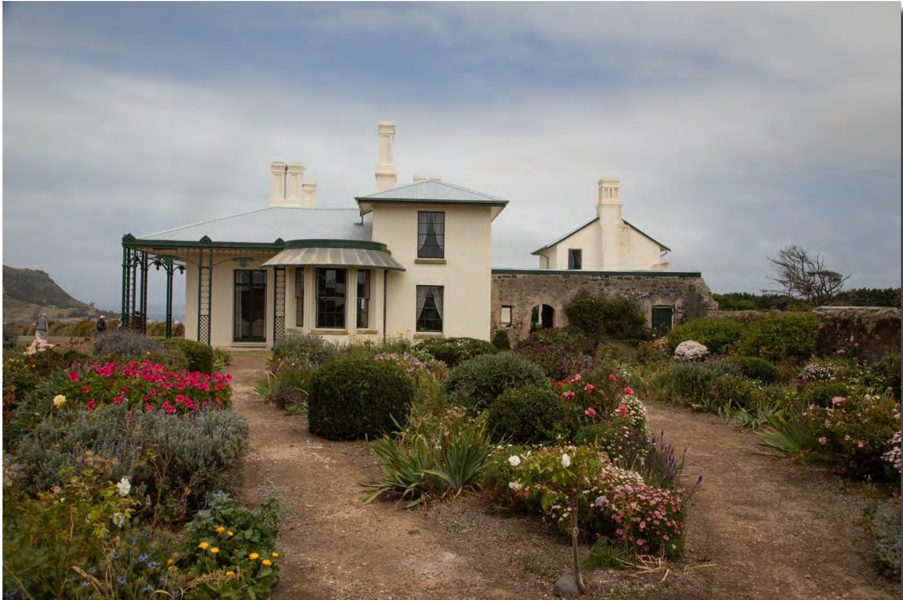
More photos from Tasmania, from my trip in February: Highfields Historic Homestead, Stanley, Tasmania