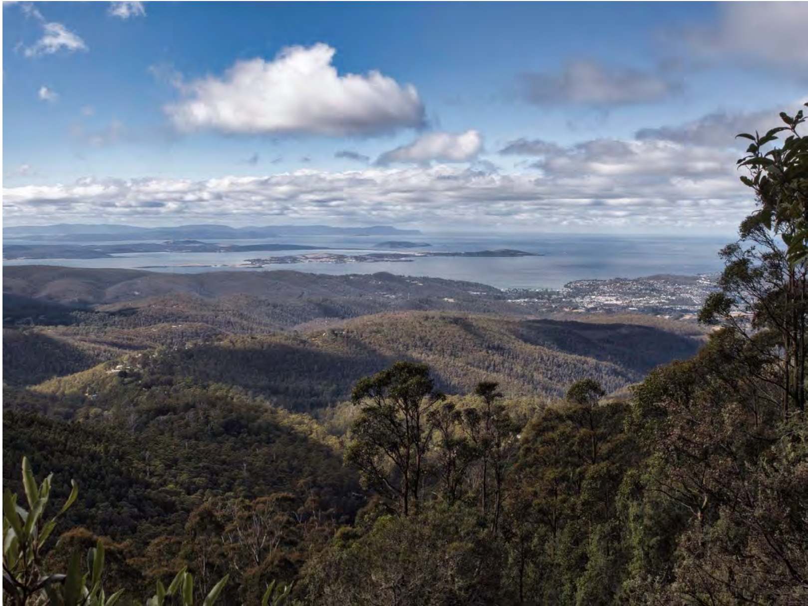
Tasmania Laurie Westcott