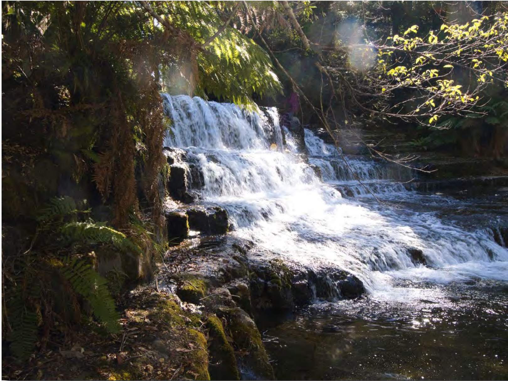
Tasmania Laurie Westcott