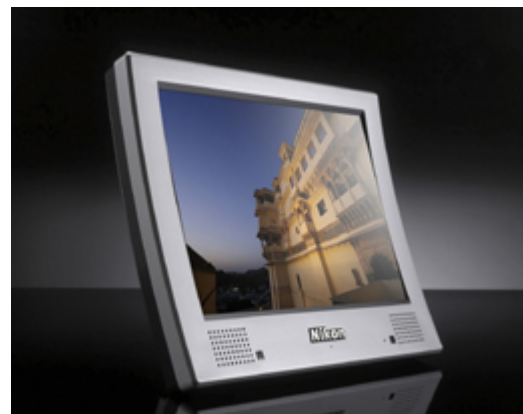
The NF-300i 3D digital photo frame

These services not only allow users to view their photos in dynamic 3D format, but also enable the sharing of 3D images between NF-300i 3D digital photo frames.